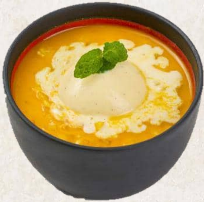
マンゴークリーム、サゴ、アイスクリー Chilled Mango Cream Sago Ice Cream