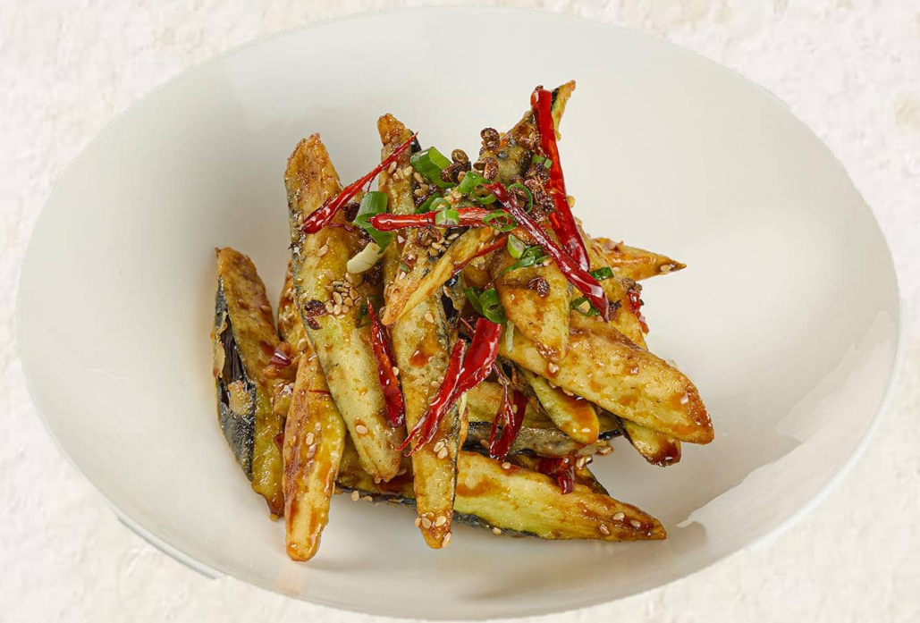
クリスピー揚げ茄子 Dry Fried Eggplant with Signature Sauce 15