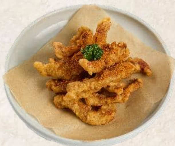
豚肩ロース肉の揚げ物、チリペッパー Deep Fried Pork Neck with Chili Pepper 10