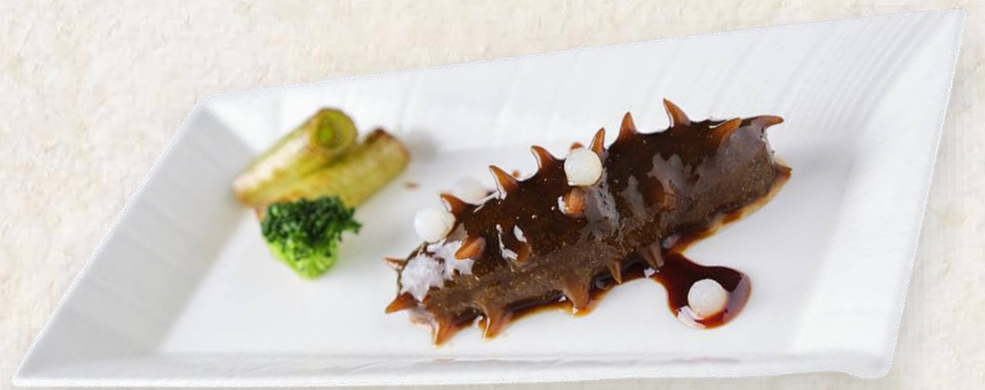
ナマコと葱のアワビソース煮(1個) Braised Sea Cucumber with Leek Abalone Sauce (per piece) 60