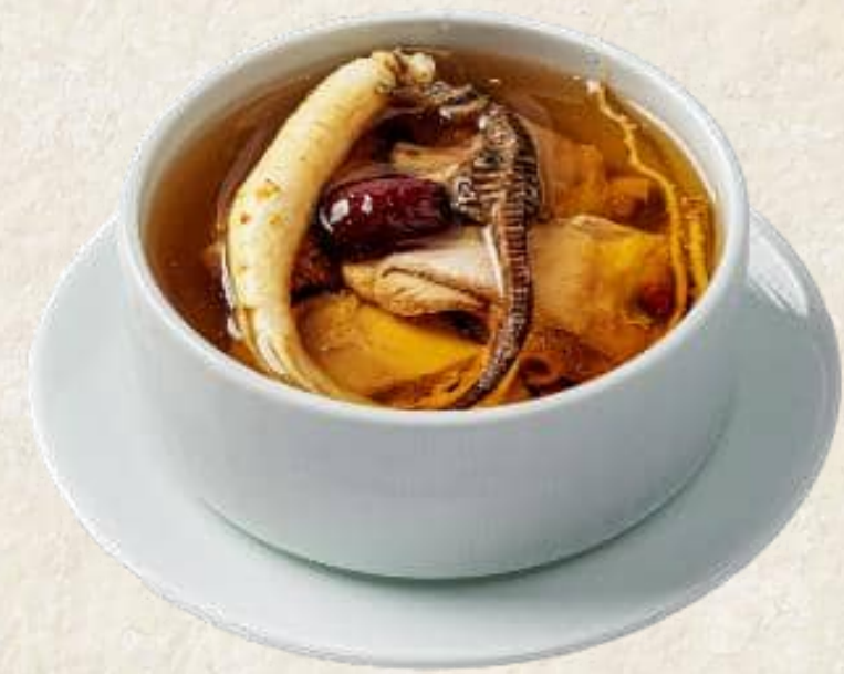
タツノオトシゴ入りサムゲタン Double Boiled Chicken, Ginseng with Seahorse Soup (per person)