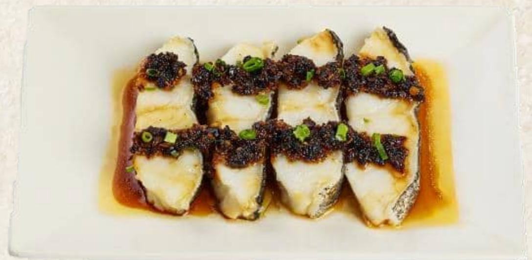
蒸し鱈の豆豉ソース Steamed Deep Sea Codfish Black Bean Sauce 39