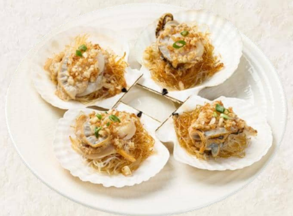
あさりと帆立 Clam Scallop ガーリック蒸し Steamed with Garlic 36 / 500 g