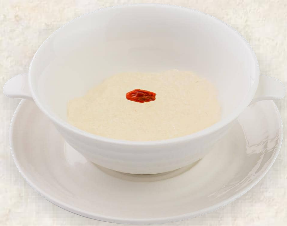
ツバメの巣(1人) Double Boiled Superior Bird Nest Soup (per person)