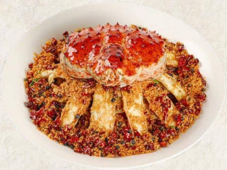
タラバガニのチリ炒め King Crab Typhoon Shelter Style 350 / kg