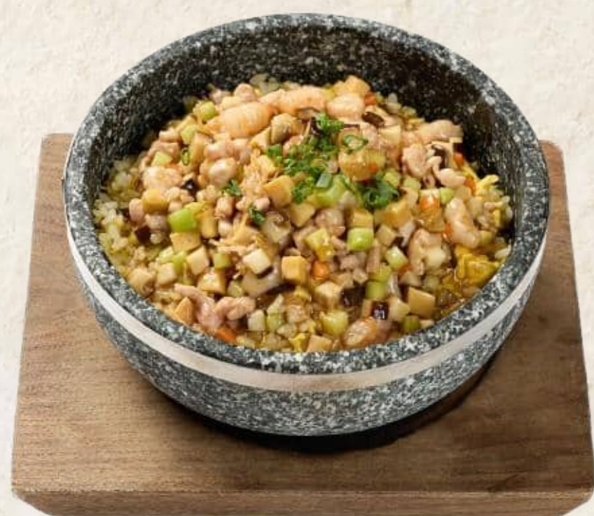
海鮮入り福建チャーハン Fujian Fried Rice with Seafood 26