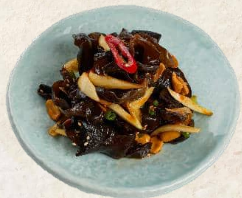
キクラゲの酢和え Black Fungus Onion and Peanut Tossed in Vinegar 8

价格均以韩币1,000结尾单位结算，并已包含10%税费及10%服务费。 Prices are in Korean Won at 1,000 value and include 10% tax and 10% service charge