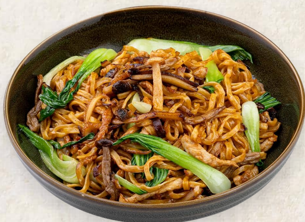
豚肉イーファー麵 Braised E-fu Noodle with Pork Oyster Sauce 22