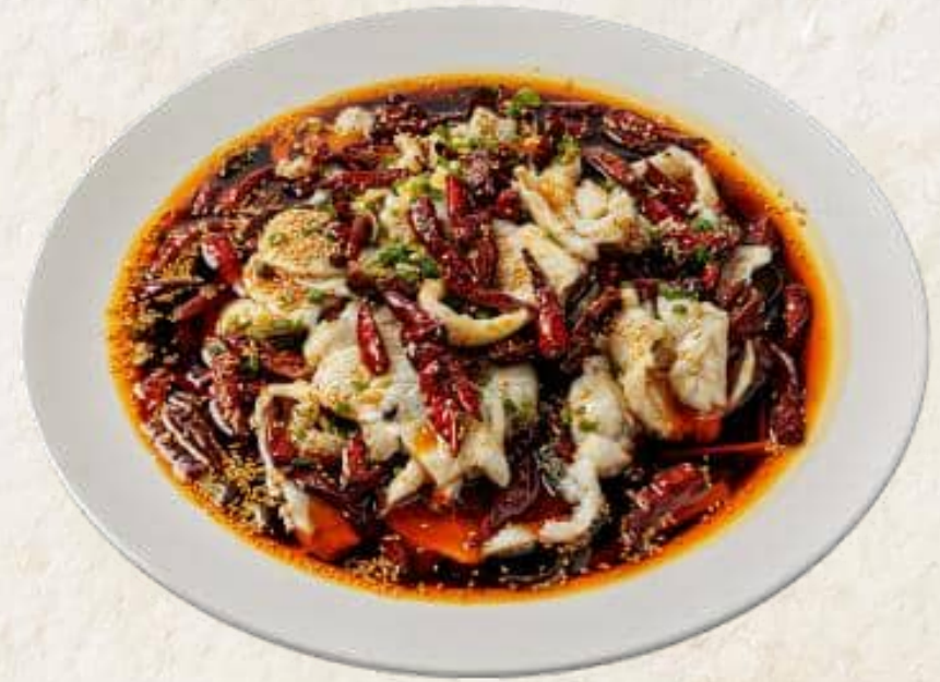
スズキの切り身のチリオイル・ポシェ Seabass Poached in Fiery Sichuan Chili Oil 小 1~2人前 69 / 大 3~4人前 99