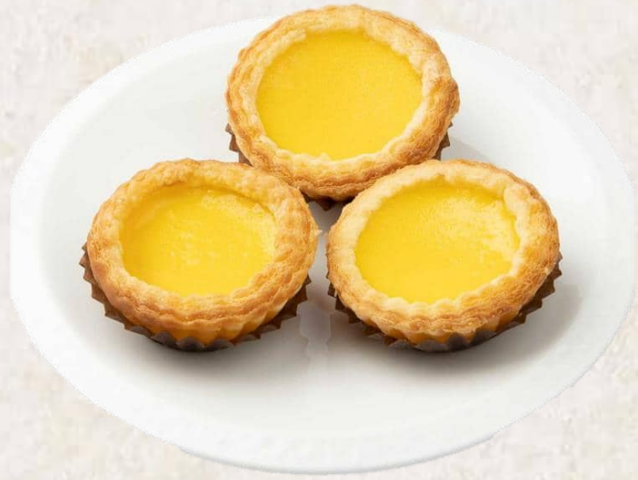
ミニエッグタルト Baked Egg Tart 11