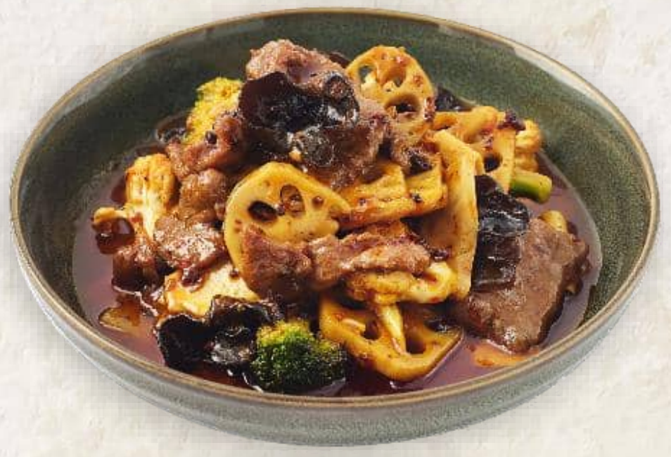
野菜、きくらげ、牛肉のチリソース炒め Wok Fried Assorted Vegetable, Black Fungus Sliced Beef Hot Chili Sauce 23