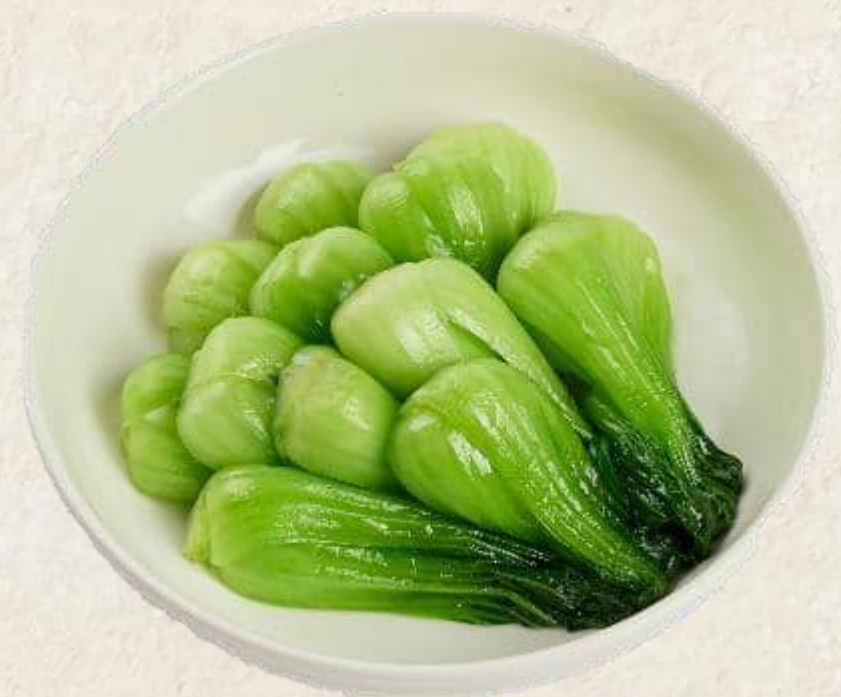
季節の野菜 Seasonal Vegetables 炒める / ガーリック炒め / オイスター煮 / しょうゆ / 松花団煮込み Wok Fried / Wok Fried with Garlic / Oyster Sauce / Soy Sauce / Braised, Preserved Egg 13