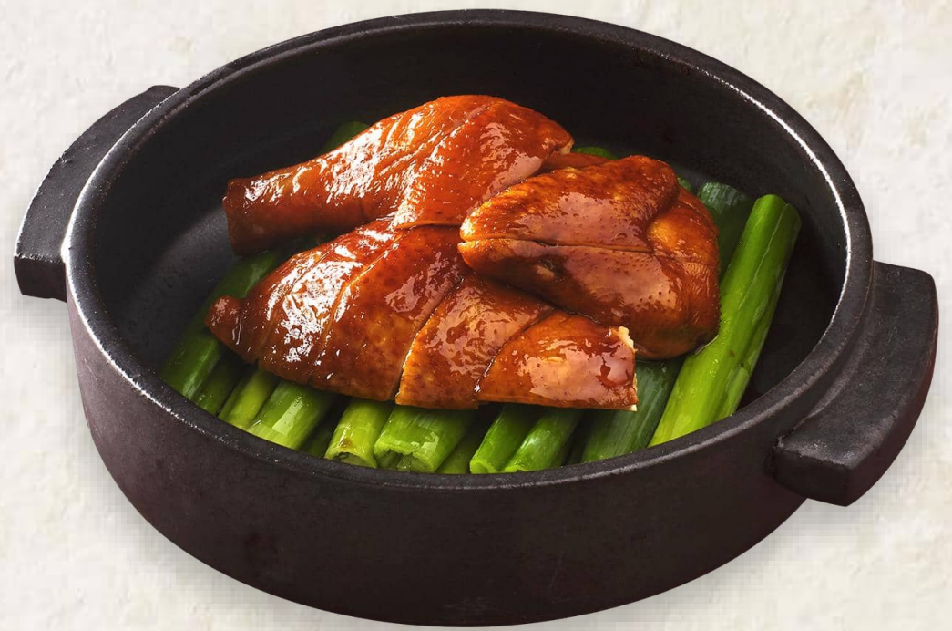
鶏肉と葱の葱油と醤油煮 Braised Chicken with Chives Scallion Oil Soy Sauce 42