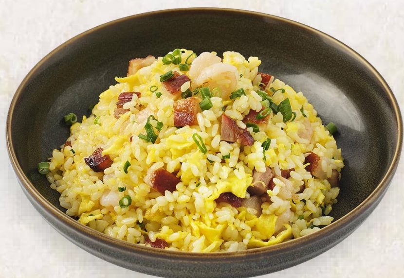
海老と焼豚入りチャイナハウス炒飯 “China House” Fried Rice Prawn, Barbecued Pork 25