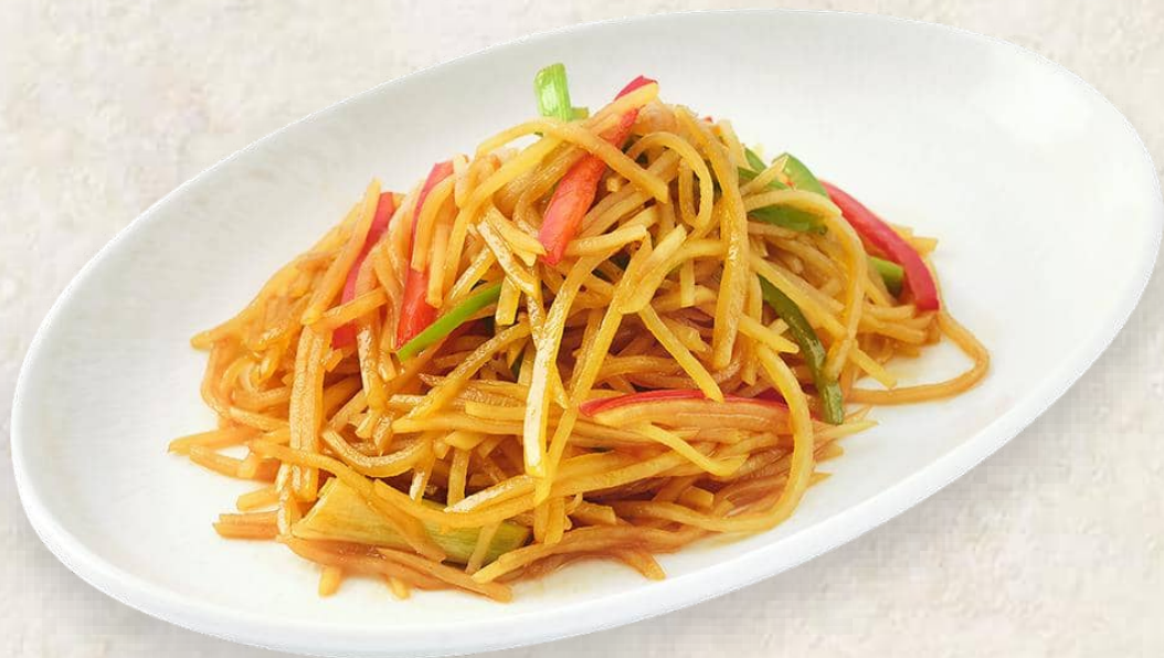
酸辣土豆絲 Stir Fried Shredded Potatoes Hot and Sour Sauce 12