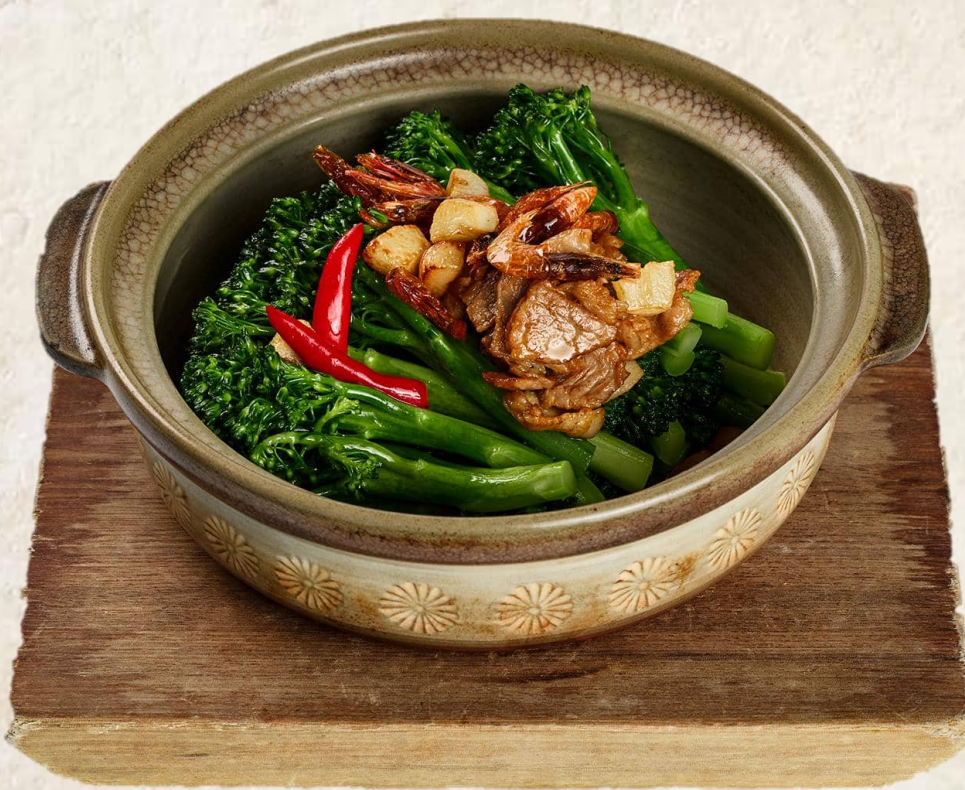
豚バラ肉と干しエビの炒め Stir-Fried Dried Red Prawns and Pork Belly with Broccolini 30