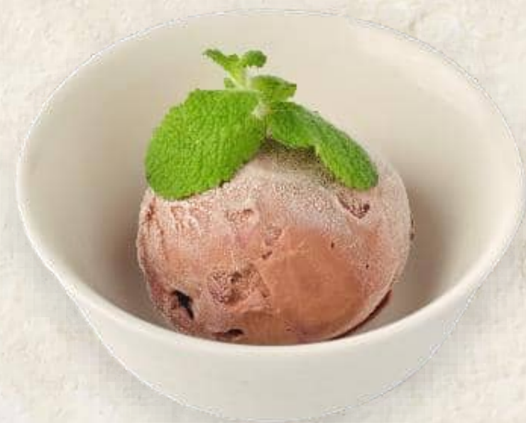
自家製アイスクリーム Homemade Ice Cream シングル Single 8 / ダブル Double 12

价格均以韩币1,000结尾单位结算，并已包含10%税费及10%服务费。 Prices are in Korean Won at 1,000 value and include 10% tax and 10% service charge