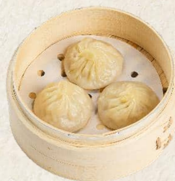
上海風蒸し豚肉餃子 (3個) Shanghainese Steamed Pork Dumpling (3 pcs) 18