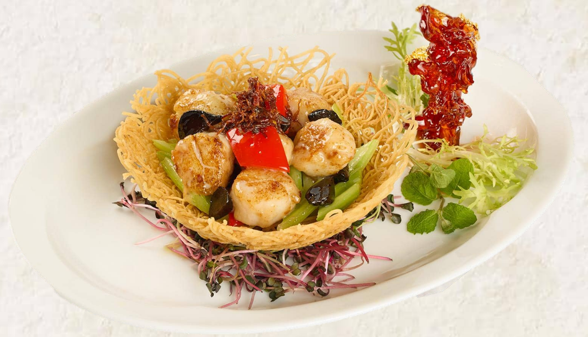
ホタテ、黒ニンニクとセロリのX.O ソース炒め Stir Fried Scallops with X.O. Sauce and Black Garlic 48