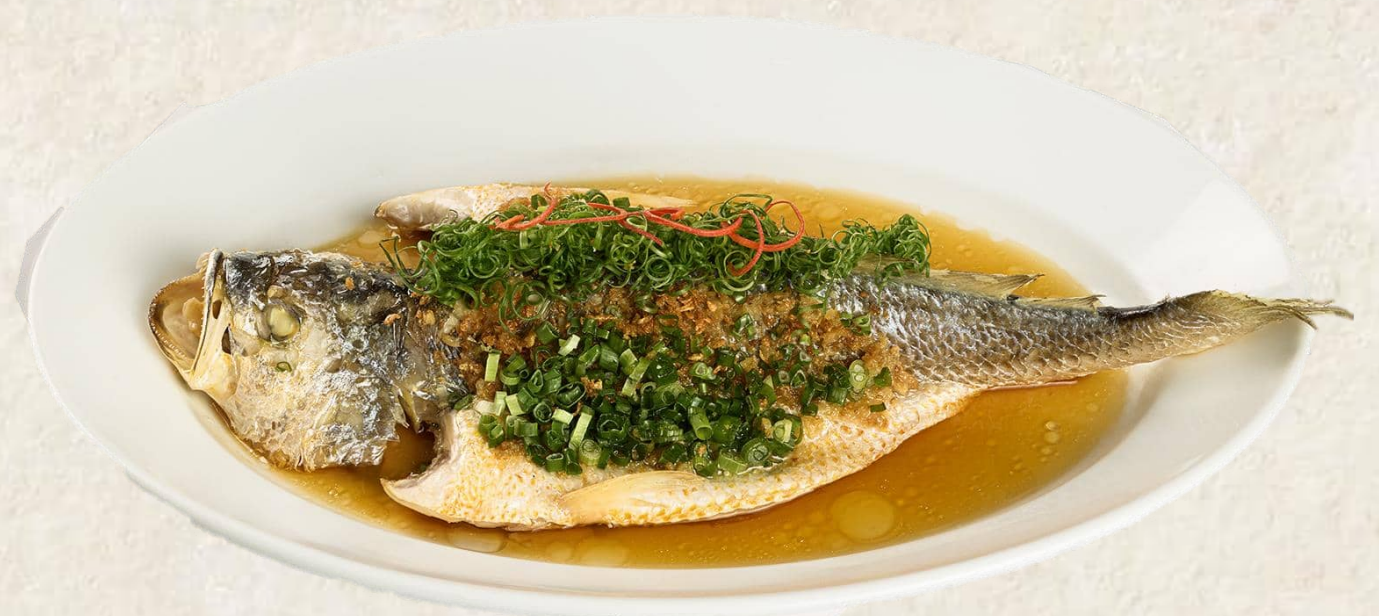
イシモチのガーリックオイル炒め Steamed Yellow Croaker with Garlic 60