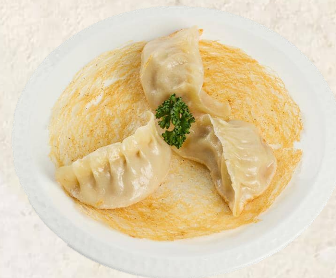
豚肉と海老の焼き餃子(3個) Pan-Fried Pork and Shrimp Dumpling (3 pcs) 10