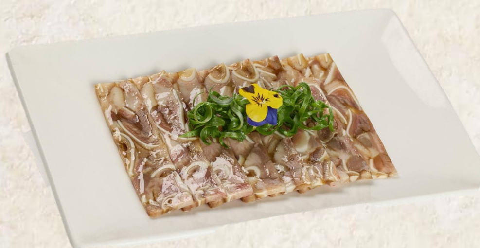
豚耳の冷製テリーヌ Chilled Pork Ear Terrine 15

价格均以韩币1,000结尾单位结算，并已包含10%税费及10%服务费。 Prices are in Korean Won at 1,000 value and include 10% tax and 10% service charge