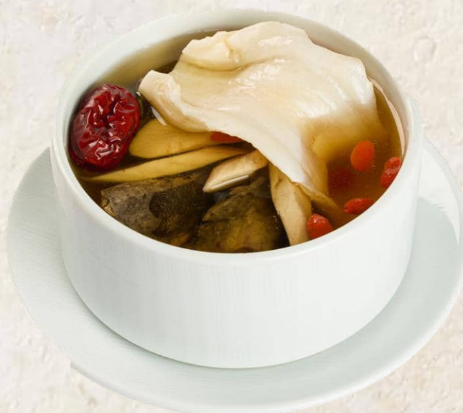
魚の浮袋とゴボウ入り黒鶏のスープ Double Braised Black Chicken Soup with Fish Maw and Burdock Root (per person)