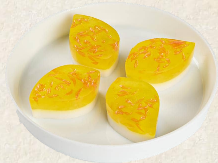
ココナッツミルクケーキ Layered Pomelo & Coconut Milk Cake 12