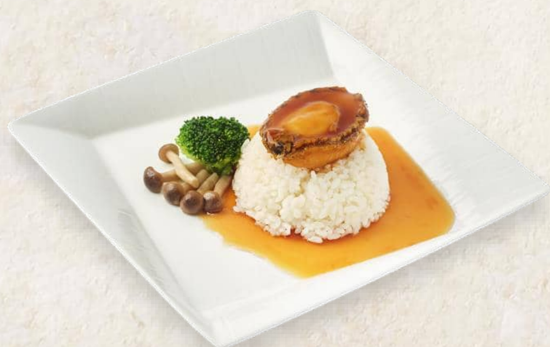
濟州産鮑煮ご飯添え Braised Jeju Abalone with Rice 25