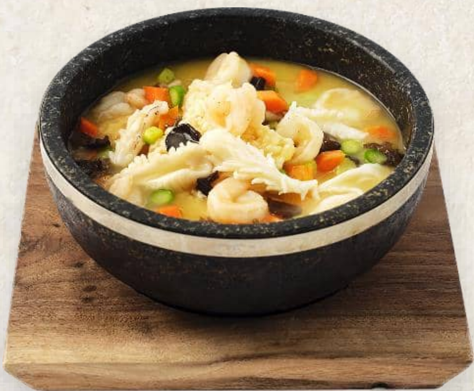
海鮮と揚げ煎餅 Assorted Seafood with Deep Fried Rice Crackers 28