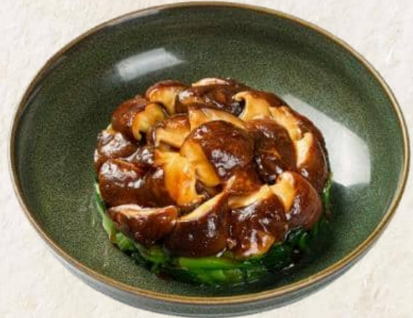
きのこオイスターソース Mushroom with Vegetables in Oyster Sauce 18