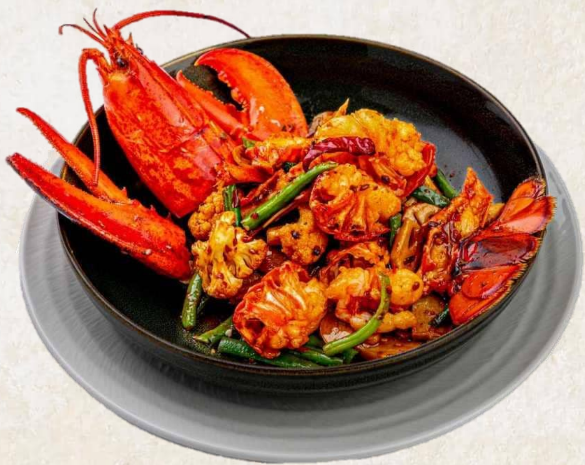
ロブスターと野菜のチリソース炒め Wok Fried Lobster with Assorted Vegetables, Hot Chili Sauce 135