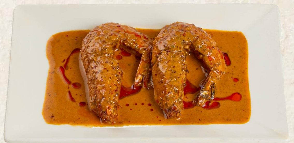
車海老のスパイシーチリソース煮込み Braised King Prawns Spiced Chili Sauce 22