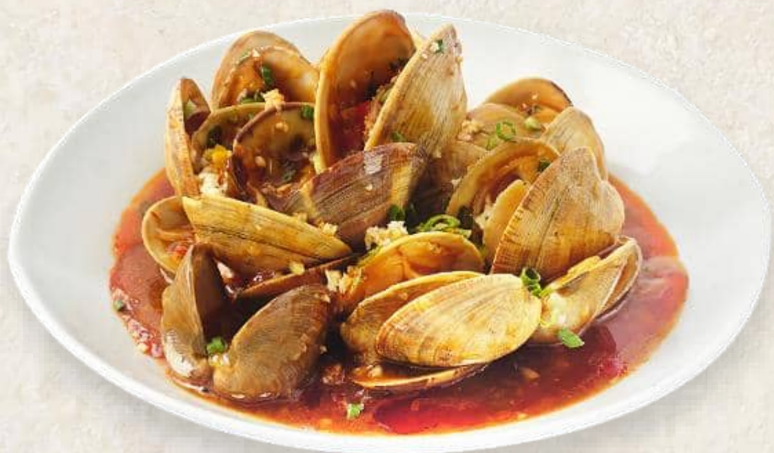
あさり Clam XO醬炒め Wok Fried with X.O. Sauce 32 / kg