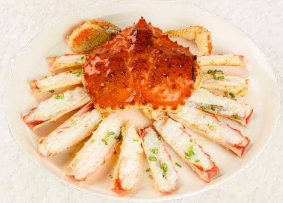
蒸しタラバガニ King Crab Steamed 350 / kg