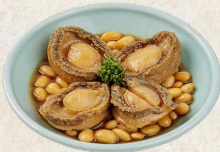
アワビの醤油煮込み Marinated Abalone 25

价格均以韩币1,000结尾单位结算，并已包含10%税费及10%服务费。 Prices are in Korean Won at 1,000 value and include 10% tax and 10% service charge