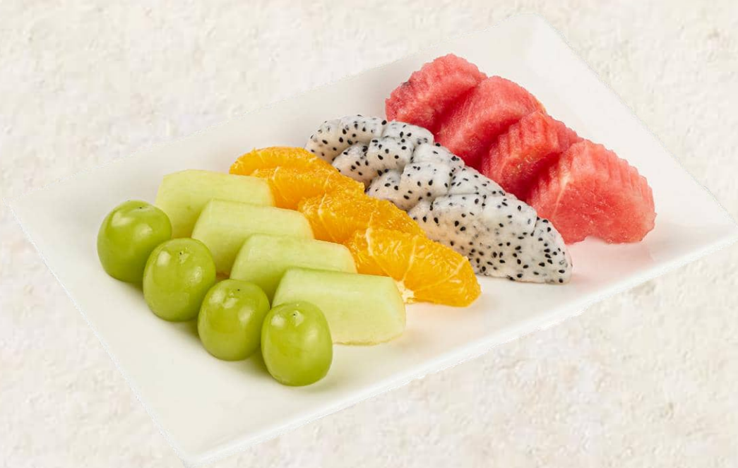
季節のフルーツの盛り合わせ Fresh Fruit Platter 13