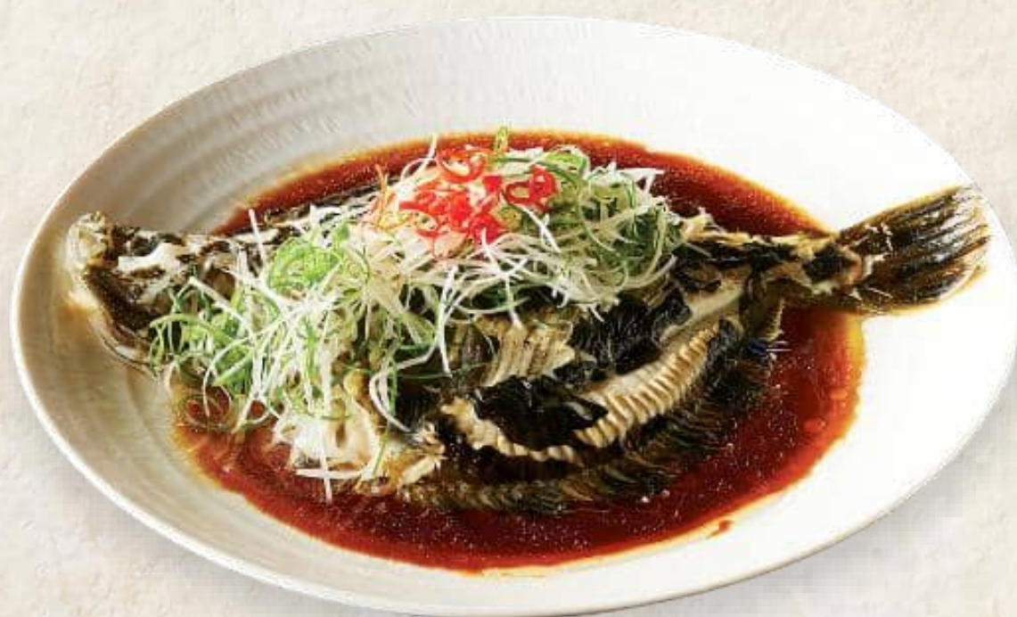
クロソイ/カレイ Black Rockfish / Turbot Fish 蒸しもの Steamed 65 / 1尾 piece

价格均以韩币1,000结尾单位结算，并已包含10%税费及10%服务费。 Prices are in Korean Won at 1,000 value and include 10% tax and 10% service charge