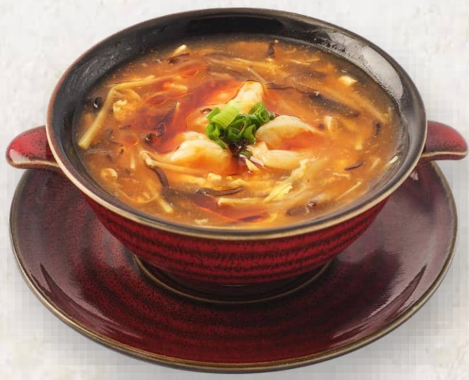
海鮮酸辣湯 (1人前) Hot and Sour Seafood Soup (per person)