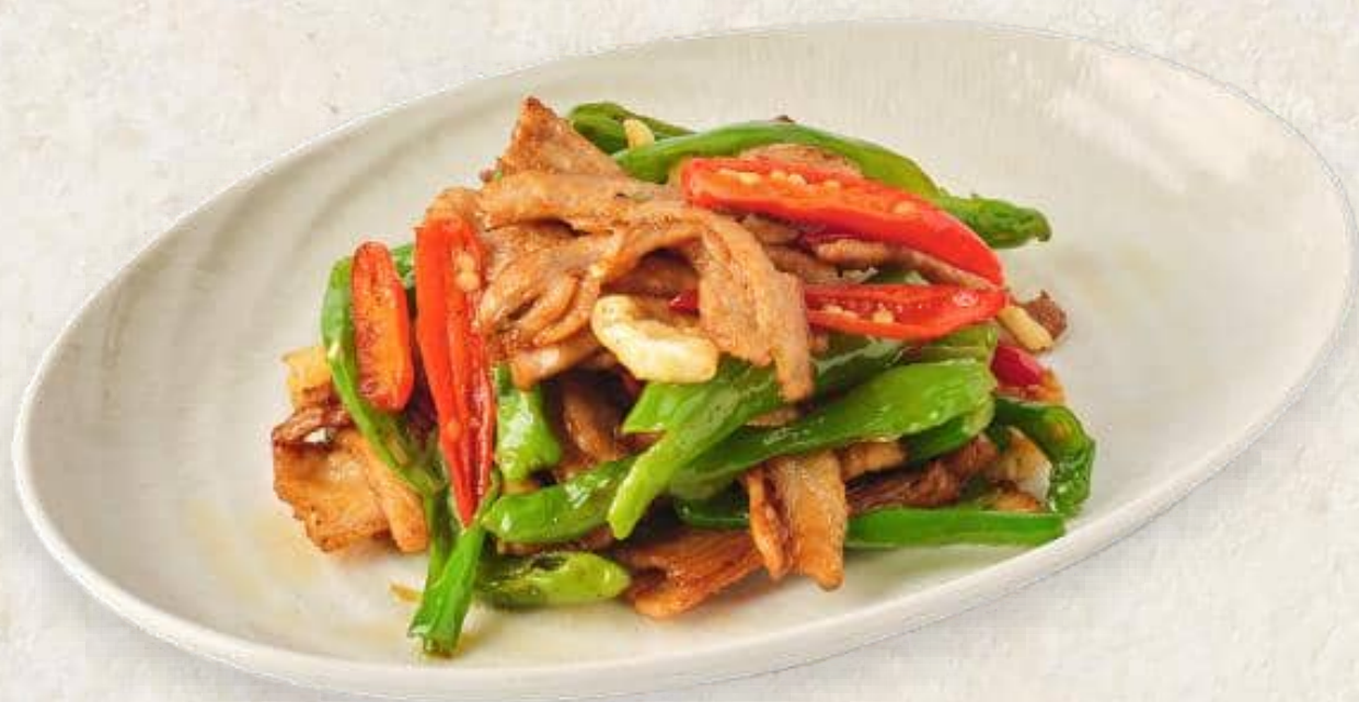
豚バラ肉とピーマンの炒めもの Stir Fried Pork Belly Green Pepper 23