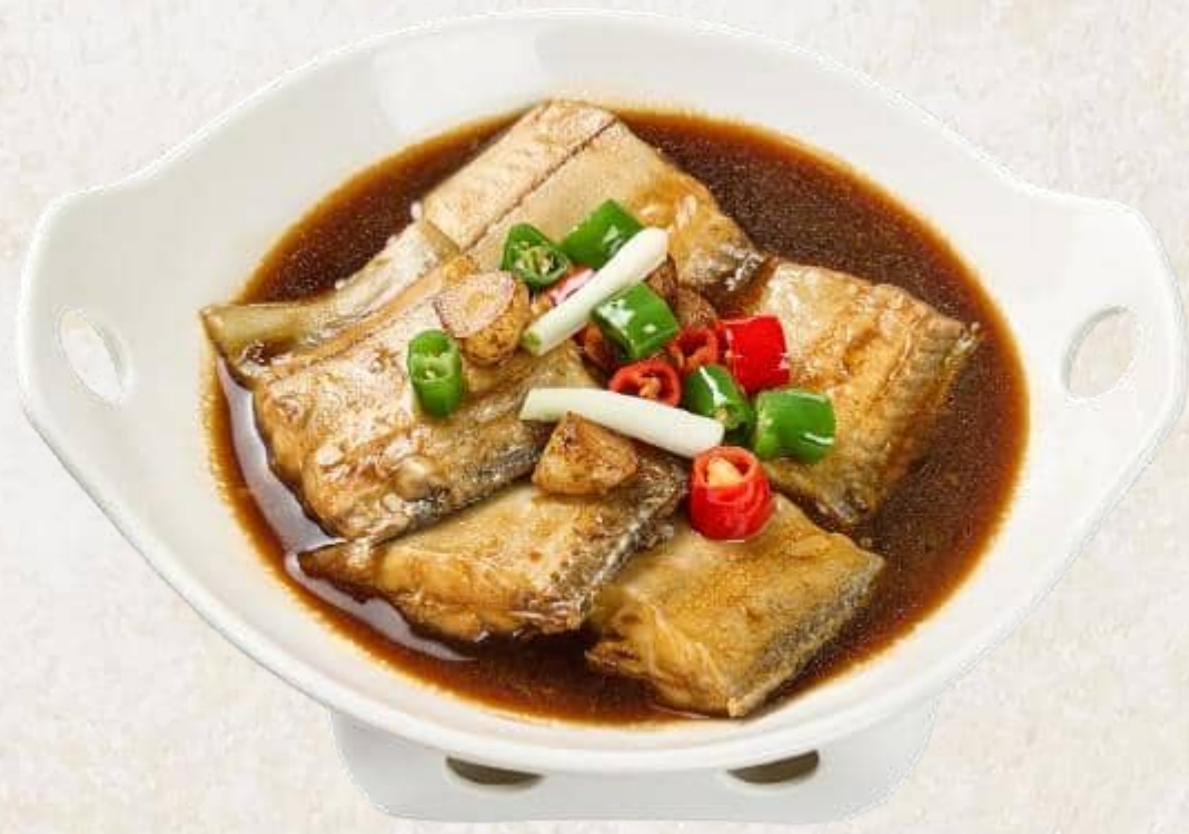
太刀魚ペッパーソース蒸し Braised Hairtail in Rich Sauce 50