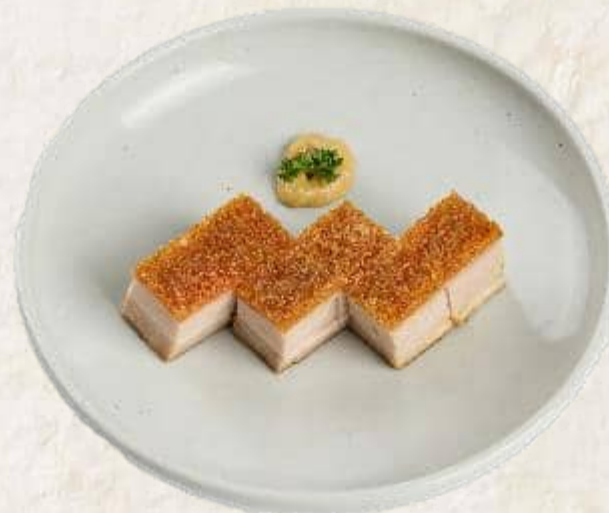
豚バラ肉のロースト Roasted Pork Belly 20