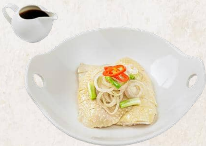
チキンとオニオン、醤油風味 Poached Chicken Onion Soy Sauce 33