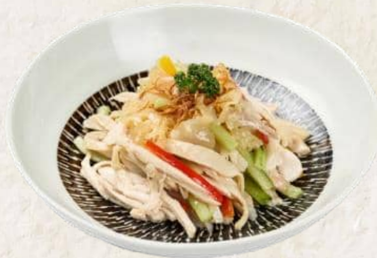
チキンとクラゲのマリネ Salted Chicken with Jelly Fish 20