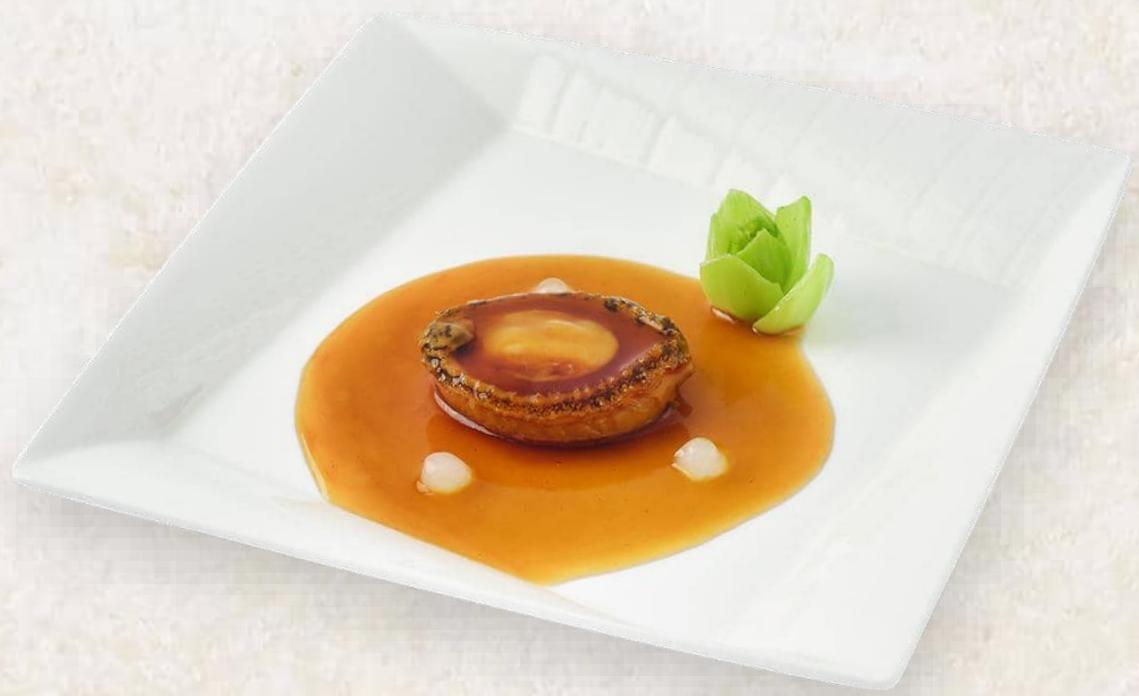
濟州産アワビのオイスターソース煮 Braised Jeju Abalone Oyster Sauce (per piece) 22