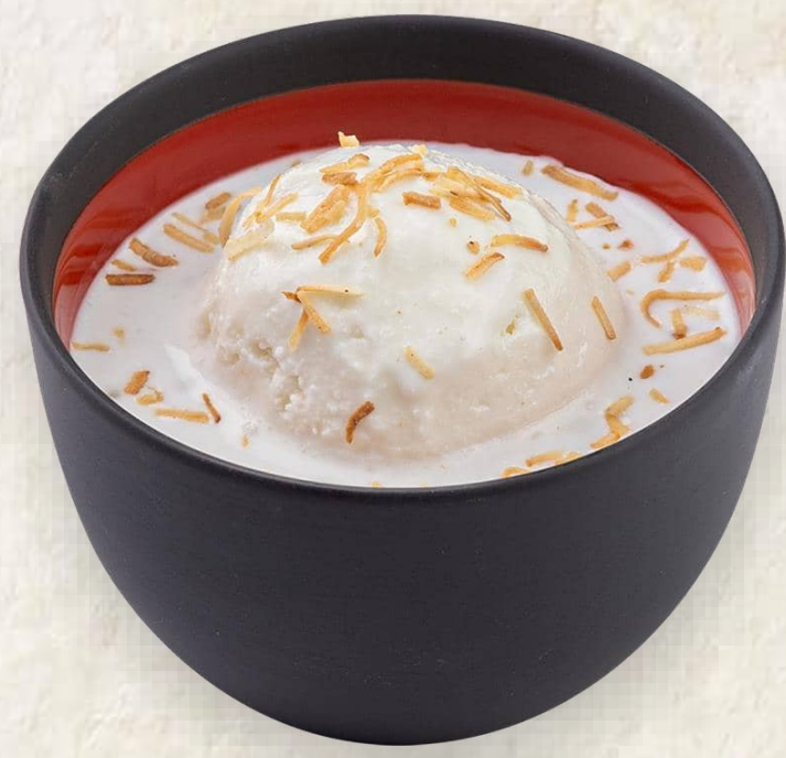
ココナッツミルク Chilled Coconut Cream Sago Ice Cream