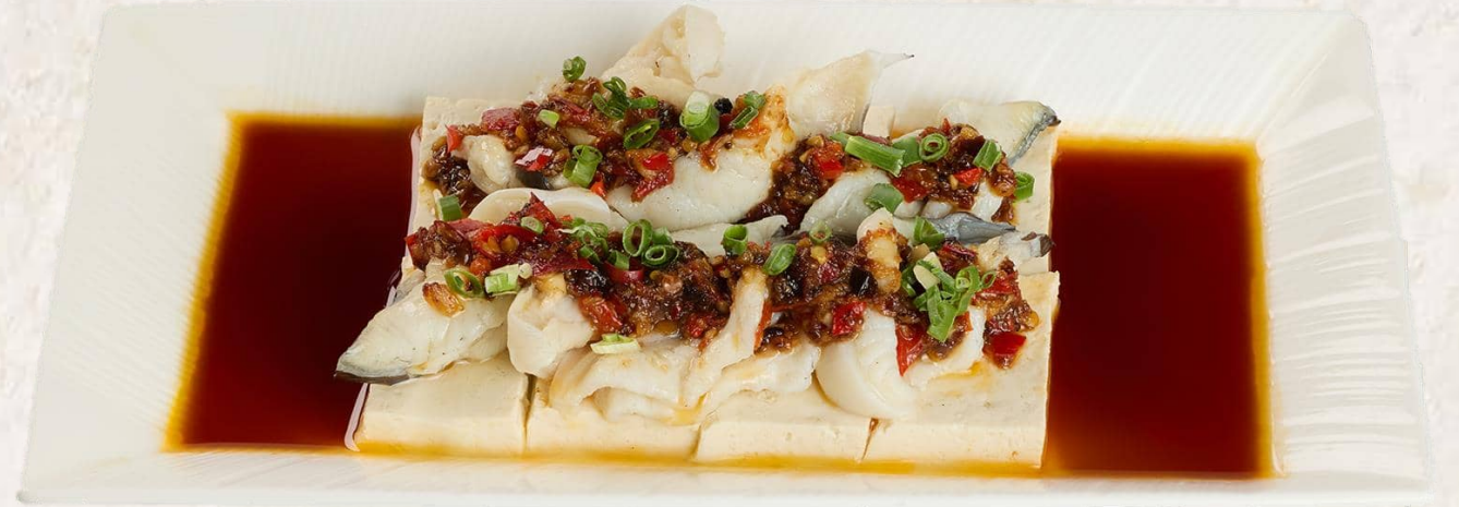
蒸し鰻と豆腐の黒豆ソース炒め Steamed Eel with Tofu in Savory Soy Sauce 48