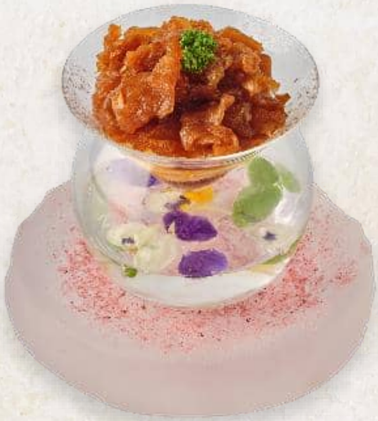
クラゲの漬物、葱油 Pickled Jelly Fish Onion Oil 14