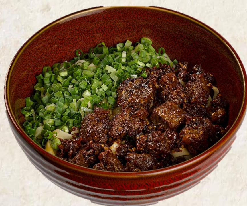
牛肉の煮込み焼きそば Tossed Noodles Braised Beef 22