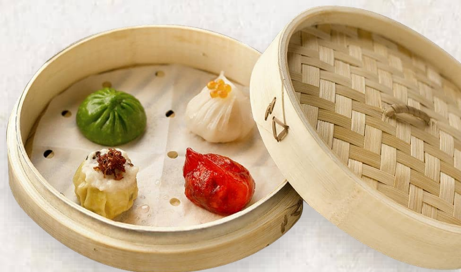
蒸し餃子セット(4個) XOきのこ、海老、蒸した蟹とピーナ ッツ、上海風蒸し豚肉