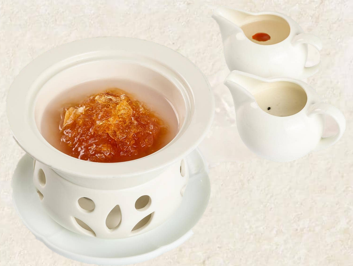
紅燕の二重煮込みスープ Double Boiled Superior Red Bird Nest Soup (per person)