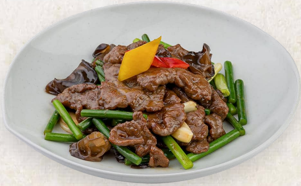
キクラゲビーフ炒め Wok Fried Sliced Beef and Black Fungus with Garlic 25