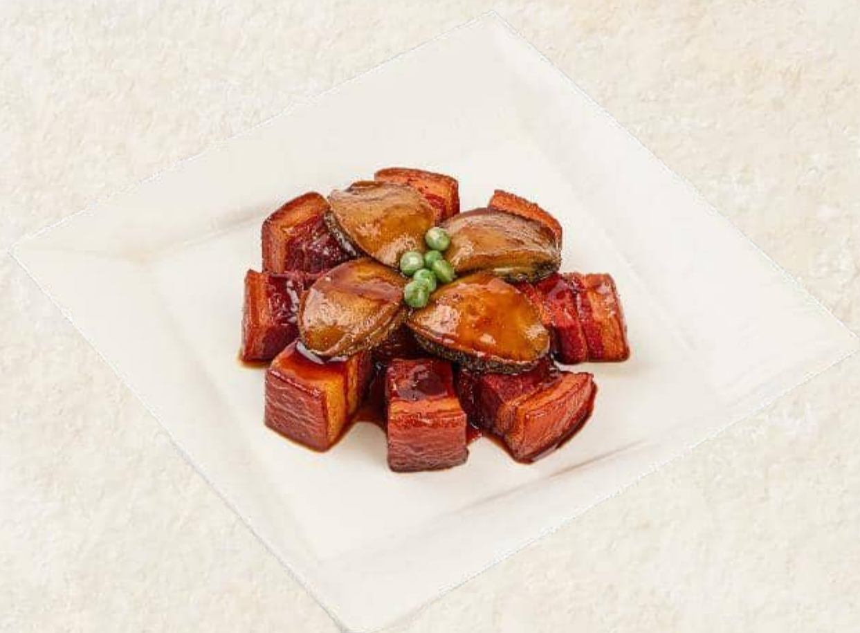
豚バラ肉と鮑の甘辛煮 Braised Pork Belly Abalone Aweet Soy Sauce 40