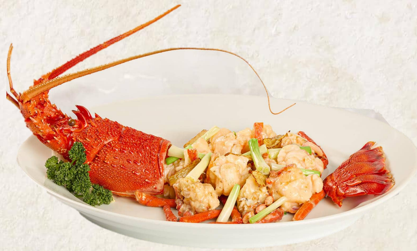
伊勢海老と大根生姜ソース Stir Fried Australian Lobster with Ginger and Scallions 350