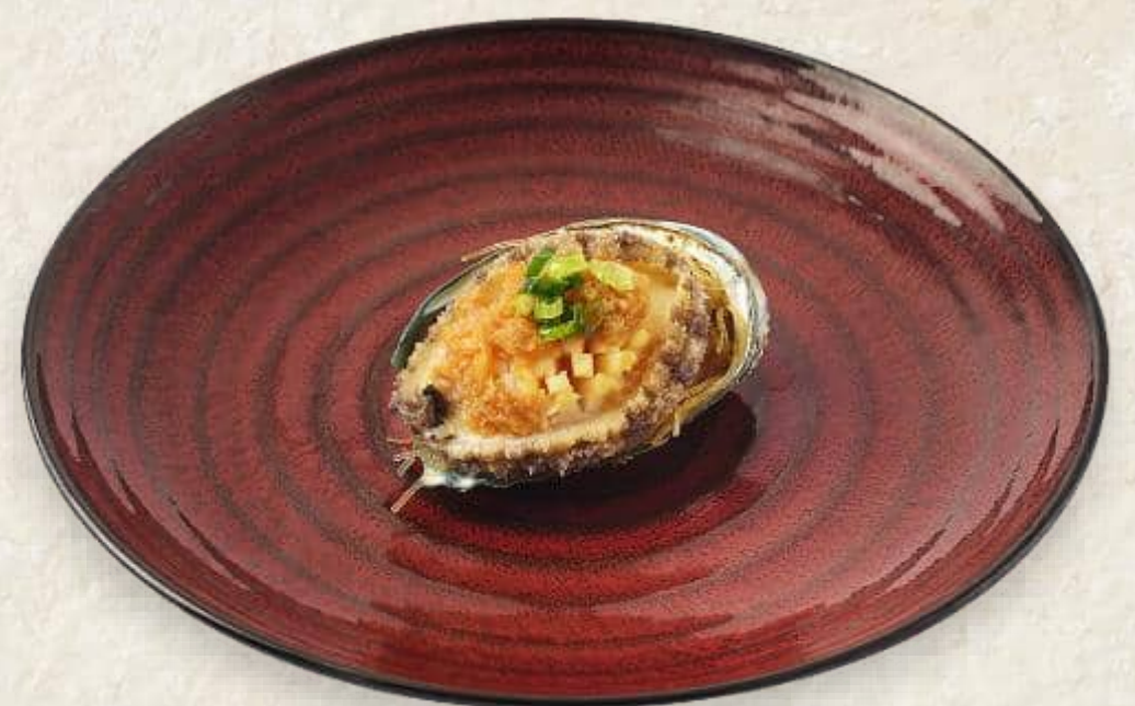
鮑 Abalone ガーリック蒸し Steamed with Garlic 18 / 1個 piece