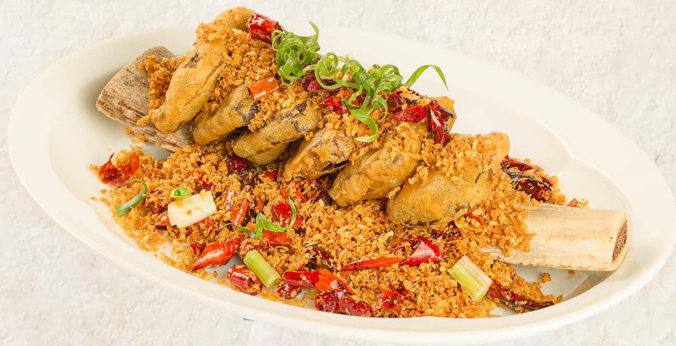
揚げニンニクと牛カルビ Stir Fried Beef Short Ribs with Fried Garlic and Dry Chili 40

价格均以韩币1,000结尾单位结算，并已包含10%税费及10%服务费。 Prices are in Korean Won at 1,000 value and include 10% tax and 10% service charge