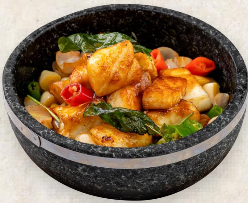
メロの醤油煮 Stewed Codfish with Ginger and Wine in Casserole 48