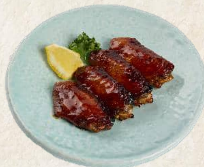
手羽先バーベキュー Barbecue Chicken Wings 10