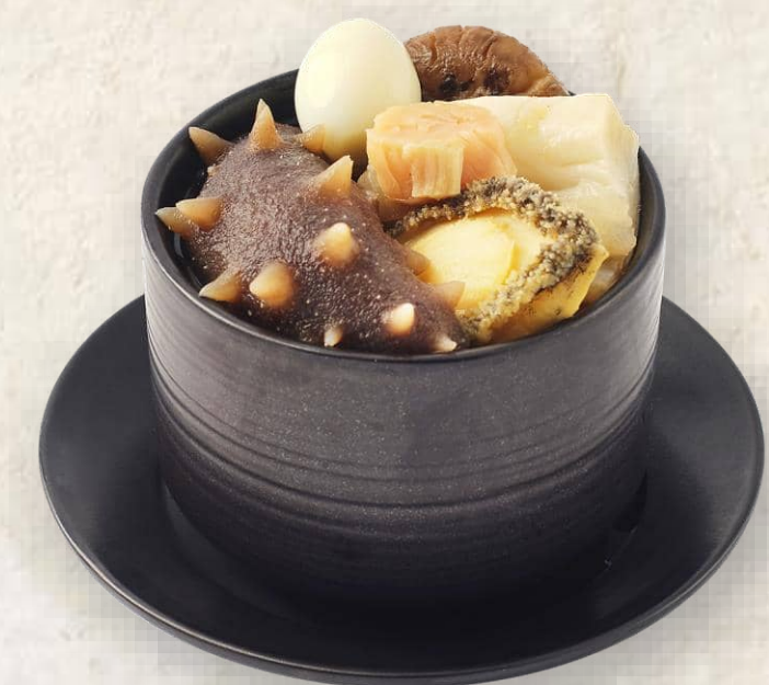
僧侶が壁を超えてくるスープ (1人前) (佛跳牆) Buddha Jumps Over the Wall (per person)