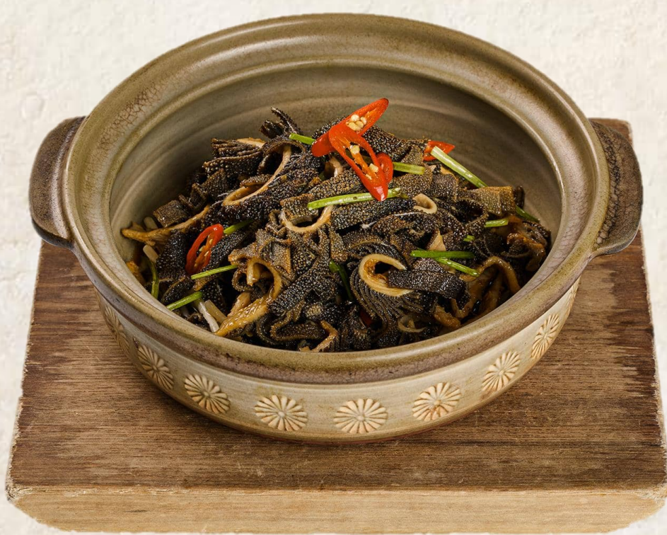
牛モツのスパイシー和え物 Spicy and Fresh Tripe Layers 25

价格均以韩币1,000结尾单位结算，并已包含10%税费及10%服务费。 Prices are in Korean Won at 1,000 value and include 10% tax and 10% service charge