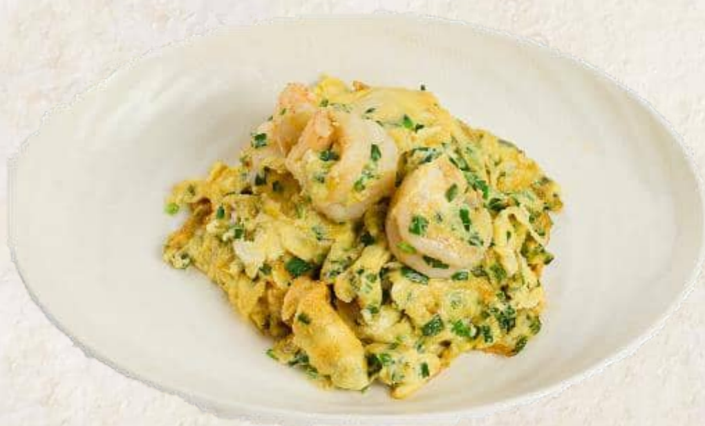
海老卵ニラ炒め Wok Fried Shrimp with Leek and Egg 25