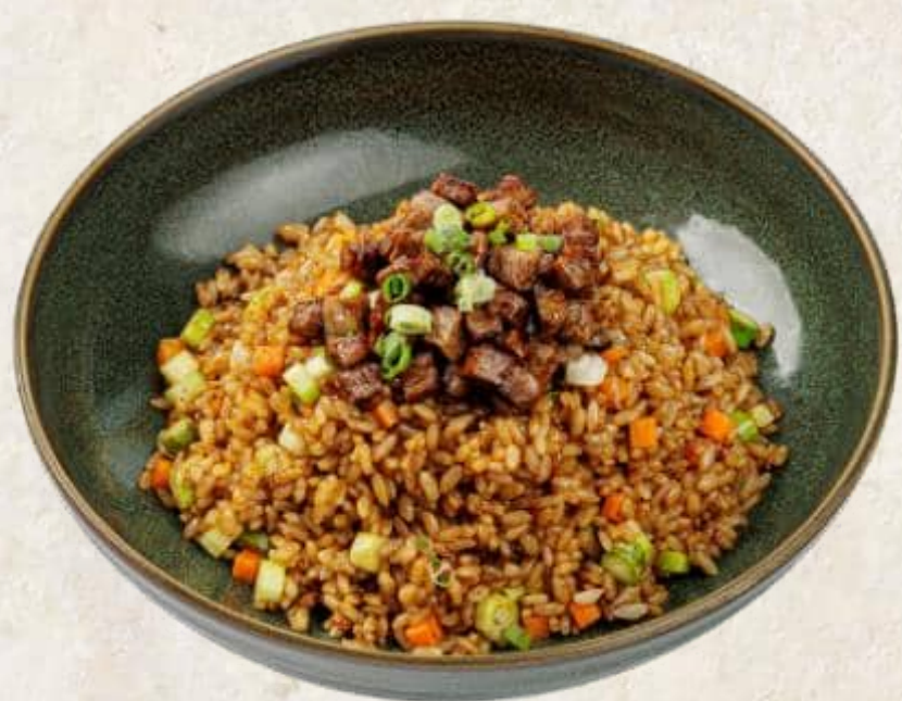
牛肉の醤油炒飯 Fried Rice with Beef Soy Sauce 25