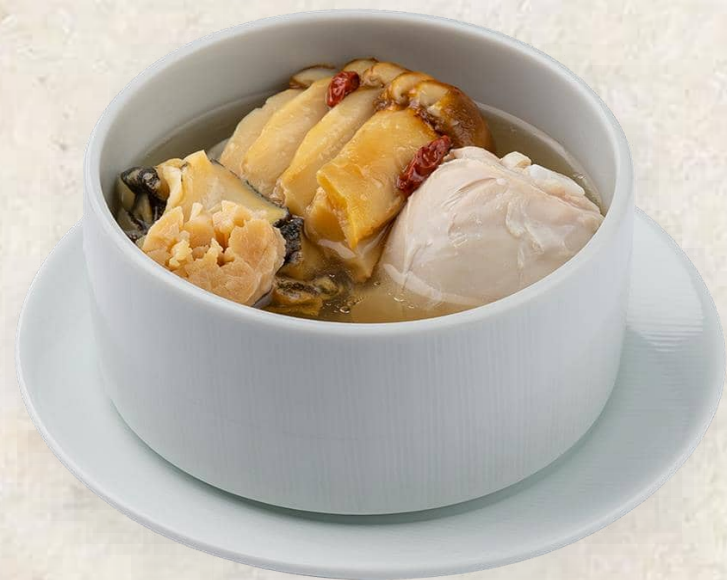
松茸サザエチキンスープ (1人) Double Boiled Chicken Soup, Turban Shell, Matsutake Mushroom (per person)