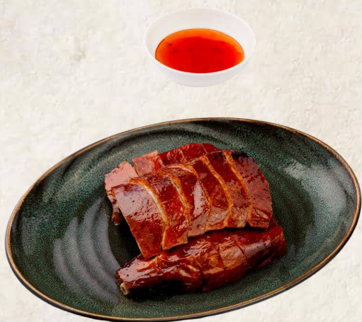
広東風ローストダック Roasted duck 20