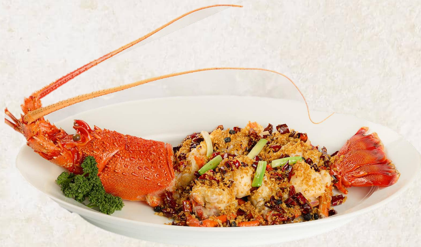
伊勢海老の揚げニンニク Australian Lobster, Typhoon Shelter Style 350