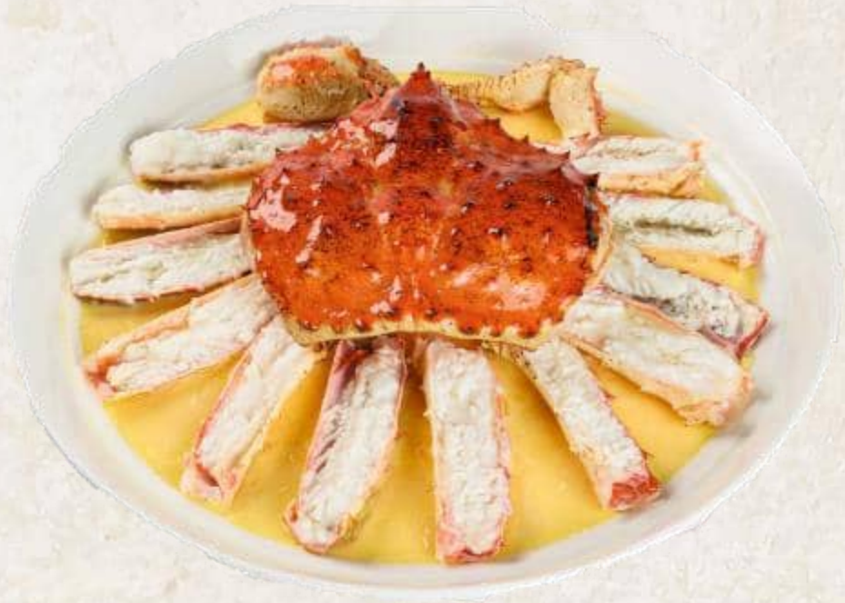
たらば蟹 鶏油と黄酒蒸し King Crab Steamed with Chicken Oil and Yellow Rice Wine 350 / kg