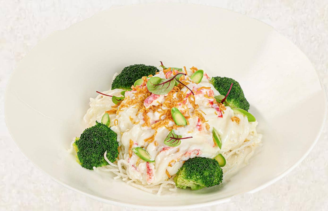
白身卵とカニ肉のスクランブルエッグ、干し 貝柱添え Scrambled Egg White with Crab Meat and Scallop 40