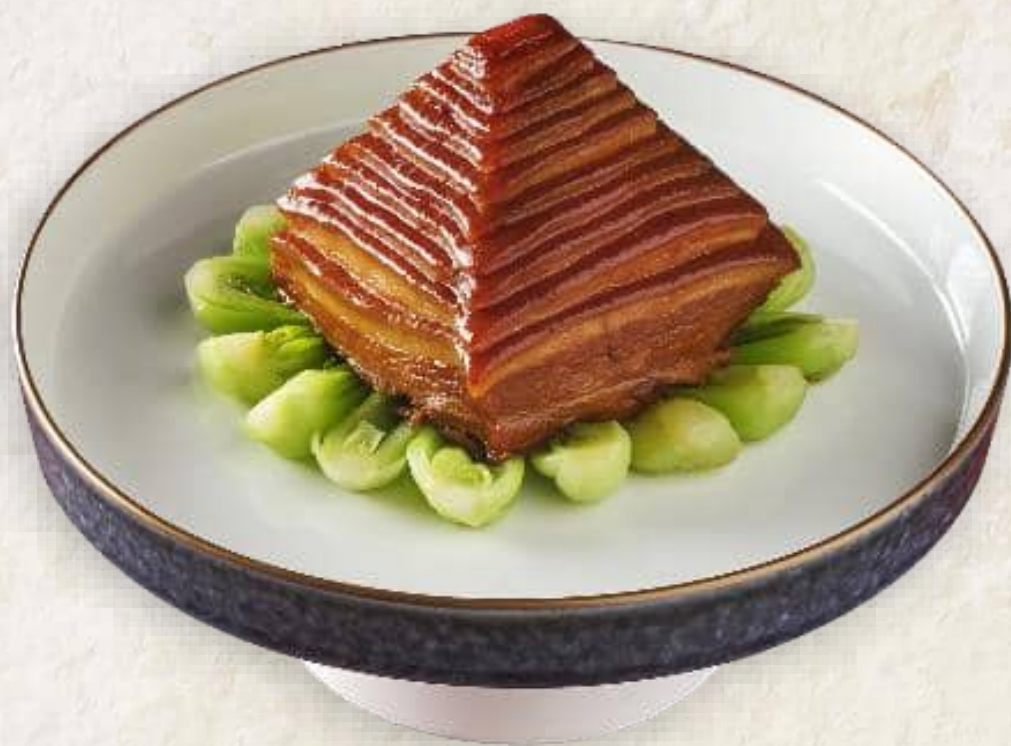
豚の角煮 Braised Pork Belly in Bean Paste 48