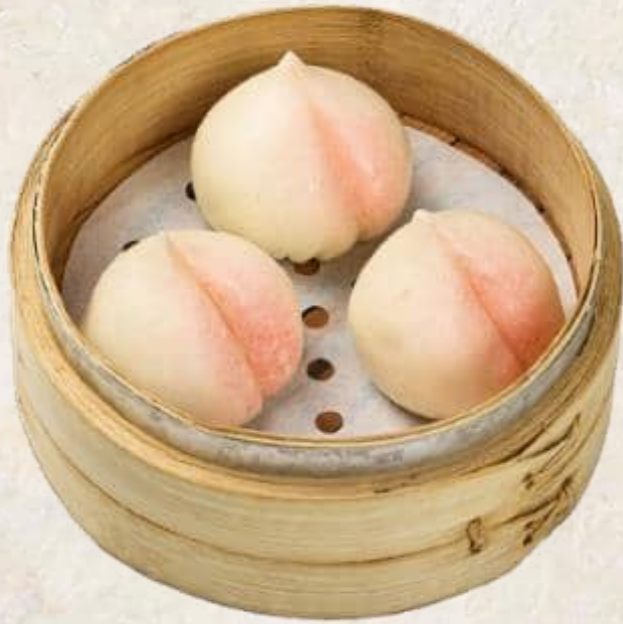
小豆入りパン Red Bean Paste Birthday Bun 10