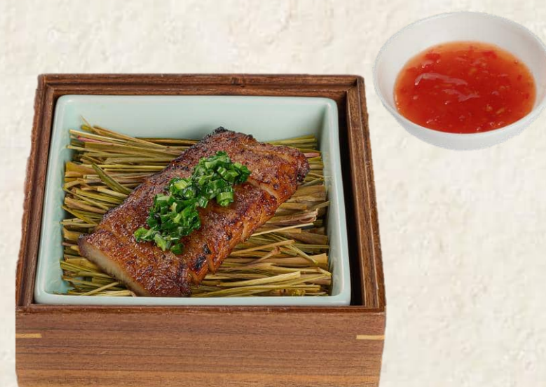
豚バラ肉のバーベキュー焼き Charcoal Grilled Pork Collar 20