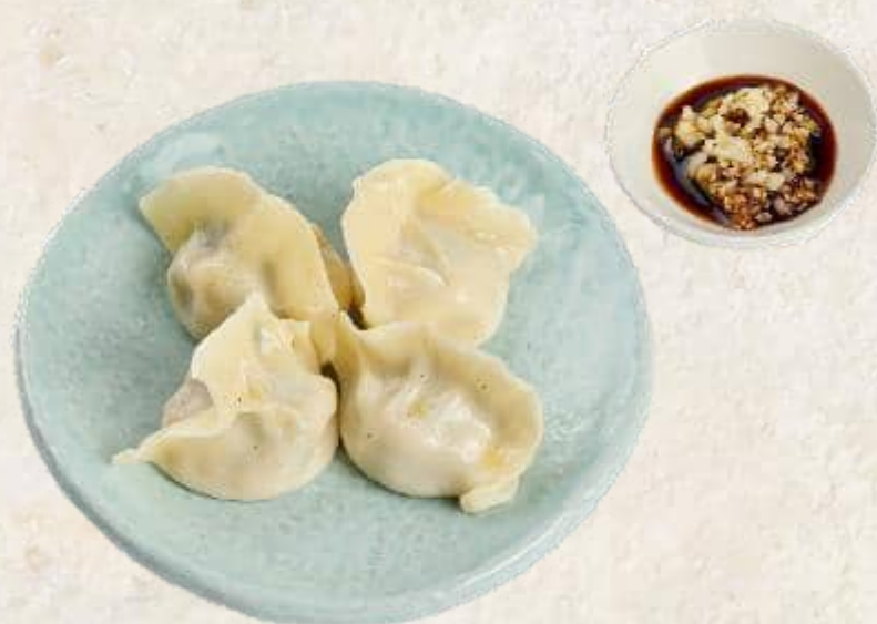
ニラ入り海老餃子(4個) Minced Prawn Cabbage Leek Dumpling (4 pcs) 10