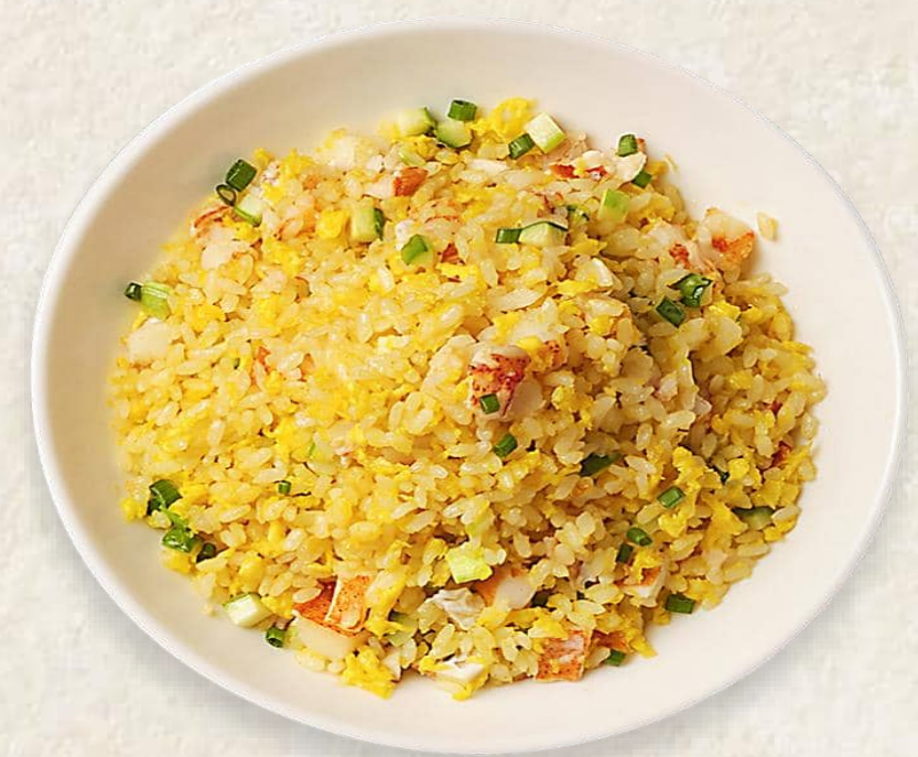
ロブスターと野菜入り炒飯 Fried Rice with Lobster Meat and Vegetables 45