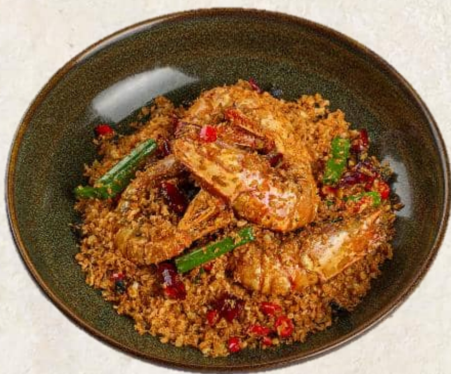
海老の炒めもの、揚げたガーリックと 唐辛子風味 Stir Fried Shrimp with Deep Fried Garlic Dry Chili 26