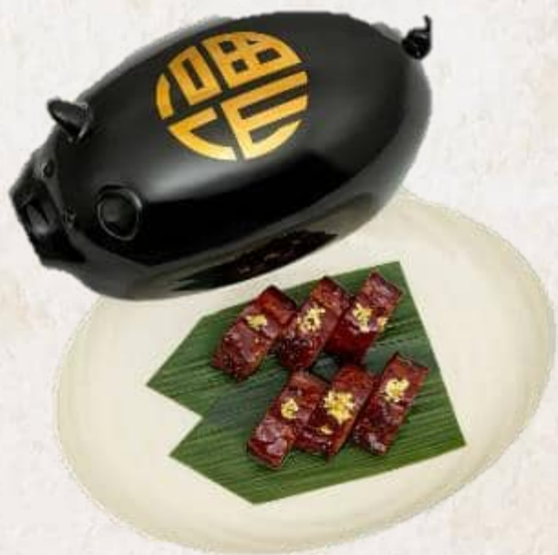
济州黑豚チャーシュー Jeju Black Pork Char Siu 20