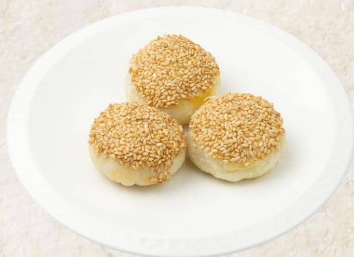
ゴマと豚肉の焼き菓子(3個) Baked Minced Pork Flaky Pastry (3 pcs) 12