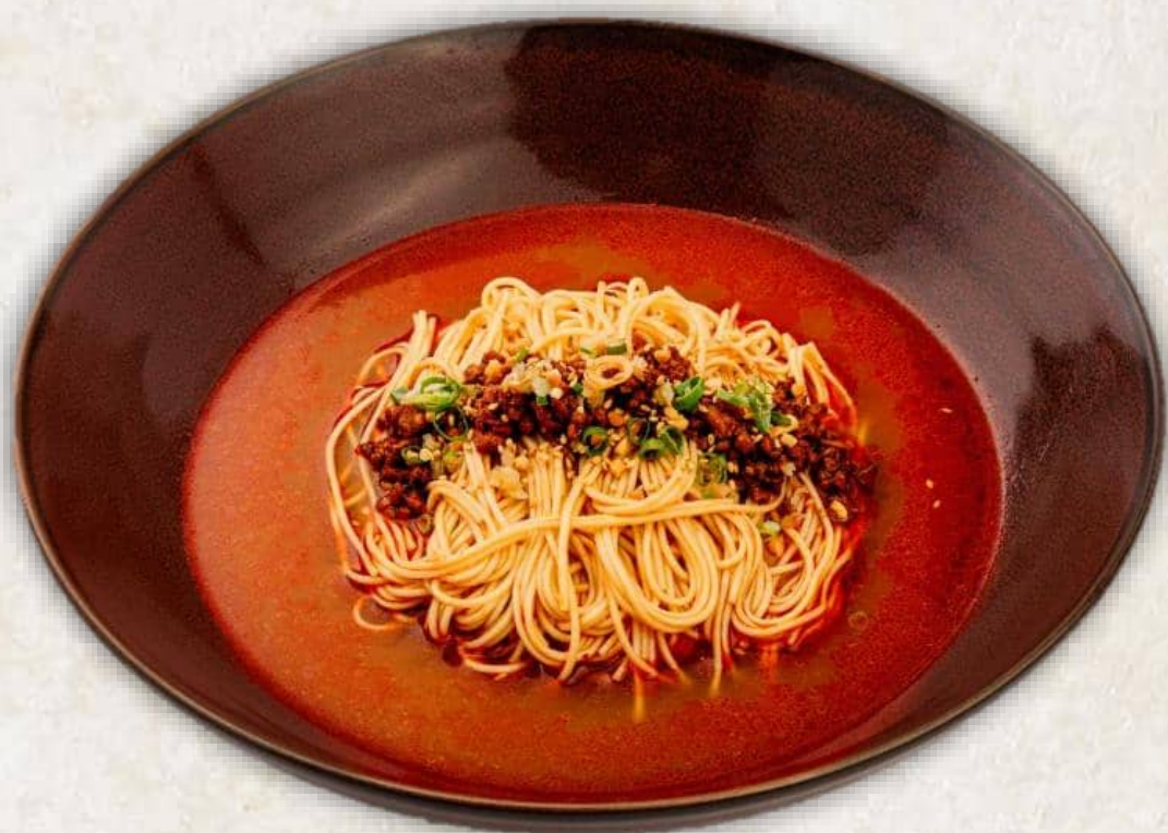
坦々麵(1人前) “Dan Dan” Noodle (per person) 19