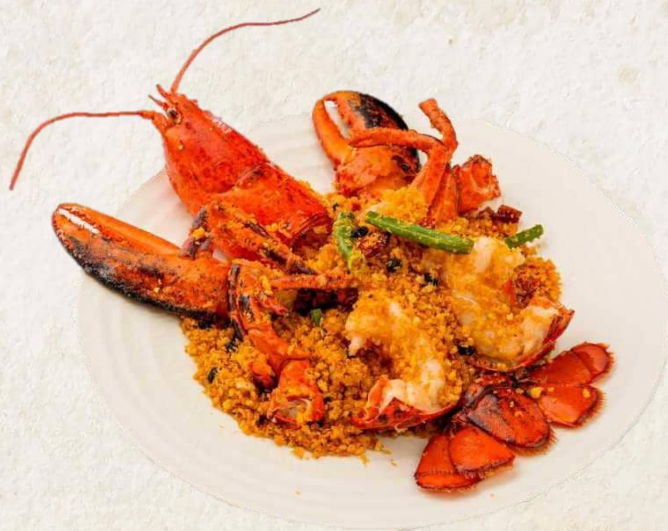
ロブスターのガーリックとチリ炒め Stir Fried Lobster with Garlic Chili 135