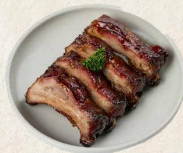
ポークリブのBBQ Barbecue Pork Ribs 20