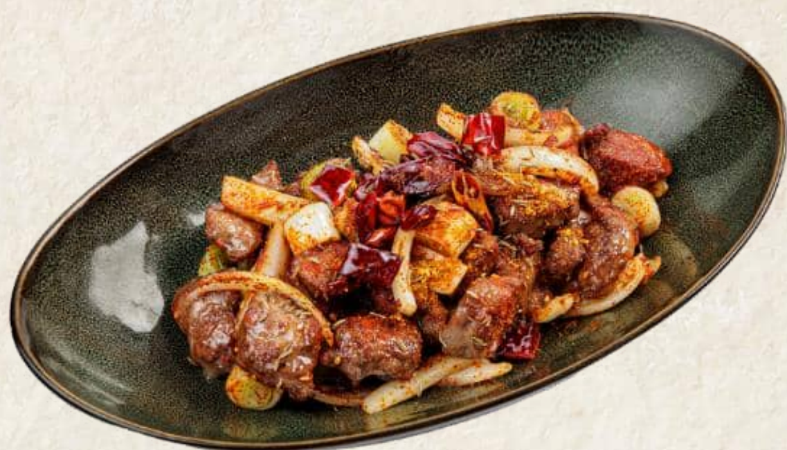
子羊のローストスパイシーソース Stir Fried Lamb Dried Chili 28