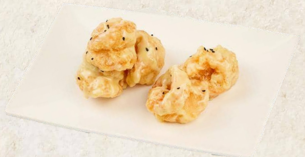
海老のワサビマヨネーズ和え Deep Fried Prawns Wasabi Mayonnaise 33