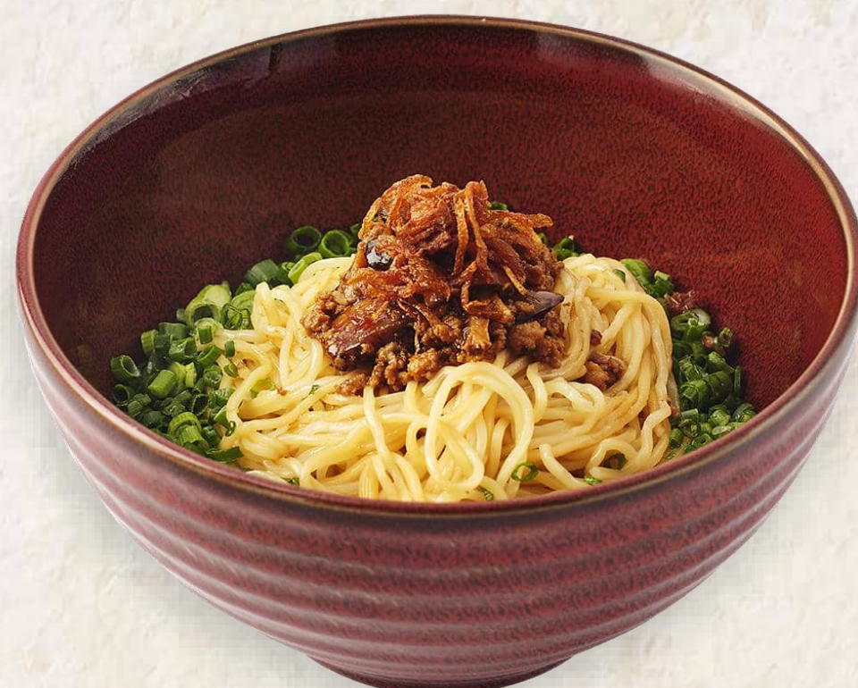
乾燥麵と葱、豚挽肉、キノコ Dried Noodles with Spring Onion Oil Minced Pork and Mushroom 20