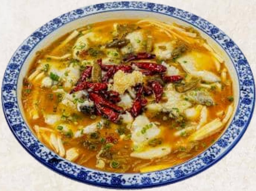
鱸と野菜の漬け物 Poached Seabass Fillet with Sichuan Chinese Preserved Vegetables 小 1~2人前 69 / 大 3~4人前 99