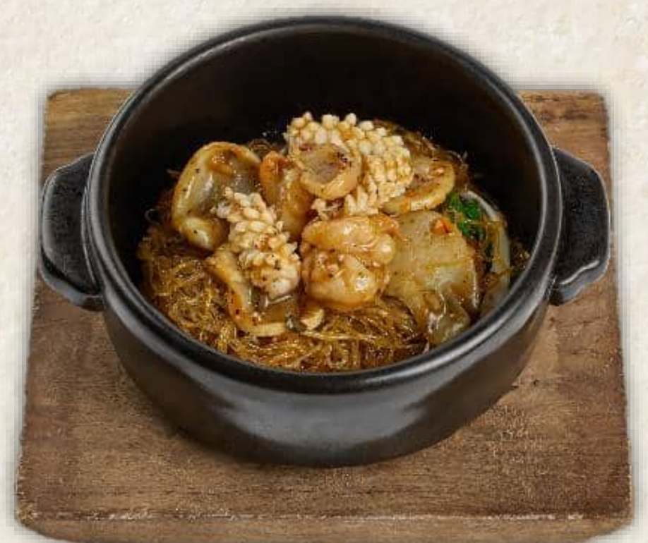
中国の春雨シーフード炒め Braised Assorted Seafood with Vermicelli and Black Pepper Sauce 22