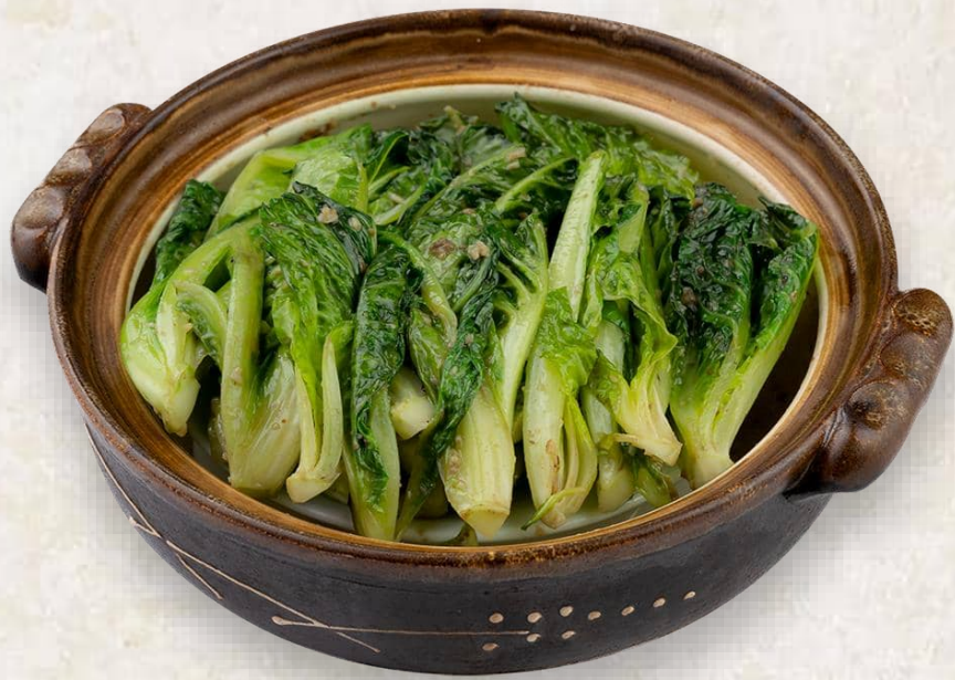
レタス炒め Sizzling Lettuce in A Clay Pot with Preserved Shrimp Paste 25