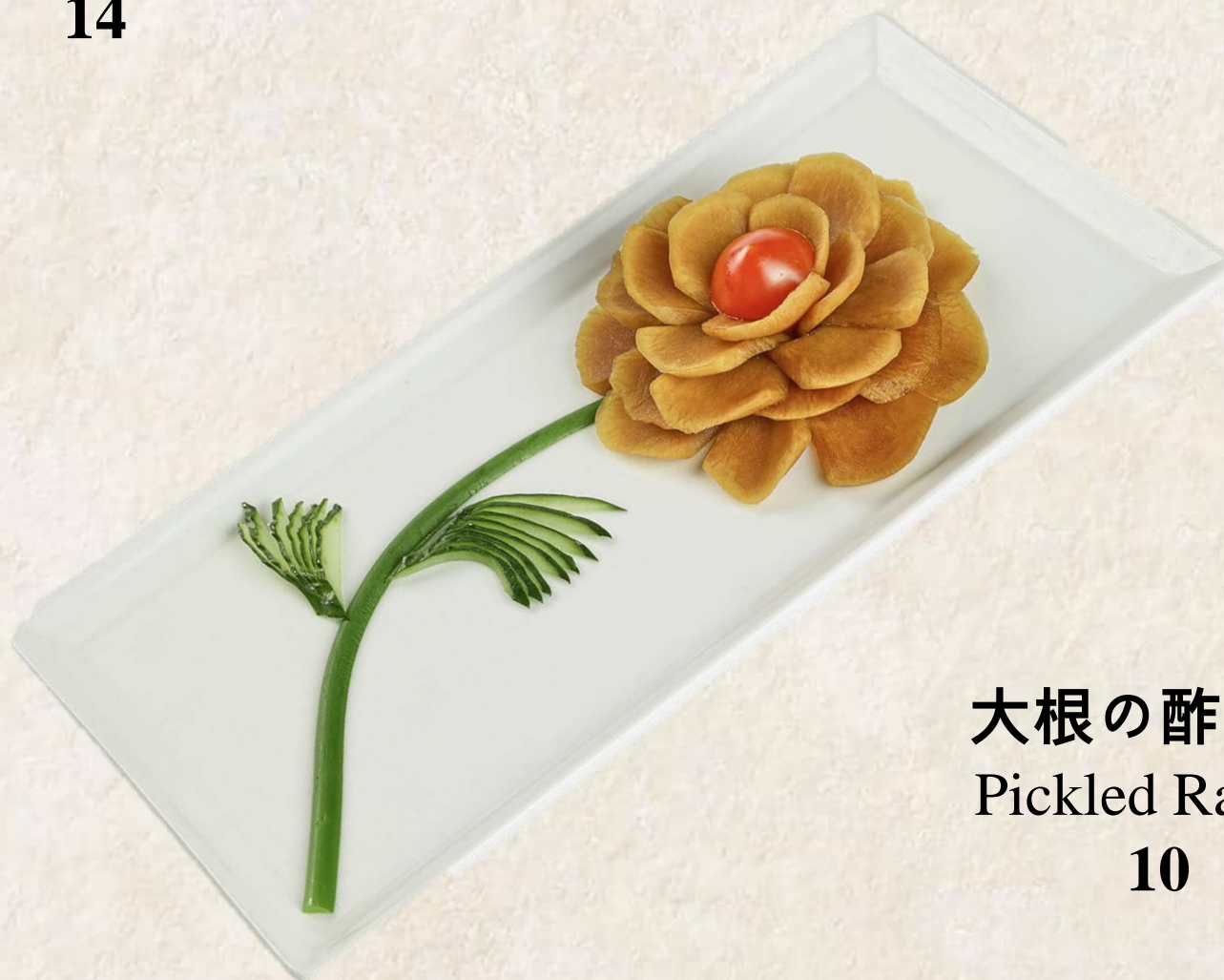
大根の酢漬け Pickled Radish 10