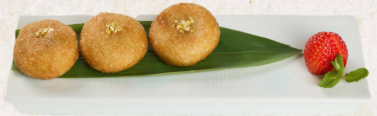
シュガーケーキ Crispy Fried Sugar Cake 8