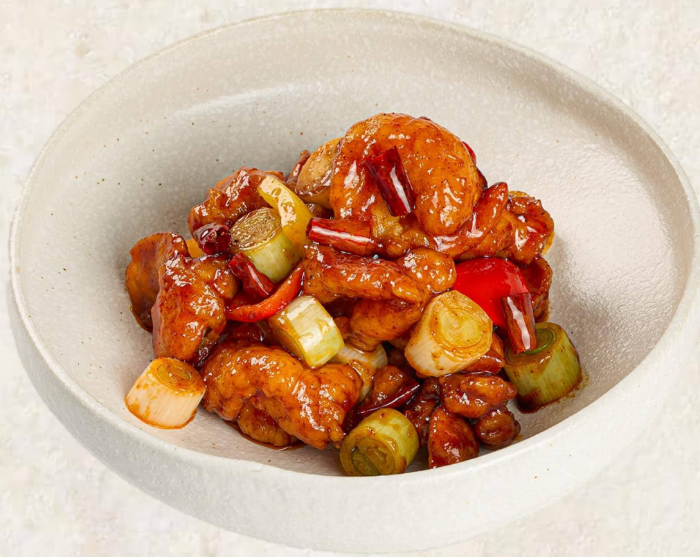
鶏肉とエビの炒め Stir Fried Chicken with Crispy Shrimp 35