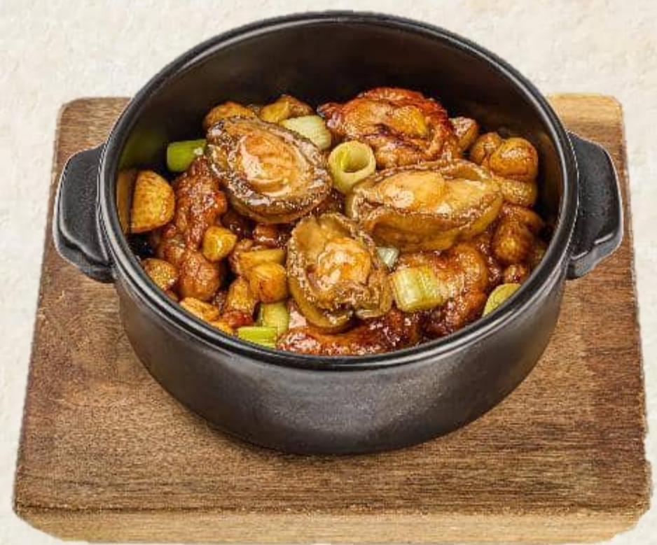
アワビチキンの煮 Braised Abalone and Chicken in A Clay Pot 32