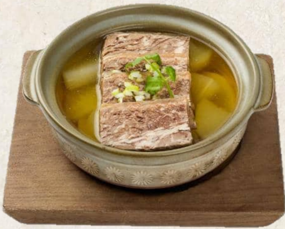
牛肉と大根のスープ煮 Stewed Beef Brisket with Supreme Broth 30