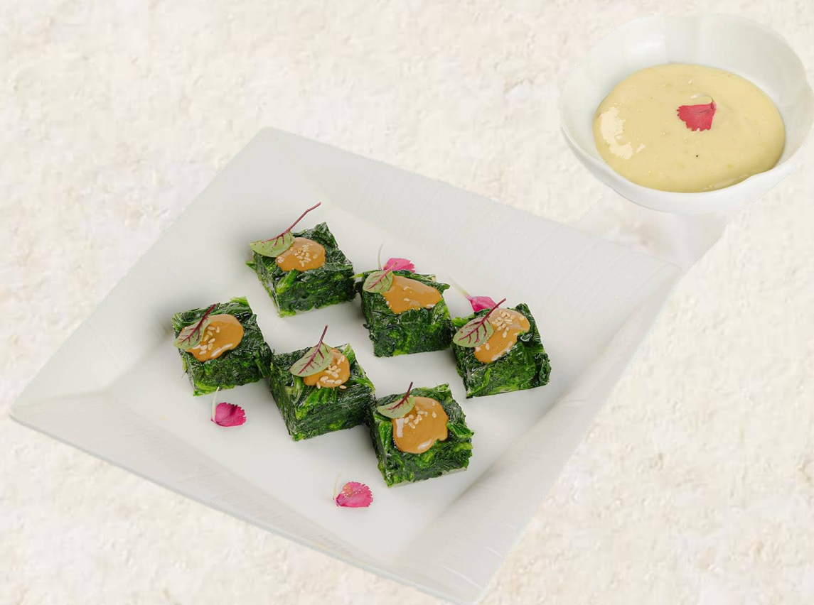
ごまほうれん草 Spinach with Sesame Sauce 10