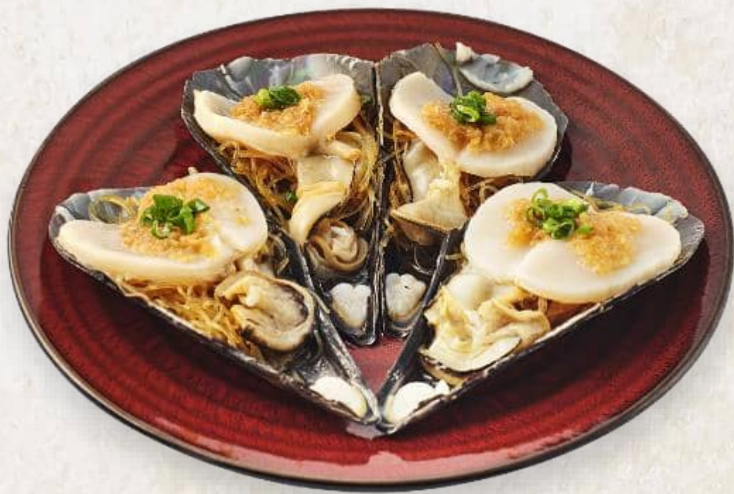
タイラギ貝 Fresh Jumbo Clam ガーリック蒸し Steamed with Garlic 42 / kg