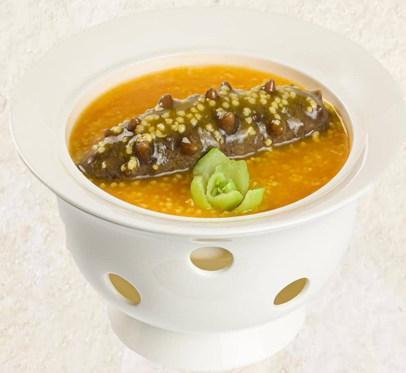
ナマコとキビ米のスープ煮 Braised Sea Cucumber with Millet in Rich Broth 60

价格均以韩币1,000结尾单位结算，并已包含10%税费及10%服务费。 Prices are in Korean Won at 1,000 value and include 10% tax and 10% service charge