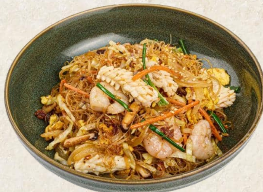
海鮮入り焼きビーフン Fried Rice Noodles with Assorted Seafood 22