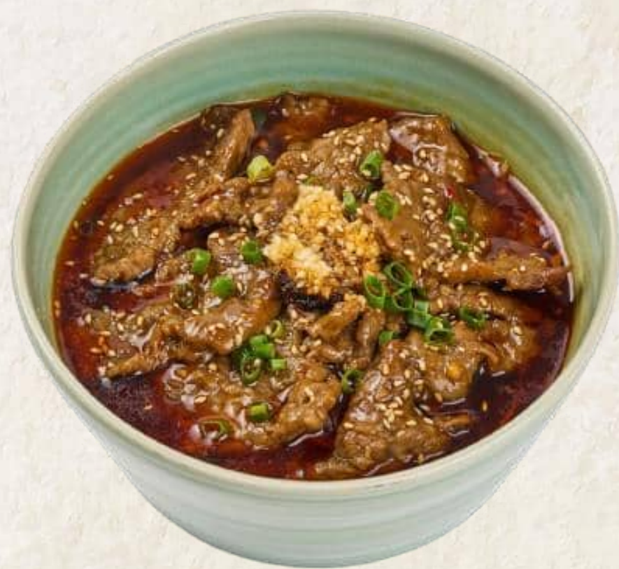
四川風牛肉の煮込み Sichuan Braised Beef 25