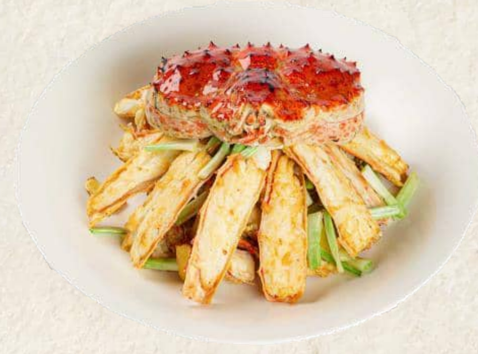
生姜とネギのタラバガニ King Crab Stir Fried with Ginger and Scallions 350 / kg