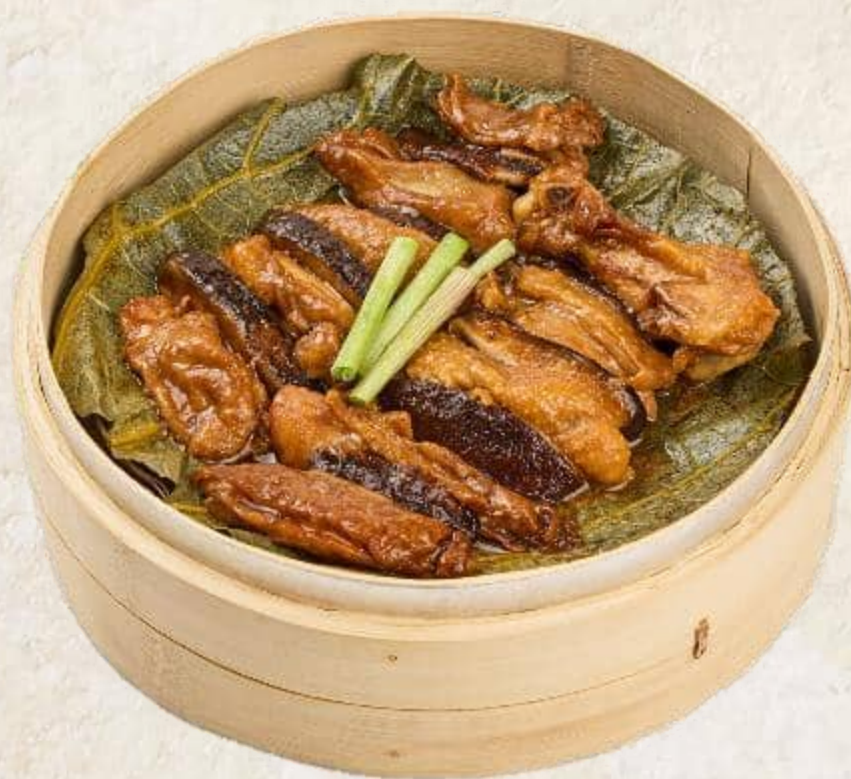
蓮の葉包みチキンの蒸し Steamed Chicken with Black Mushrooms Wrapped by Lotus Leaf