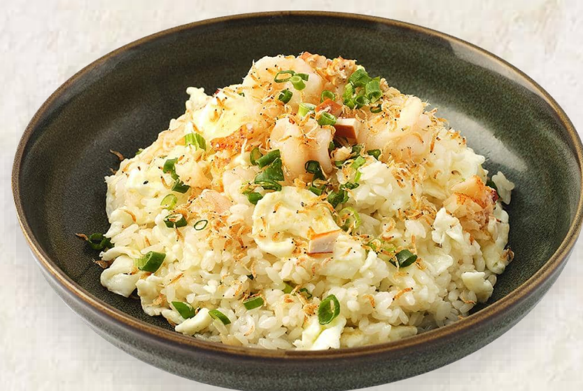
桜海老と蟹、卵白、野菜入り炒飯 Fried Rice with Sakura Shrimp Crab Meat Egg White and Vegetables 24