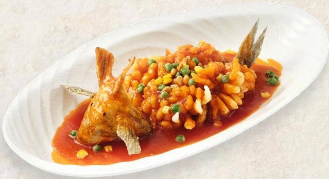
クリスピーに揚げたクロソイの甘酢ソース 掛け Crispy Black Rock Fish, Sweet and Sour Sauce 60