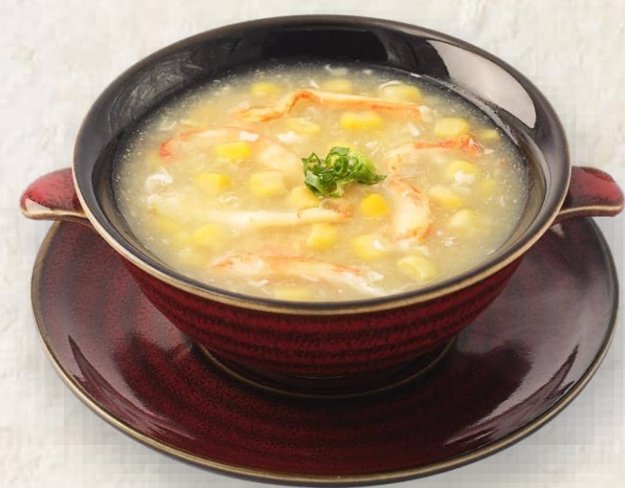
蟹入りコーンスープ (1人前) Crab Meat with Sweet Corn Soup (per person)