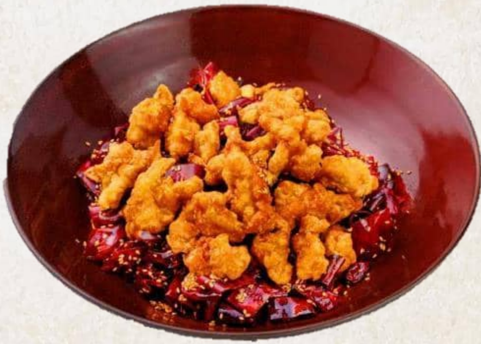
スパイシー鶏唐揚げ Deep Fried Chicken Chili 小 1~2人前 21 / 大 3~4人前 42