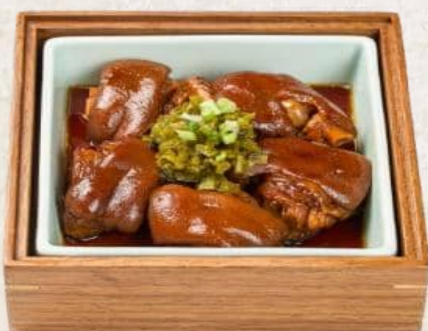
豚トロの煮込み Braised Pork Trotter with Pickled Cabbage 20