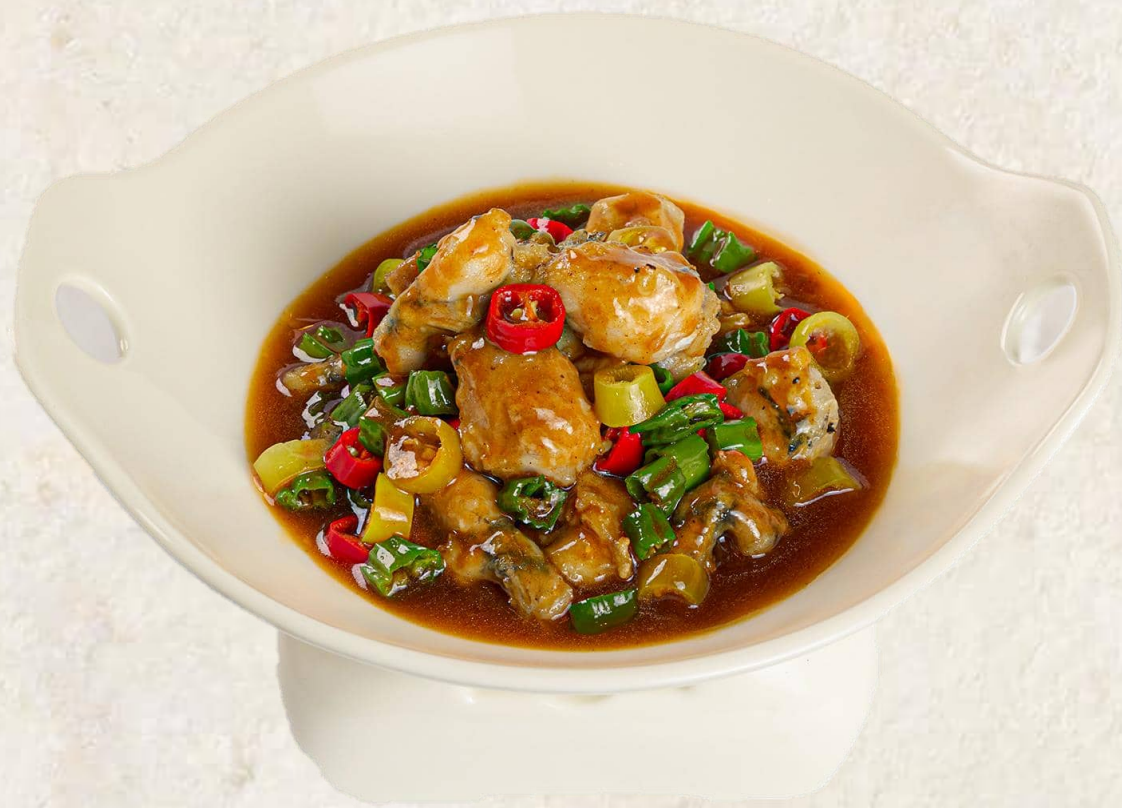
カエルの足の炒め Wok Fried Frog Legs with Green Pepper 35