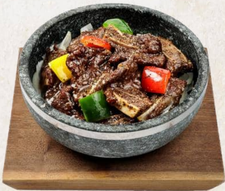
牛カルビのブラックペッパーソース Stir Fried Black Pepper Short Ribs 40