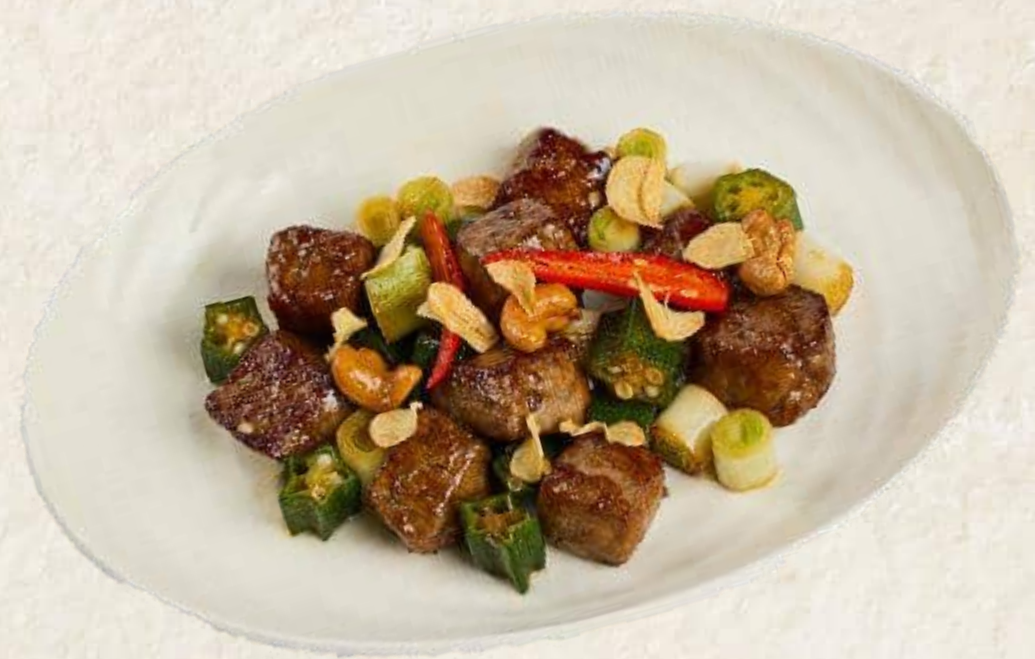
牛肉とオクラのカシューナッツソース炒め Wok Fried Diced Beef Tenderloin with Okra, Cashew Nut 38