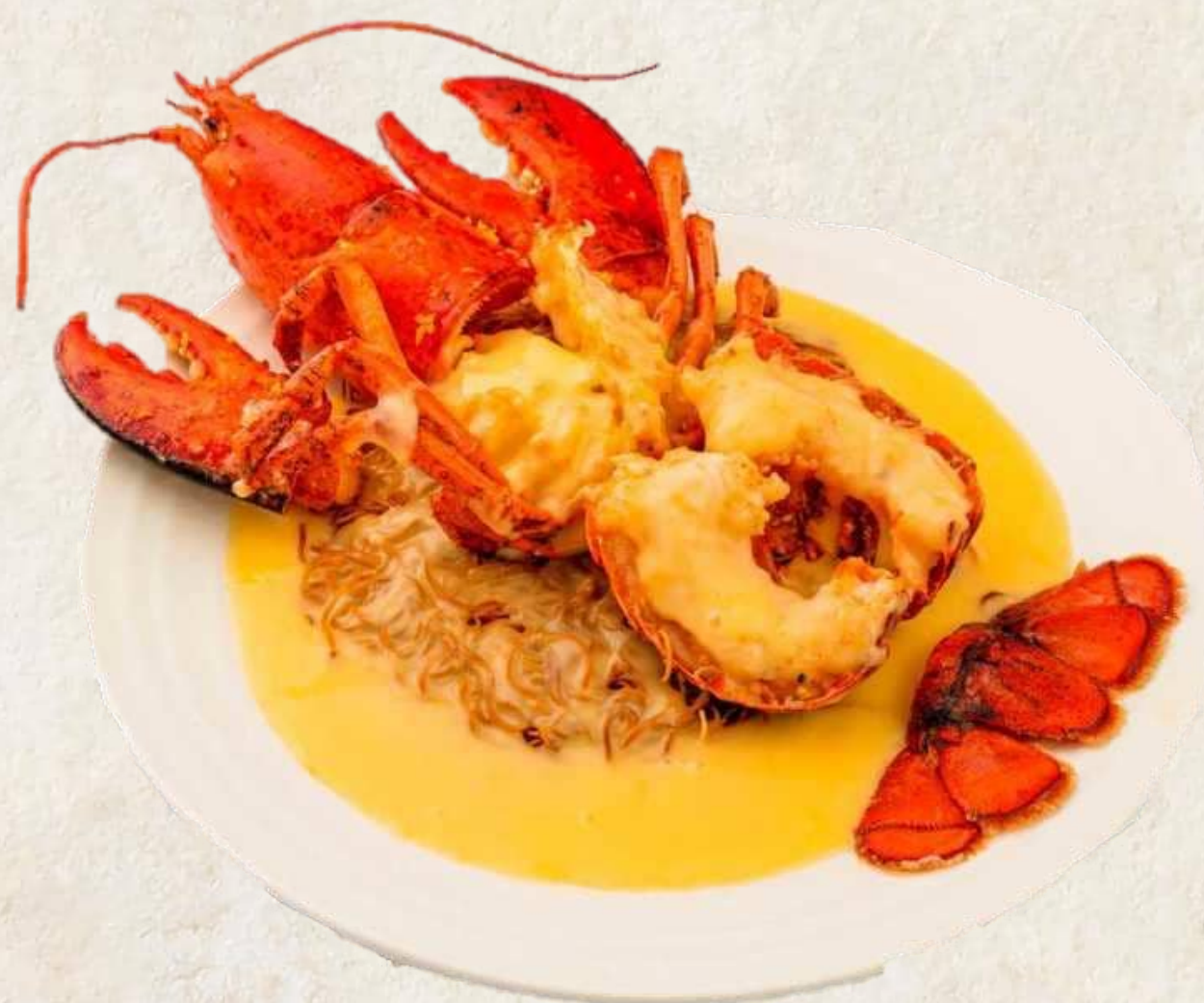
バターとチーズ風味のベイクドロブスター、 炒麵添え Baked Lobster with Butter and Cheese Served with Pan Fried Egg Noodle 135