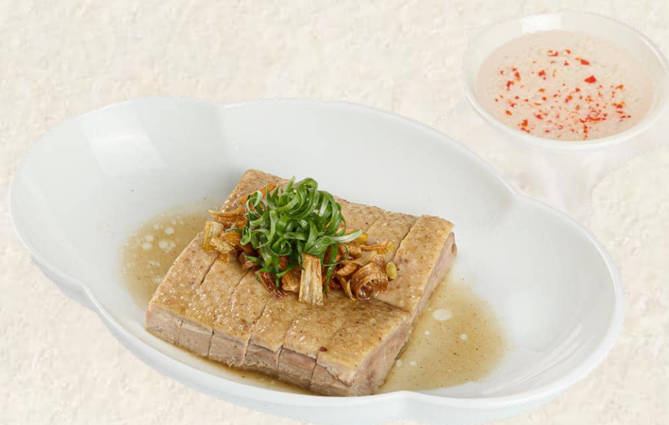
茹で鴨肉、胡椒塩添え Spiced Salt Braised Duck with White Pepper 20