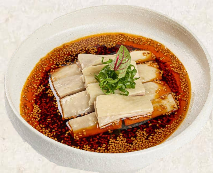
四川風鶏肉、唐辛子と花椒オイル添え Sichuan Mala Chicken with Green Sichuan Pepper 20