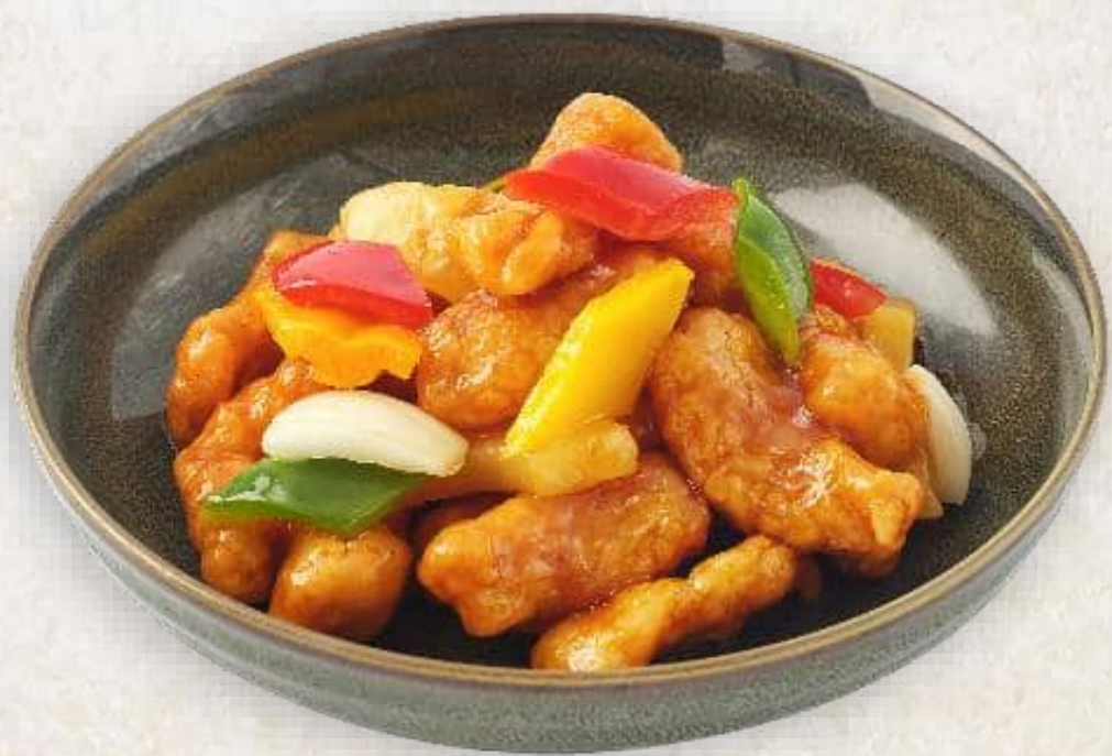
酢豚 Sautéed Sweet and Sour Pork 32