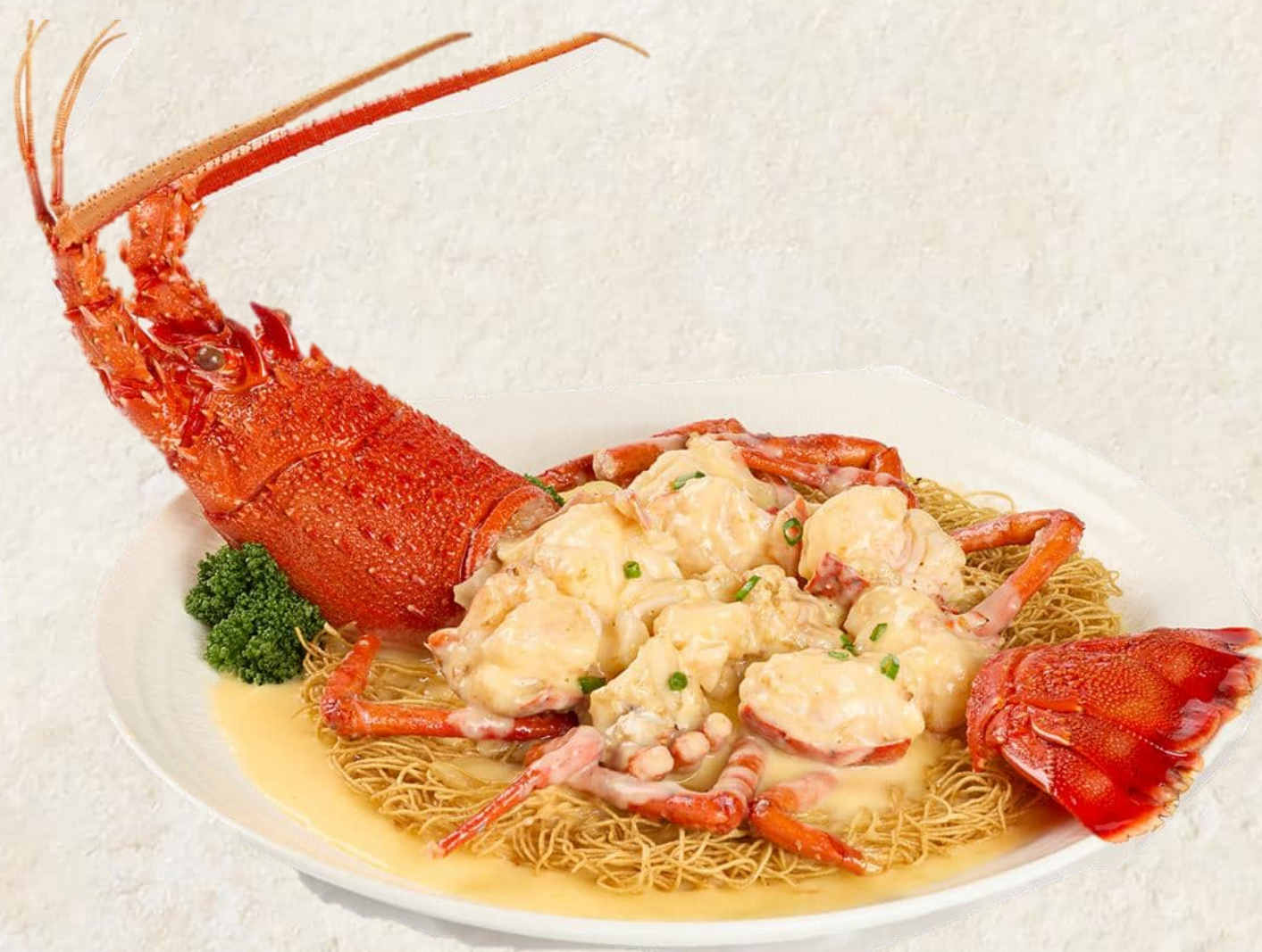
チーズとバター of 伊勢海老 Butter and Cheese Baked Australian Lobster 350