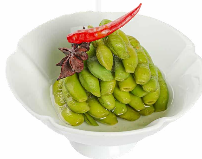
鹽水毛豆 Salted Boiled Edamame