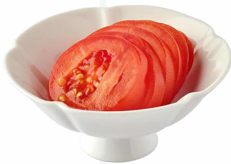
蕃茄 (60克/ 120克) Tomato (60g/ 120g) 2 / 4