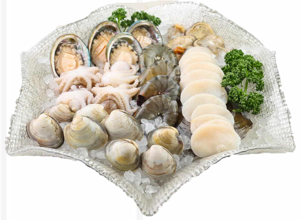
海鮮拼盤 (4 人) Seafood Platter (4 pax) 108