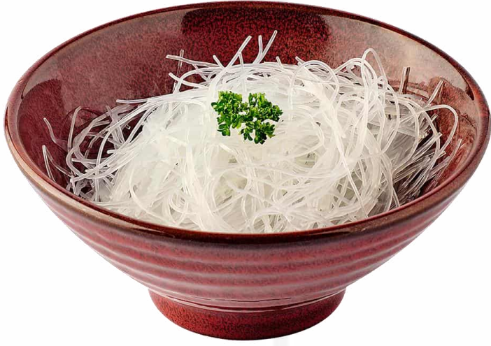
龍口粉絲 (60克/ 120克) Glass Vermicelli (60g/ 120g) 2 / 4