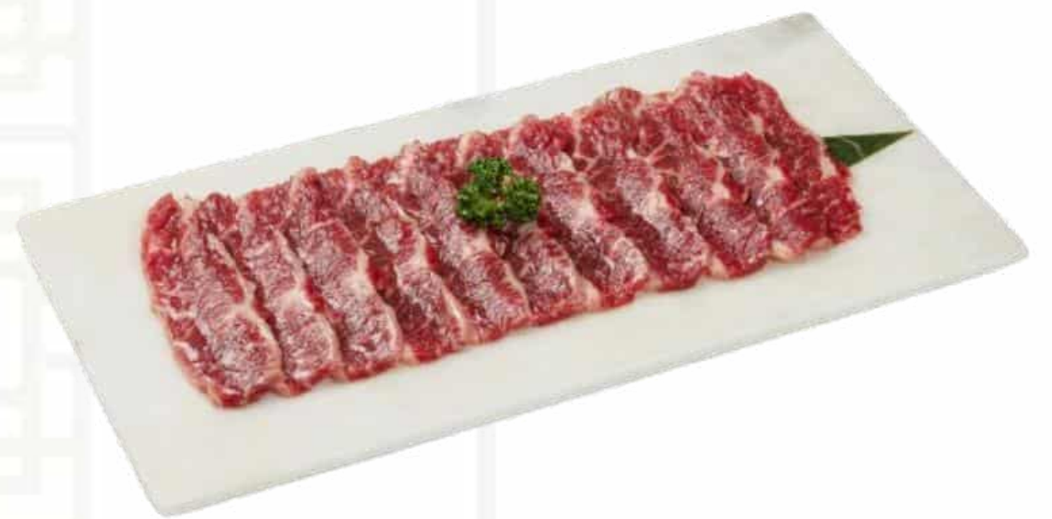
手切牛肋肉 (100克) Hand Cut Beef Rib (100g) 25