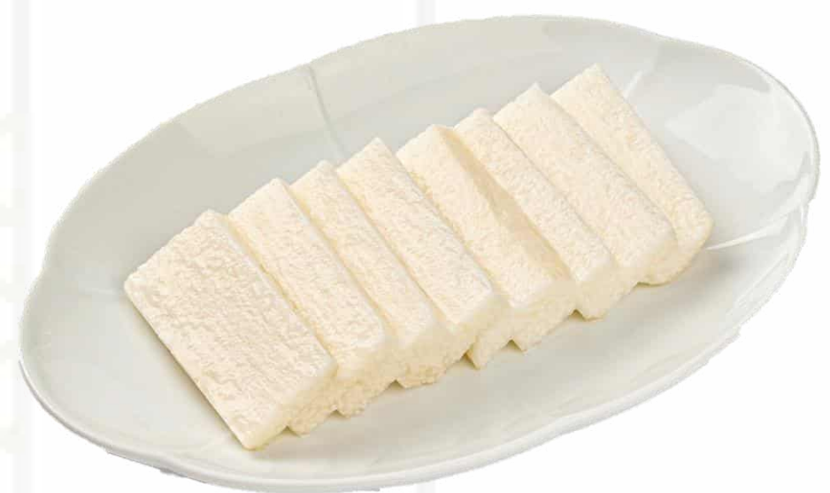
山藥 (4片/ 8片) Chinese Yam (4 pcs/ 8 pcs) 8 / 16