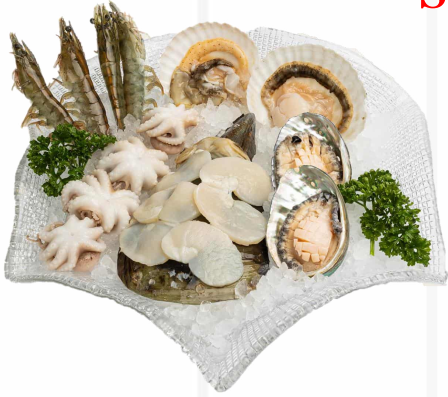
海鮮拼盤 (2 人) Seafood Platter (2 pax) 68