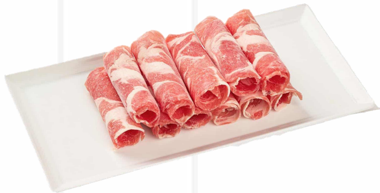
羊腿卷 (80克/ 160克) Lamb Leg (80g/ 160g) 10 / 20