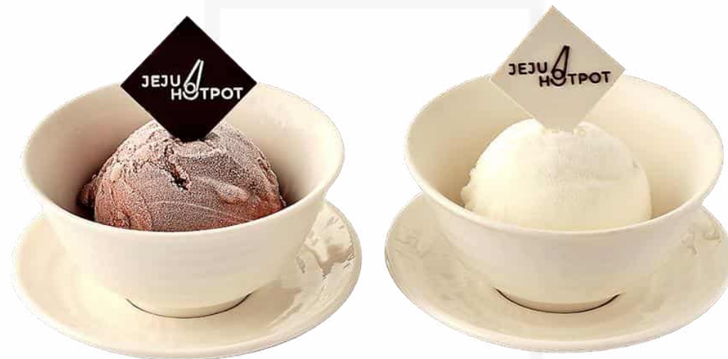
自製雪糕 Homemade Ice Cream 8 / 單球 Single 12 / 雙球 Double

價格均以韓元1,000結尾為單位計算，並已包含10%稅費及10%服務費 Prices are in Korean Won at 1,000 value and include 10% tax and 10% service charge