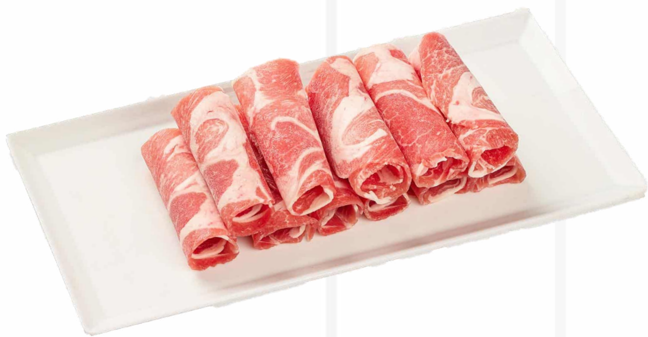
羊肩肉 (80克/ 160克) Lamb Shoulder (80g/ 160g) 10 / 20