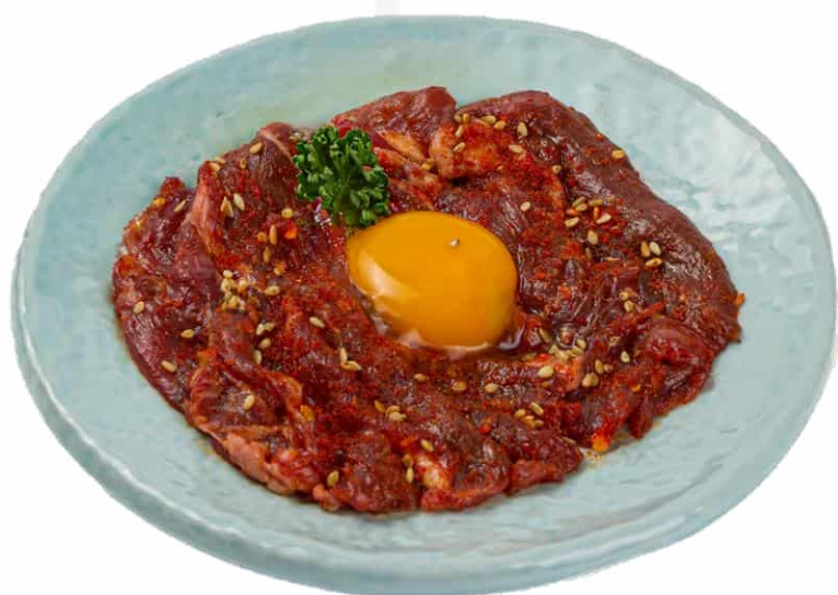
腌製麻辣羊肩肉 (60克/ 100克) Marinated Spicy Sliced Lamb Shoulder (60g/ 100g) 10 / 20