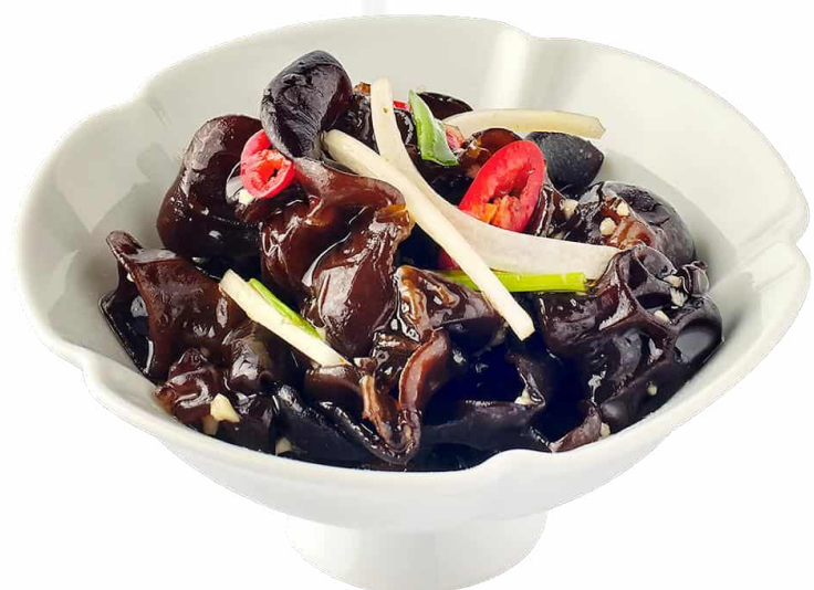
蔥油拌木耳 Marinated Black Fungus with Onion Oil