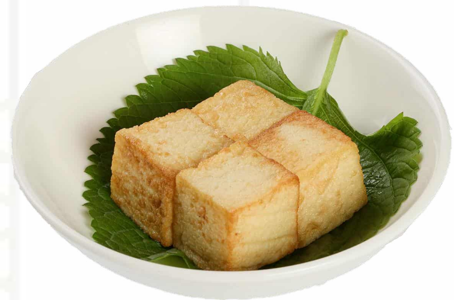
手工魚豆腐 (4件/ 8件) Handmade Fish Tofu (4 pcs/ 8 pcs) 3 / 6