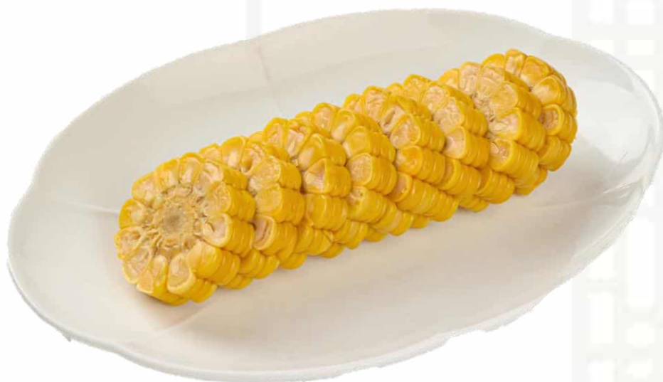
玉米 (4片/ 8片) Sweet Corn (4 pcs/ 8 pcs) 4 / 8