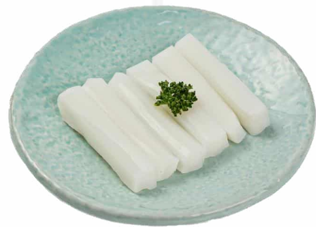
粉耗子 (50克/ 100克) Starch Noodle (50g/ 100g) 2 / 4