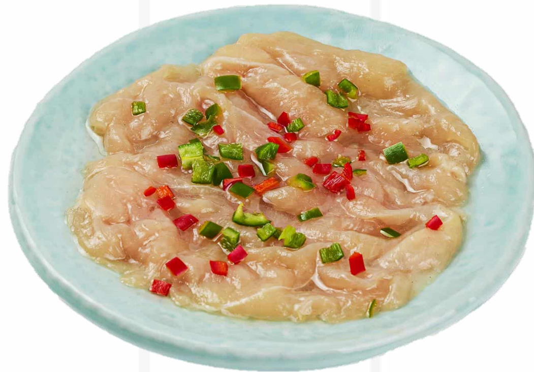
調味雞胸肉 (60克/ 120克)