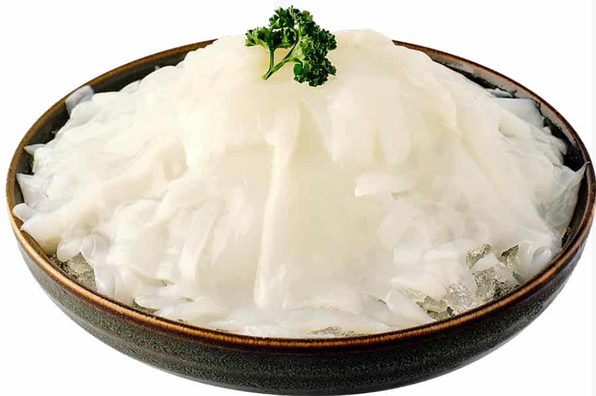
花枝片 (50克/ 100克) Cuttlefish (50g/ 100g) 8 / 16