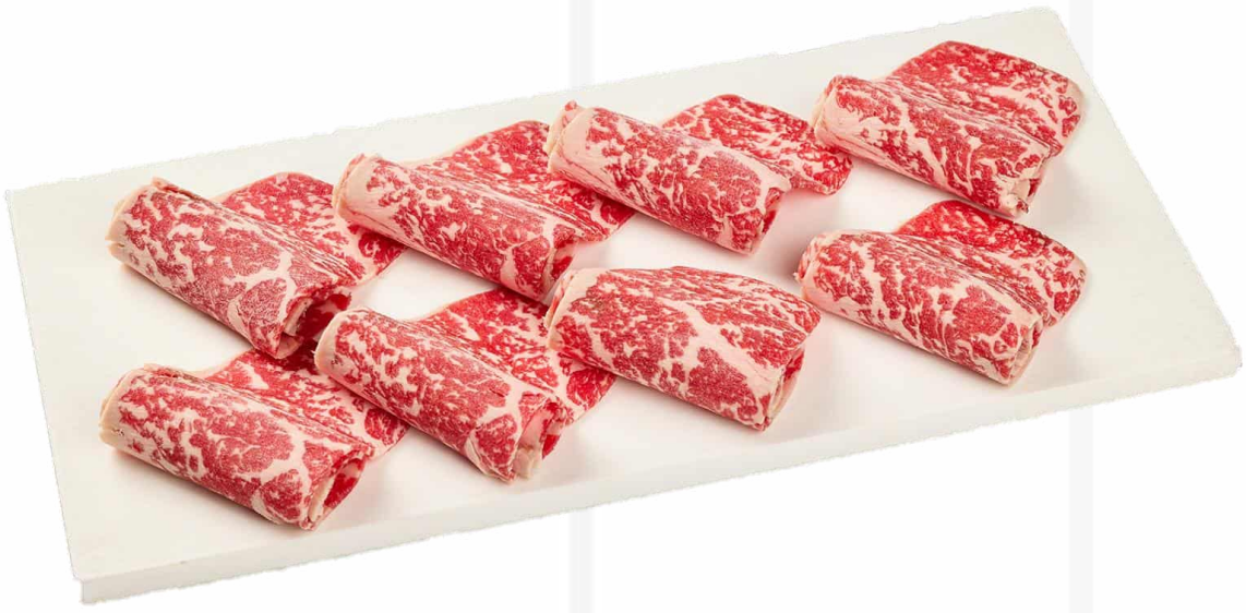
雪花牛肉眼 (80克/ 160克) Hanwoo Beef Ribeye (80g/ 160g) 65 / 130