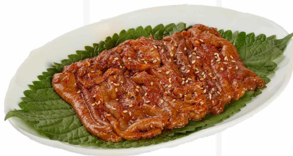
牛舌 (50克/ 100克) Beef Tongue (50g/ 100g) 8 / 16

價格均以韓元1,000結尾為單位計算，並已包含10%稅費及10%服務費 Prices are in Korean Won at 1,000 value and include 10% tax and 10% service charge