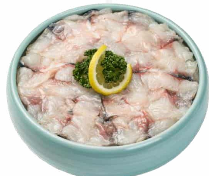
鰻魚片 (50克/ 100克) Sliced Eel (50g/ 100g) 11 / 22

價格均以韓元1,000結尾為單位計算，並已包含10%稅費及10%服務費 Prices are in Korean Won at 1,000 value and include 10% tax and 10% service charge