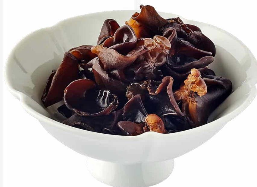
黑木耳 (40克/ 80克) Black Fungus (40g/ 80g) 3 / 6

價格均以韓元1,000結尾為單位計算，並已包含10%稅費及10%服務費 Prices are in Korean Won at 1,000 value and include 10% tax and 10% service charge