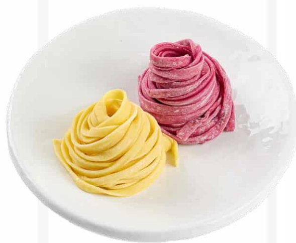
兩色麵拼盤 (30克) Assorted Noodles (30g) 5

價格均以韓元1,000結尾為單位計算，並已包含10%稅費及10%服務費 Prices are in Korean Won at 1,000 value and include 10% tax and 10% service charge