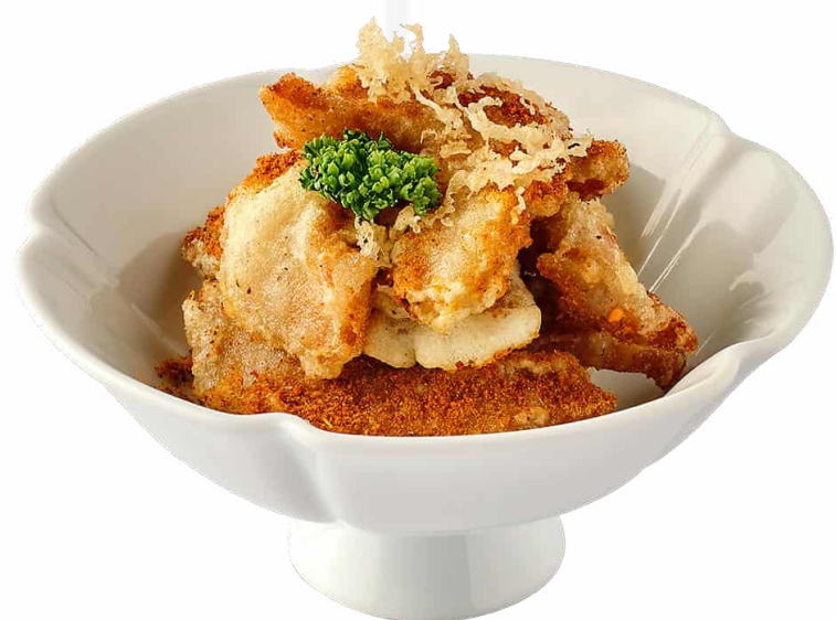
四川酥肉 Deep Fried Pork Belly, Sichuan Style