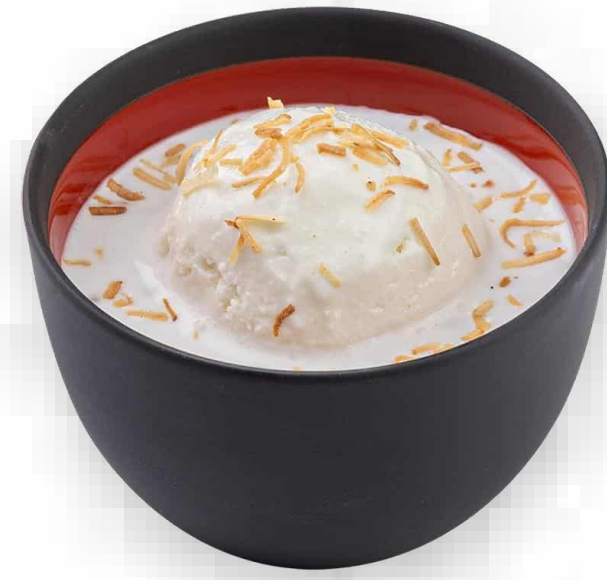
椰汁西米露配雪糕 Chilled Coconut Cream, Sago, Ice Cream 11