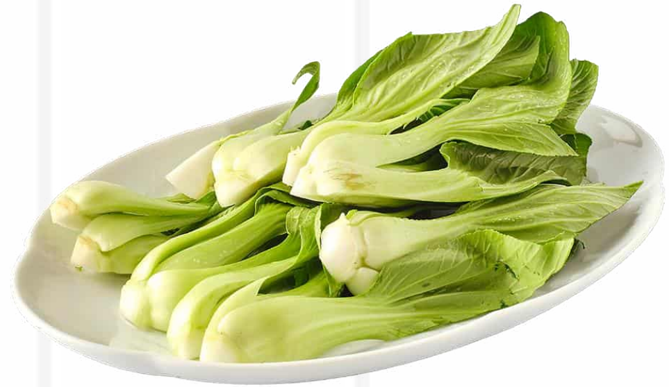
小白菜 (40克/ 80克) Bok Choy (40g/ 80g) 4 / 8