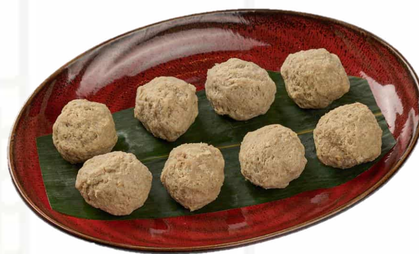
牛肉丸 (4粒/ 8粒)