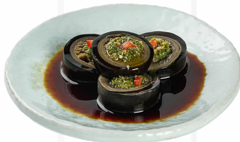
辣汁燒椒皮蛋 Tossed Century Egg with Pepper Sauce 6

價格均以韓元1,000結尾為單位計算，並已包含10%稅費及10%服務費 Prices are in Korean Won at 1,000 value and include 10% tax and 10% service charge