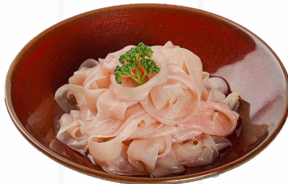
鴨腸 (50克/ 100克) Duck Intestines (50g/ 100g) 3 / 6

價格均以韓元1,000結尾為單位計算，並已包含10%稅費及10%服務費 Prices are in Korean Won at 1,000 value and include 10% tax and 10% service charge