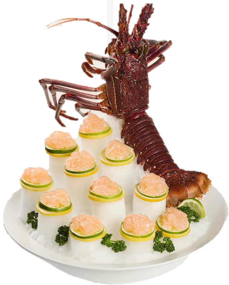
澳洲龍蝦刺身 (公斤) Australian Lobster Sashimi (KG) 350