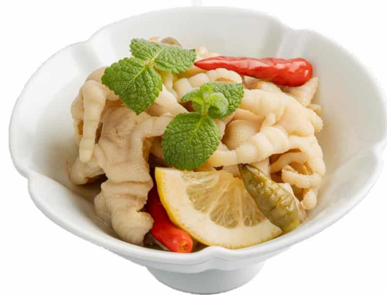
泡椒無骨鳳爪 Pickled Pepper Boneless Chicken Feet