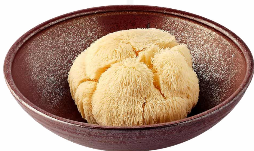
猴頭菇 (30克/ 60克) Bearded Tooth Mushroom (30g/ 60g) 6 / 12