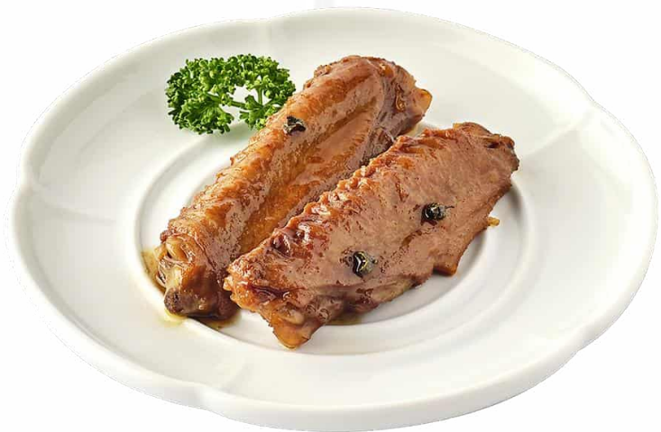
香辣滷鴨翅 (2隻) Spicy Braised Duck Wings (2 pcs)