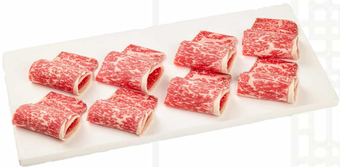
和牛西冷 (80克/ 160克) Wagyu Beef Striploin (80g/ 160g) 52 / 104