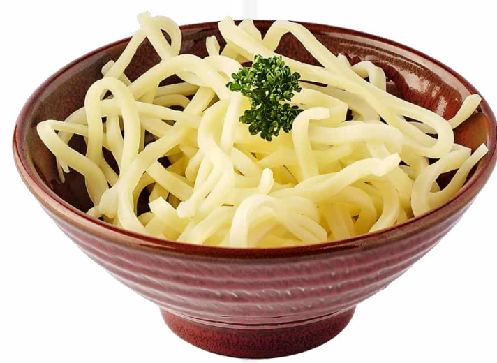
烏冬麵 (120克) Udon (120g) 4