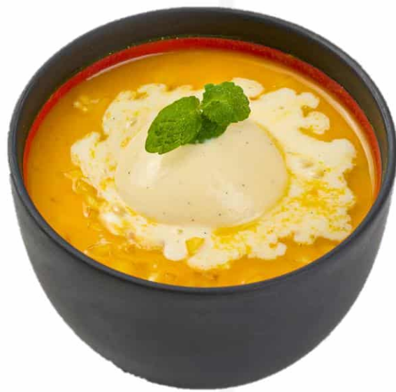
楊枝甘露配雪糕 Chilled Mango Cream, Sago, Ice Cream 13