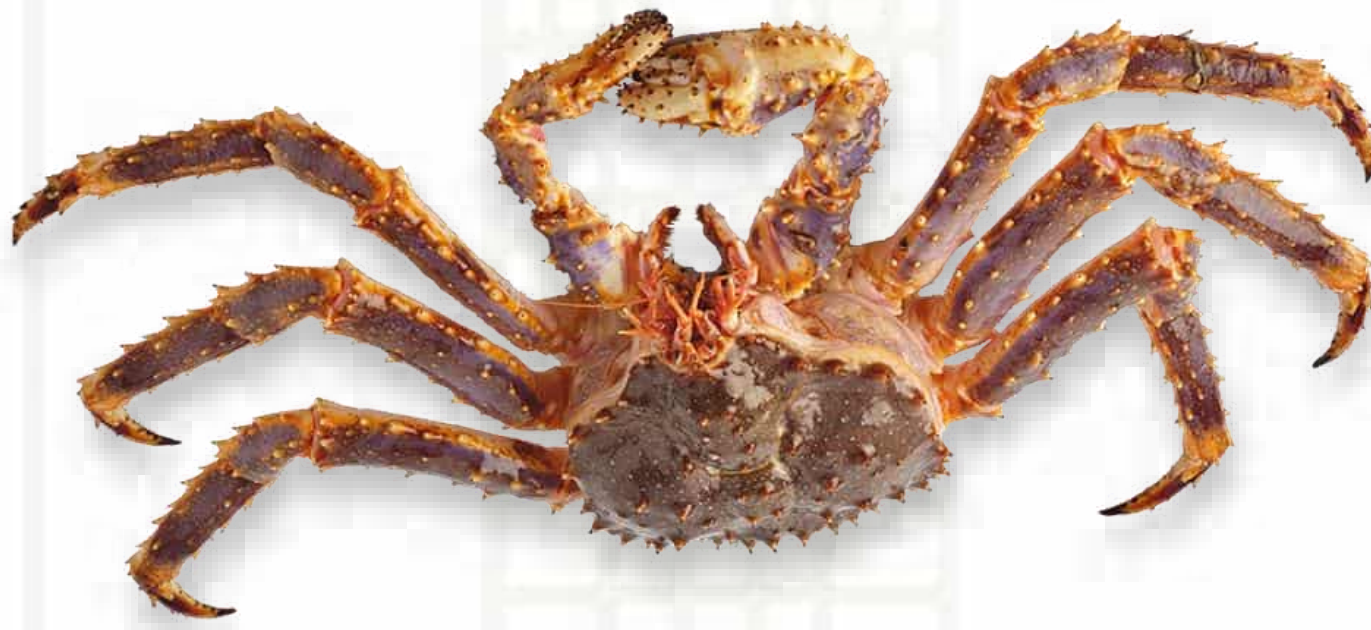
帝皇蟹 (公斤) King Crab (KG) 350