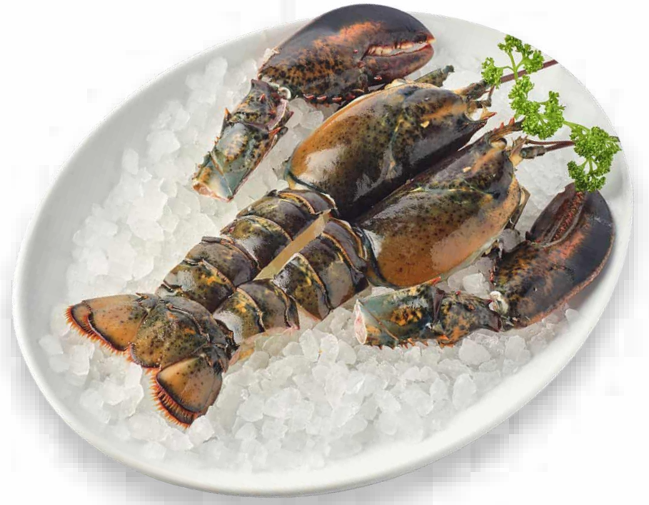
波士頓龍蝦 (整隻) Boston Lobster (whole piece) 125