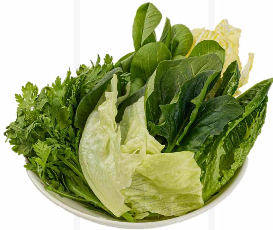
蔬菜拼盤 (100克/ 200克) Assorted Fresh Vegetables (100g/ 200g) 10 / 20