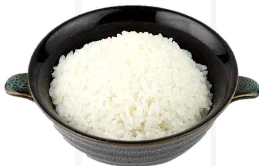
米飯 Steamed Rice 2

價格均以韓元1,000結尾為單位計算，並已包含10%稅費及10%服務費 Prices are in Korean Won at 1,000 value and include 10% tax and 10% service charge