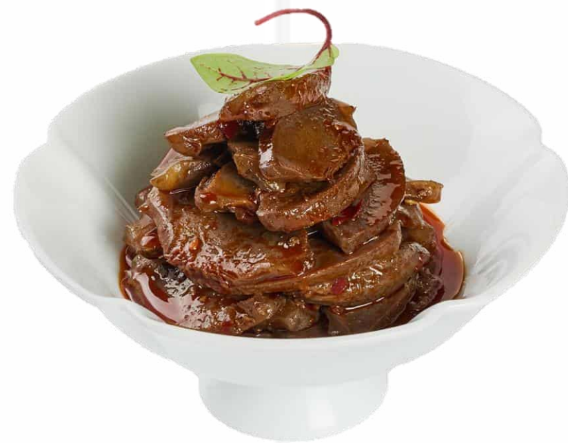
蒜香辣鴨珍 Spicy Garlic Duck Gizzards 6