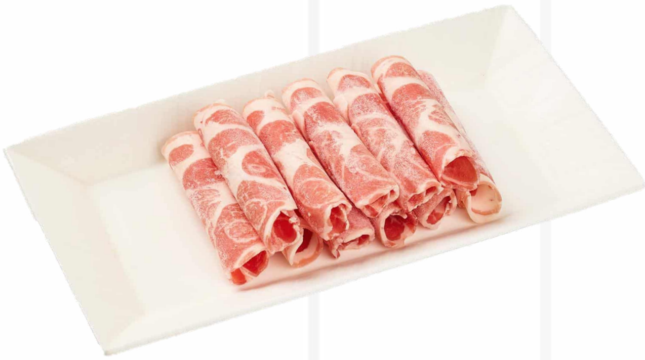
豬肩肉 (80克/ 160克) Pork Shoulder (80g/ 160g) 20 / 40