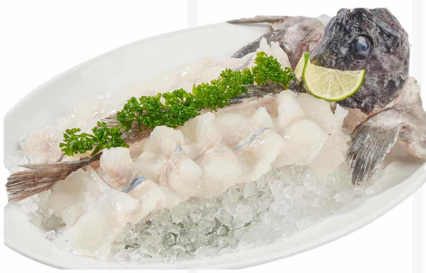
黑石魚 (每條) Black Rockfish (whole piece) 65