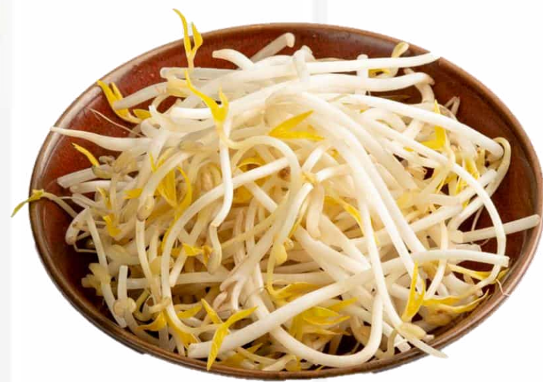
黃豆芽 (30克/ 60克) Yellow Bean Sprout (30g/ 60g) 2 / 4

價格均以韓元1,000結尾為單位計算，並已包含10%稅費及10%服務費 Prices are in Korean Won at 1,000 value and include 10% tax and 10% service charge