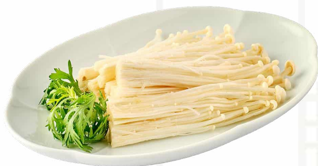
金針菇 (30克/ 60克) Enoki Mushroom (30g/ 60g) 3 / 6