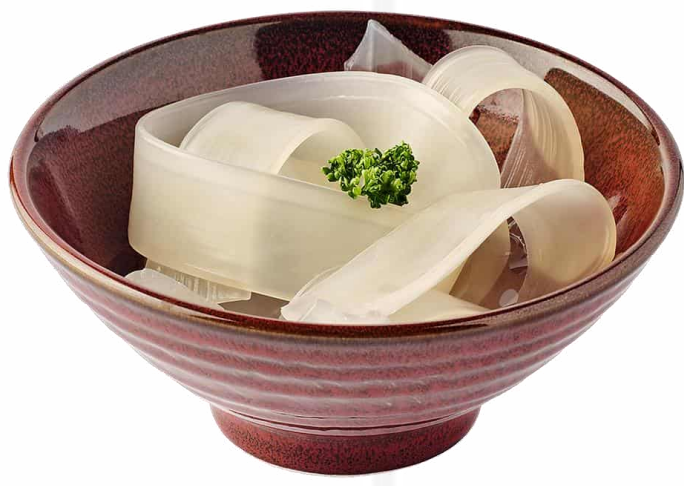
土豆寬粉 (80克/ 160克) Potato Noodle (80g/ 160g) 2 / 4