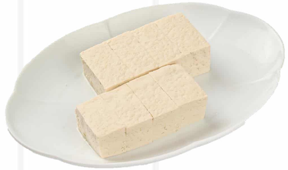
鮮豆腐 (4片/ 8片) Bean Curd (4 pcs/ 8 pcs) 6 / 12