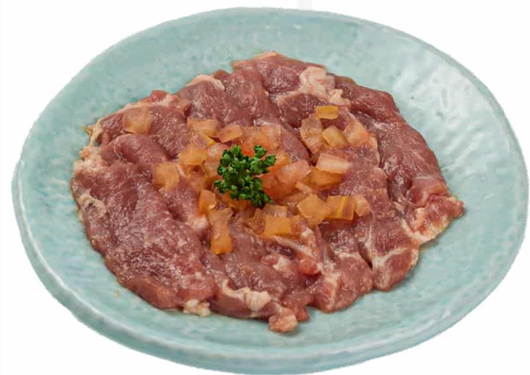
腌製黑豬肉 (50克/ 100克) Marinated Sliced Black Pork (50g/ 100g) 6 / 12