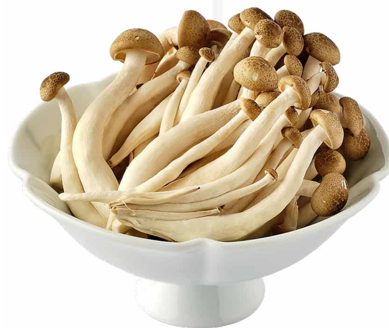
白玉菇 (30克/ 60克) White Beech Mushroom (30g/ 60g) 3 / 6