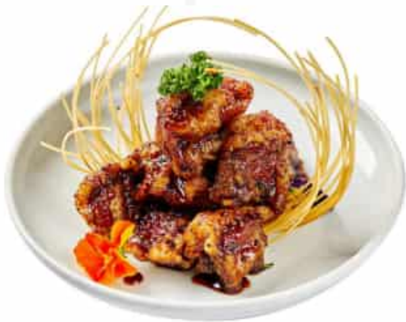
黑椒牛肉粒 Diced Beef with Black Pepper 13