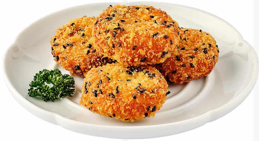
香煎南瓜餅 (4件) Pan Fried Pumpkin Cake (4 pcs) 8