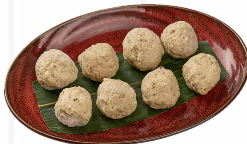
香菇豬肉丸 (4粒/ 8粒)

Pork Meatball, Shiitake Mushroom (4 pcs/ 8 pcs)