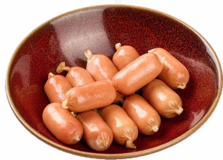
迷你香腸 (6件/ 12件) Preserved Mini Sausage (6 pcs/ 12 pcs) 6 / 12

價格均以韓元1,000結尾為單位計算，並已包含10%稅費及10%服務費 Prices are in Korean Won at 1,000 value and include 10% tax and 10% service charge