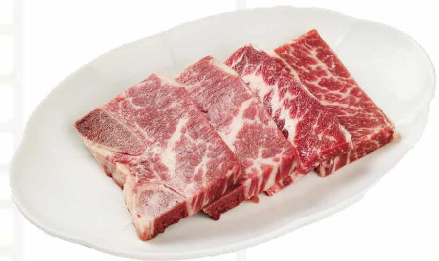
牛仔骨 (100克/ 200克) Short Rib (100g/ 200g) 15 / 30

價格均以韓元1,000結尾為單位計算，並已包含10%稅費及10%服務費 Prices are in Korean Won at 1,000 value and include 10% tax and 10% service charge