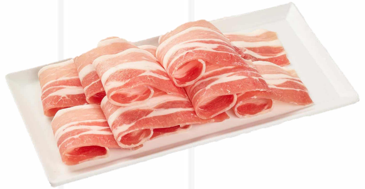
豬五花肉 (80克/ 160克) Pork Belly (80g/ 160g) 12 / 24