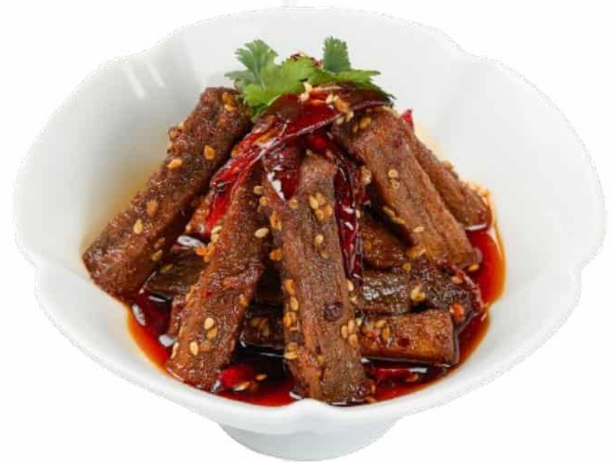
麻辣牛肉條 Spicy Beef Strips 13