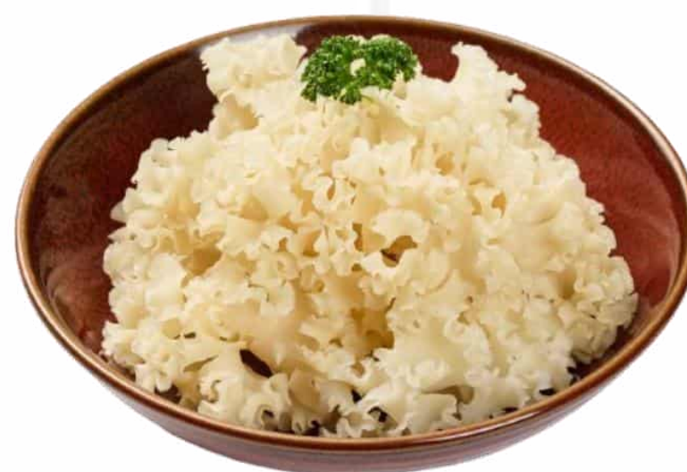
繡球菌菇 (30克/ 60克) Cauliflower Mushroom (30g/ 60g) 3 / 6