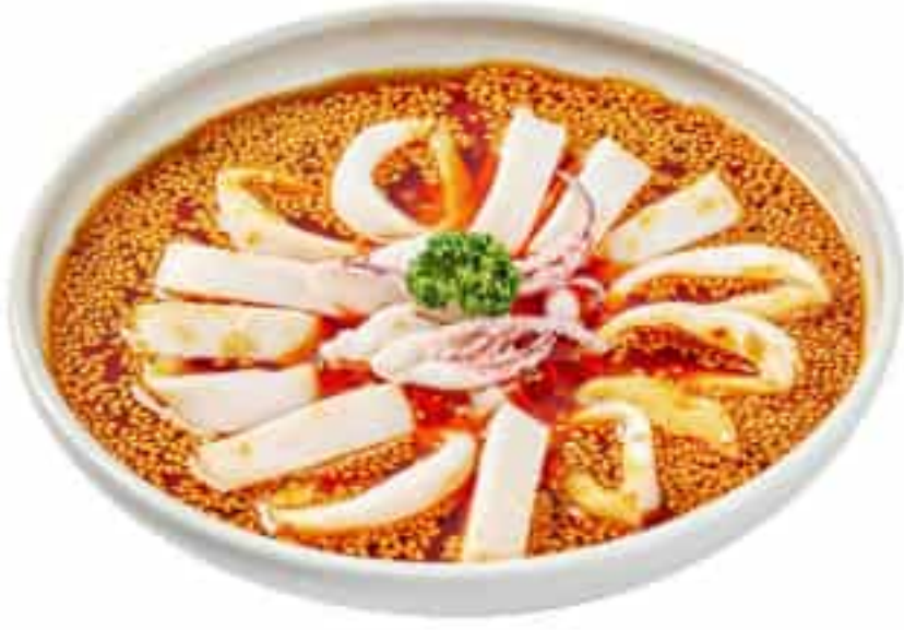
紅油鮮魷魚 Marinated Squid with Chili Oil 16