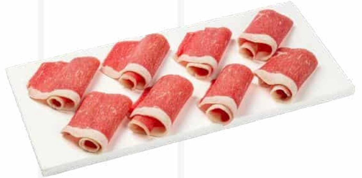
牛肉西冷 (80克/ 160克) Beef Striploin (80g/ 160g) 16 / 32