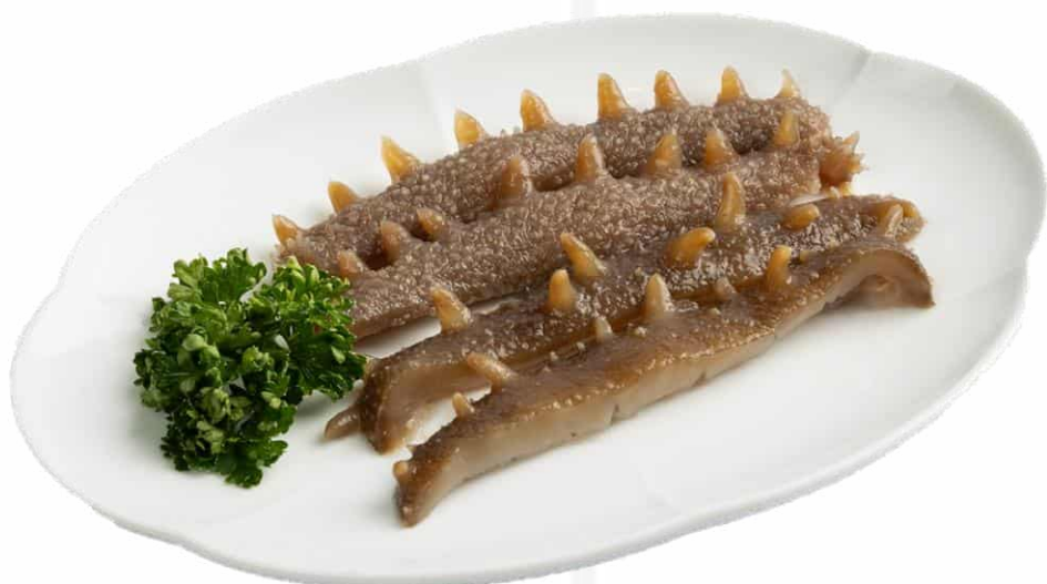
海參 (1條) Sea Cucumber (1 pcs) 55