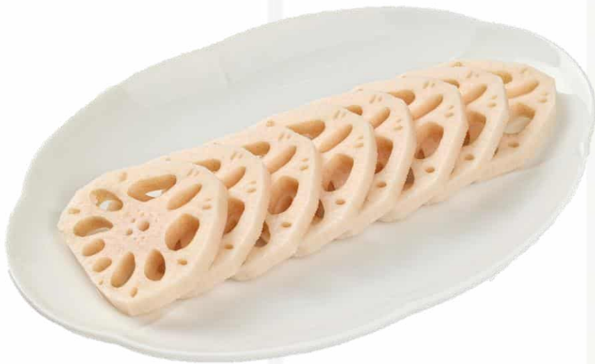
蓮藕片 (4片/ 8片) Lotus Root (4 pcs/ 8 pcs) 6 / 12