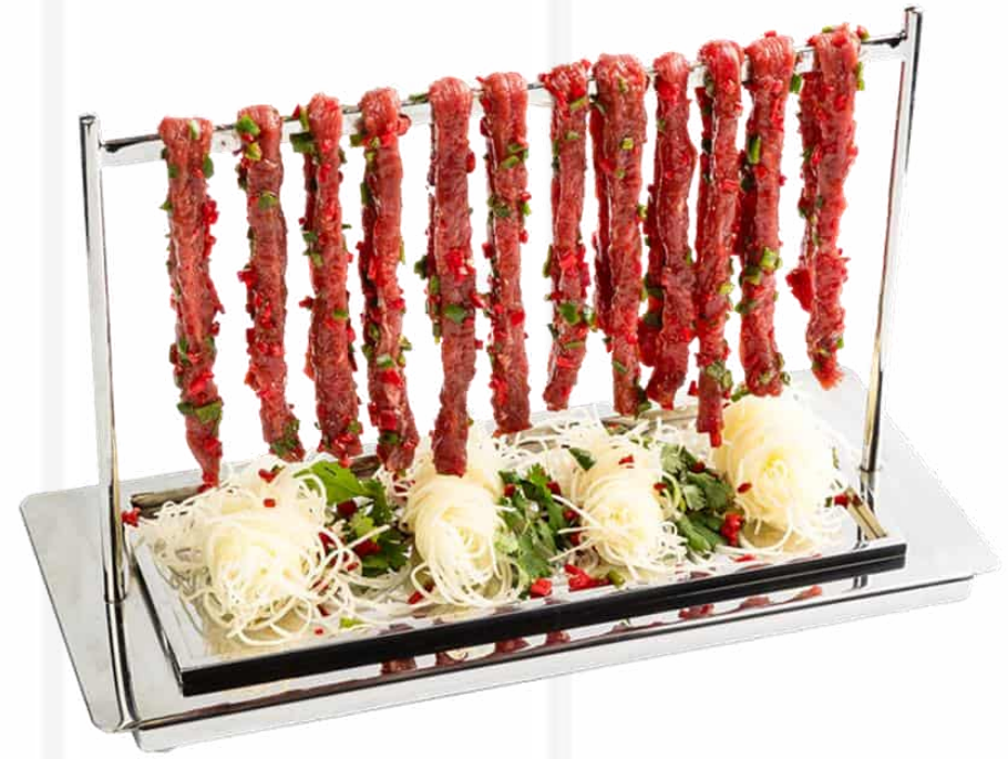
麻辣嫩牛肉絲 (80克/ 160克) Sichuan Pepper Beef (80g/ 160g) 16 / 32