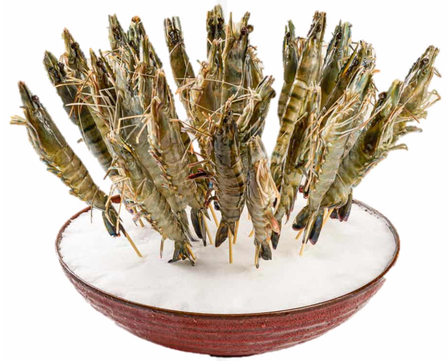
鮮蝦 (500克/ 1公斤) Shrimp (500g/ 1KG) 35 / 68