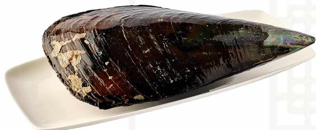
牛角貝 (公斤) Fresh Jumbo Clam (KG) 42