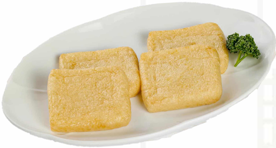
豆卜 (4片/ 8片) Fried Tofu Puff (4 pcs/ 8 pcs) 2 / 4