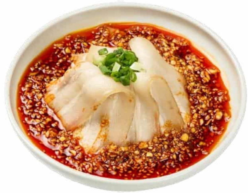
蒜泥白肉 Poached Pork Belly 13