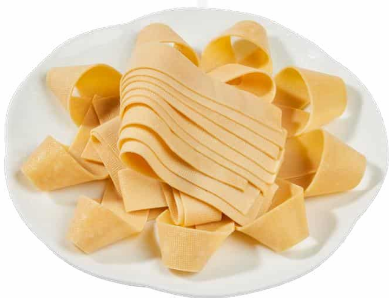
干豆腐皮(50克/ 100克) Tofu Skin (50g/ 100g) 3 / 6