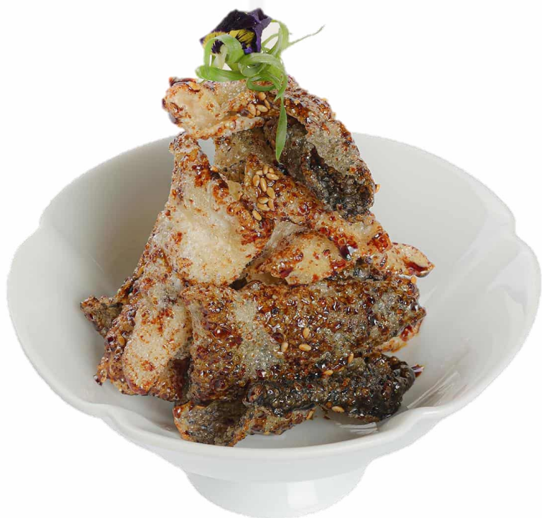
醬香脆魚皮 Crispy Fish Skin In Special Sauce 6