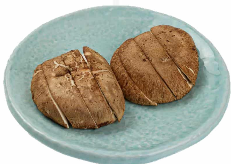
鮮冬菇 (30克/ 60克) Shiitake Mushroom (30g/ 60g) 3 / 6