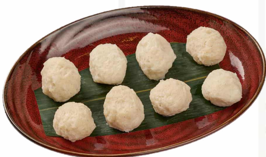
蟹籽墨魚滑 (4粒/ 8粒)

Crab Roe Cuttlefish Paste Ball (4 pcs/ 8 pcs)