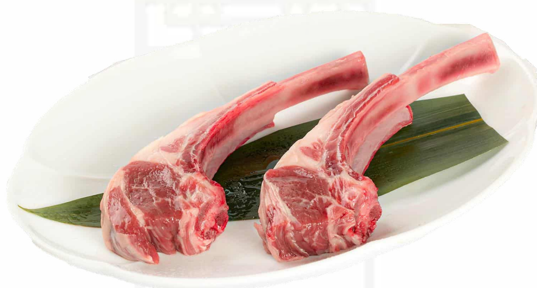
羊排 (1件/2件) Lamb Chops (1 pcs/ 2 pcs) 10 / 20

價格均以韓元1,000結尾為單位計算，並已包含10%稅費及10%服務費 Prices are in Korean Won at 1,000 value and include 10% tax and 10% service charge