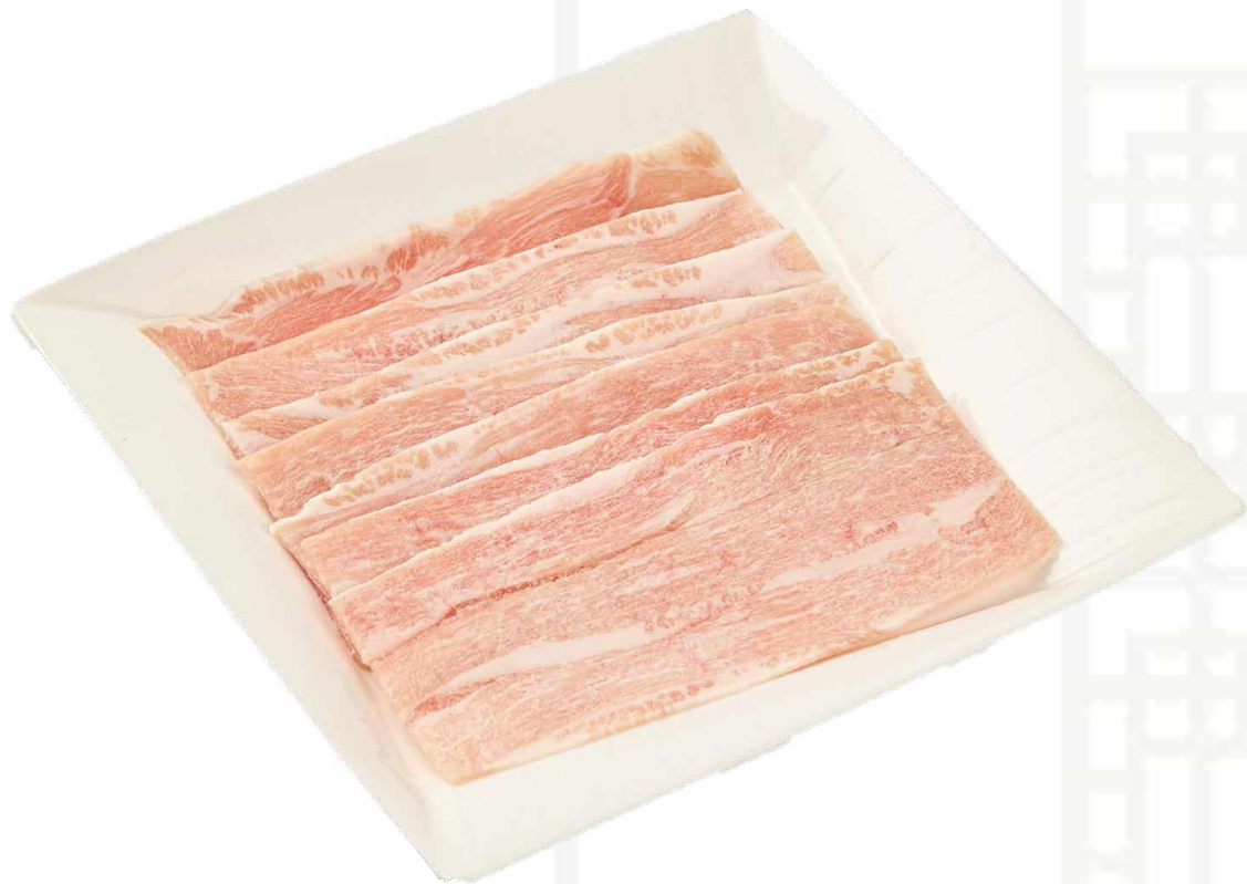
豬頸肉 (80克/ 160克) Pork Jowl (80g/ 160g) 12 / 24