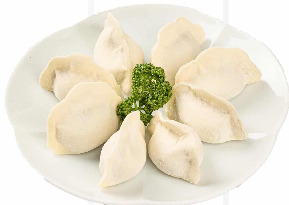
手工水餃 (4件/8件) Pork Dumpling (4 pcs/ 8 pcs) 7 / 14