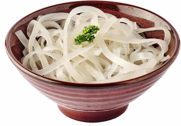
紅蕃薯粉 (60克/ 120克) Sweet Potato Noodle (60g/ 120g) 2 / 4