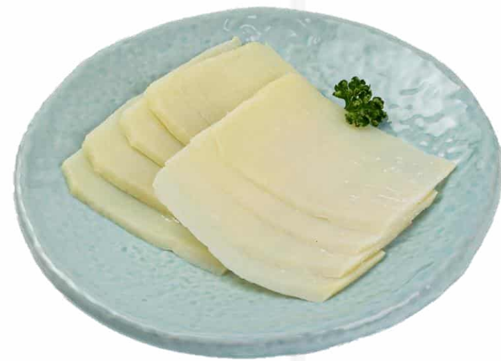
竹筍 (40克/ 80克) Bamboo Shoot (40g/ 80g) 5 / 10