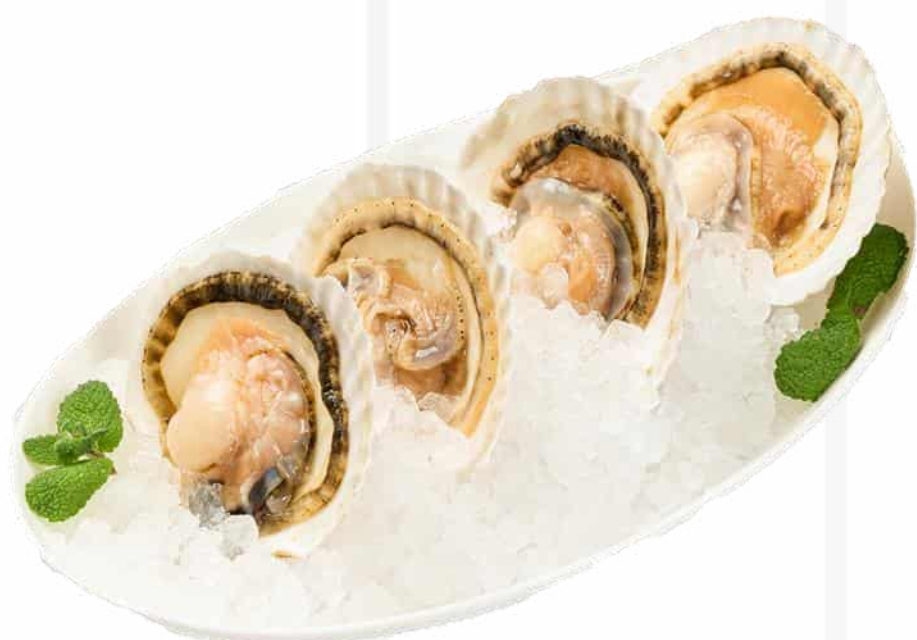
扇貝 (500克) Scallop (500g) 36