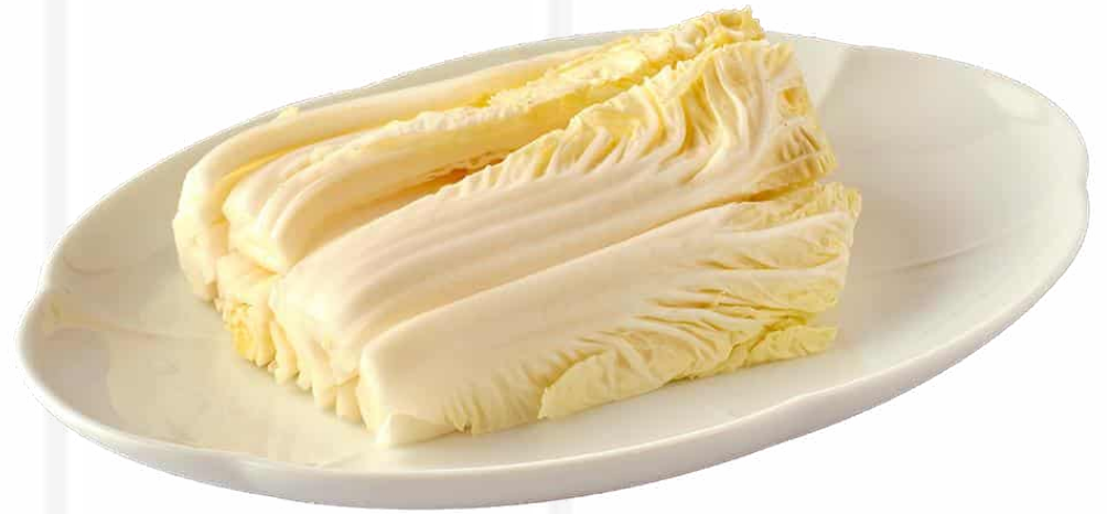
大白菜 (50克/ 100克) Chinese Cabbage (50g/ 100g) 4 / 8