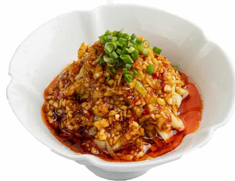
蒜蓉拌茄子 Tossed Eggplant, Garlic