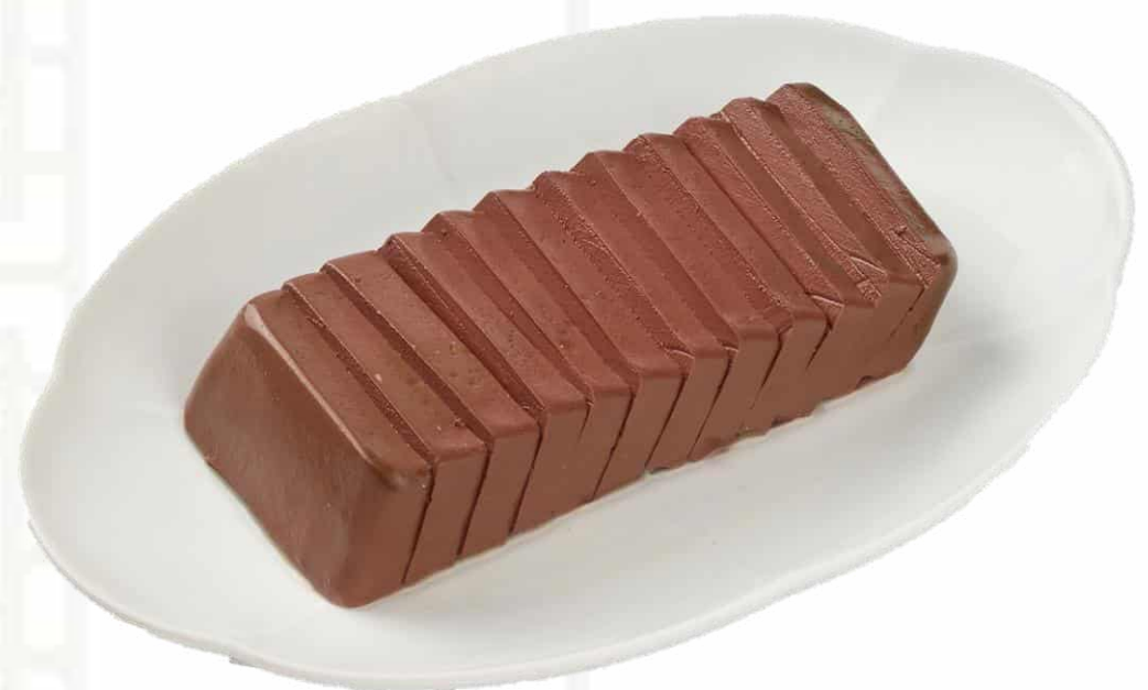
鴨血 (6片/ 12片) Duck Blood (6 pcs/ 12 pcs) 8 / 16