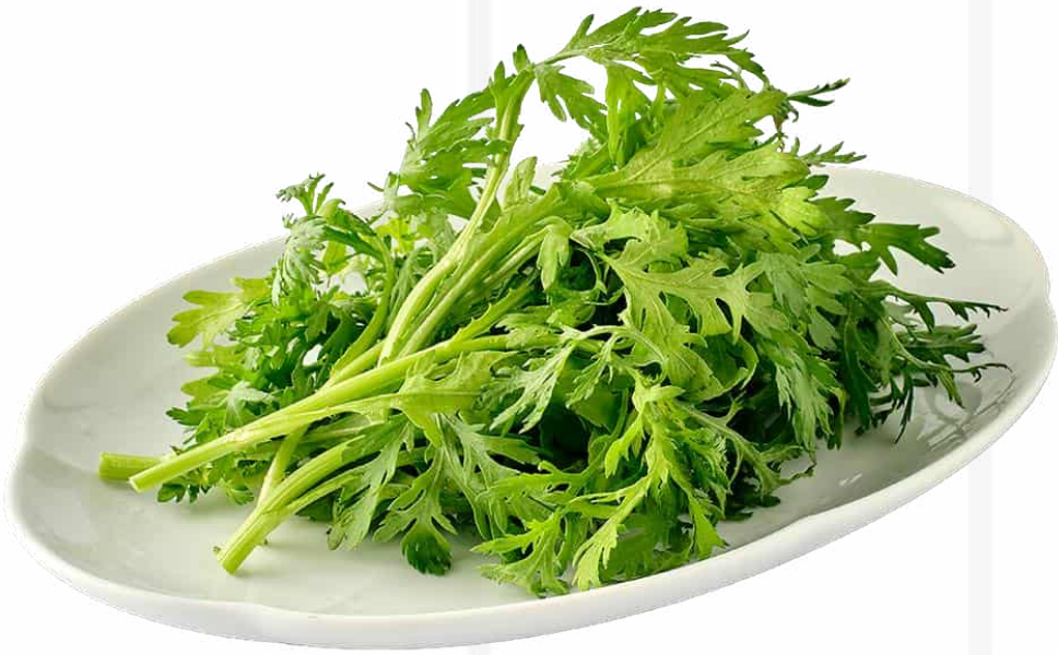
茼蒿菜 (30克/ 60克) Garland Chrysanthemum (30g/ 60g) 6 / 12