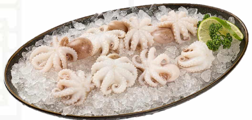
小章魚 (4件/8件) Octopus (4 pcs/ 8 pcs) 8 / 16