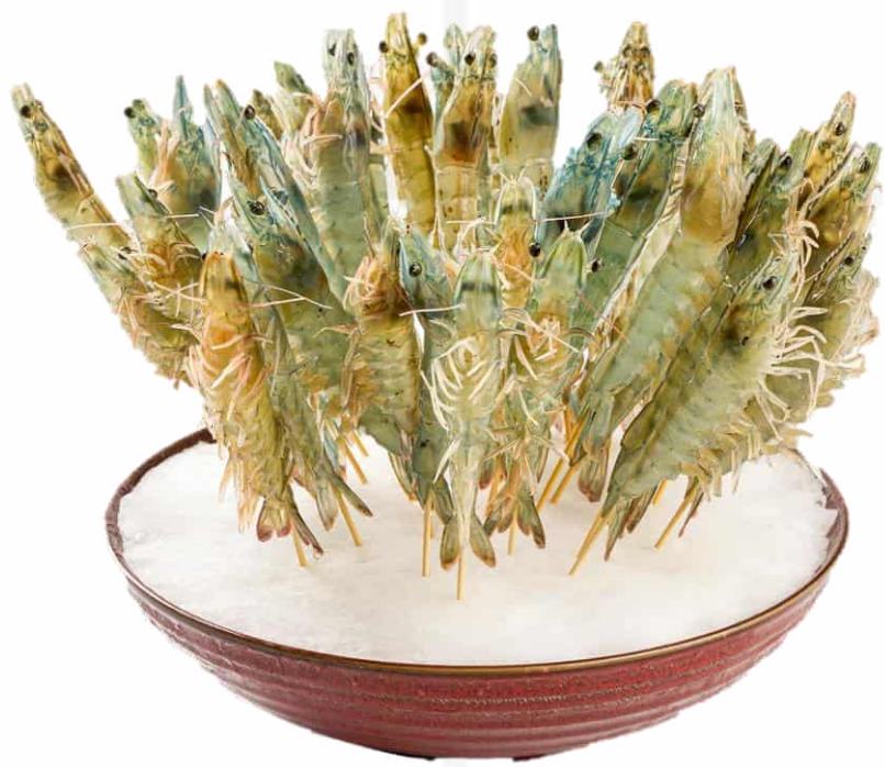
活蝦 (500克/ 1 公斤) Live Shrimp (500g/ 1KG) 58 / 116