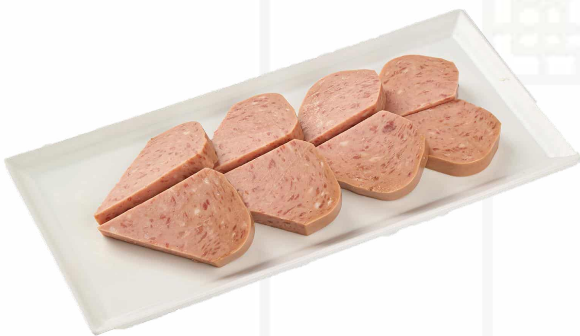
午餐肉 (4片/ 8片) Luncheon Meat (4 pcs/ 8 pcs) 6 / 12