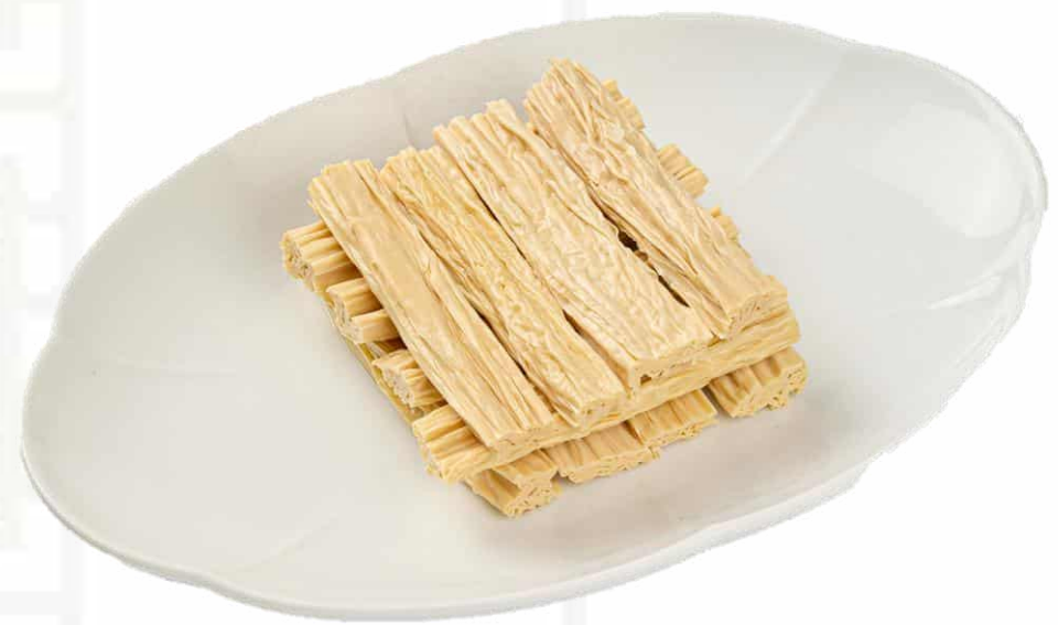
腐竹 (6片/ 12片) Dried Bean Curd Skin (6 pcs/ 12 pcs) 6 / 12