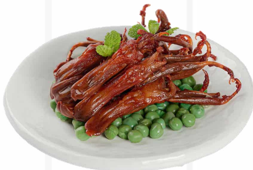
麻辣鴨舌 Braised Spiced Duck Tongue