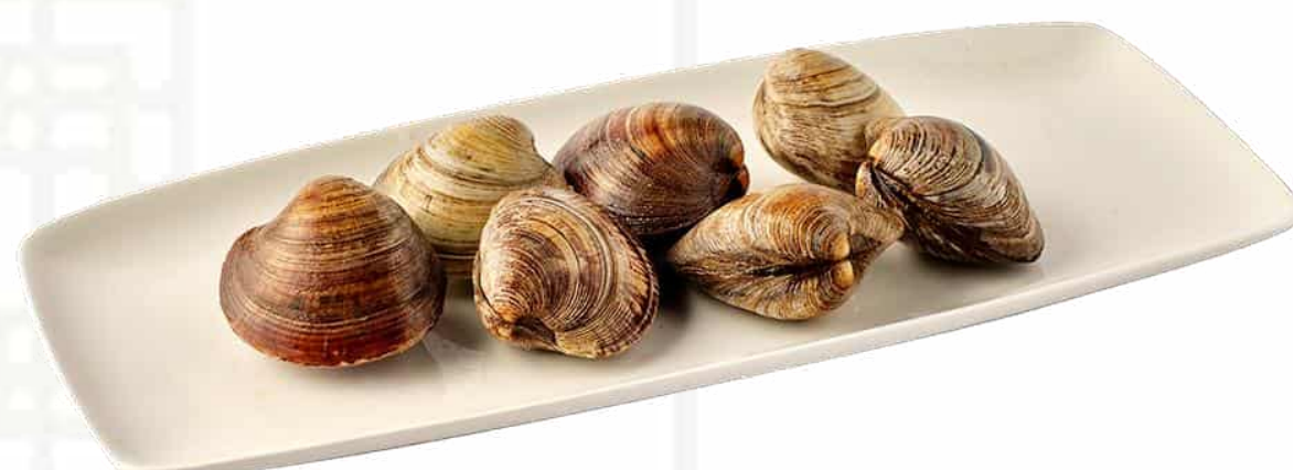
蛤蜊 (500克) Clam (500g) 40

價格均以韓元1,000結尾為單位計算，並已包含10%稅費及10%服務費 Prices are in Korean Won at 1,000 value and include 10% tax and 10% service charge