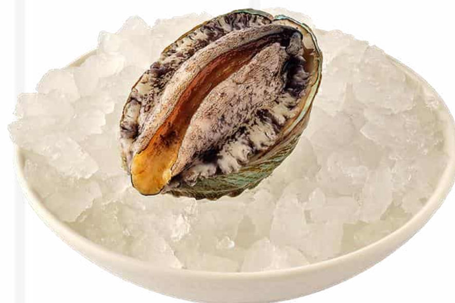
鮮鮑魚 (1隻) Abalone (1 pcs) 14