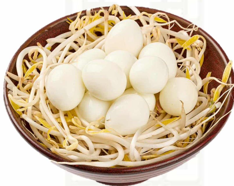
鵪鶉蛋 (6顆/ 12顆) Quail Egg (6 pcs/ 12 pcs) 3 / 6