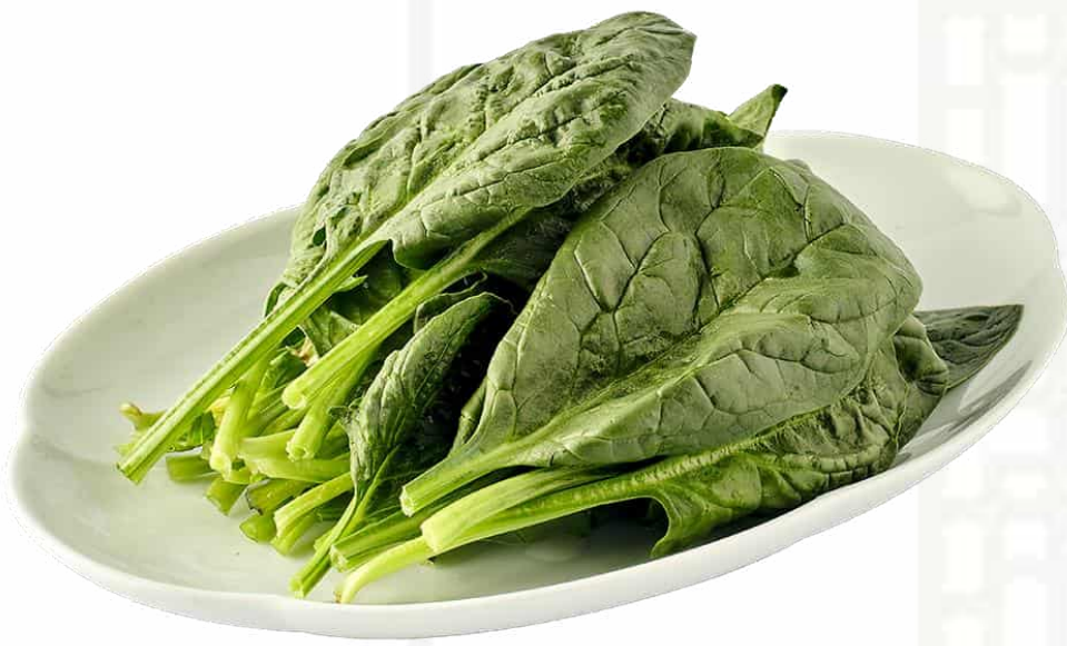
菠菜 (30克/ 60克) Spinach (30g/ 60g) 4 / 8