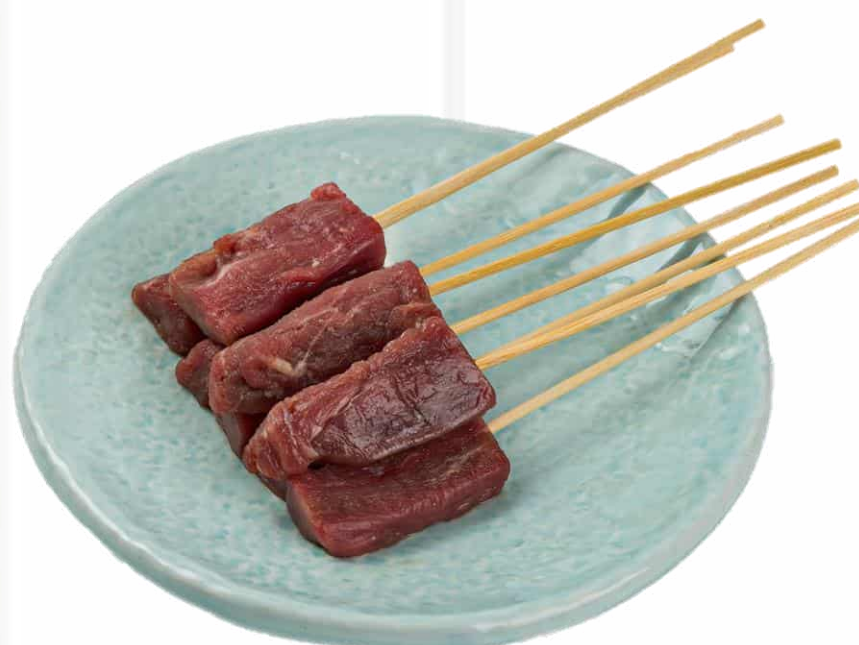
羊里脊肉 (60克/ 100克) Lamb Tenderloin (60g/ 100g) 11 / 22