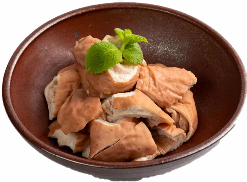
豬大腸 (50克/ 100克) Pork Intestine (50g/ 100g) 5 / 10