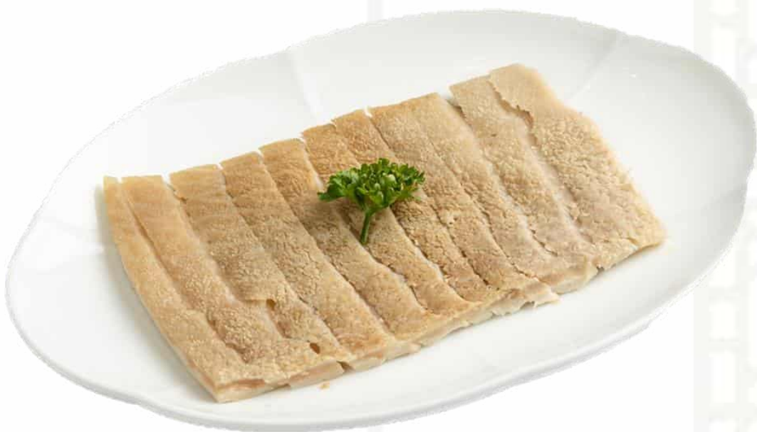
金錢肚 (50克/ 100克) Beef Tripe (50g/ 100g) 6 / 12