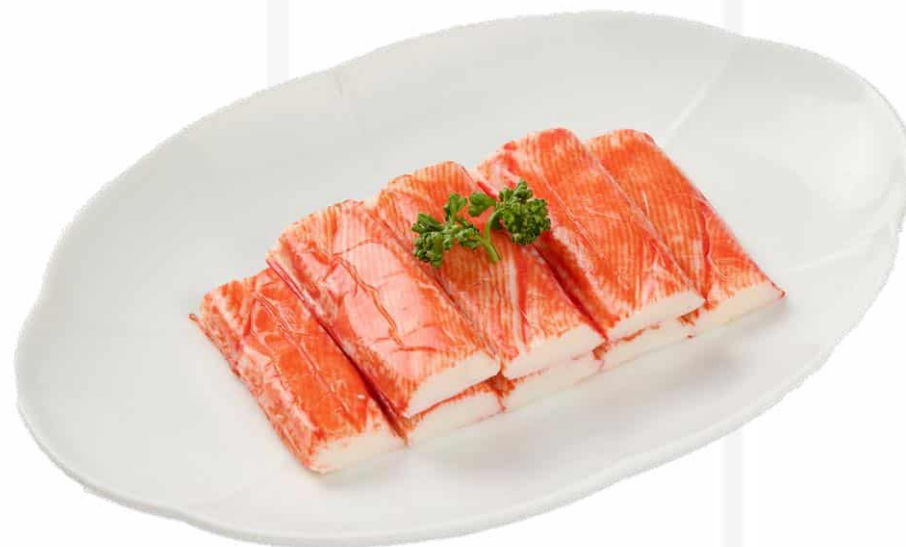
蟹柳 (4片/ 8片)