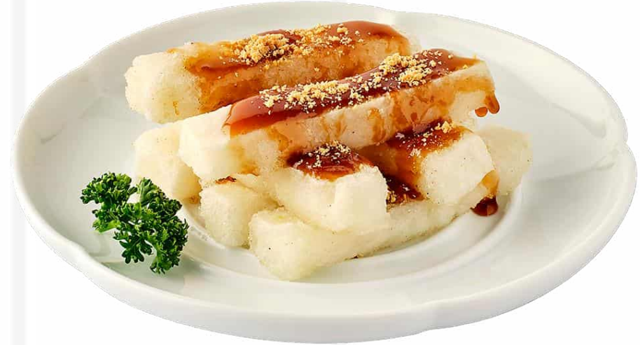
糯米糍粑 Golden Fried Traditional Glutinous Rice Cake 8