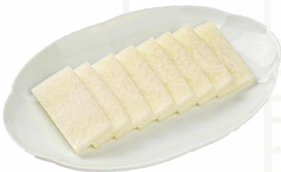
白蘿蔔 (4片/ 8片) White Radish (4 pcs/ 8 pcs) 4 / 8