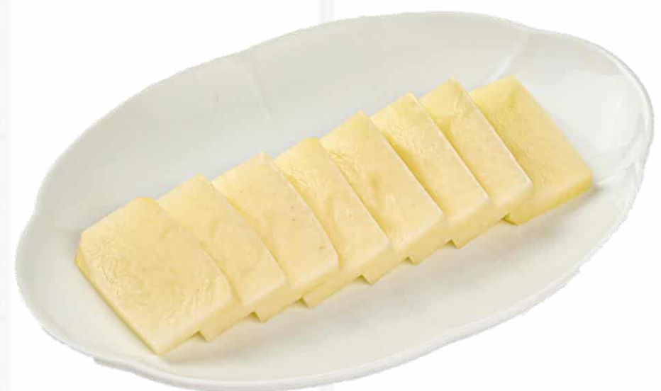
馬鈴薯 (4片/ 8片) Potato (4 pcs/ 8 pcs) 4 / 8