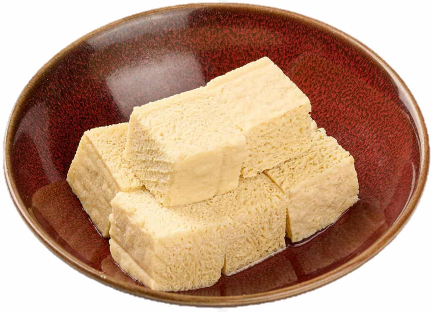
凍豆腐 (4片/ 8片) Frozen Tofu (4 pcs/ 8 pcs) 6 / 12