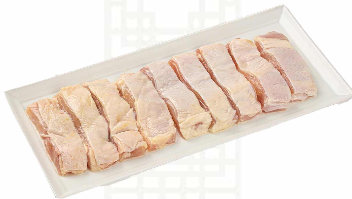
雞腿肉 (80克/ 160克)