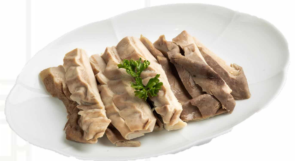
豬肚 (80克/ 160克) Pork Tripe (80g/ 160g) 6 / 12