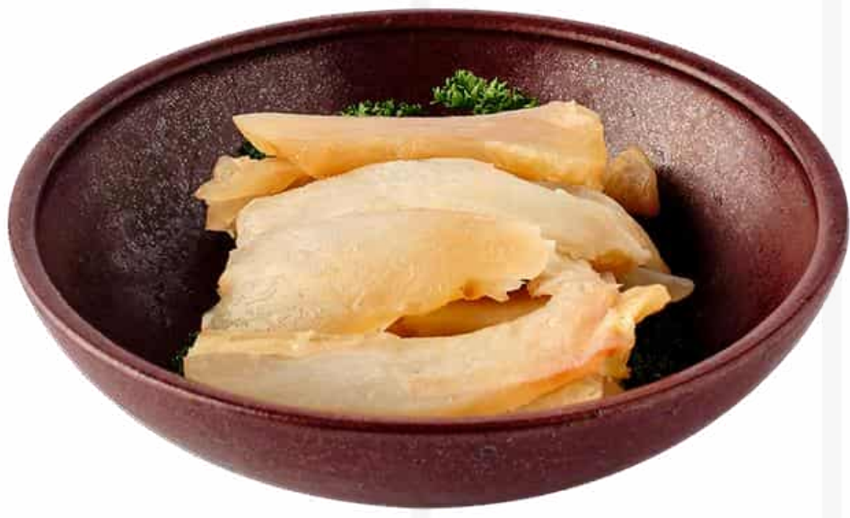
牛筋 (60克/ 120克) Beef Tendon (60g/ 120g) 3 / 6