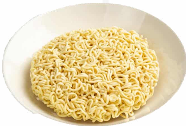
泡麵 Instant Noodle 5