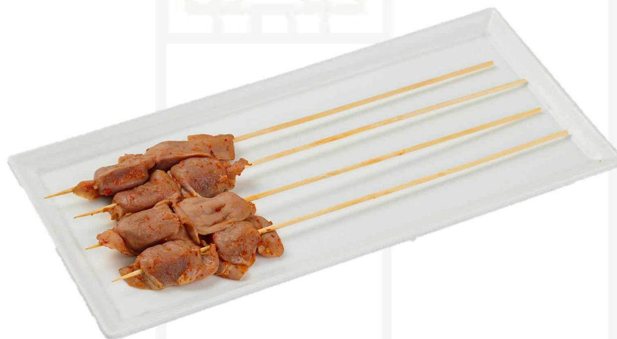
雞胗 (60克/ 120克)