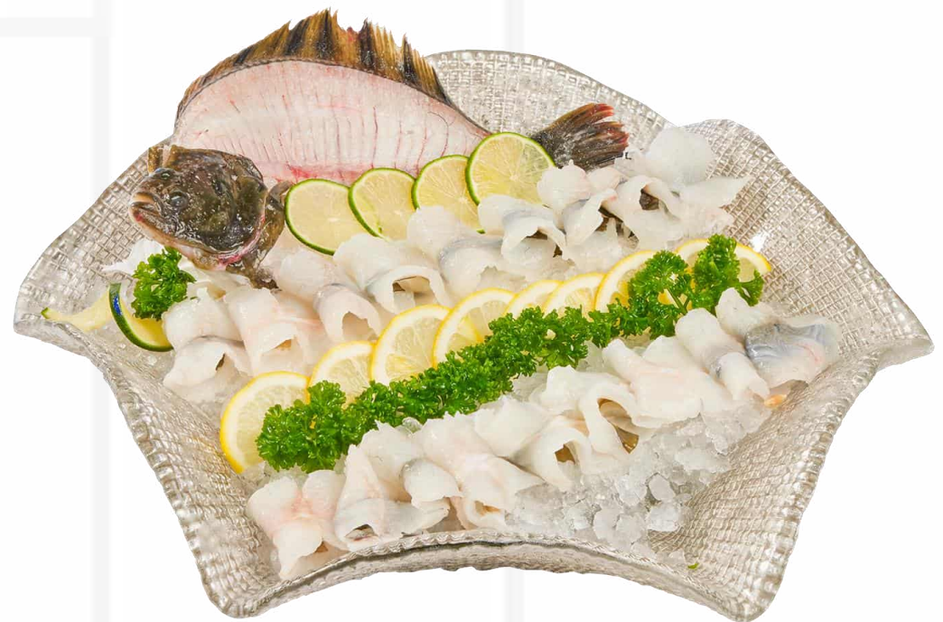
多寶魚 (每條) Turbot (whole piece) 65

價格均以韓元1,000結尾為單位計算，並已包含10%稅費及10%服務費 Prices are in Korean Won at 1,000 value and include 10% tax and 10% service charge