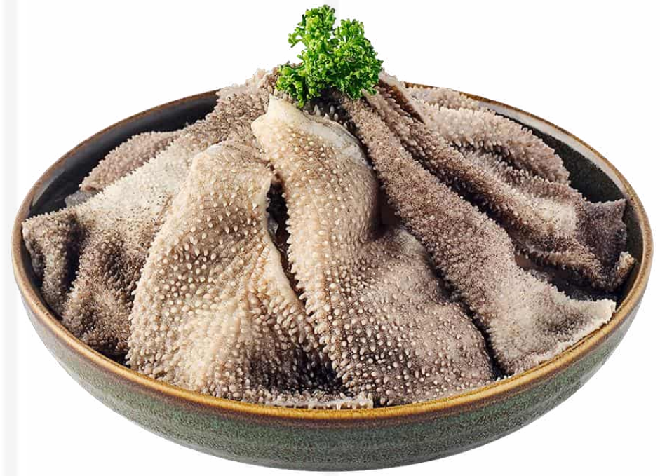
鮮毛肚 (50克/ 100克) “Mao Du” Beef Tripe (50g/ 100g) 5 / 10