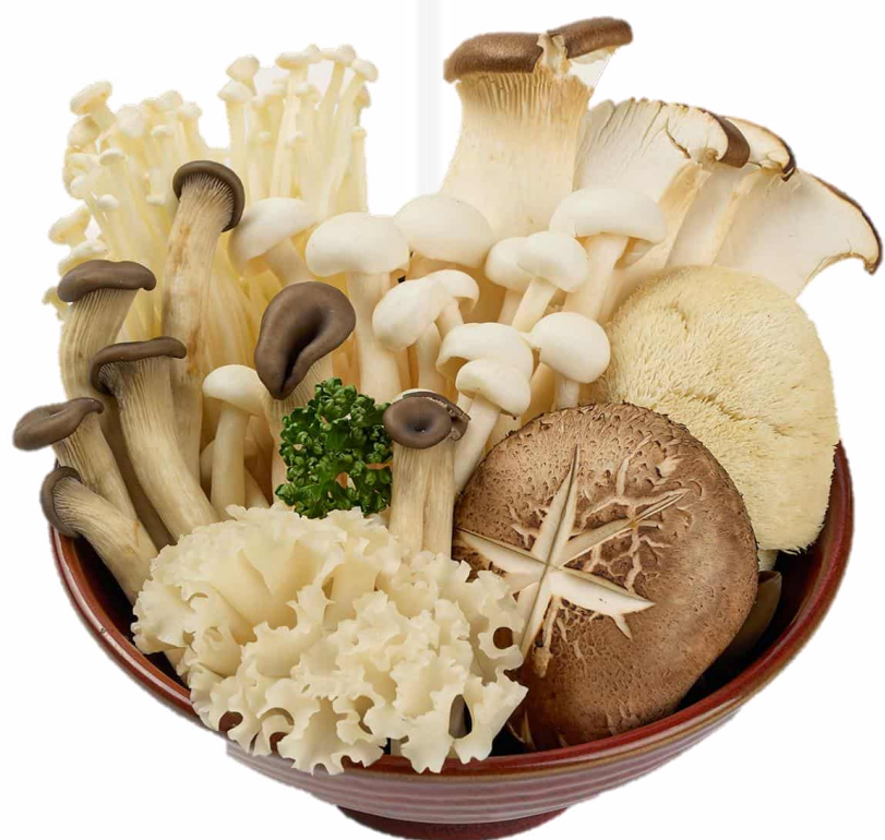
菌菇拼盘 (100克/ 200克) Assorted Fresh Mushroom (100g/ 200g) 10 / 20