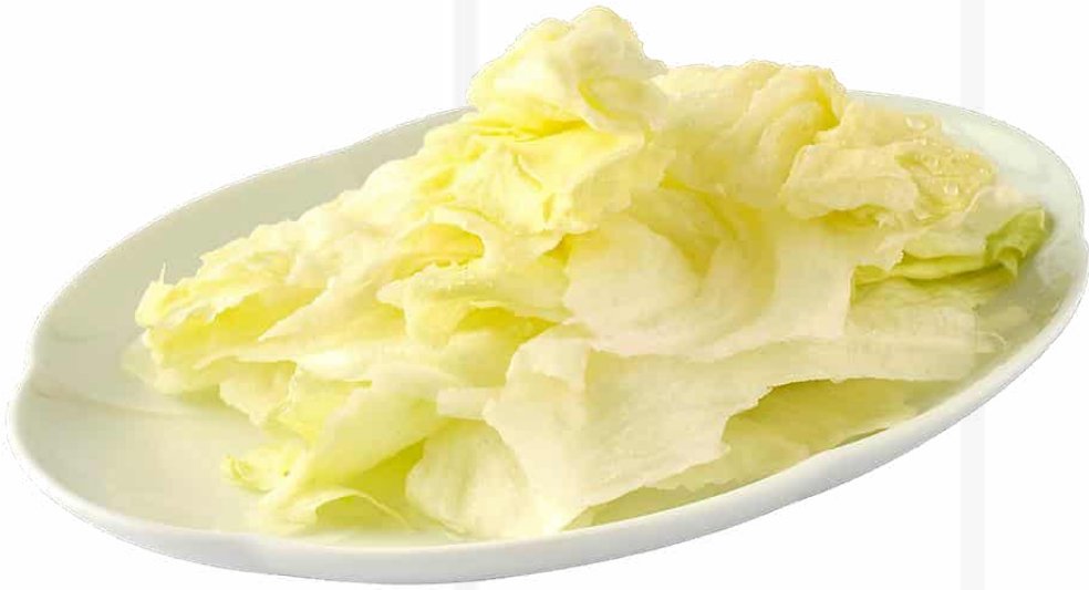
生菜 (60克/ 120克) Lettuce (60g/ 120g) 6 / 12