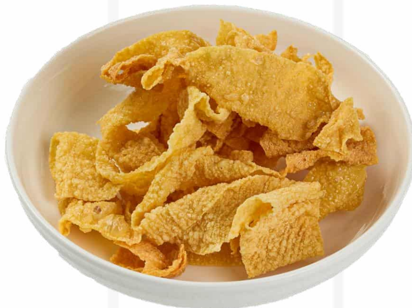
炸腐竹 (15克/ 30克) Fried Tofu Skin (15g/ 30g) 3 / 6

價格均以韓元1,000結尾為單位計算，並已包含10%稅費及10%服務費 Prices are in Korean Won at 1,000 value and include 10% tax and 10% service charge