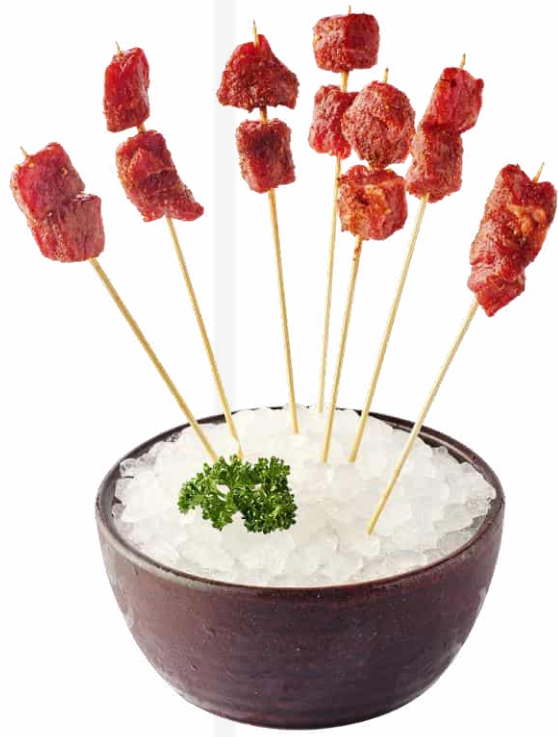
腌製牛肉粒 (50克/ 100克) Marinated Beef Cube (50g/ 100g) 11 / 22