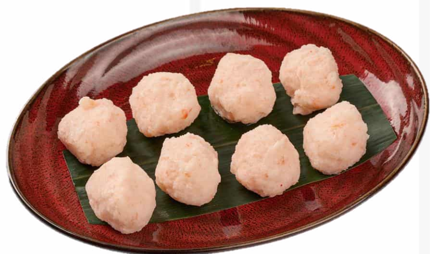
鮮蝦滑 (4粒/ 8粒)