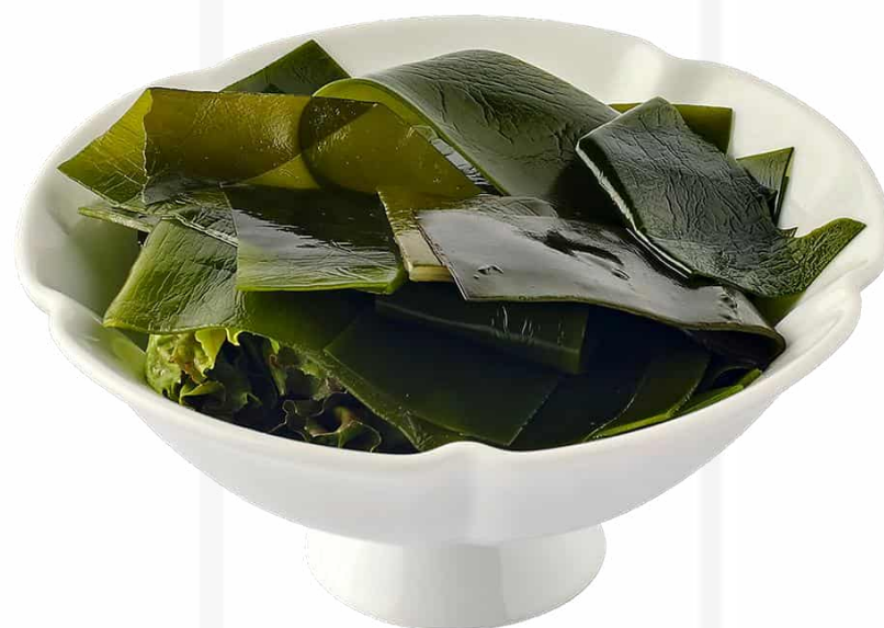
海帶 (50克/ 100克) Kombu Seaweed (50g/ 100g) 2 / 4

價格均以韓元1,000結尾為單位計算，並已包含10%稅費及10%服務費 Prices are in Korean Won at 1,000 value and include 10% tax and 10% service charge