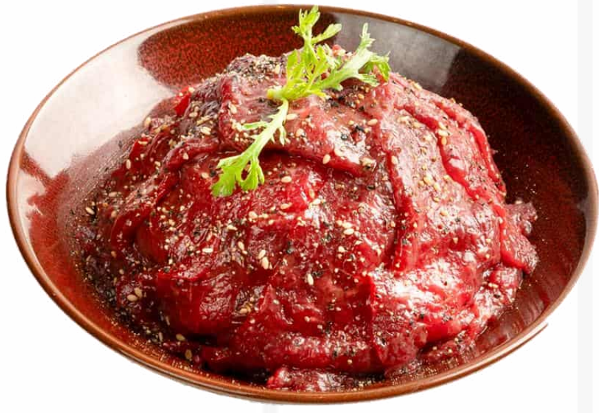
腌製滑牛肉 (60克/ 120克) Marinated Sliced Beef (60g/ 120g) 8 / 16