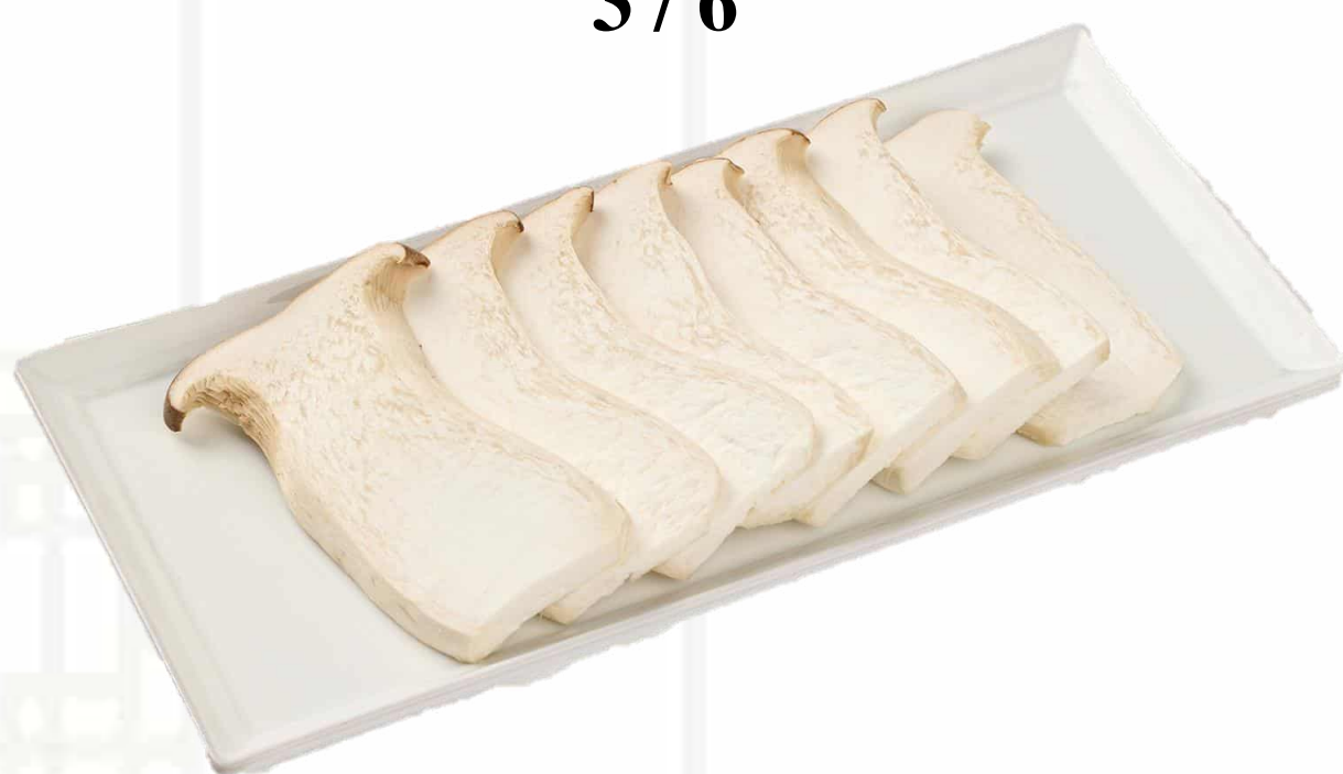
杏鮑菇 (4片/ 8片) King Oyster Mushroom (4 pcs/ 8 pcs) 3 / 6