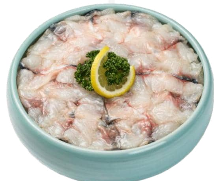
鰻魚片 (50克/ 100克) Sliced Eel (50g/ 100g) 11 / 22

價格均以韓元1,000結尾為單位計算，並已包含10%稅費及10%服務費 Prices are in Korean Won at 1,000 value and include 10% tax and 10% service charge