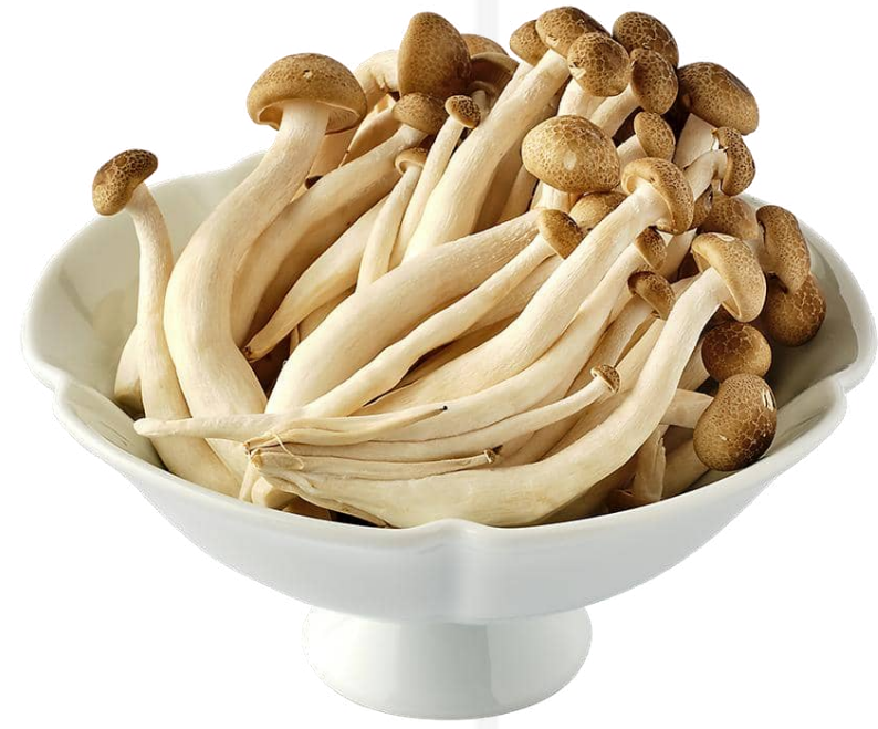
白玉菇 (30克/ 60克) White Beech Mushroom (30g/ 60g) 3 / 6