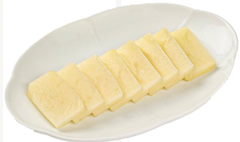
馬鈴薯 (4片/ 8片) Potato (4 pcs/ 8 pcs) 4 / 8