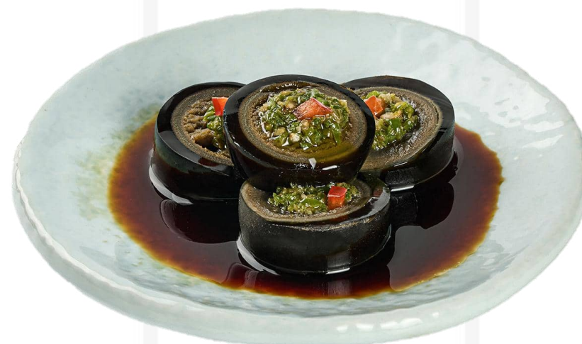
辣汁燒椒皮蛋 Tossed Century Egg with Pepper Sauce 6

價格均以韓元1,000結尾為單位計算，並已包含10%稅費及10%服務費 Prices are in Korean Won at 1,000 value and include 10% tax and 10% service charge