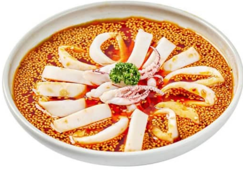
紅油鮮魷魚 Marinated Squid with Chili Oil 16