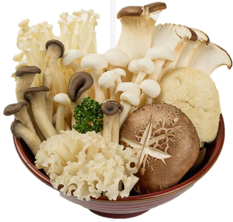
菌菇拼盘 (100克/ 200克) Assorted Fresh Mushroom (100g/ 200g) 10 / 20