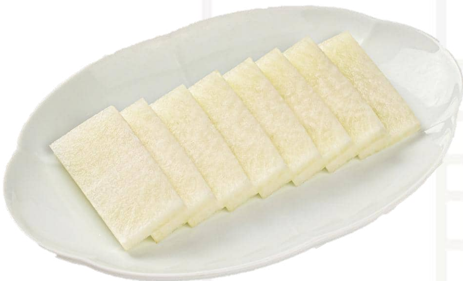
白蘿蔔 (4片/ 8片) White Radish (4 pcs/ 8 pcs) 4 / 8