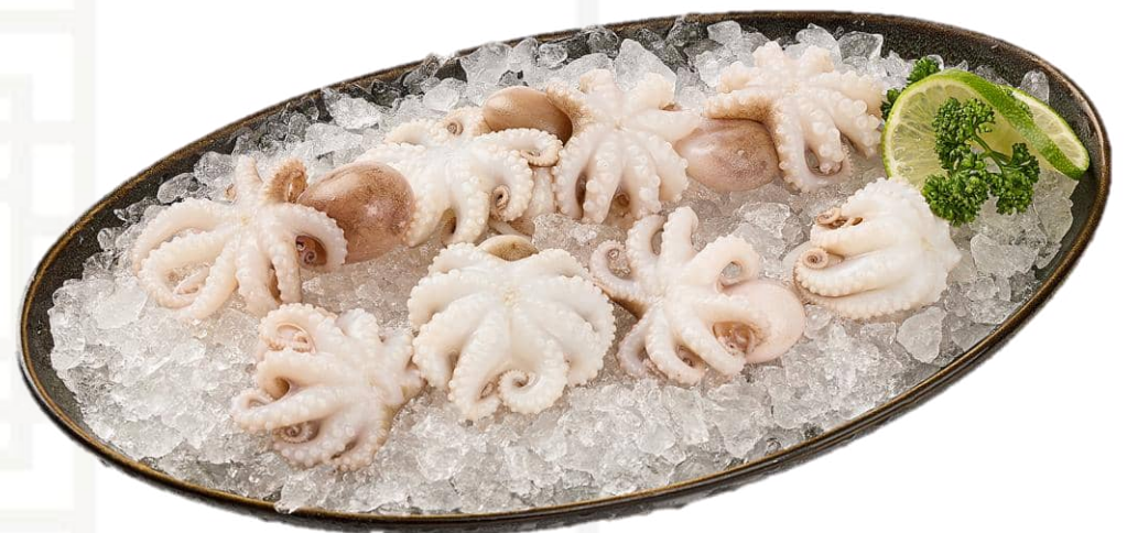
小章魚 (4件/8件) Octopus (4 pcs/ 8 pcs) 8 / 16