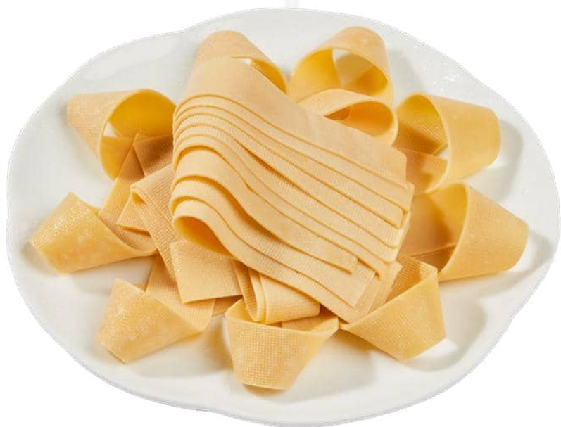
干豆腐皮(50克/ 100克) Tofu Skin (50g/ 100g) 3 / 6