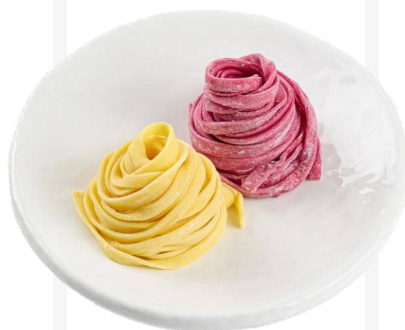
兩色麵拼盤 (30克) Assorted Noodles (30g) 5

價格均以韓元1,000結尾為單位計算，並已包含10%稅費及10%服務費 Prices are in Korean Won at 1,000 value and include 10% tax and 10% service charge