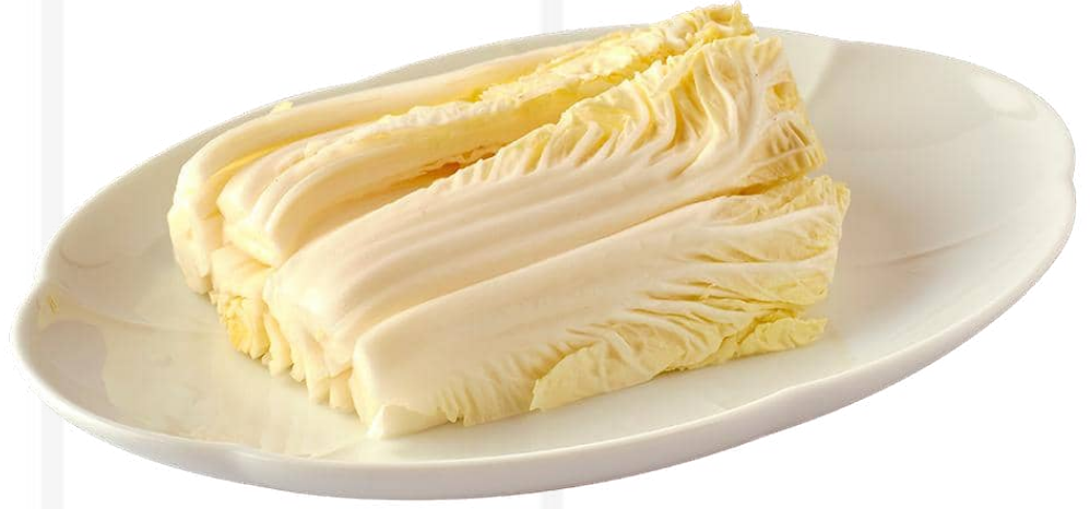
大白菜 (50克/ 100克) Chinese Cabbage (50g/ 100g) 4 / 8