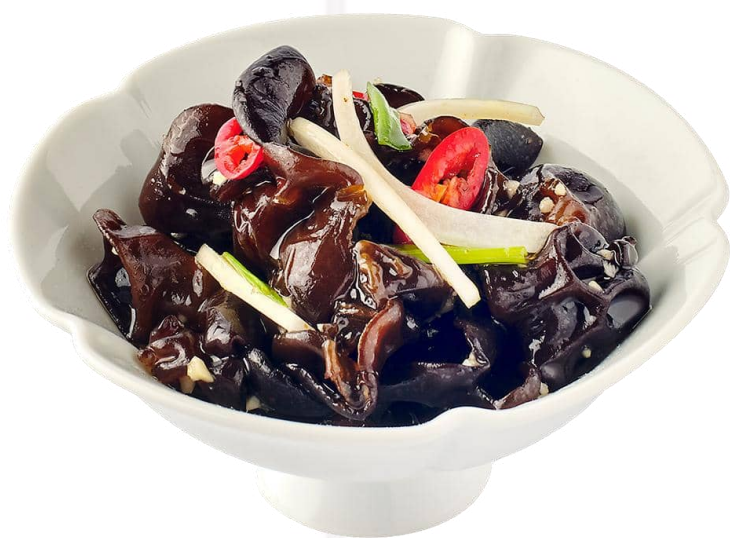
蔥油拌木耳 Marinated Black Fungus with Onion Oil