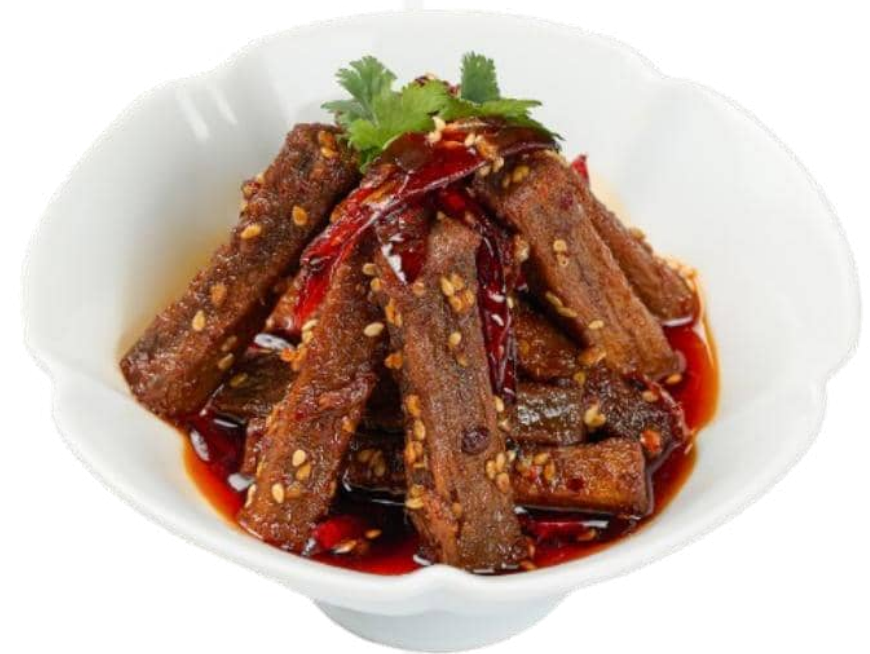
麻辣牛肉條 Spicy Beef Strips 13