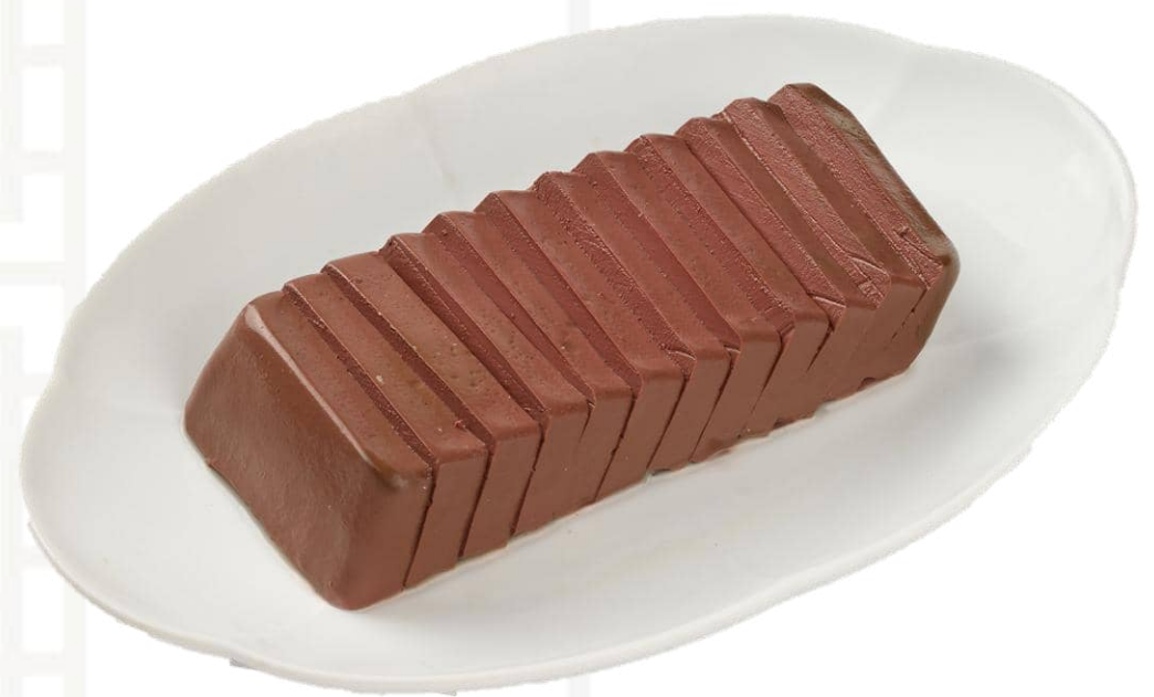
鴨血 (6片/ 12片) Duck Blood (6 pcs/ 12 pcs) 8 / 16