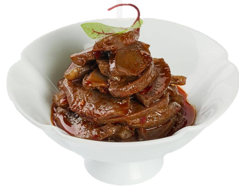
蒜香辣鴨珍 Spicy Garlic Duck Gizzards 6