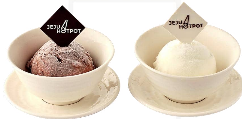
自製雪糕 Homemade Ice Cream 8 / 單球 Single 12 / 雙球 Double

價格均以韓元1,000結尾為單位計算，並已包含10%稅費及10%服務費 Prices are in Korean Won at 1,000 value and include 10% tax and 10% service charge