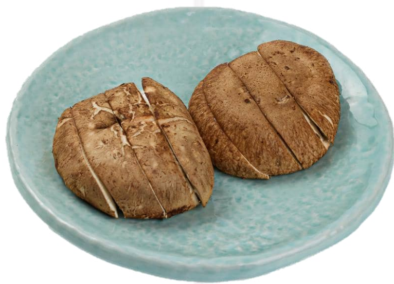
鮮冬菇 (30克/ 60克) Shiitake Mushroom (30g/ 60g) 3 / 6