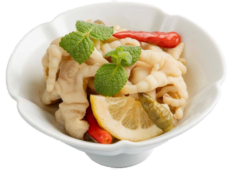
泡椒無骨鳳爪 Pickled Pepper Boneless Chicken Feet