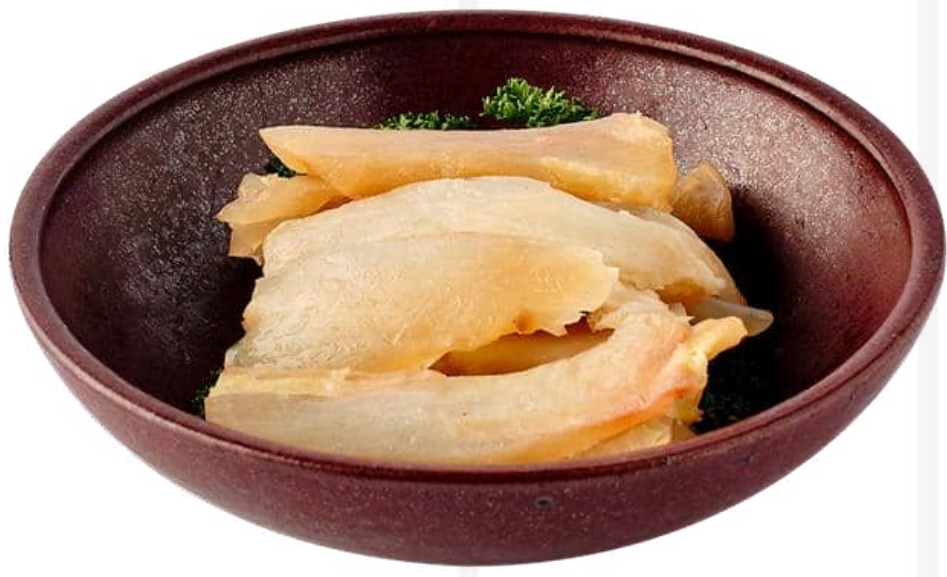
牛筋 (60克/ 120克) Beef Tendon (60g/ 120g) 3 / 6