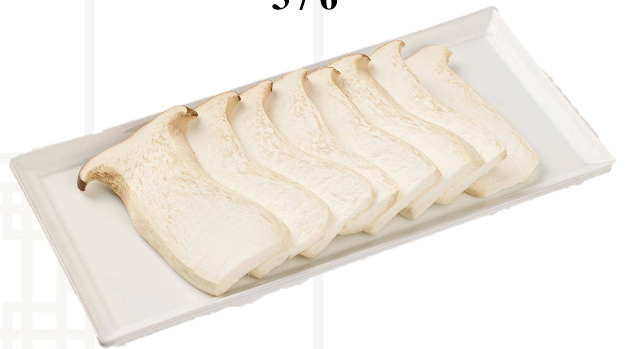
杏鮑菇 (4片/ 8片) King Oyster Mushroom (4 pcs/ 8 pcs) 3 / 6