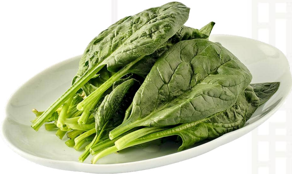
菠菜 (30克/ 60克) Spinach (30g/ 60g) 4 / 8