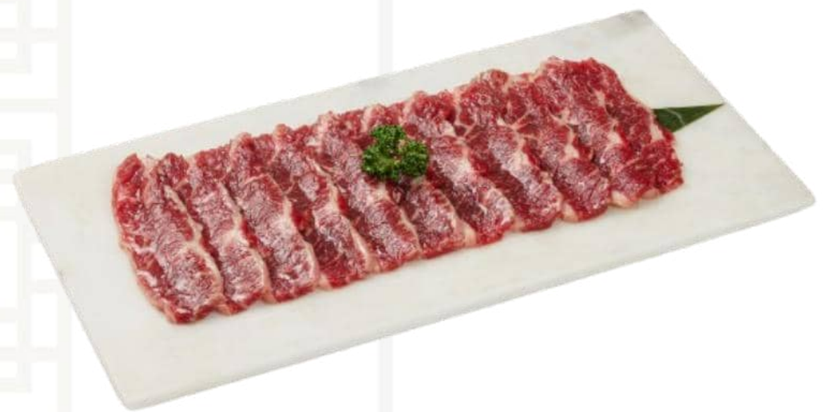
手切牛肋肉 (100克) Hand Cut Beef Rib (100g) 25