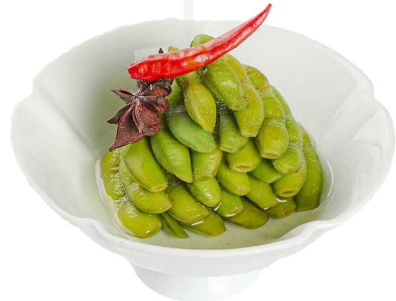
鹽水毛豆 Salted Boiled Edamame