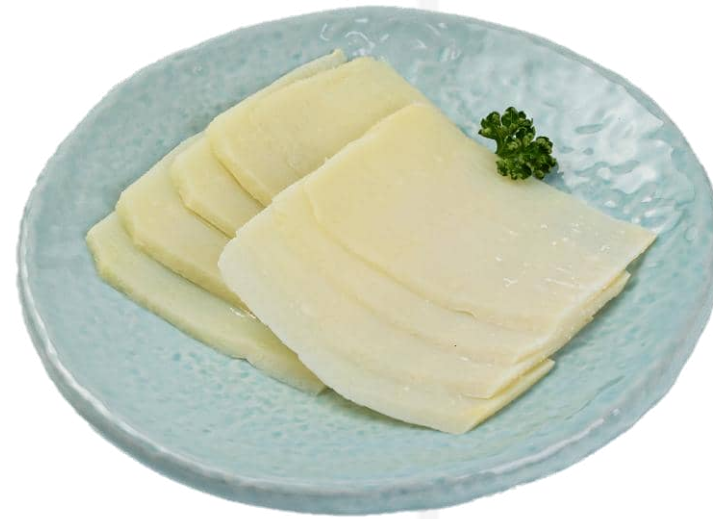
竹筍 (40克/ 80克) Bamboo Shoot (40g/ 80g) 5 / 10