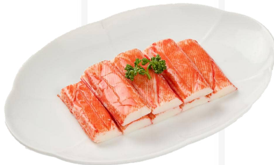
蟹柳 (4片/ 8片)