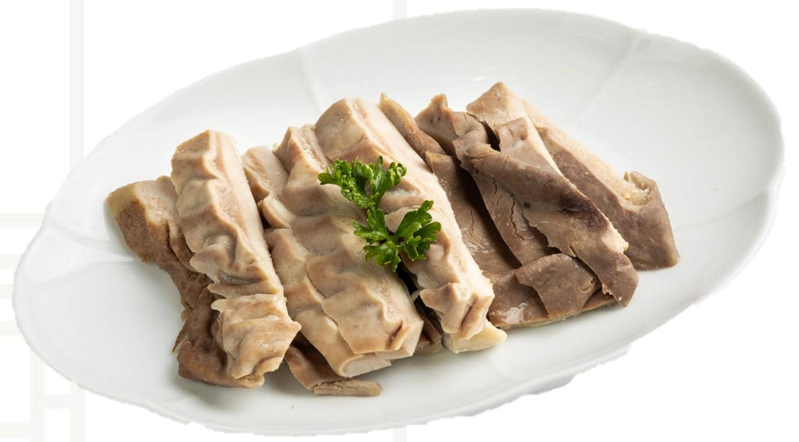
豬肚 (80克/ 160克) Pork Tripe (80g/ 160g) 6 / 12