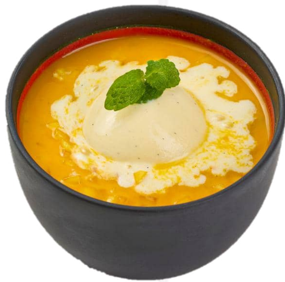
楊枝甘露配雪糕 Chilled Mango Cream, Sago, Ice Cream 13