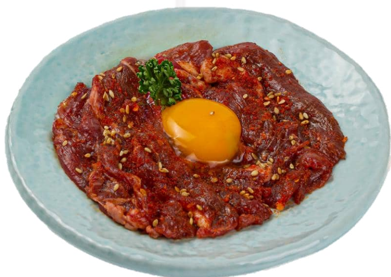
腌製麻辣羊肩肉 (60克/ 100克) Marinated Spicy Sliced Lamb Shoulder (60g/ 100g) 10 / 20