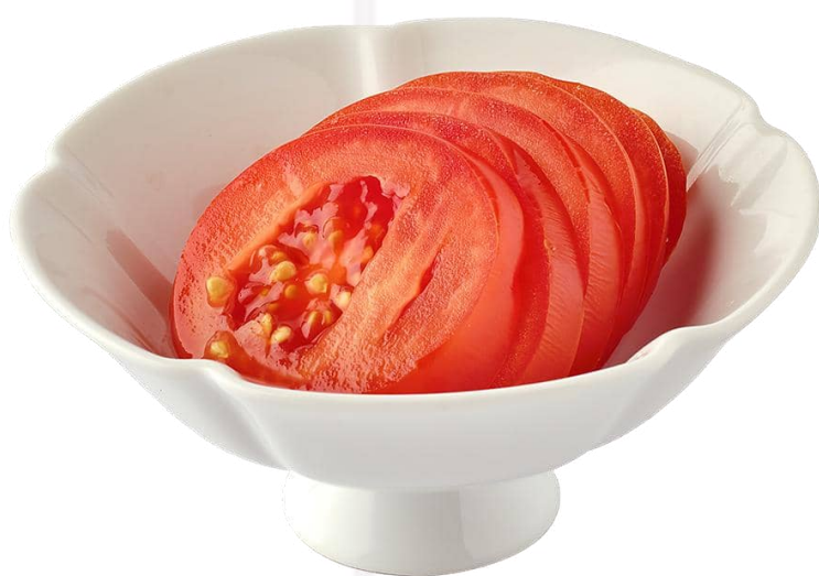
蕃茄 (60克/ 120克) Tomato (60g/ 120g) 2 / 4