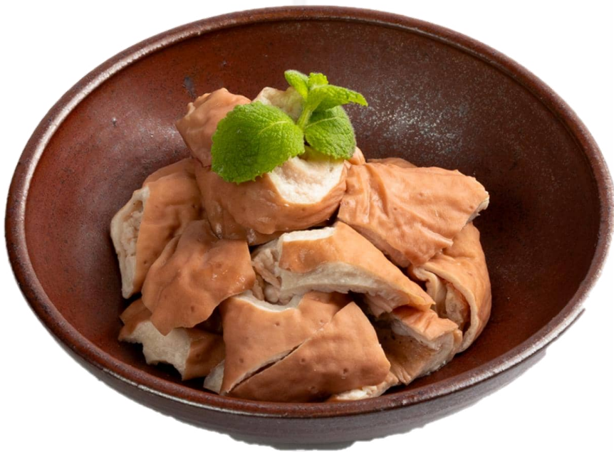
豬大腸 (50克/ 100克) Pork Intestine (50g/ 100g) 5 / 10