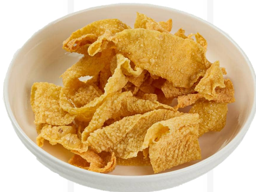
炸腐竹 (15克/ 30克) Fried Tofu Skin (15g/ 30g) 3 / 6

價格均以韓元1,000結尾為單位計算，並已包含10%稅費及10%服務費 Prices are in Korean Won at 1,000 value and include 10% tax and 10% service charge