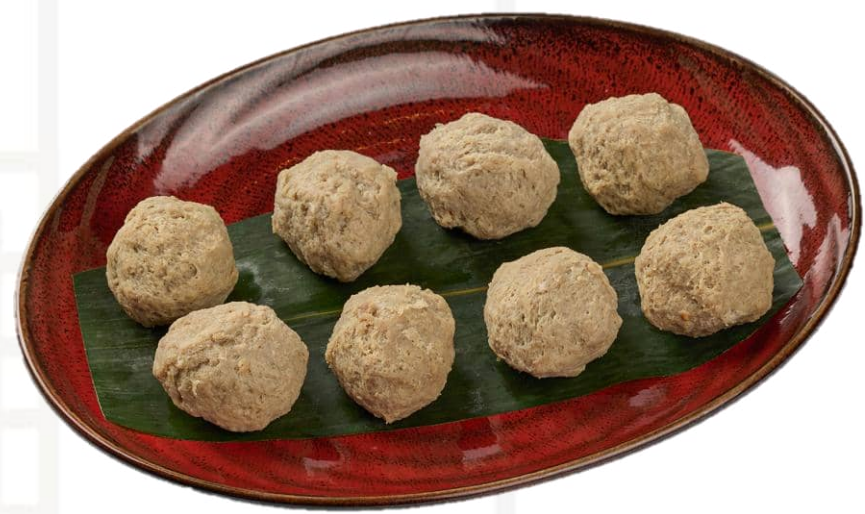
牛肉丸 (4粒/ 8粒)