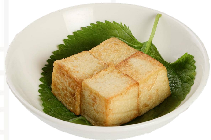
手工魚豆腐 (4件/ 8件) Handmade Fish Tofu (4 pcs/ 8 pcs) 3 / 6