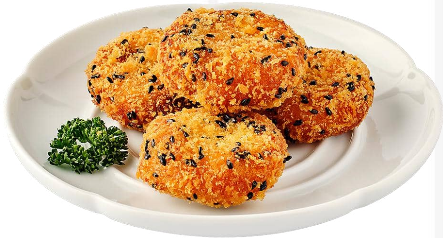
香煎南瓜餅 (4件) Pan Fried Pumpkin Cake (4 pcs) 8