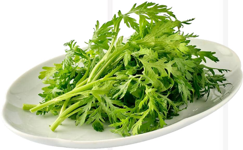
茼蒿菜 (30克/ 60克) Garland Chrysanthemum (30g/ 60g) 6 / 12