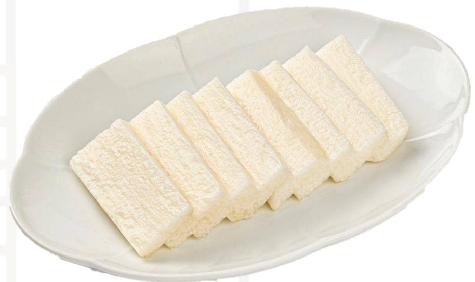
山藥 (4片/ 8片) Chinese Yam (4 pcs/ 8 pcs) 8 / 16