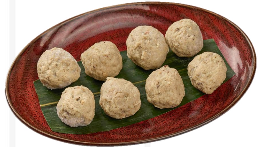
香菇豬肉丸 (4粒/ 8粒)

Pork Meatball, Shiitake Mushroom (4 pcs/ 8 pcs)