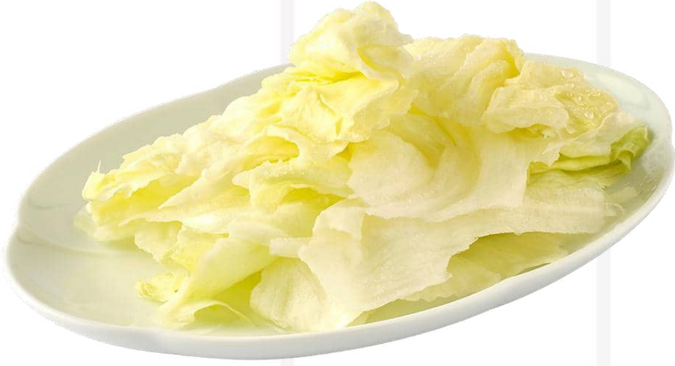
生菜 (60克/ 120克) Lettuce (60g/ 120g) 6 / 12