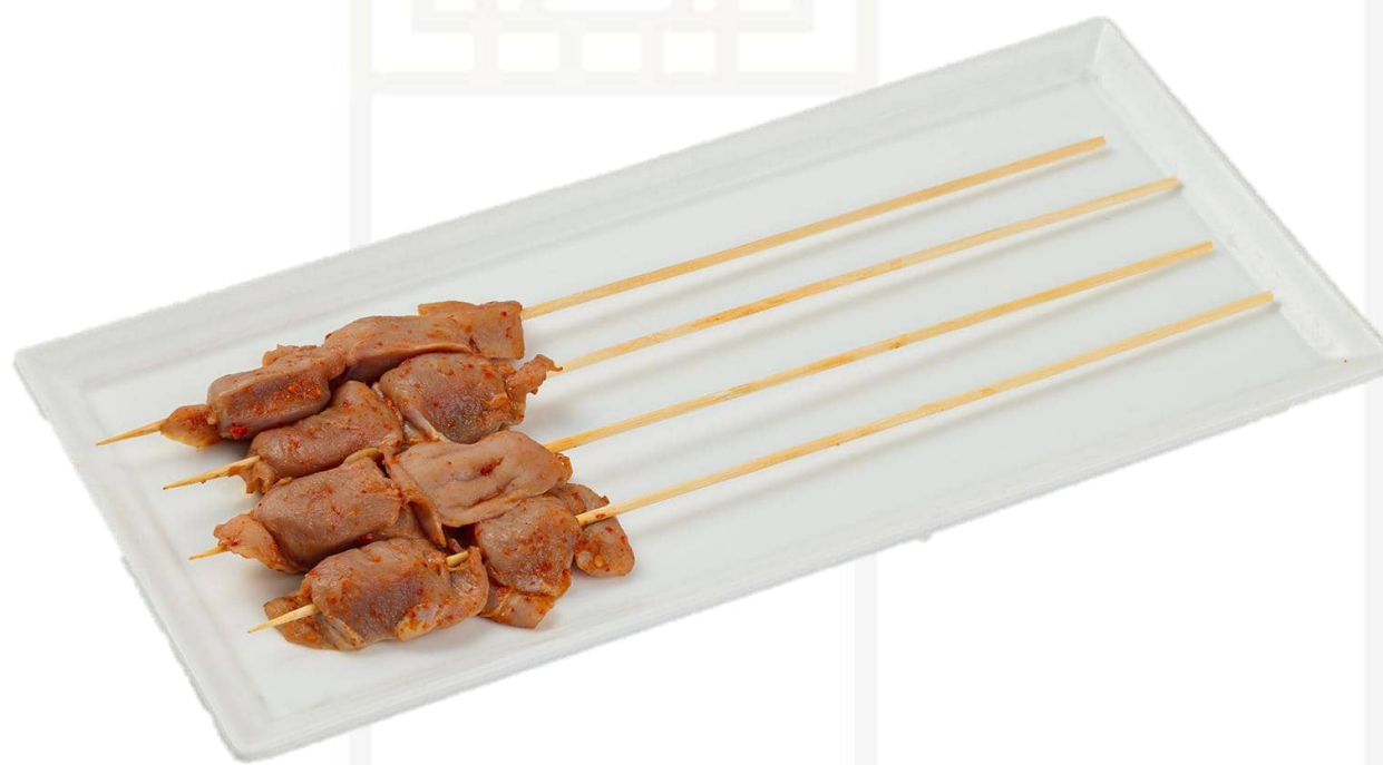
雞胗 (60克/ 120克)