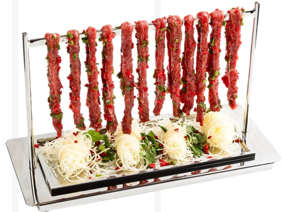
麻辣嫩牛肉絲 (80克/ 160克) Sichuan Pepper Beef (80g/ 160g) 16 / 32