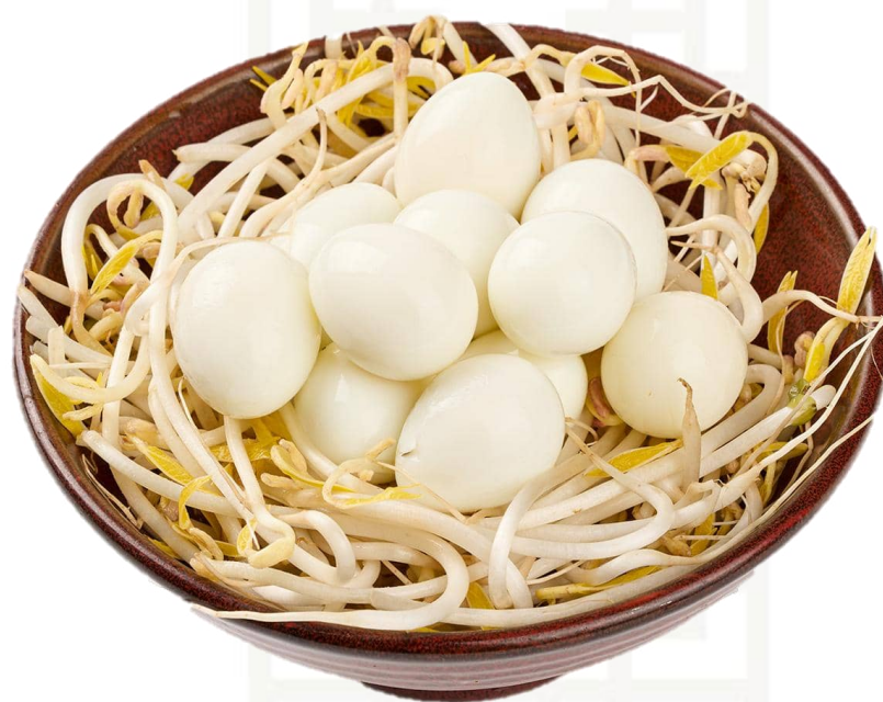
鵪鶉蛋 (6顆/ 12顆) Quail Egg (6 pcs/ 12 pcs) 3 / 6