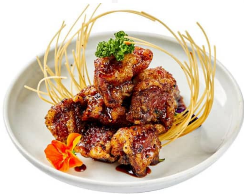
黑椒牛肉粒 Diced Beef with Black Pepper 13