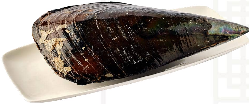
牛角貝 (公斤) Fresh Jumbo Clam (KG) 42