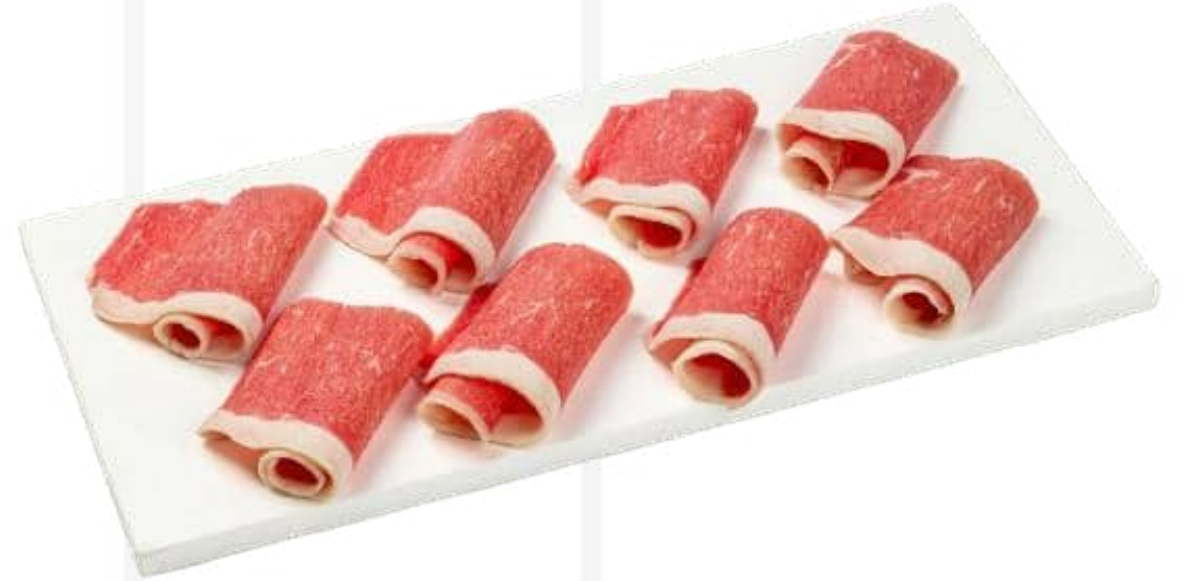
牛肉西冷 (80克/ 160克) Beef Striploin (80g/ 160g) 16 / 32