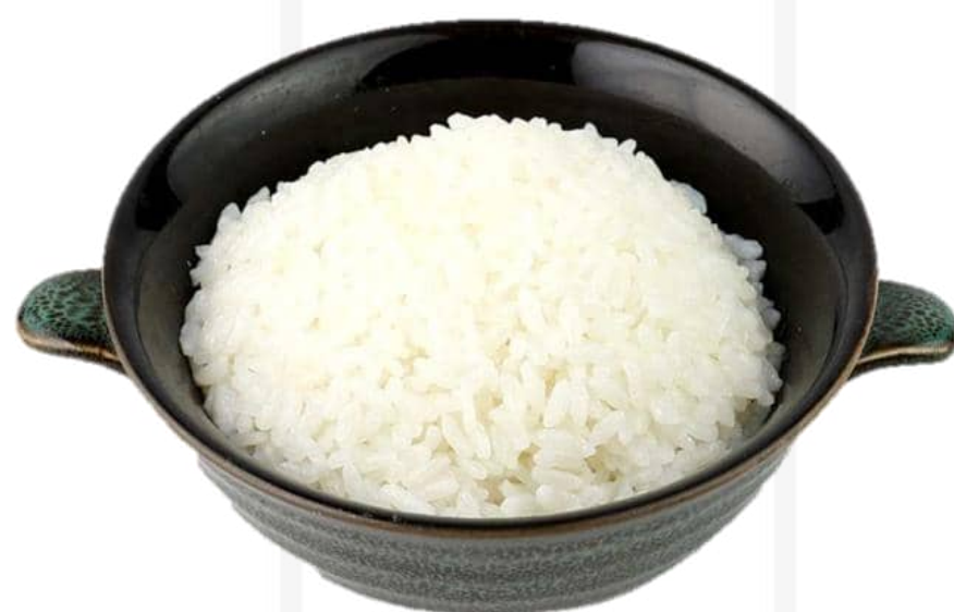
米飯 Steamed Rice 2

價格均以韓元1,000結尾為單位計算，並已包含10%稅費及10%服務費 Prices are in Korean Won at 1,000 value and include 10% tax and 10% service charge