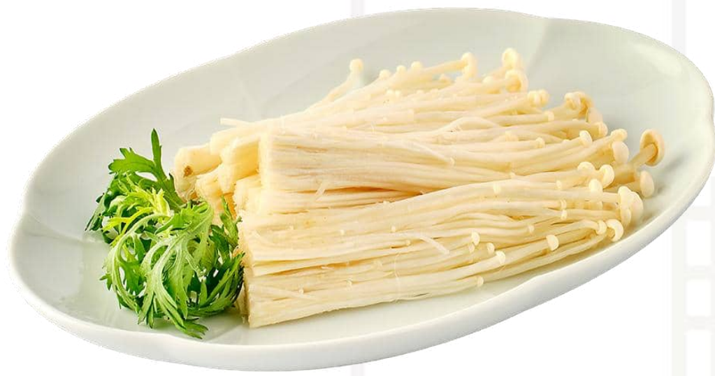
金針菇 (30克/ 60克) Enoki Mushroom (30g/ 60g) 3 / 6