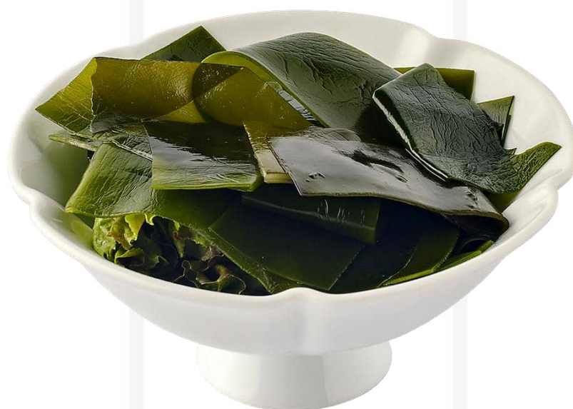
海帶 (50克/ 100克) Kombu Seaweed (50g/ 100g) 2 / 4

價格均以韓元1,000結尾為單位計算，並已包含10%稅費及10%服務費 Prices are in Korean Won at 1,000 value and include 10% tax and 10% service charge