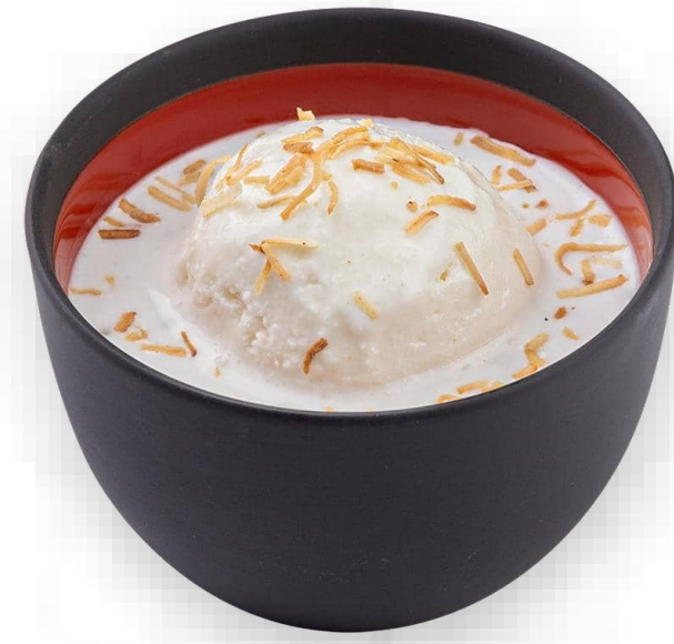
椰汁西米露配雪糕 Chilled Coconut Cream, Sago, Ice Cream 11