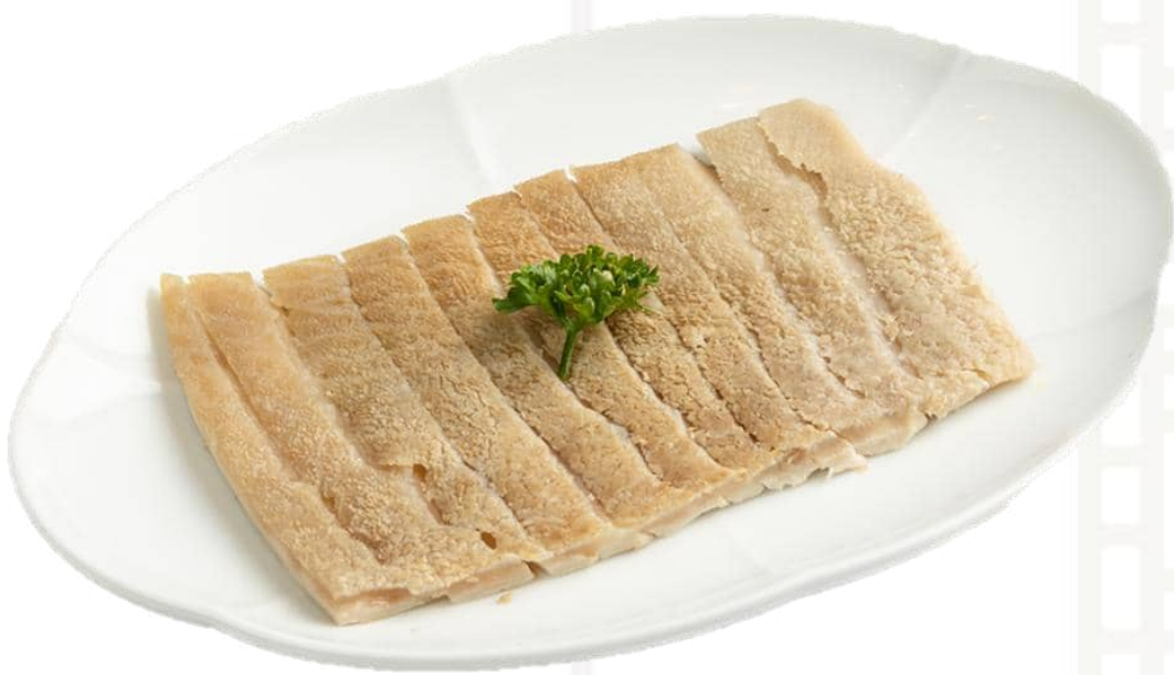
金錢肚 (50克/ 100克) Beef Tripe (50g/ 100g) 6 / 12