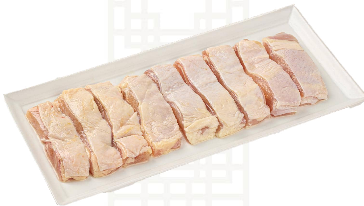
雞腿肉 (80克/ 160克)