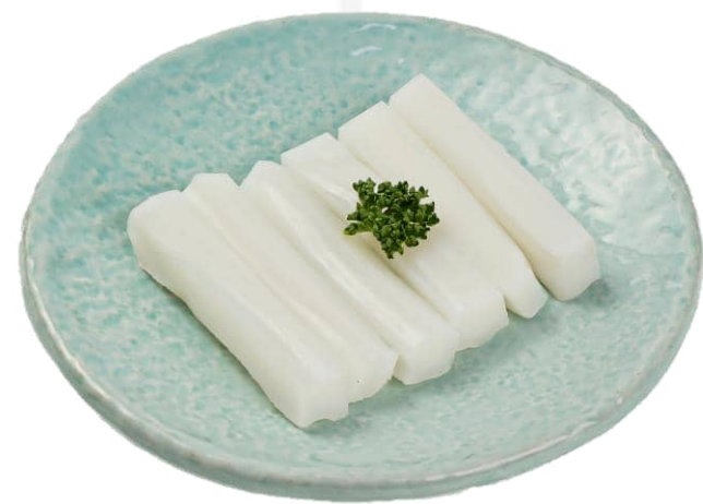
粉耗子 (50克/ 100克) Starch Noodle (50g/ 100g) 2 / 4