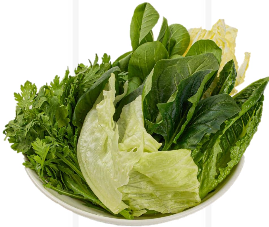
蔬菜拼盤 (100克/ 200克) Assorted Fresh Vegetables (100g/ 200g) 10 / 20