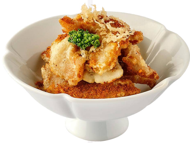
四川酥肉 Deep Fried Pork Belly, Sichuan Style