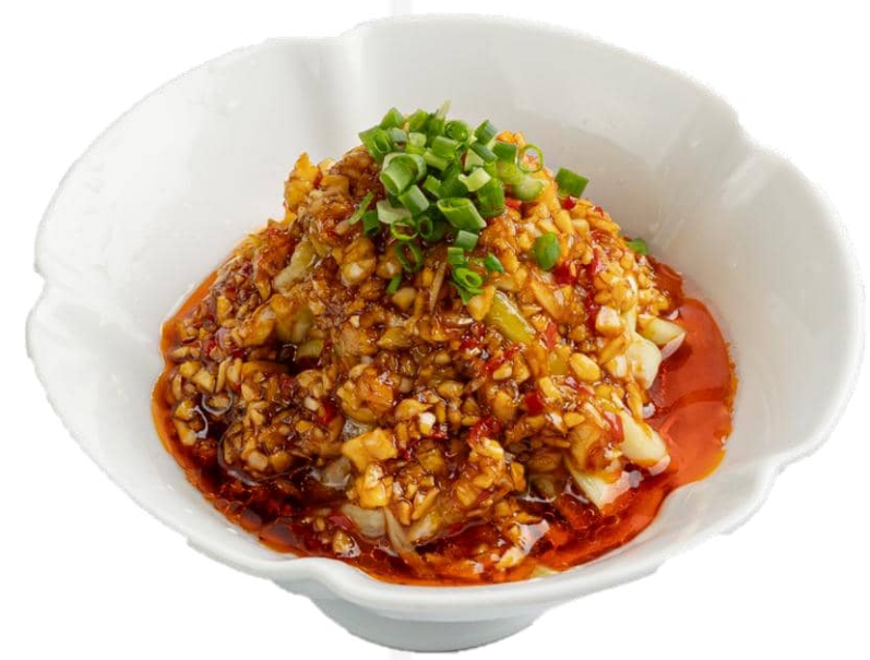
蒜蓉拌茄子 Tossed Eggplant, Garlic