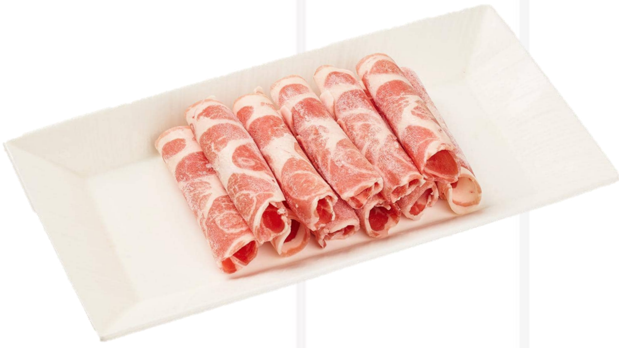
豬肩肉 (80克/ 160克) Pork Shoulder (80g/ 160g) 20 / 40