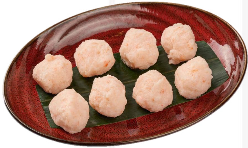
鮮蝦滑 (4粒/ 8粒)