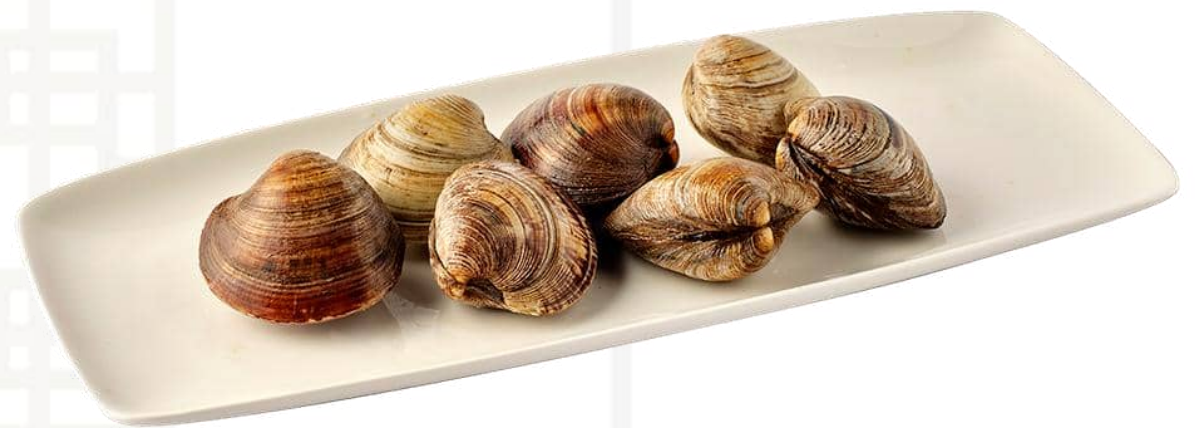
蛤蜊 (500克) Clam (500g) 40

價格均以韓元1,000結尾為單位計算，並已包含10%稅費及10%服務費 Prices are in Korean Won at 1,000 value and include 10% tax and 10% service charge