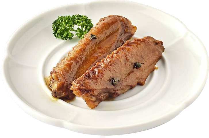
香辣滷鴨翅 (2隻) Spicy Braised Duck Wings (2 pcs)