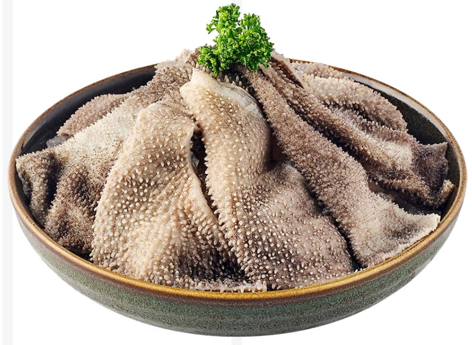
鮮毛肚 (50克/ 100克) “Mao Du” Beef Tripe (50g/ 100g) 5 / 10