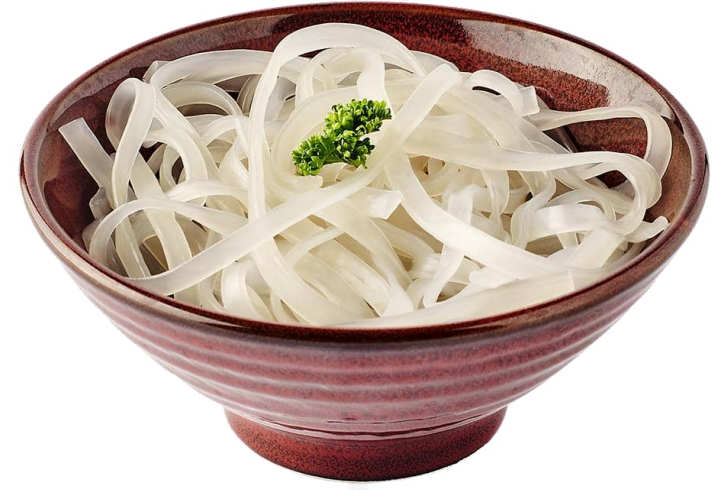
紅蕃薯粉 (60克/ 120克) Sweet Potato Noodle (60g/ 120g) 2 / 4