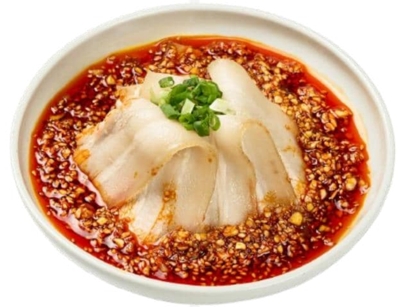
蒜泥白肉 Poached Pork Belly 13