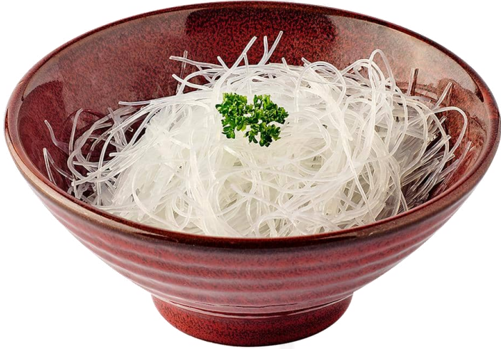
龍口粉絲 (60克/ 120克) Glass Vermicelli (60g/ 120g) 2 / 4