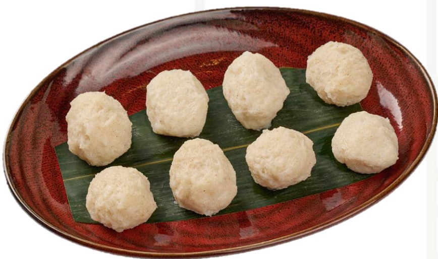
蟹籽墨魚滑 (4粒/ 8粒)

Crab Roe Cuttlefish Paste Ball (4 pcs/ 8 pcs)