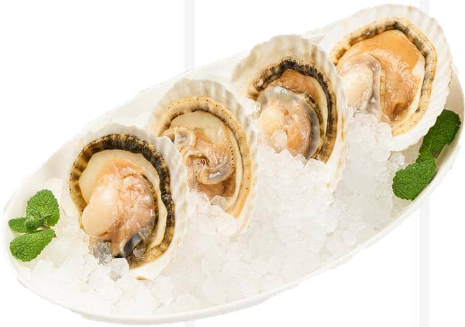
扇貝 (500克) Scallop (500g) 36