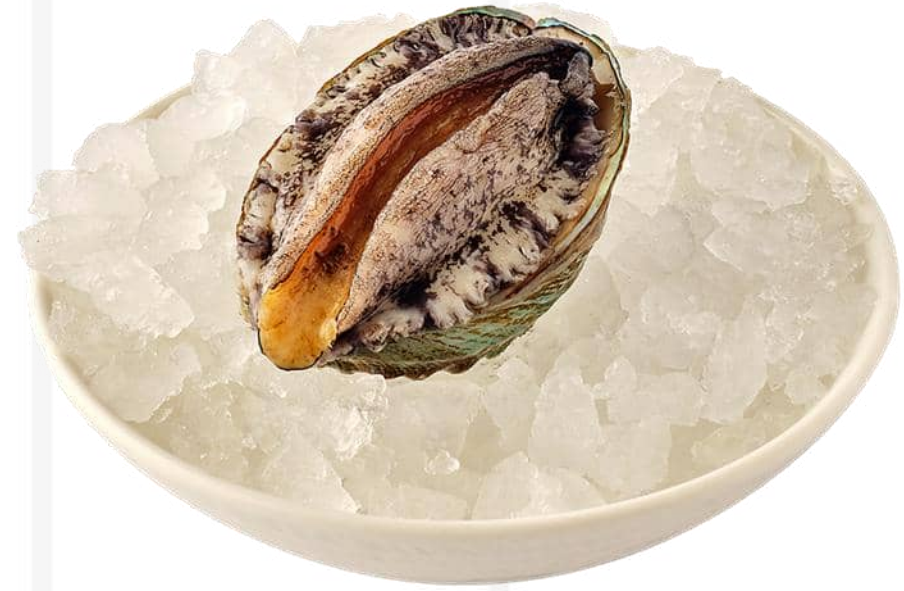
鮮鮑魚 (1隻) Abalone (1 pcs) 14