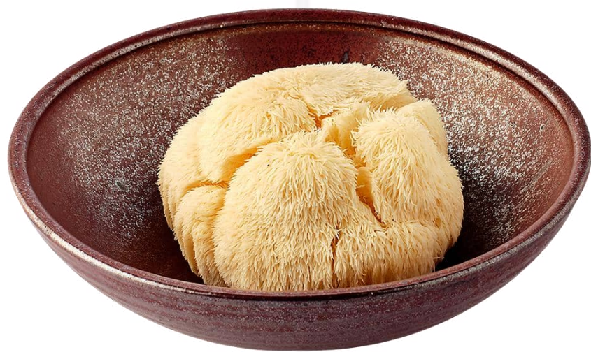
猴頭菇 (30克/ 60克) Bearded Tooth Mushroom (30g/ 60g) 6 / 12