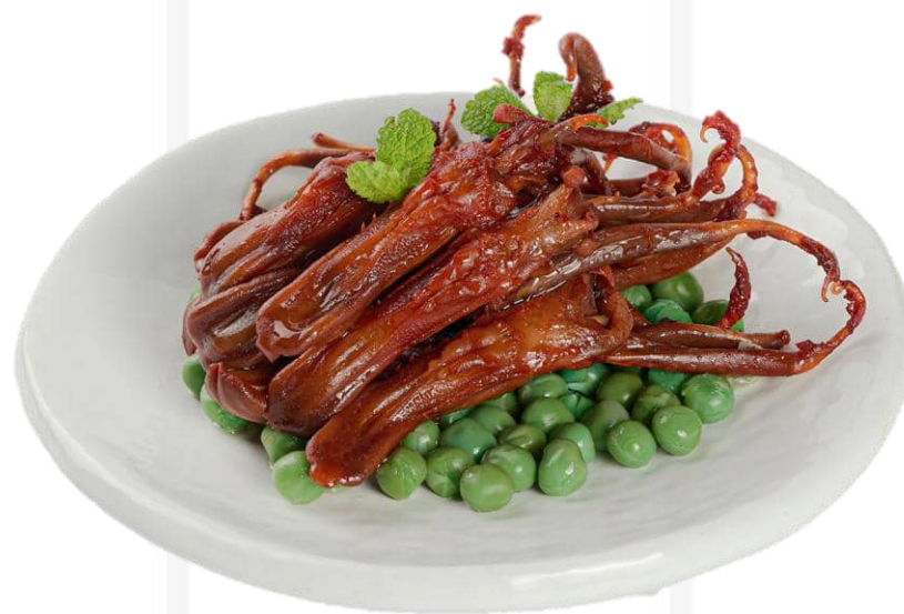
麻辣鴨舌 Braised Spiced Duck Tongue