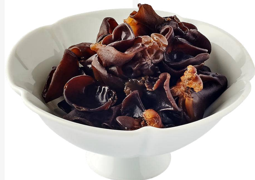
黑木耳 (40克/ 80克) Black Fungus (40g/ 80g) 3 / 6

價格均以韓元1,000結尾為單位計算，並已包含10%稅費及10%服務費 Prices are in Korean Won at 1,000 value and include 10% tax and 10% service charge