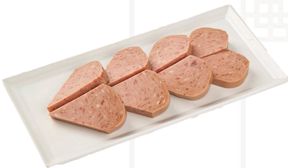
午餐肉 (4片/ 8片) Luncheon Meat (4 pcs/ 8 pcs) 6 / 12