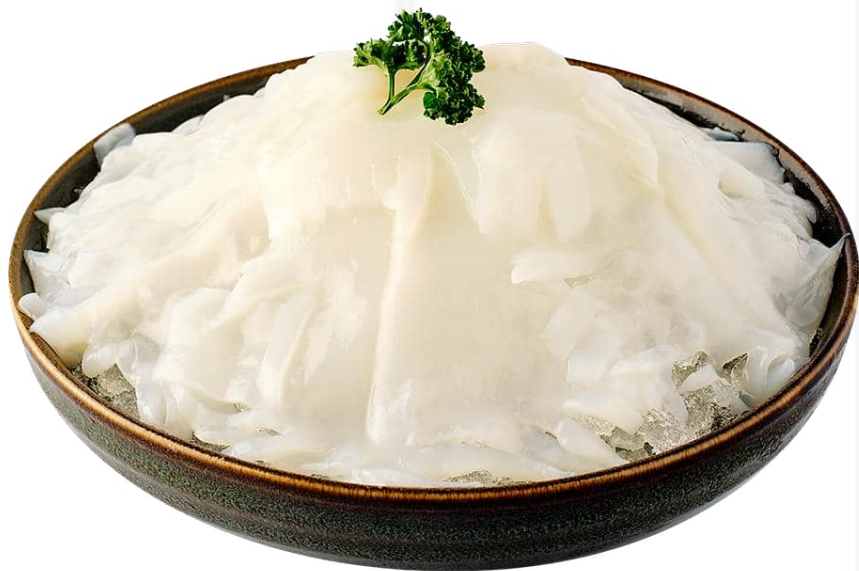
花枝片 (50克/ 100克) Cuttlefish (50g/ 100g) 8 / 16