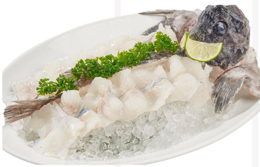
黑石魚 (每條) Black Rockfish (whole piece) 65