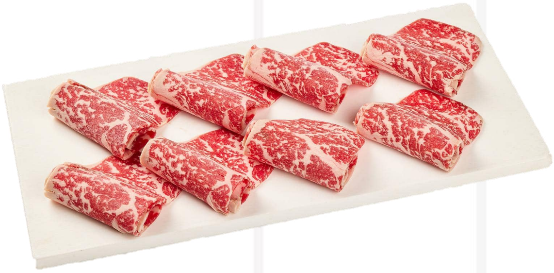
雪花牛肉眼 (80克/ 160克) Hanwoo Beef Ribeye (80g/ 160g) 65 / 130