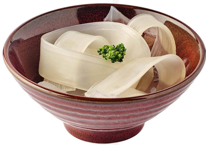
土豆寬粉 (80克/ 160克) Potato Noodle (80g/ 160g) 2 / 4