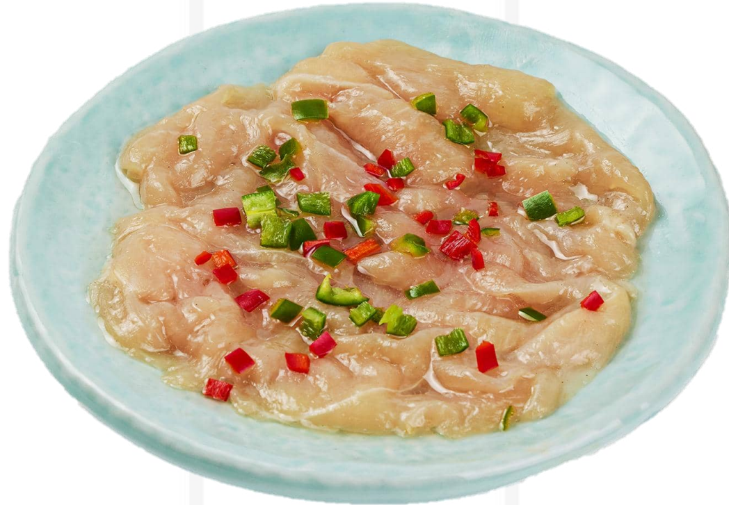
調味雞胸肉 (60克/ 120克)