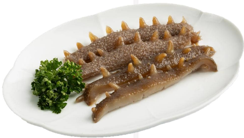
海參 (1條) Sea Cucumber (1 pcs) 55