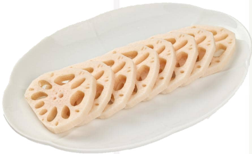
蓮藕片 (4片/ 8片) Lotus Root (4 pcs/ 8 pcs) 6 / 12