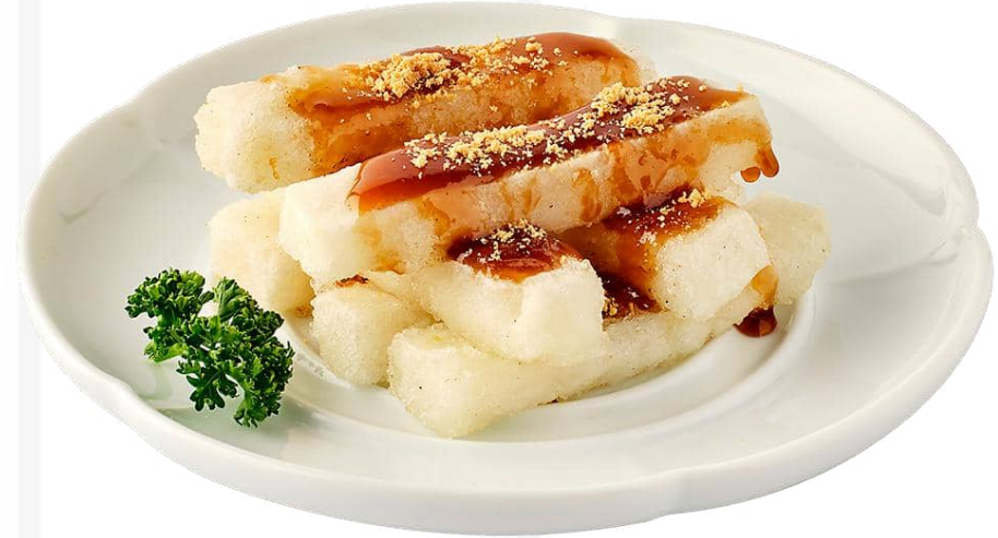
糯米糍粑 Golden Fried Traditional Glutinous Rice Cake 8