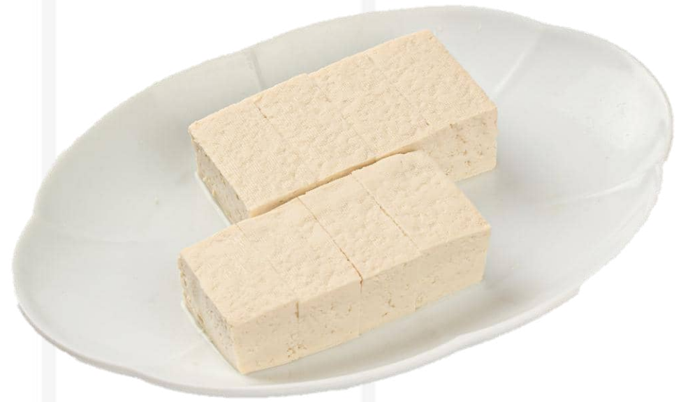
鮮豆腐 (4片/ 8片) Bean Curd (4 pcs/ 8 pcs) 6 / 12