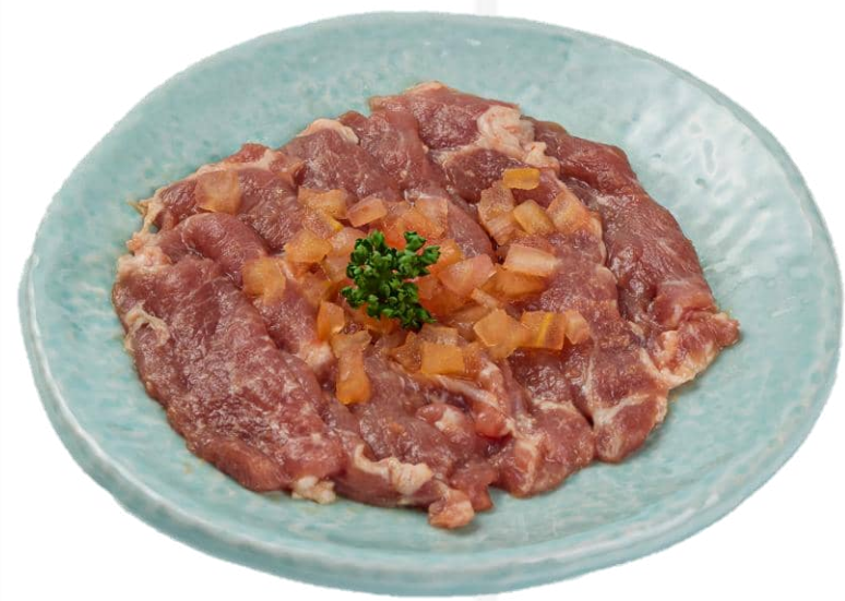
腌製黑豬肉 (50克/ 100克) Marinated Sliced Black Pork (50g/ 100g) 6 / 12