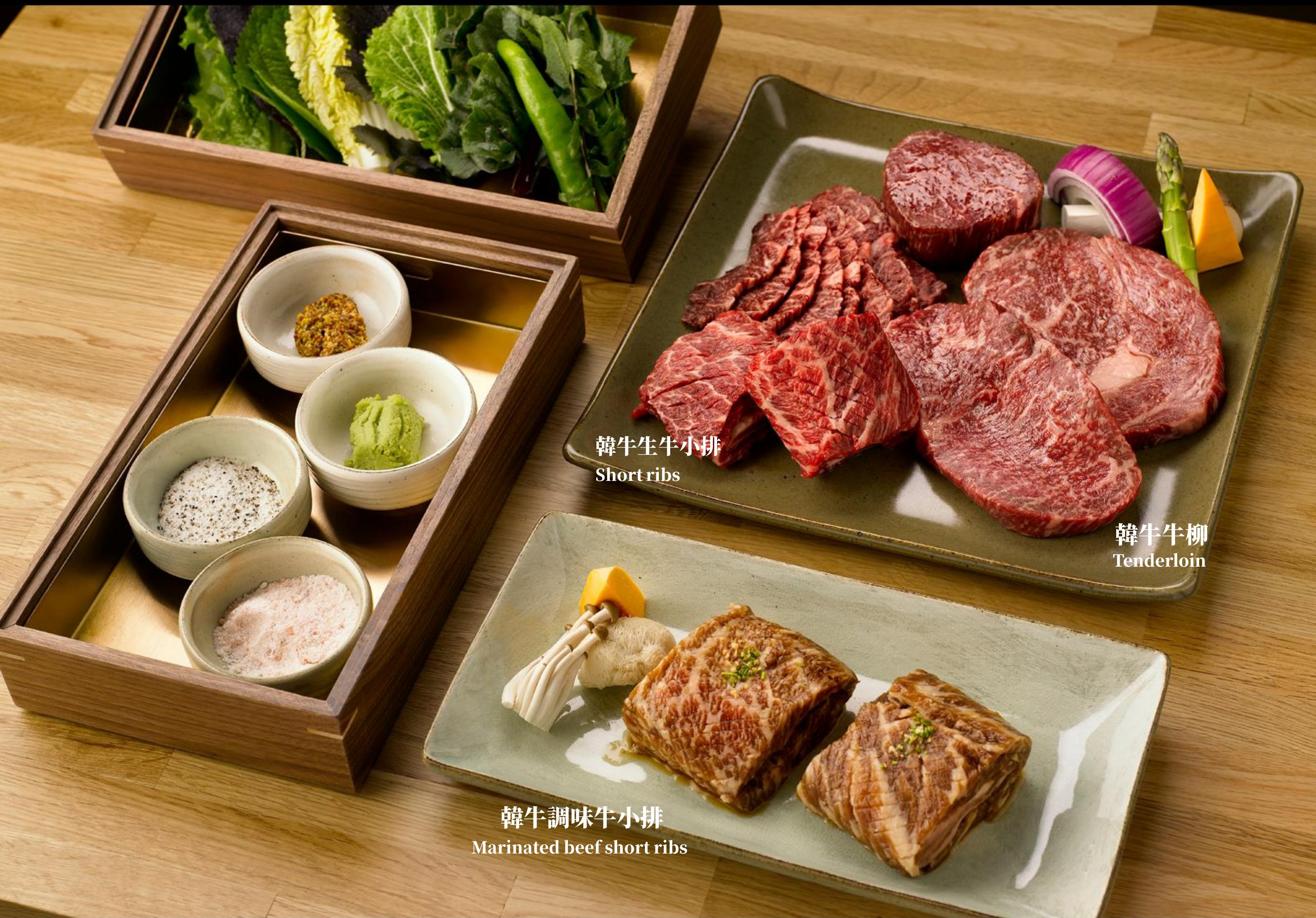
韓牛生牛小排 Short ribs