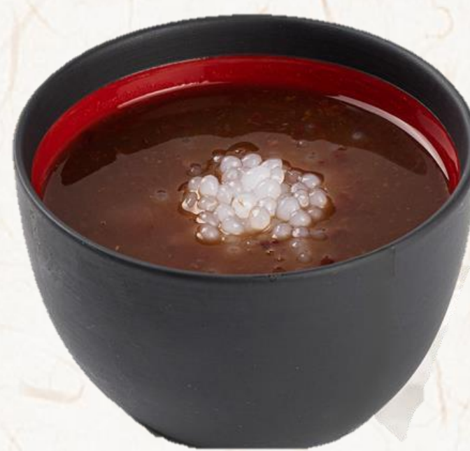
팥 사고 Sweet Red Bean Soup 8