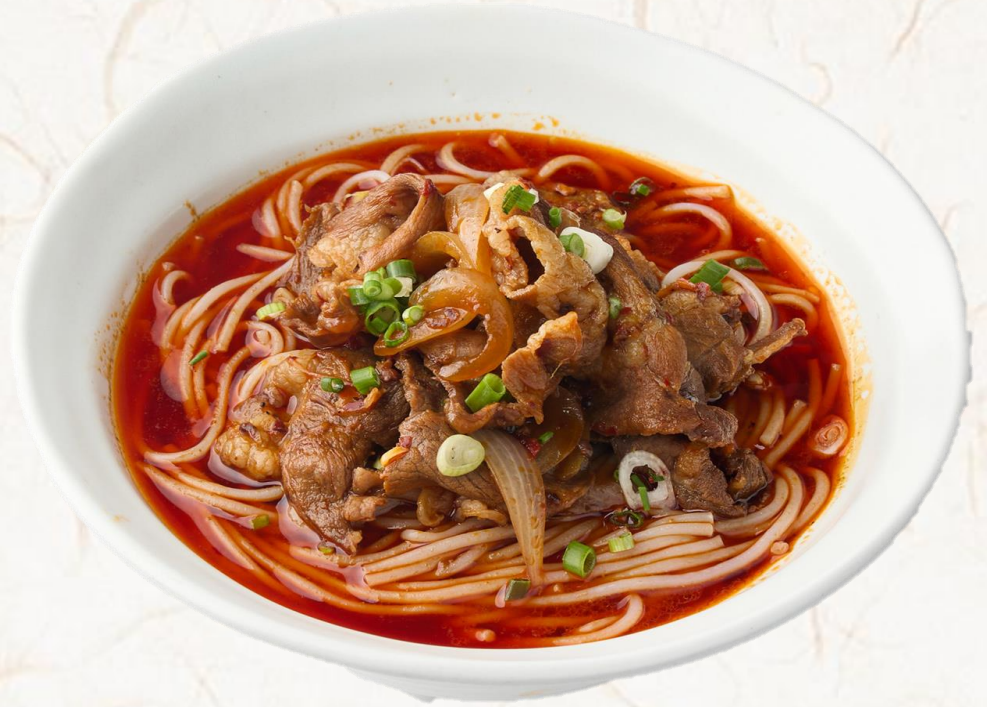
갓김치와 차돌박이 쌀국수 (소고기:미국산 ) Chinese Preserved Vegetables Soup with Sliced Beef and Vermicelli 18