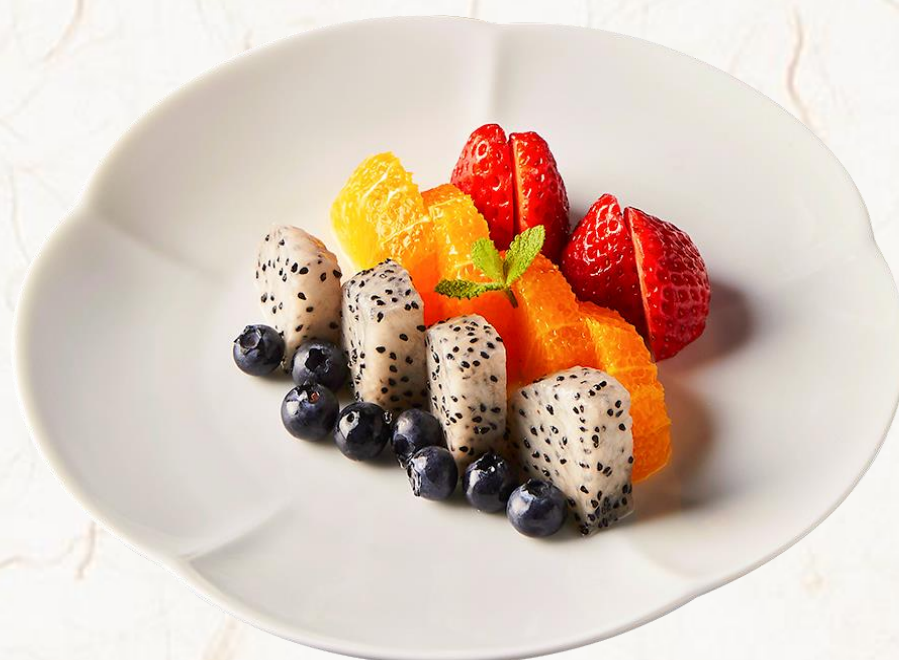
과일 플래터 Fresh Fruit Platter 8