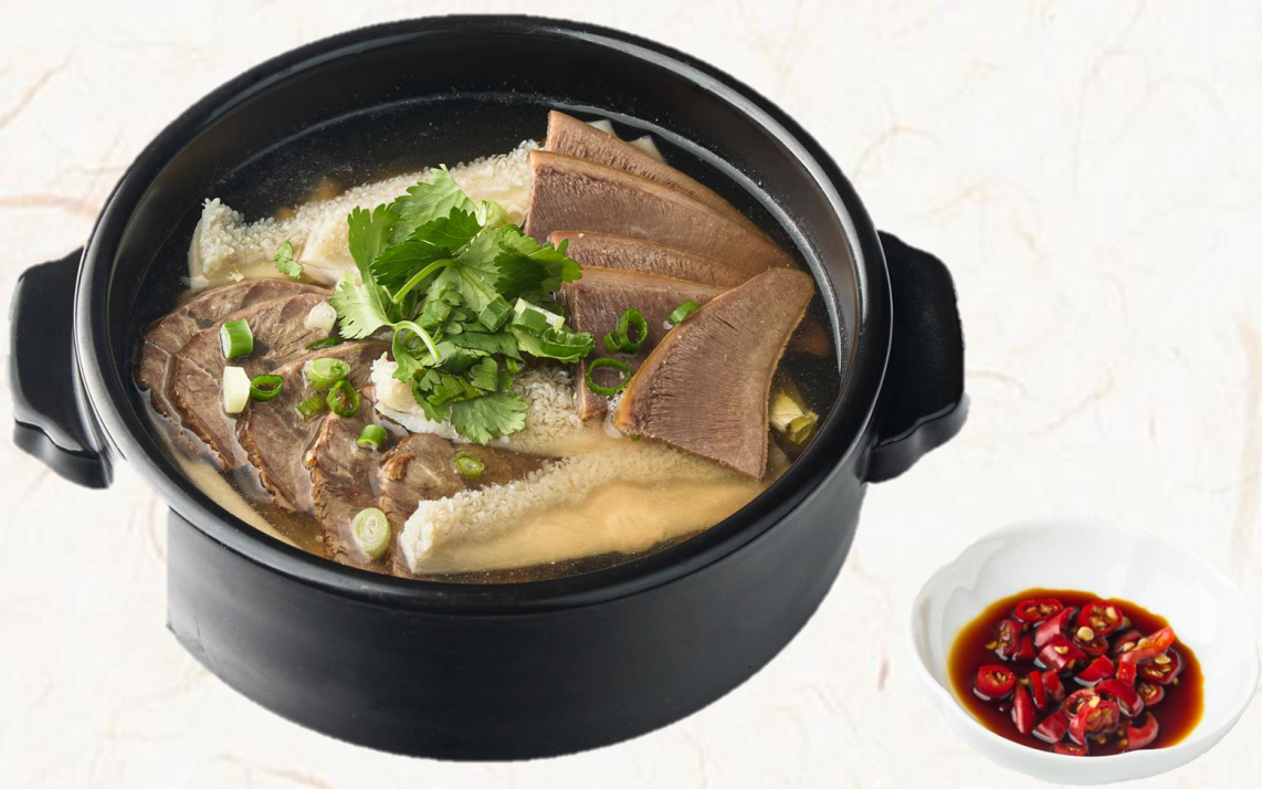
설렁탕 (소고기:(사태)미국산,(깐양)국내산,(우 설)국내산 ) Beef Tripe Soup 18