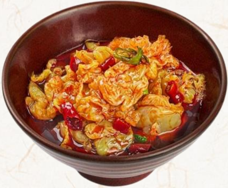
해파리 냉채 Marinated Jellyfish with Vinegar and Garlic Sauce 13