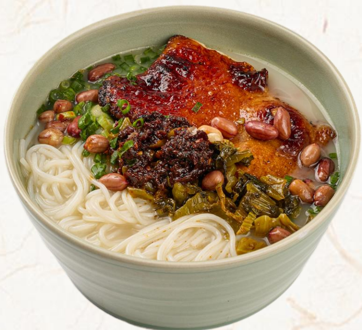
닭갈비 마라 쌀국수 (닭고기:국내산)

Spicy & Sour Rice Noodles with Crispy Chicken Cutlet 20