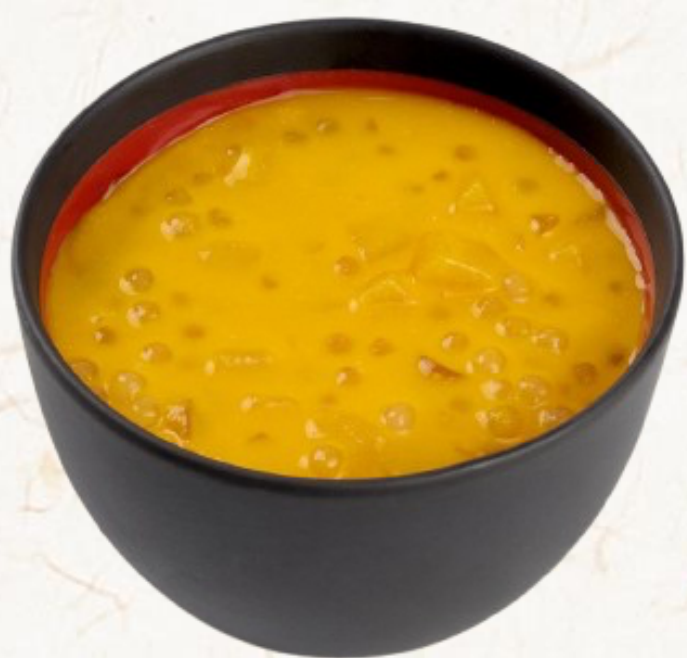
망고 포멜로 사고 Chilled Mango Pomelo Sago 8