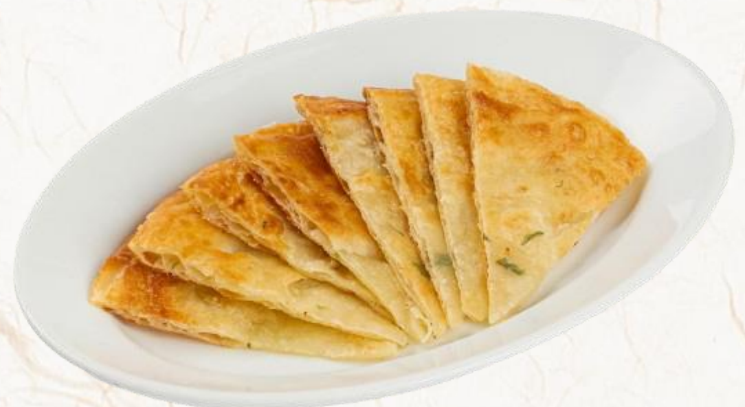
파전병 Pan Fried Spring Onion Pancake 8