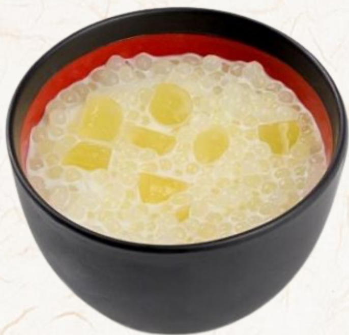
코코넛 사고 Chilled Coconut Sago 8