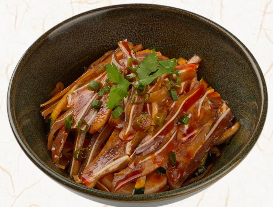
매콤 돼지귀 냉채 무침 (돼지귀:국내산) Marinated Pork Ears in Chili Oil