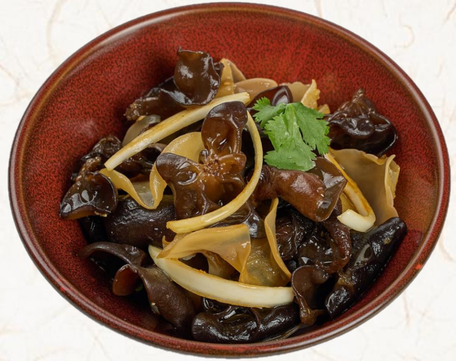
목이버섯 무침 Chilled Black Fungus Tossed in Vinegar 11