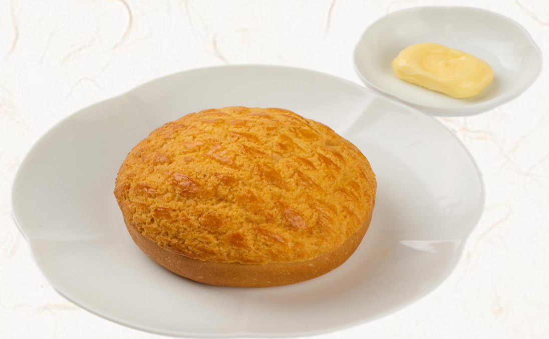
파인애플 번 Steamed Barbecued Pork Buns 7