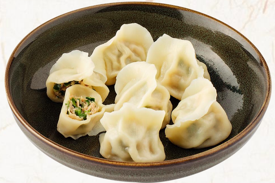
돼지고기 부추 만두 (6개) (돼지고기:국내산) Pork and Leek (6 pieces)