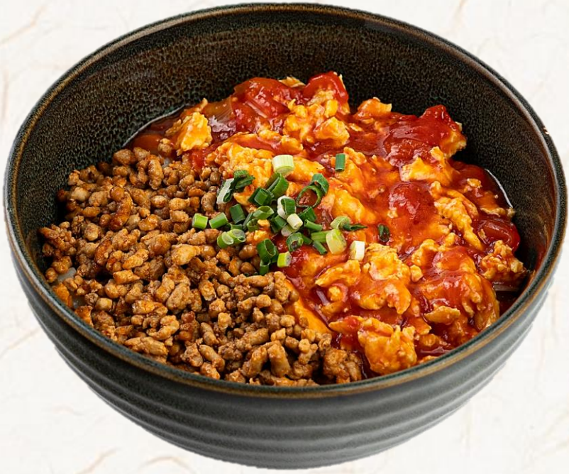
토마토 계란 산시식 도삭면 (돼지고기:국내산) Hand Shaved Noodle with Egg Tomato and Minced Pork 18