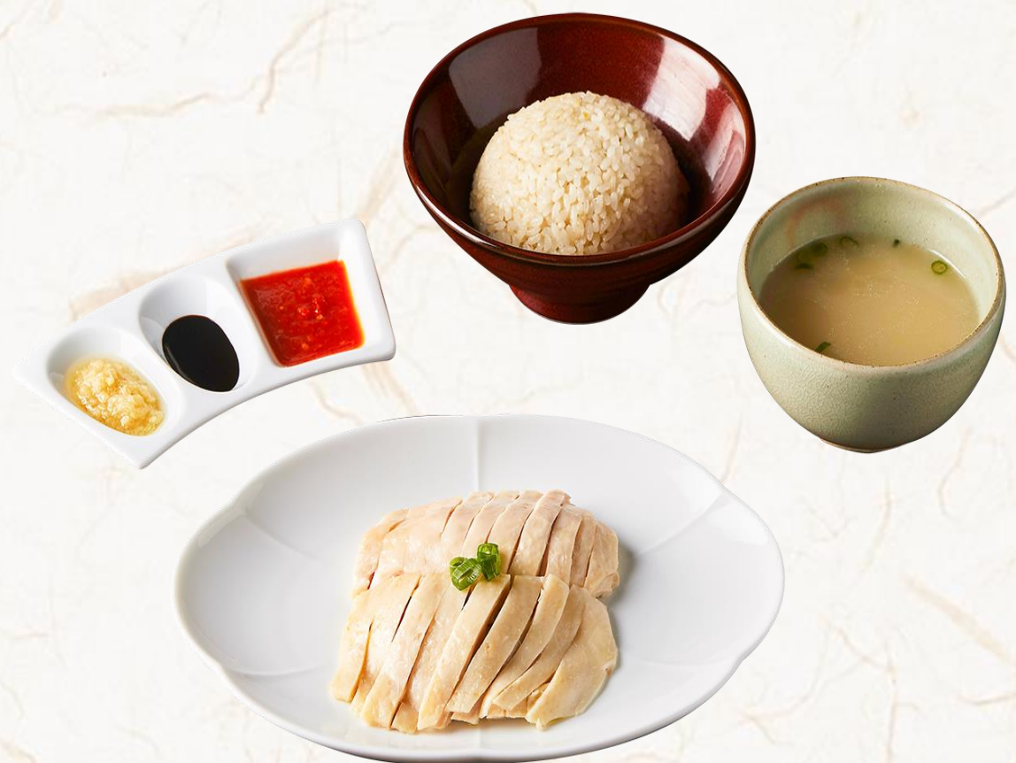
하이난 치킨 라이스 (닭고기:국내산, 쌀:국내산) Hainan Chicken Rice