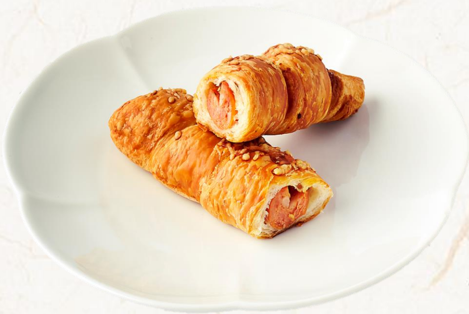
소시지 브레드 (돼지고기:국내산) Sausage Bread 7