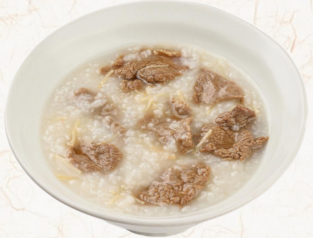
소고기 관자 죽 ( 소고기:미국산 ) Congee with Sliced Beef and Scallop 18