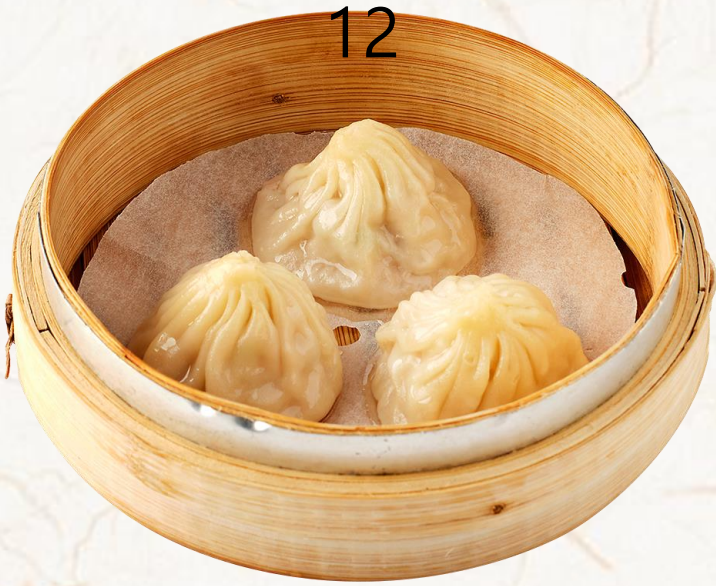
상해식 샤오롱바오 (3개) (돼지고기:국내산) Shanghainese Minced Pork (3 pieces)