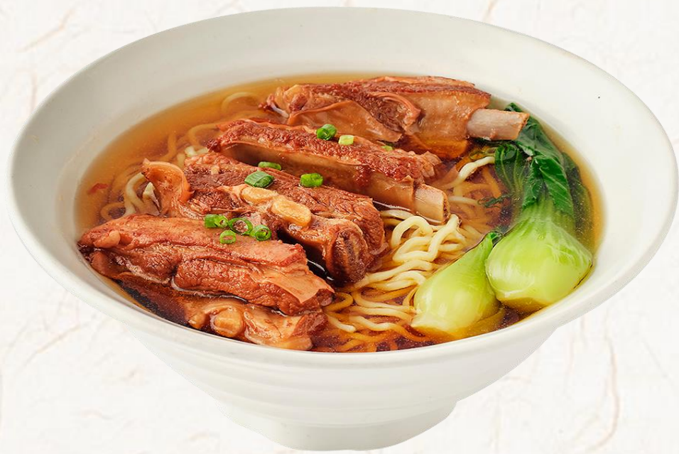
양갈비 탕면 (양고기:호주산, 돼지뼈,닭뼈:국내산) Braised Mutton Noodle Soup 20