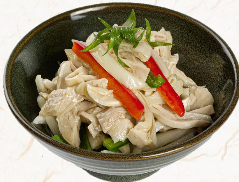
신장식 닭요리 (닭고기:국내산) Xinjiang Style Pepper Chicken Stir Fry