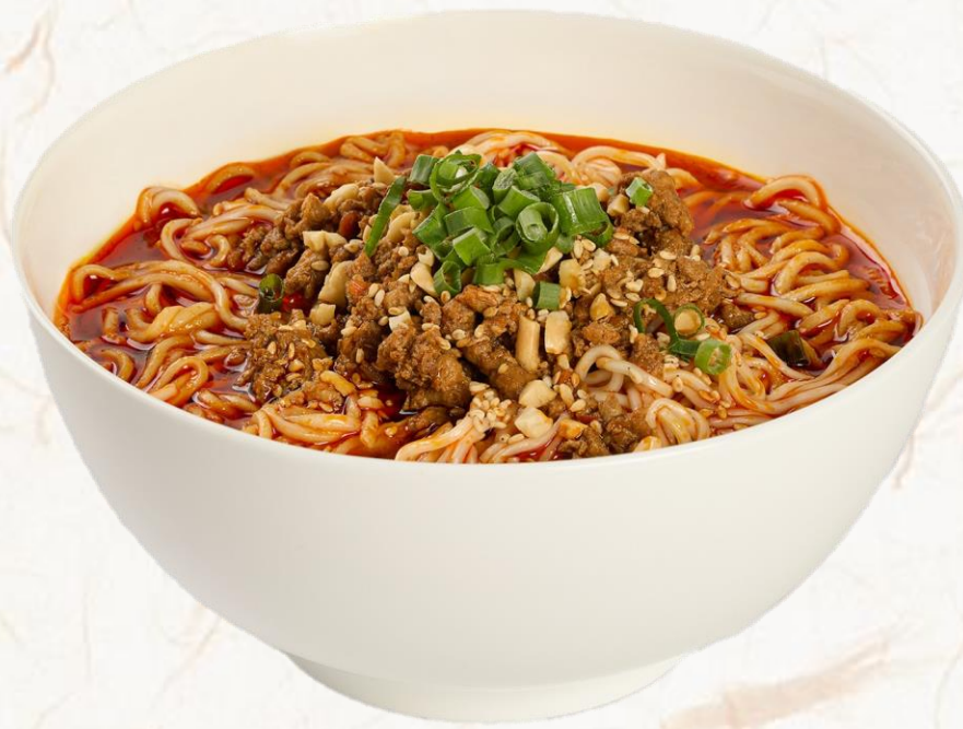
충칭 소면 (돼지고기:국내산) Chongqing Style Spicy Noodle 15

Tossed Sesame Noodles with Spicy Minced Pork 15