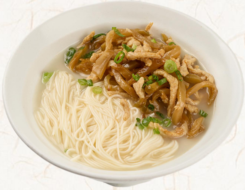
짜사이 돼지고기 고명 국수 (돼지고기:국내산)

Fine Dried Noodle with Shredded Pork and Zha Cai 18