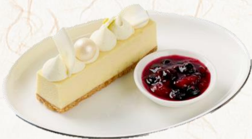
뉴욕 치즈 케이크 New York Cheese Cake 8