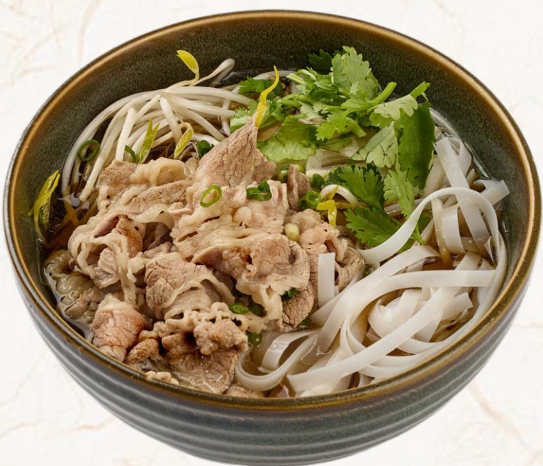
고수 차돌 쌀국수 (소고기:미국산) Beef Rice Noodle Soup with Coriander 20