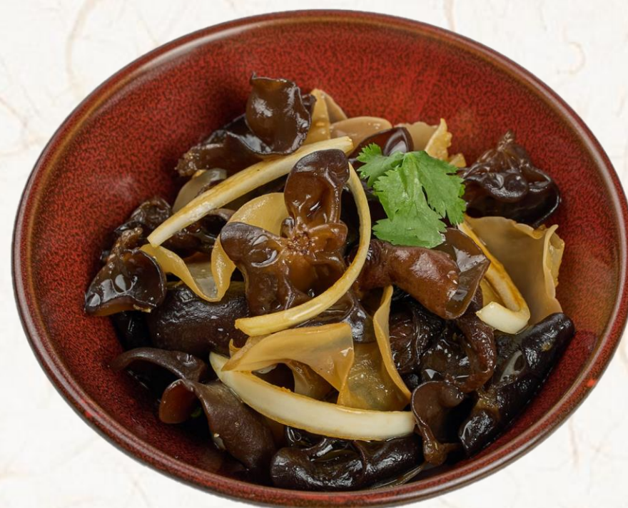
목이버섯 무침 Chilled Black Fungus Tossed in Vinegar 11