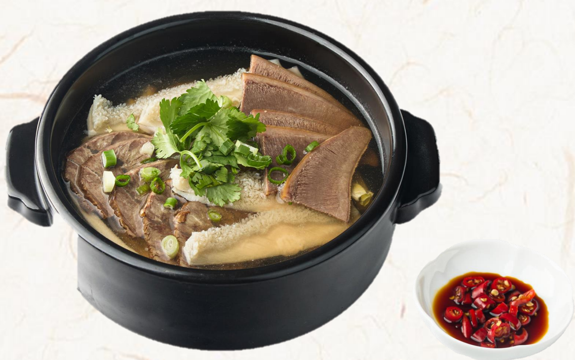
설렁탕 (소고기:(사태)미국산,(깐양)국내산,(우 설)국내산 ) Beef Tripe Soup 18