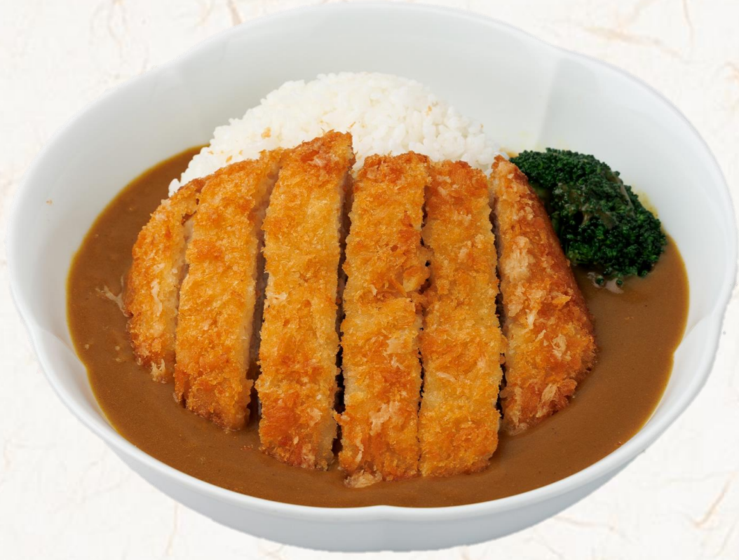
일본식 돈까스 카레 덮밥 (돼지고기:국내산, 쌀:국내산) Japanese Style Curry Pork Chop Rice