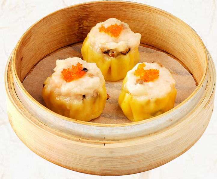
돼지고기 딤섬 (3개) (돼지고기:칠레산) Pork and Mushroom (3 pieces)