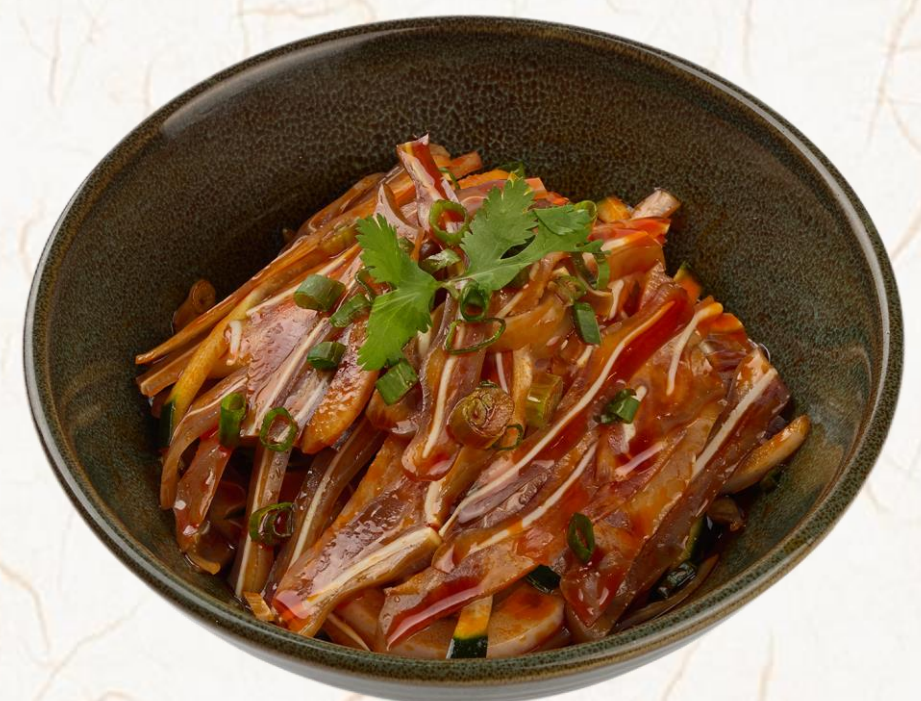
매콤 돼지귀 냉채 무침 (돼지귀:국내산) Marinated Pork Ears in Chili Oil