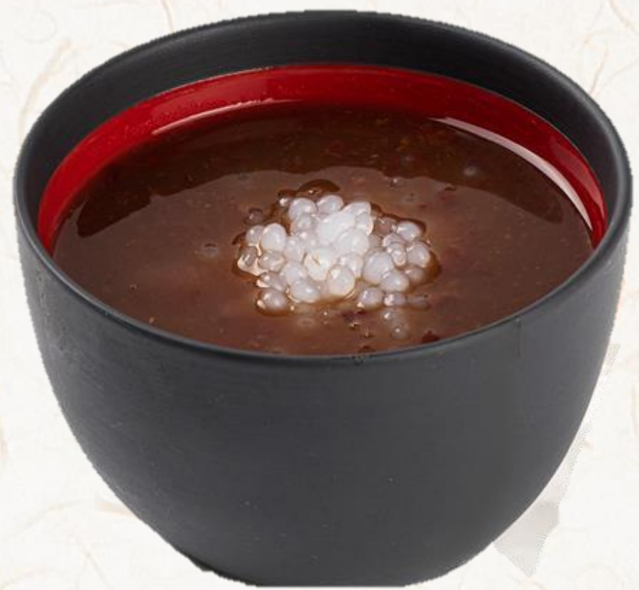
팥 사고 Sweet Red Bean Soup 8