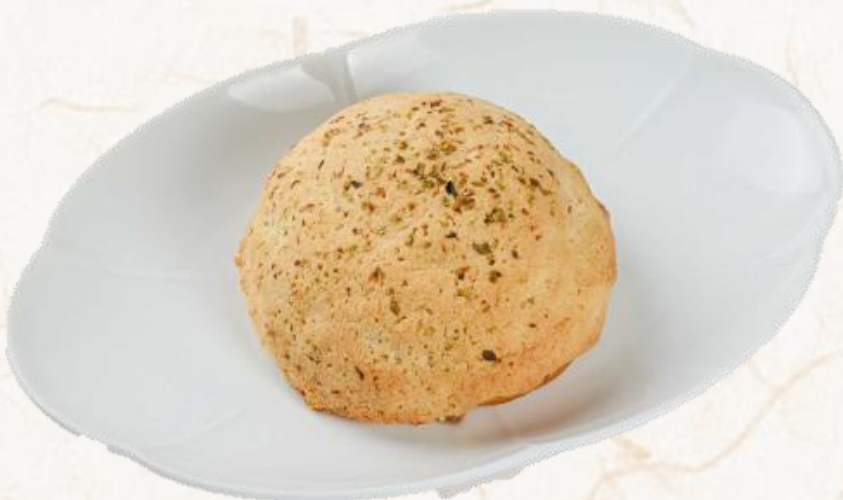
돼지고기 번 (돼지고기:국내산) Pork Buns