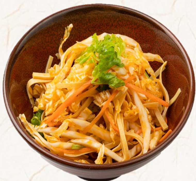
건두부 무침 Marinated Shredded Dried Bean Curd Skin with Cabbage 9