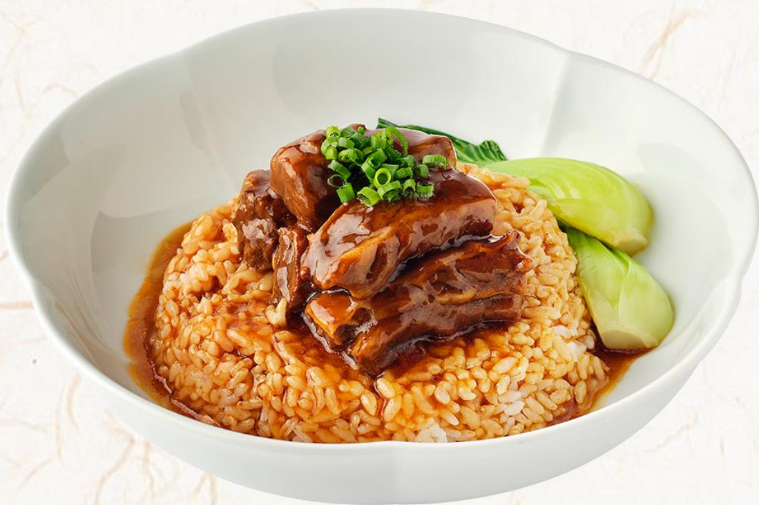
차돌박이찜 덮밥 (소고기:미국산, 쌀:국내산) Braised Beef Brisket Rice