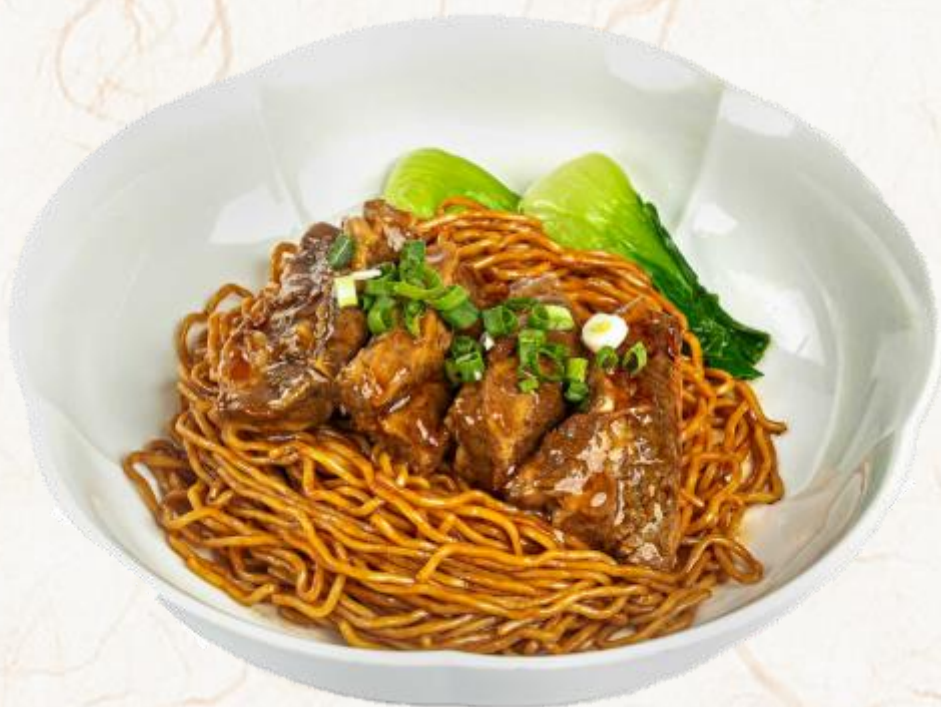
소고기 볶음면 (소고기:미국산) Beef Brisket, Tossed Noodle 18