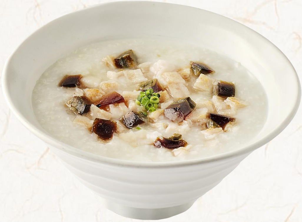
송화단 돼지고기 죽 (돼지고기:국내산, 쌀:국내산) Pork and Century Egg 12