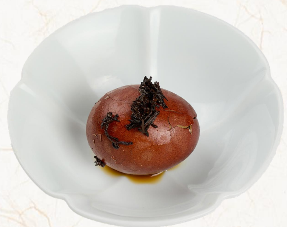
차예단 Chinese Tea Egg 2