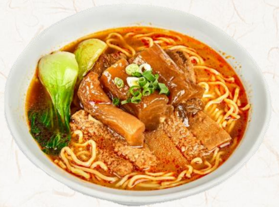
양지머리 스키 탕면 (돼지뼈,닭뼈,간양:국내산,도가니:호주산, 소고기:미국산) Braised Beef Brisket and Tendon Noodles Soup 20