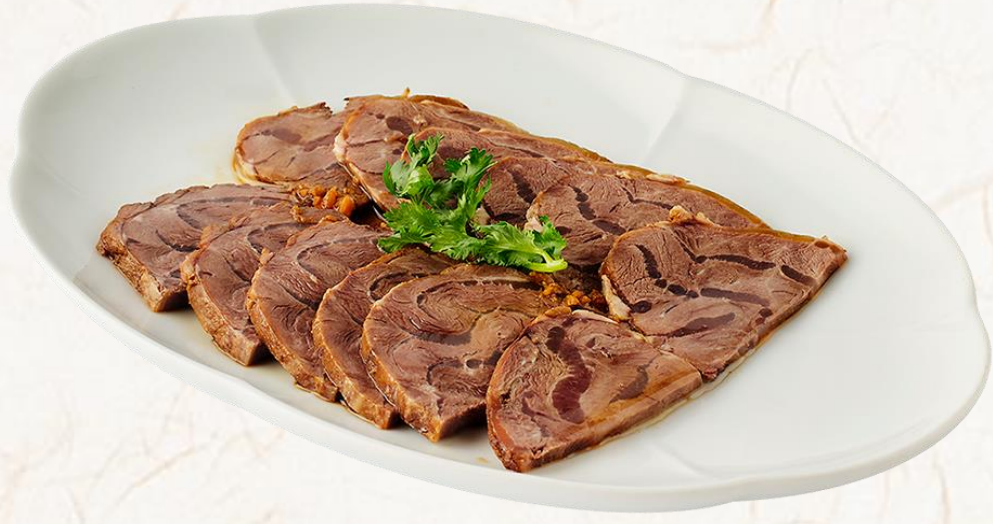
소고기 사태로 만든 오향장육 (소고기:미국산) Marinated Spiced Beef Shank