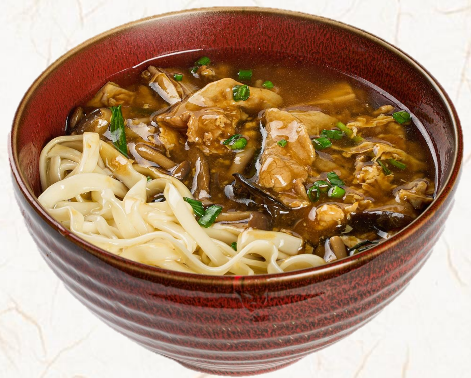
베이징식 다루면 (돼지고기:국내산) Beijing Style Noodle with Braised Sauce 18