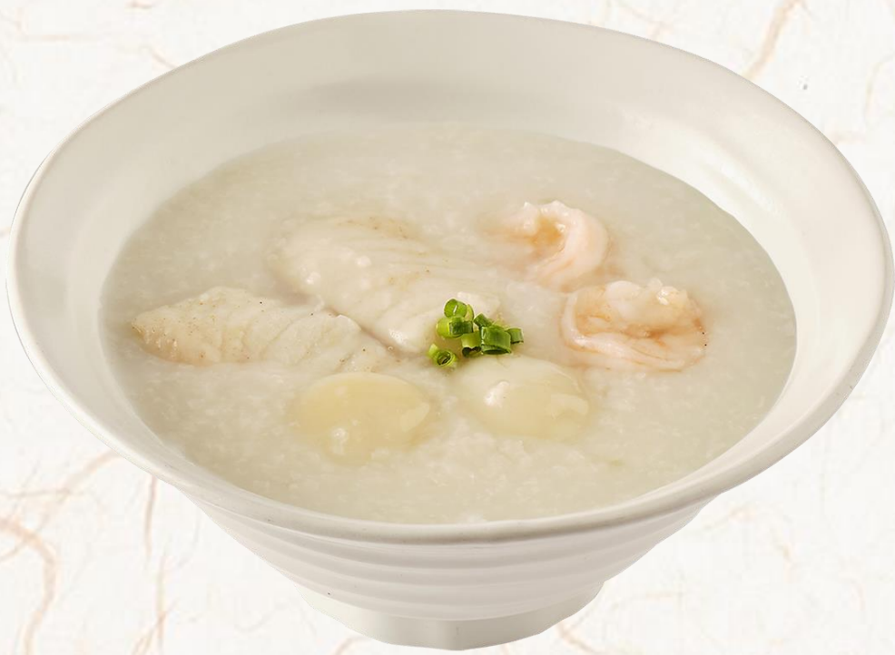
생선 관자 죽 (가리비:중국산, 쌀:국내산) Sliced Fish and Scallops 18