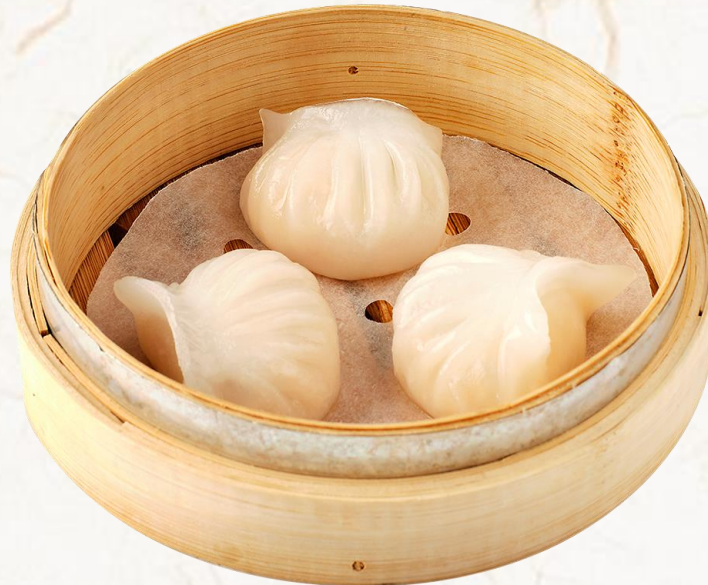
새우 딤섬 (3개) Shrimp with Bamboo Shoots (3 pieces)