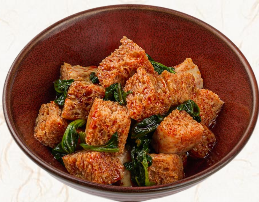
글루텐 냉채 Marinated Wheat Gluten 11