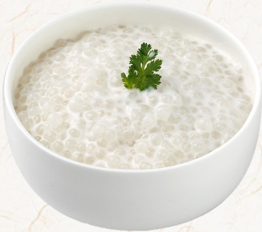
코코넛 사고 Chilled Coconut Sago 8