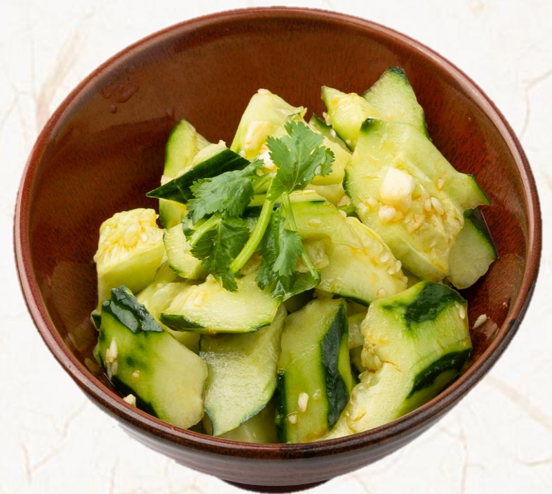
오이 무침 Marinated Cucumbers with Garlic 8