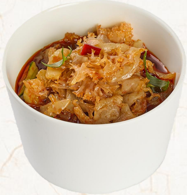
해파리 냉채 Marinated Jellyfish with Vinegar and Garlic Sauce 13