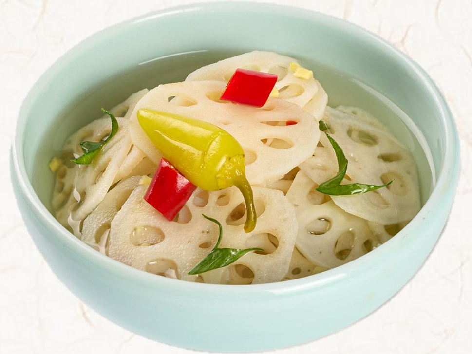
고추 연근 절임 Chili Pickled Lotus Root 11