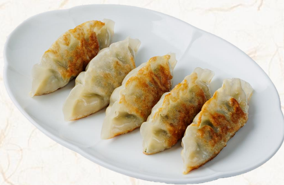
돼지고기 군만두 (돼지고기:국내산) Pan Fried Pork (5 pieces)