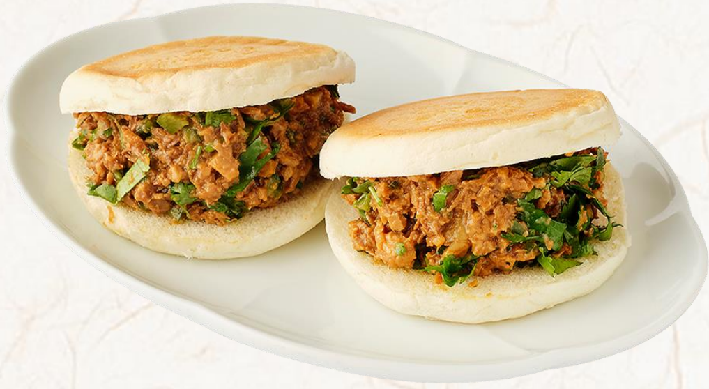
로우지아모 (중국식 고기빵) (2개) (돼지고기:국내산) Pan Fried Bun with Pork (2 pieces) 18