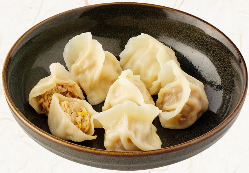
돼지고기 배추 만두 (6개) (돼지고기:국내산) Pork and Cabbage (6 pieces)