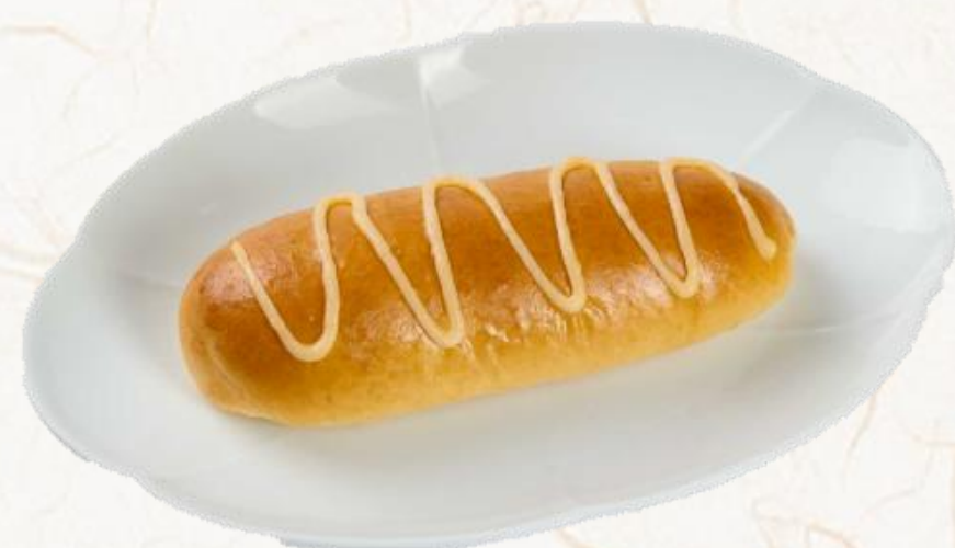
홍콩식 칵테일 번 Hong Kong Style Cocktail Buns