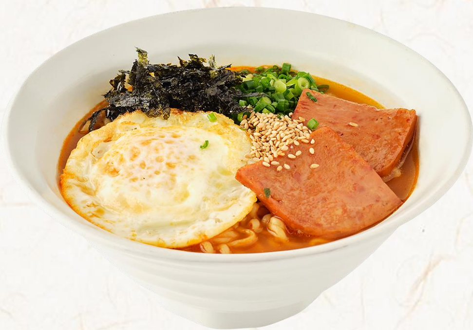
계란후라이와 스팸을 곁들인 신라면 (돼지고기:국내산) Instant Noodle with Spam and Egg 15