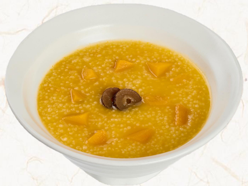
단호박 죽 Pumpkin Millet Porridge 12