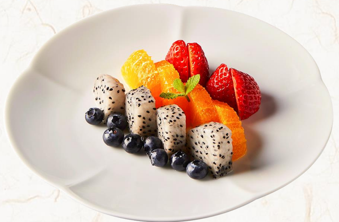
과일 플래터 Fresh Fruit Platter 8