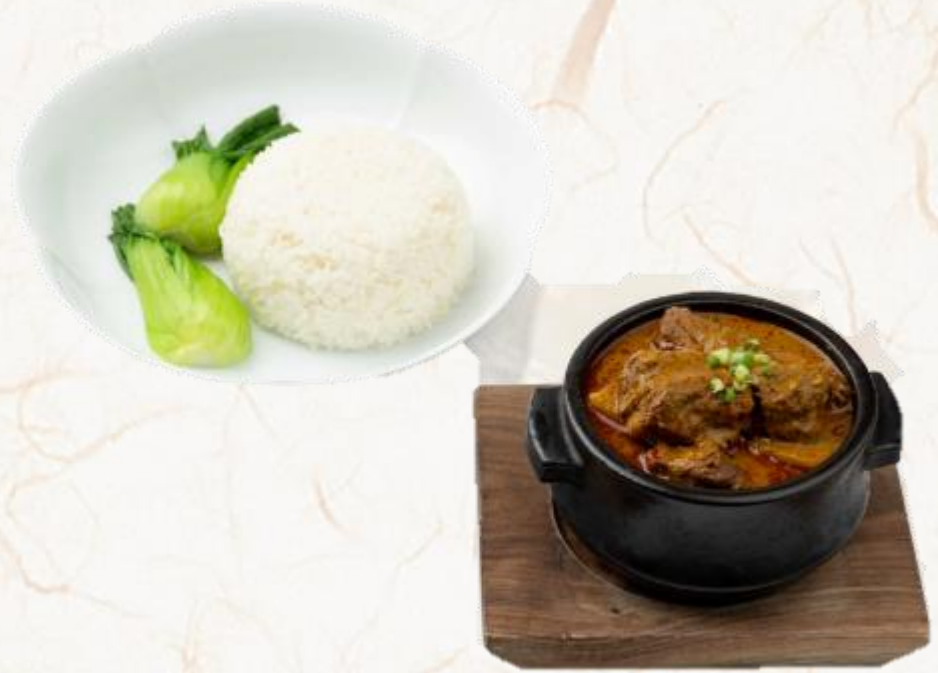
소고기 카레 (소고기:미국산, 쌀:국내산) Curry Beef Brisket Rice