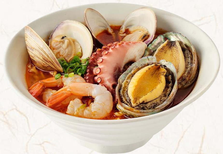
제주 해산물 라면 (전복:국내산) Seafood Ramen Noodle 20