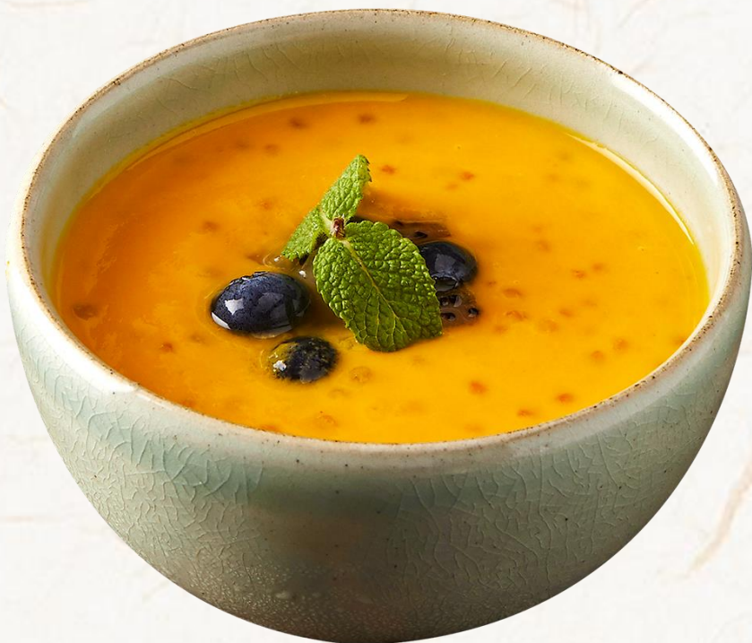
망고 포멜로 사고 Chilled Mango Pomelo Sago 8