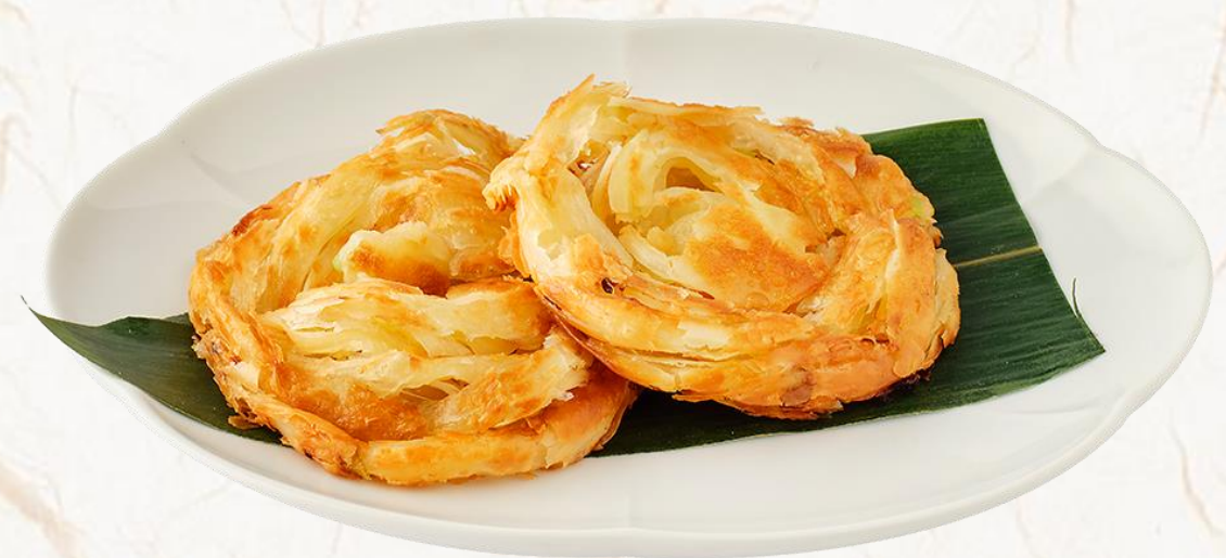
파전병 (2개) Pan Fried Spring Onion Pancake (2 pieces) 8