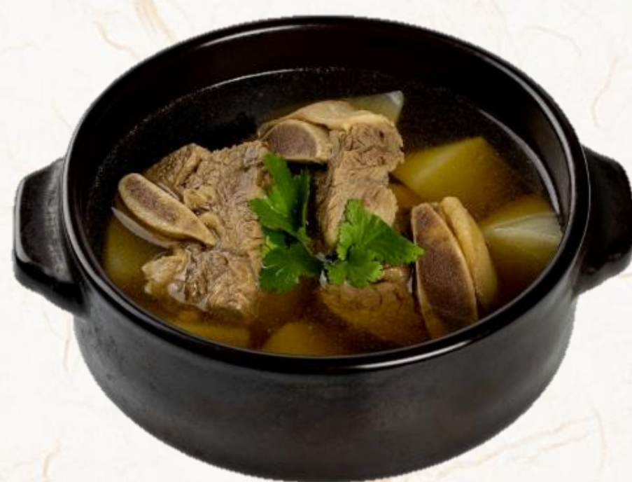
소갈비 무국 (소고기:미국산 ) Beef Rib and Radish Soup 18