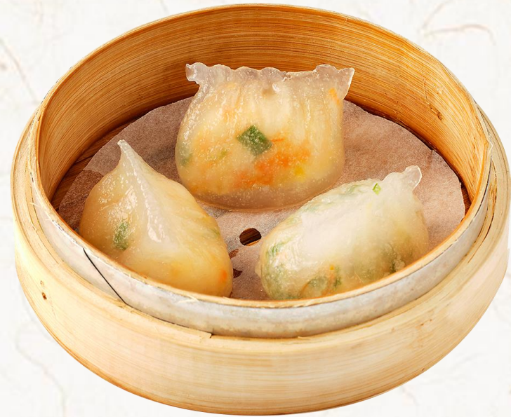
새우부추 만두 (3개) Shrimp and Chives (3 pieces)