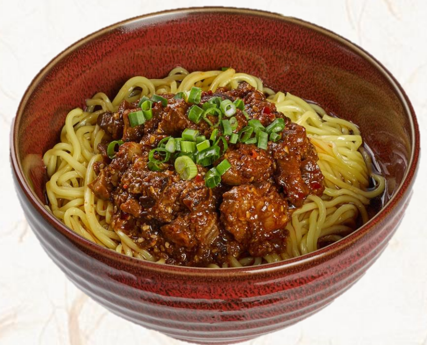
소고기 사태국수 (소고기:미국산) Handmade Noodle with Braised Beef 18