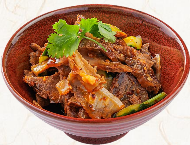
매콤한 소고기 무침 (소고기:미국산) Sliced U.S. Beef and Ox Tongue in Chili Sauce