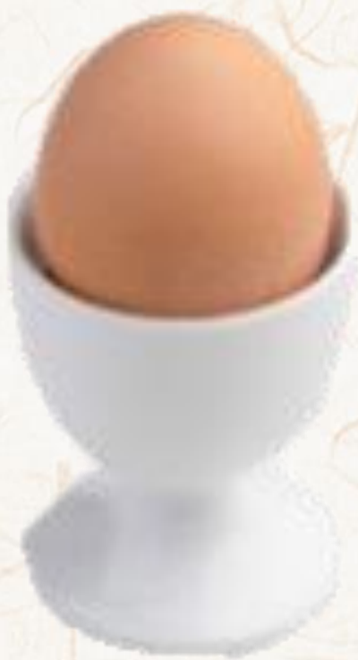
삶은 계란 Hard Boiled Egg 2