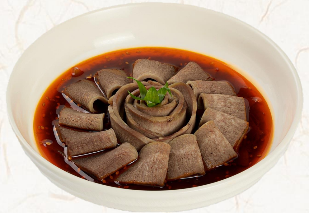
매운 소혀 무침 (소고기(한우):국내산) Spicy Marinated Beef Tongue