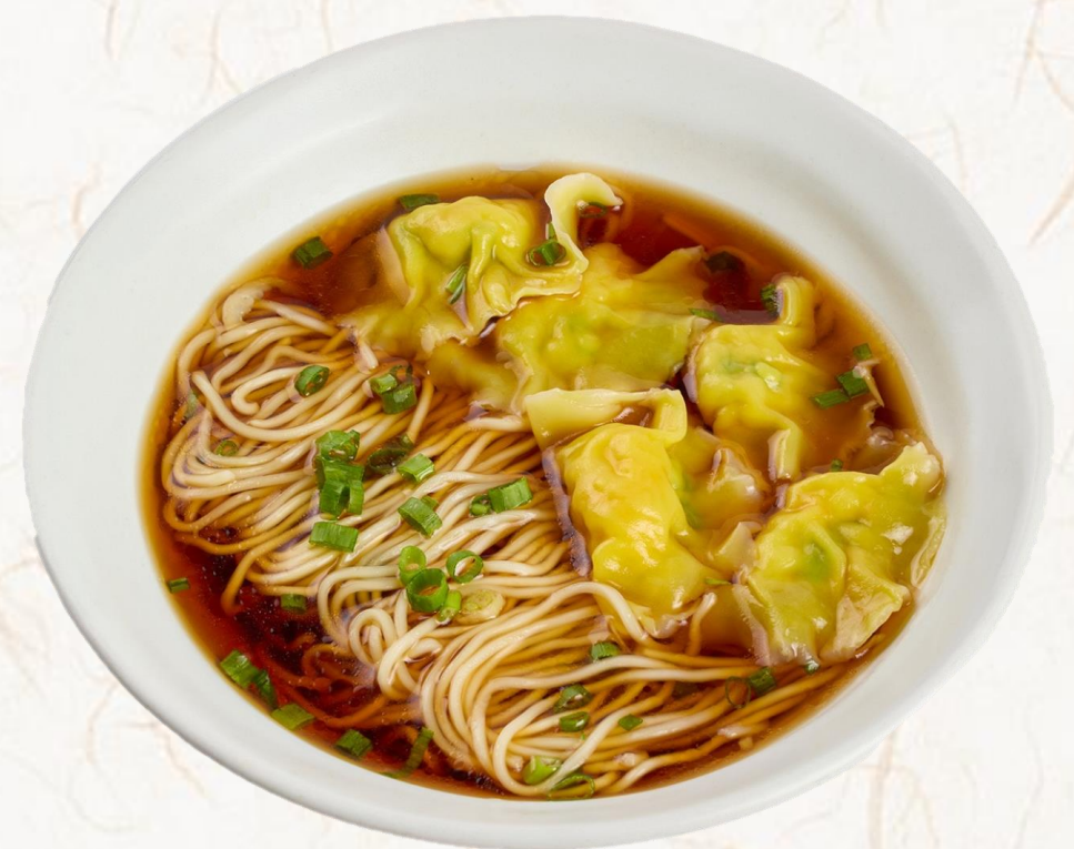
새우만두 양춘면 Yang Chun Noodle with Shrimp Dumplings 18