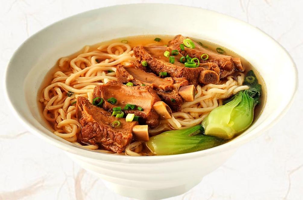
등갈비조림 탕면 (돼지고기:덴마크산, 돼지뼈, 닭뼈:국내산) Braised Pork Ribs Noodle Soup 18