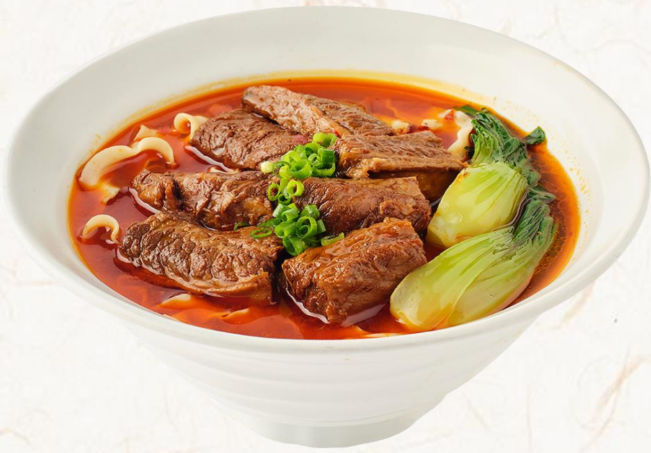
대만식 우육탕면 (소고기:미국산, 돼지뼈, 닭뼈:국내산) Taiwanese Beef Noodle Soup 18