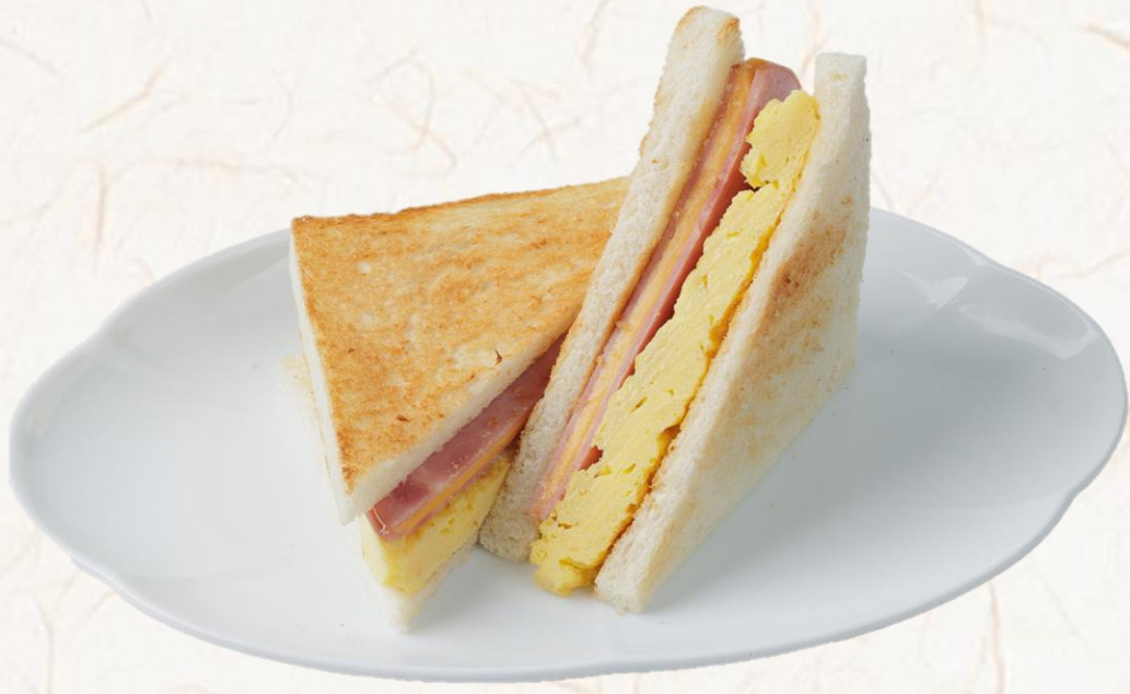
스팸 치즈 에그 샌드위치 (돼지고기:국내산) Ham, Cheese and Egg Sandwich 9