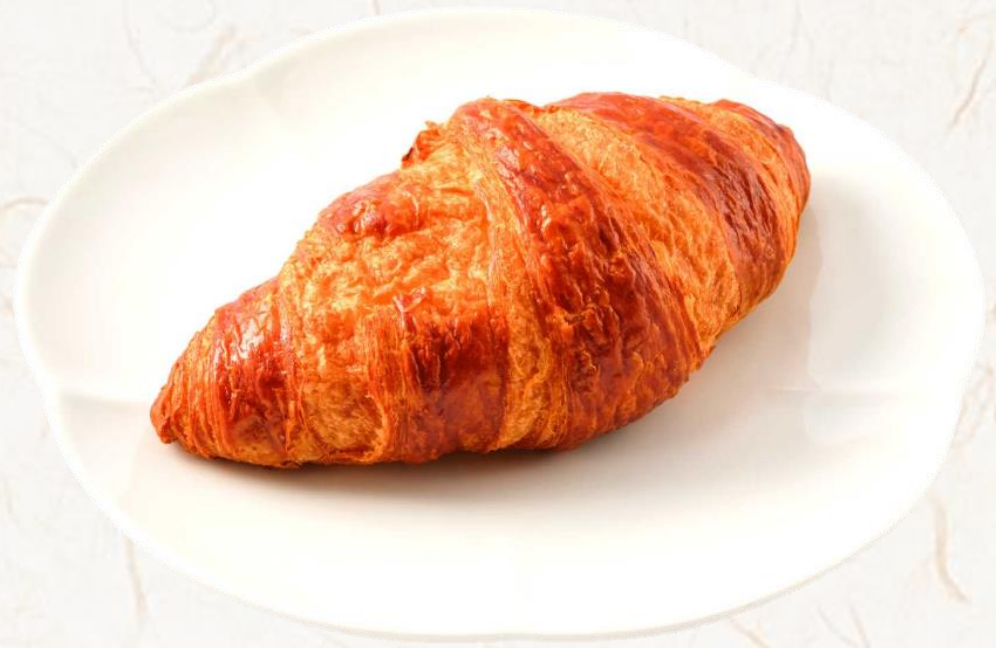
크루아상 Croissant 3.8