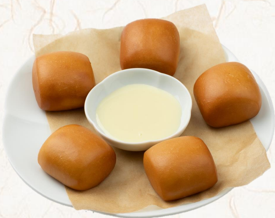
중국식 튀긴빵 (5개) Deep Fried Bun (5 pieces) 8