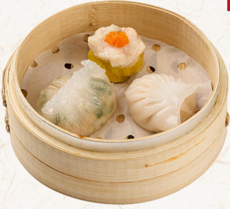
모듬 딤섬 (3 개) (돼지고기:국내산) 새우 딤섬, 돼지고기 딤섬, 새우부추 만두 Shrimp with Bamboo Shoots, Pork and Mushroom, Shrimp and Chives