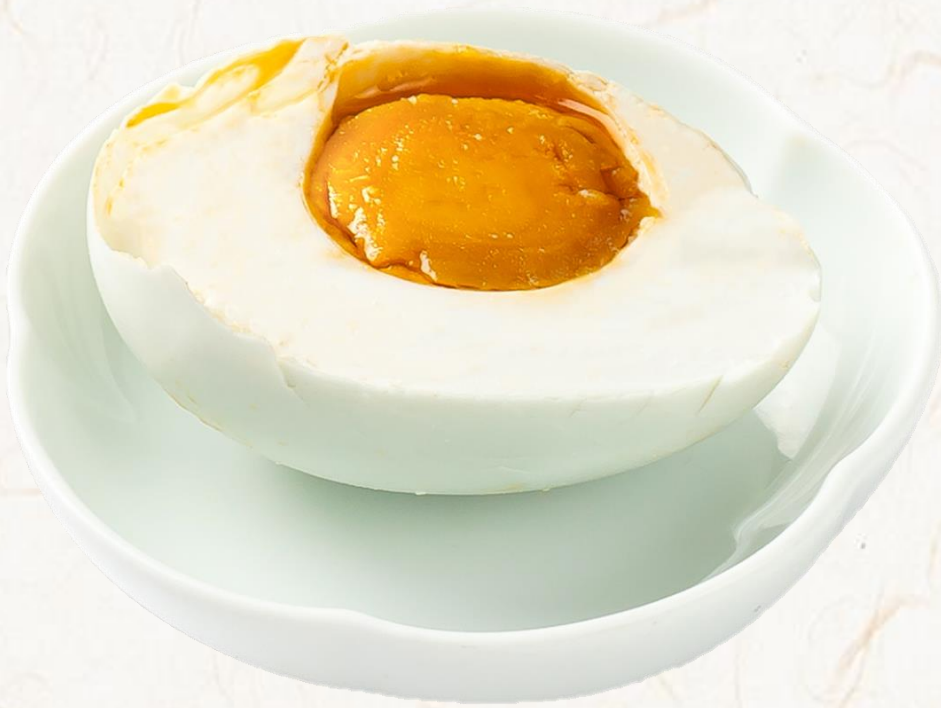
소금에 절인 오리알 Salted Egg 2