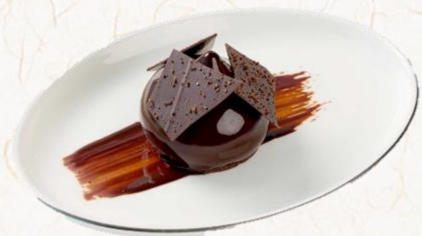
초콜릿 무스 케이크 Chocolate Mousse Cake 8