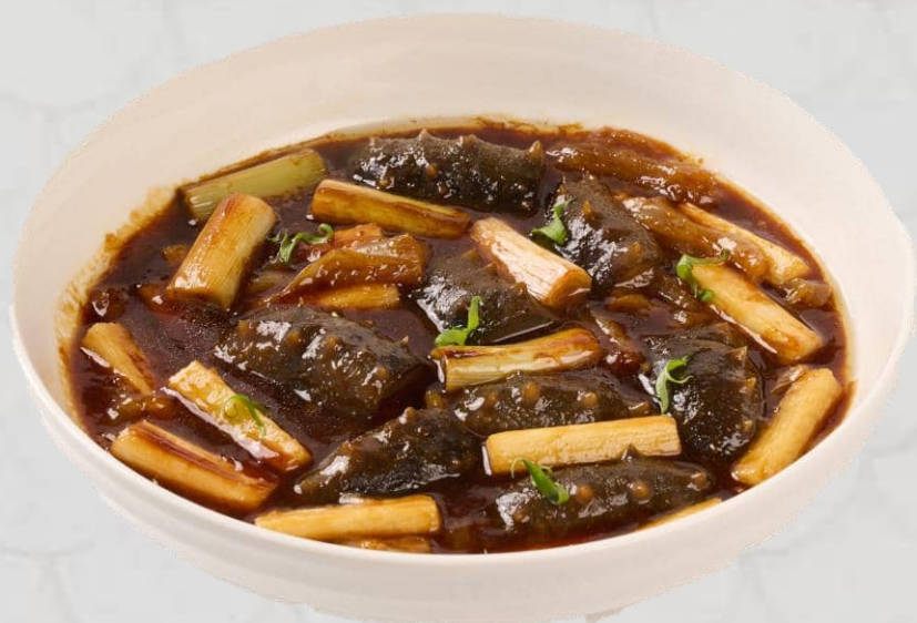
海參蔥燒蹄筋 Braised Sea Cucumber and Tendon with Scallions 118