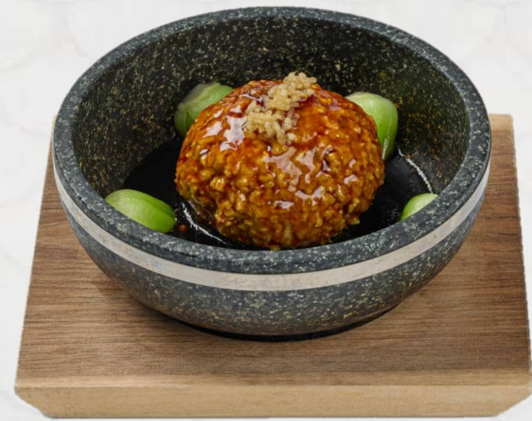
狀元奪魁獅子頭 Braised 'Lion's Head' with Salted Egg Yolk 26