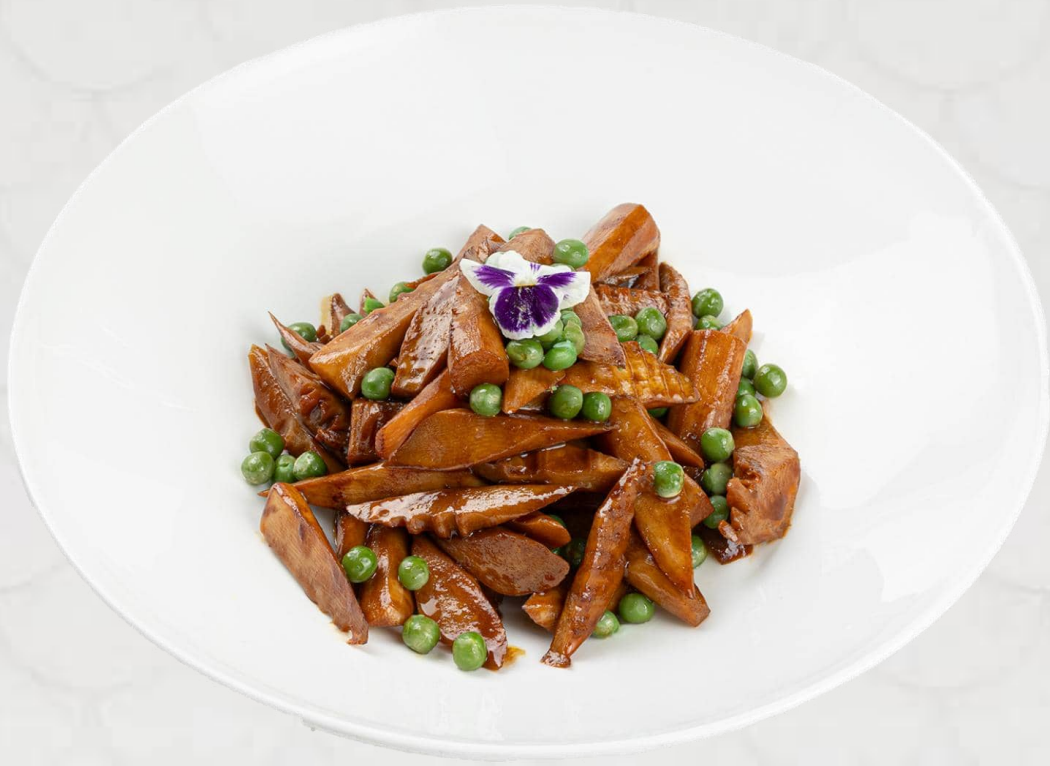
蜜豆油燜筍 Braised Bamboo Shoots with Sweet Beans 45