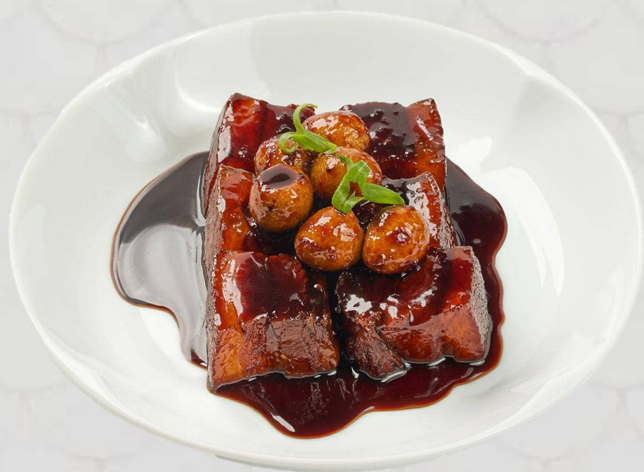
秘製紅燒肉 Jiangnan Style Braised Pork Belly 40