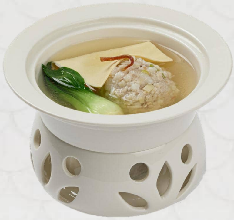
頂湯醃篤鮮獅子頭 'Lion's Head' in Superior Broth 20