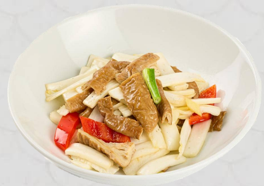
酸菜炒肥腸 Stir Fried Pork Intestines with Chinese Sour Pickles 20

價格均以韓幣1,000結尾單位結算，並已包含10%稅費及10%服務費。 Prices are in Korean Won at 1,000 value and include 10% tax and 10% service charge.