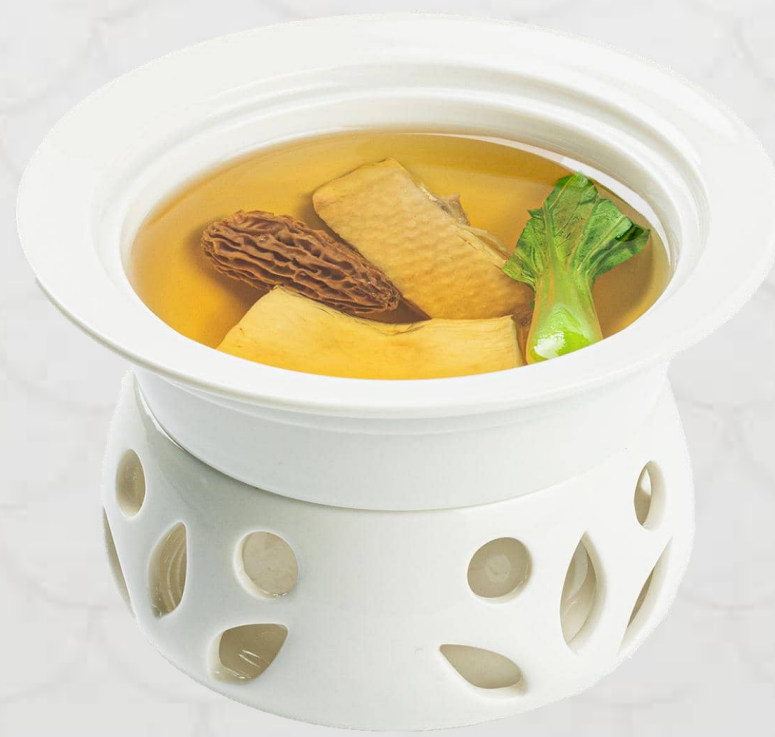
羊肚菌花膠老雞湯 Double Boiled Chicken Soup with Fish Maw and Morel 28