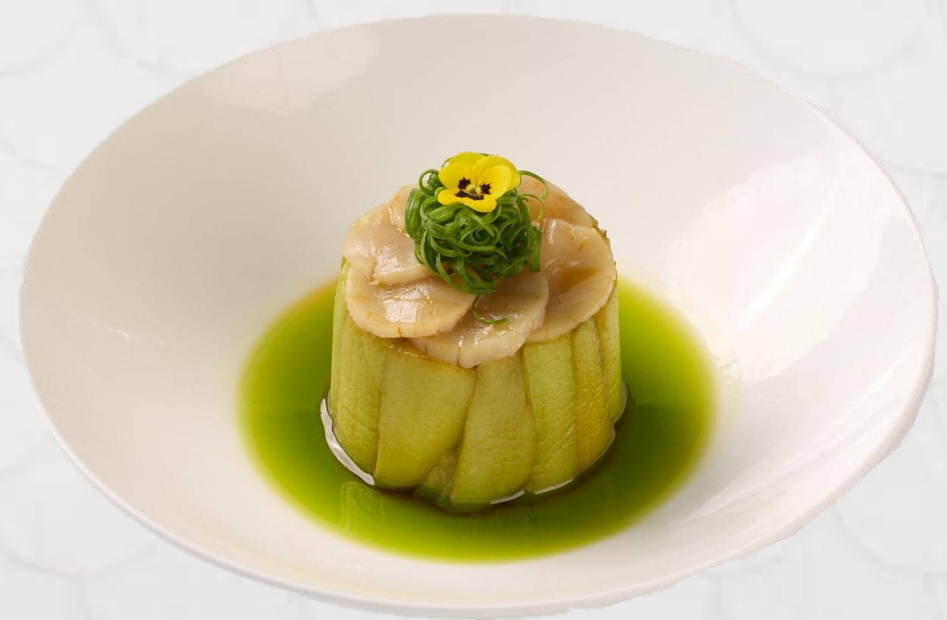
帶子油醋汁茄子 Chilled Eggplant and Scallops in Aromatic Vinaigrette 18