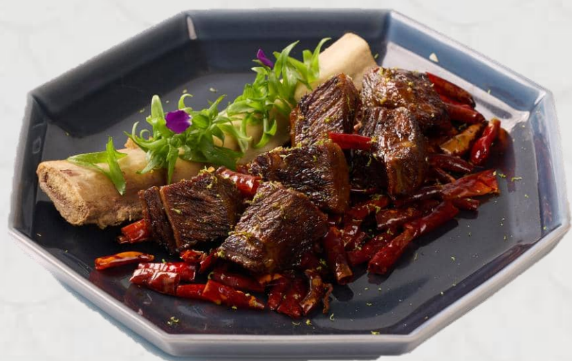
滋味脆皮牛肋骨 Crispy Beef Short Ribs 70