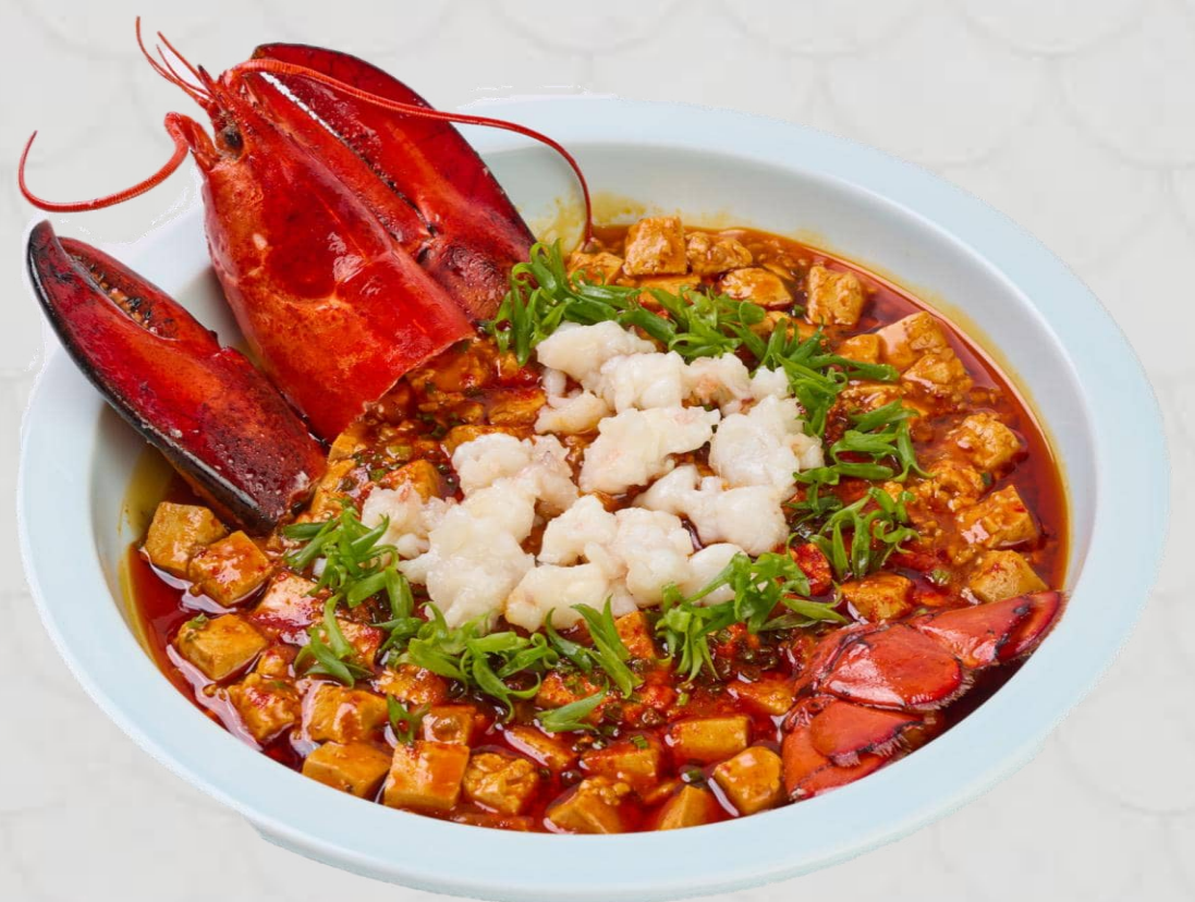
龍蝦麻婆豆腐 Boston Lobster Mapo Tofu, Minced Pork Spicy Sauce 135

價格均以韓幣1,000結尾單位結算，並已包含10%稅費及10%服務費。 Prices are in Korean Won at 1,000 value and include 10% tax and 10% service charge.