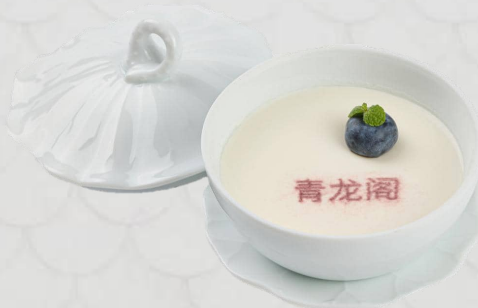
青龍閣奶凍 Blue Dragon Milk Pudding 8