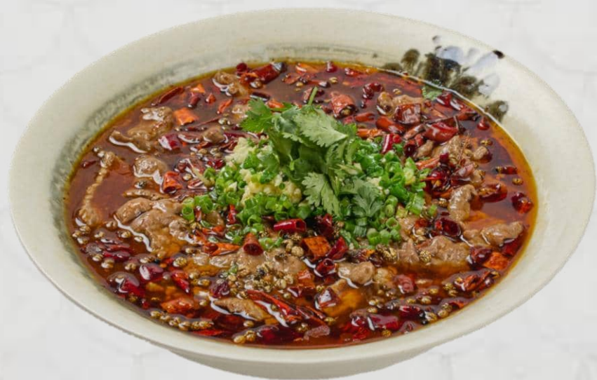
海派水煮牛肉 Shanghai Style Poached Sliced Beef 28