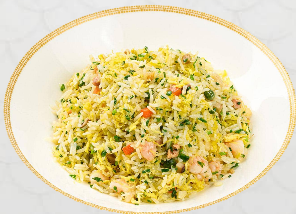
青龍閣炒飯 Blue Dragon Fried Rice 30