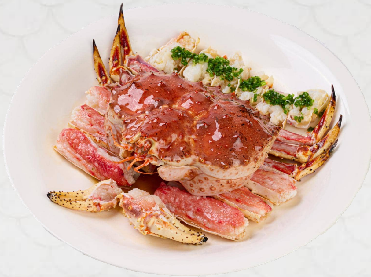
清蒸帝王蟹 Steamed King Crab 350 / kg