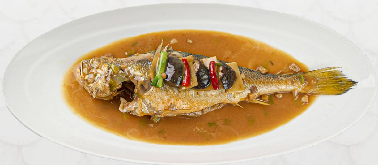
家燒野生黃魚 Braised Wild Yellow Croaker 160