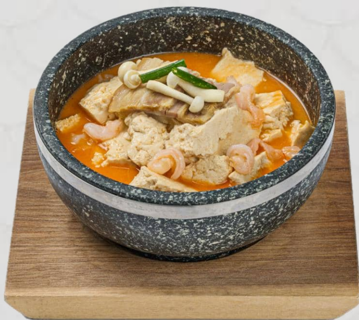
醃鮮菌菇老豆腐 Braised Aged Tofu with Pickled Mushrooms 20