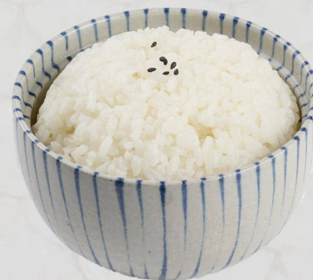
蒸香米飯 Steamed Rice 2

價格均以韓幣1,000結尾單位結算，並已包含10%稅費及10%服務費。 Prices are in Korean Won at 1,000 value and include 10% tax and 10% service charge.