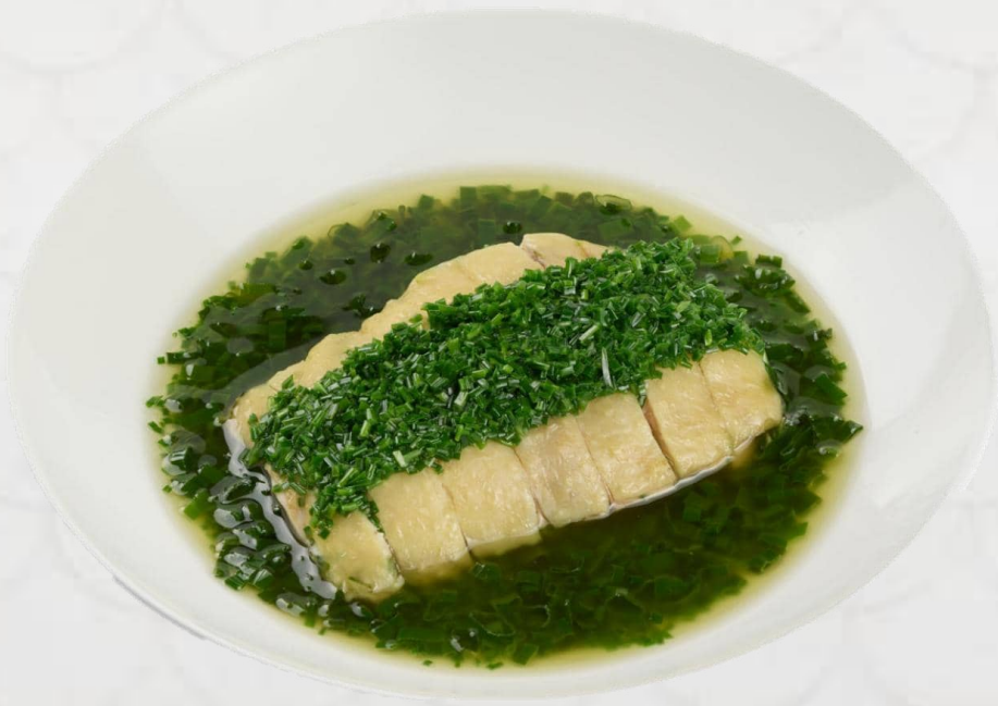
老上海蔥油雞 Traditional Shanghai Style Scallion Oil Chicken 18