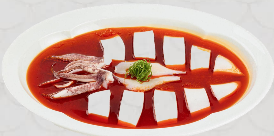
梅隴鎮蒜蓉鮮魷魚 Poached Fresh Squid, Garlic Chili Sauce 20