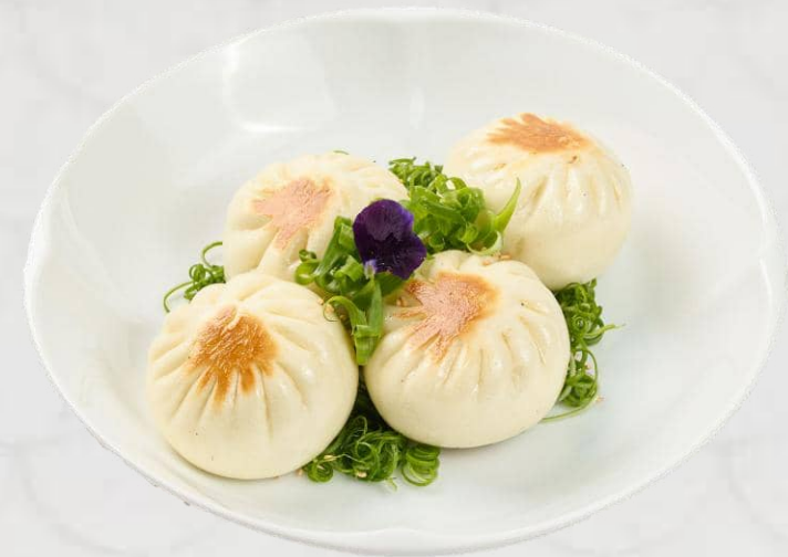
砂鍋蔥香煎包 (4 件) Pan Fried Buns with Chicken (4 pcs) 15