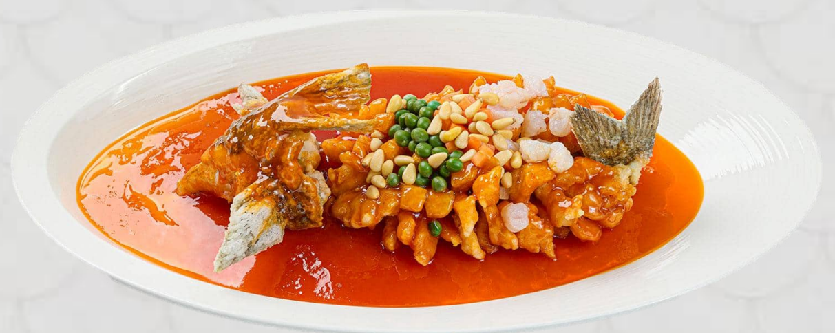
姑蘇松鼠黑石魚 Sweet and Sour Black Rockfish 60