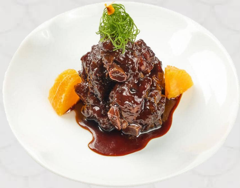
糖醋排骨 Shanghai Style Sweet and Sour Pork Ribs 35