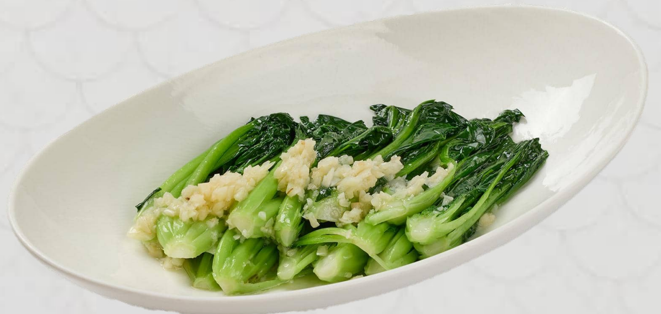
時令蔬菜 (清炒 / 蒜蓉炒 / 上湯金銀蛋) Seasonal Vegetables ( Stir Fried / Stir Fried with Garlic Gold and Silver Eggs in Superior Broth) 15

價格均以韓幣1,000結尾單位結算，並已包含10%稅費及10%服務費。 Prices are in Korean Won at 1,000 value and include 10% tax and 10% service charge.