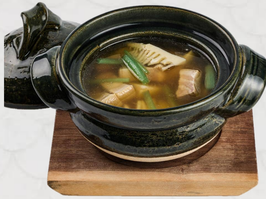
醃篤鮮 Salted Pork and Fresh Bamboo Shoot Soup 38