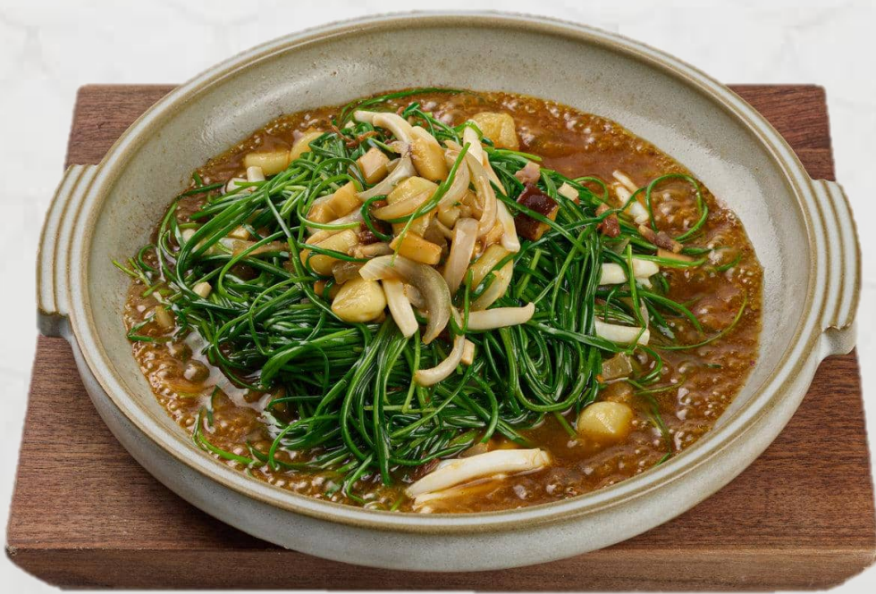
X.O. 醬焗沙蔥 Braised Mongolian Onion with X.O. Sauce 25