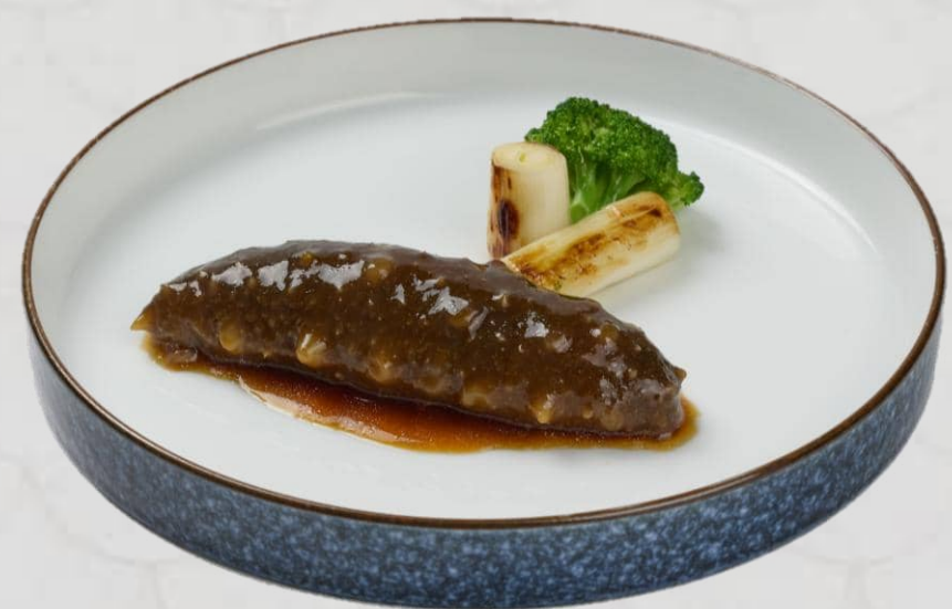
海派蔥香煨海參 (位) Braised Sea Cucumber with Leek (per person) 60

價格均以韓幣1,000結尾單位結算，並已包含10%稅費及10%服務費。 Prices are in Korean Won at 1,000 value and include 10% tax and 10% service charge.