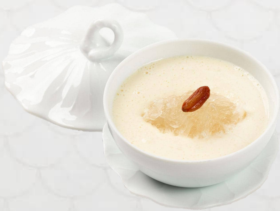
美齡燕窩粥 Madame Song's Bird's Nest Congee 38