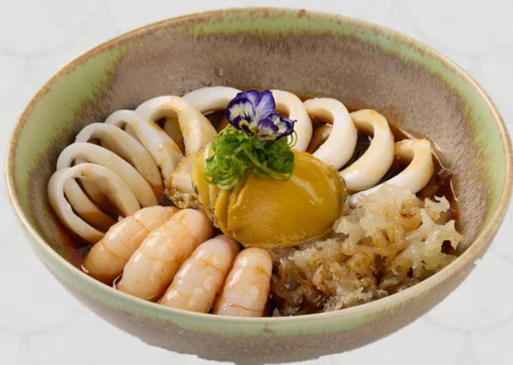
撈汁海鮮匯 Chilled Seafood Trio with Signature Sauce 26