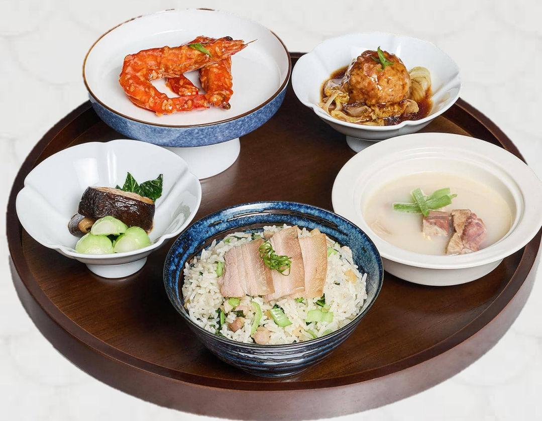
老上海鹹肉菜飯(套餐) Old Shanghai Salted Pork & Vegetable Rice (Set) 40