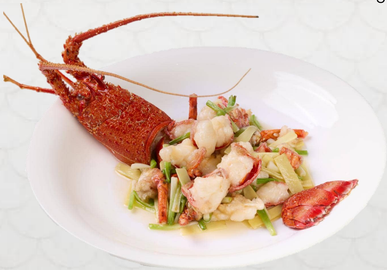
姜葱炒澳洲龍蝦 Stir Fried Australian Lobster with Scallions and Ginger 350 / kg