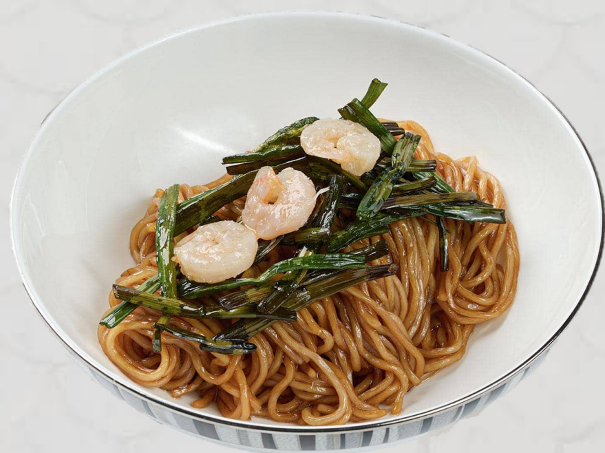
蝦乾蔥油拌麵 Scallion Oil Noodles with Dried Shrimp 12