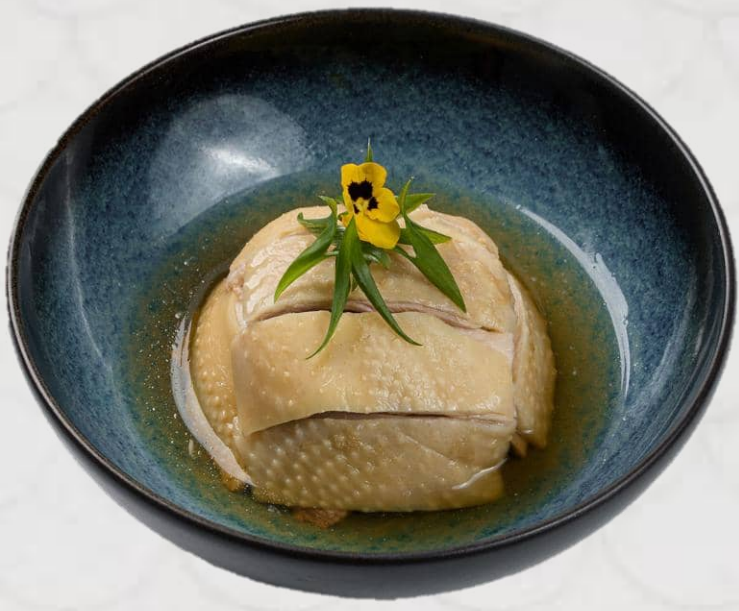
陳釀花雕熟醉雞 Huadiao Drunken Chicken 20