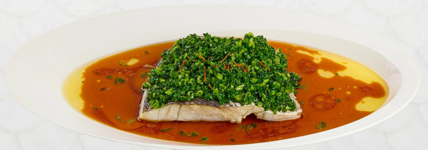
蔥香蒸米魚 Steamed Brown Croaker with Scallions 98