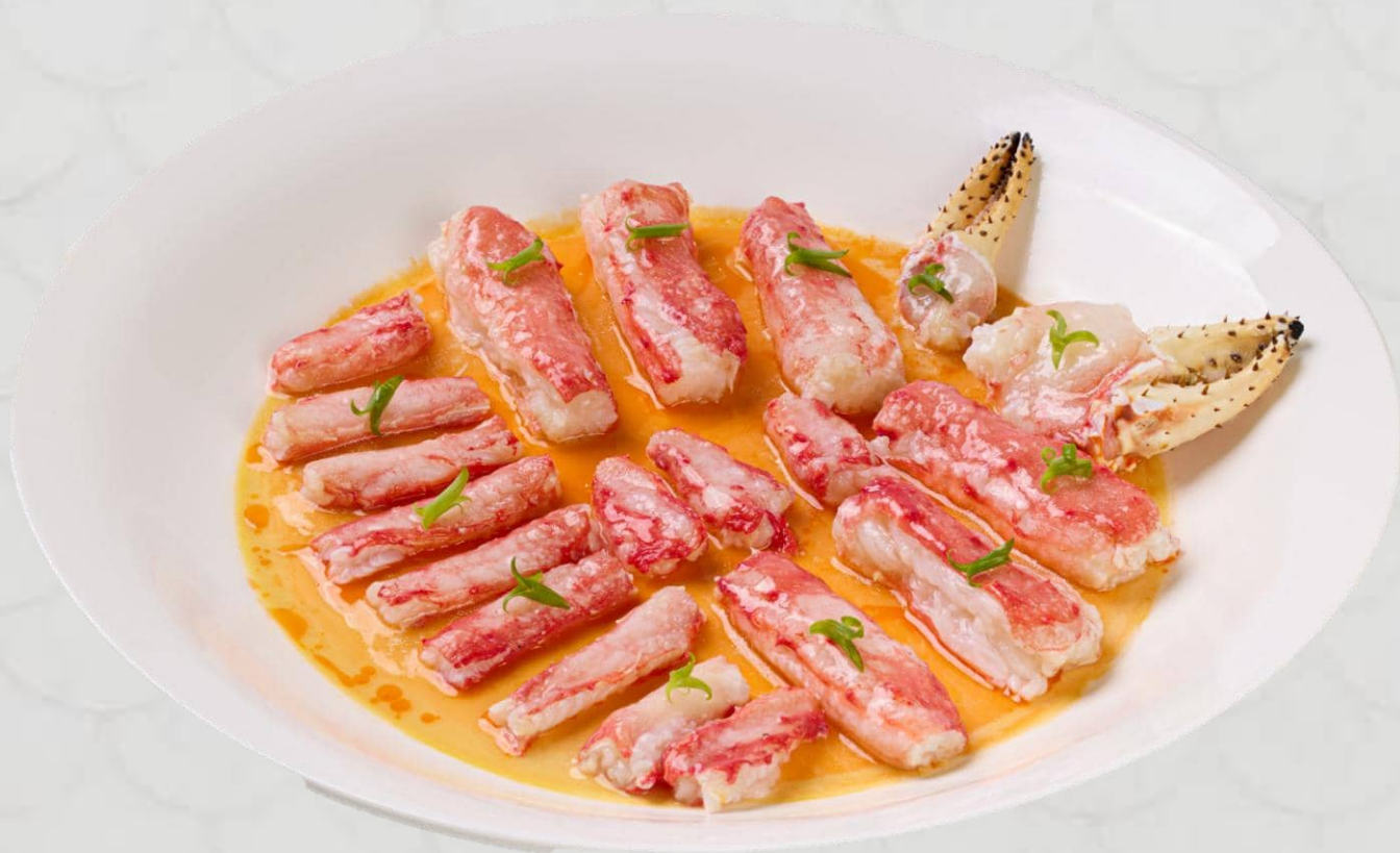
芙蓉花雕蒸帝王蟹 Steamed King Crab with Egg White in Huadiao Sauce 350 / kg