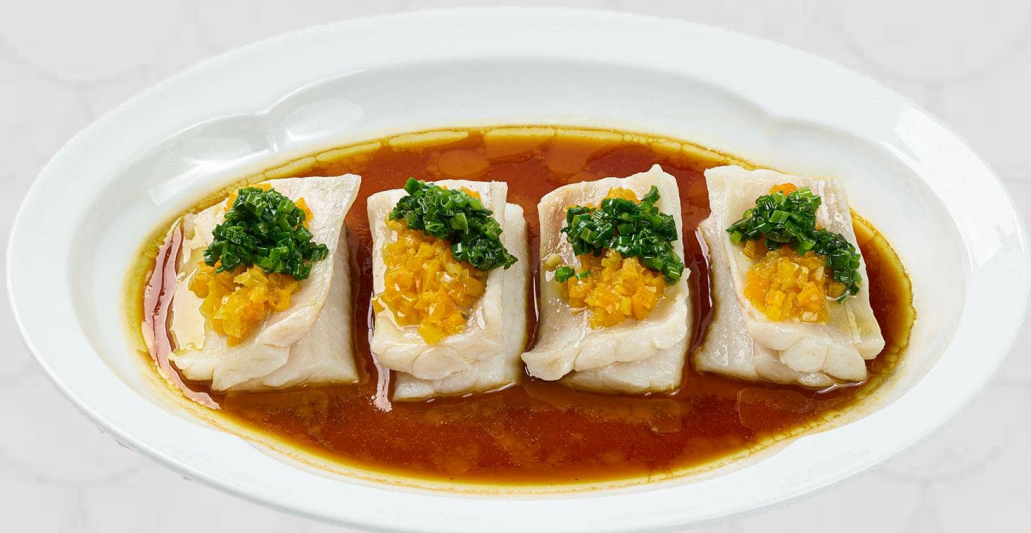
黃貢椒醬蒸濟州帶魚 Steamed Jeju Hairtail with Yellow Chili Paste 68