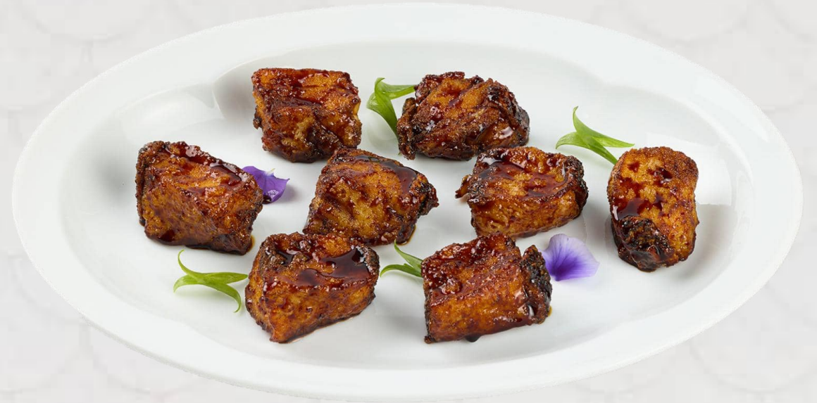
蘇式燻魚 Suzhou Style Smoked Fish 30