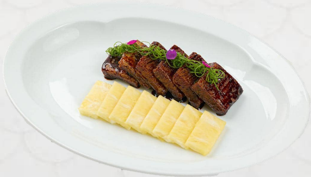
糖醋脆皮玲瓏肉 Shanghai Style Sweet and Sour Crispy Pork 30