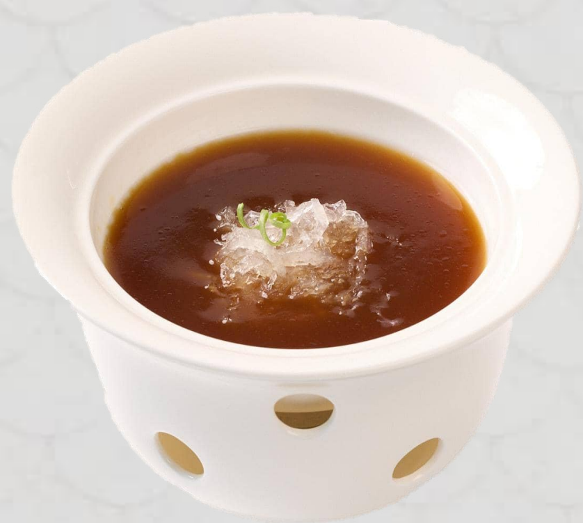
海派紅燒燕窩 Shanghai Style Braised Bird's Nest 160

價格均以韓幣1,000結尾單位結算，並已包含10%稅費及10%服務費。 Prices are in Korean Won at 1,000 value and include 10% tax and 10% service charge.