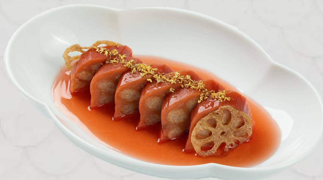
姑蘇糯米藕 Lotus Root Stuffed with Glutinous Rice 15

價格均以韓幣1,000結尾單位結算，並已包含10%稅費及10%服務費。 Prices are in Korean Won at 1,000 value and include 10% tax and 10% service charge.