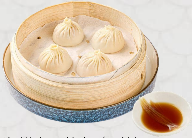
上海鮮肉小籠包 (4 件) Steamed Shanghainese Pork Dumplings (4 pcs) 18