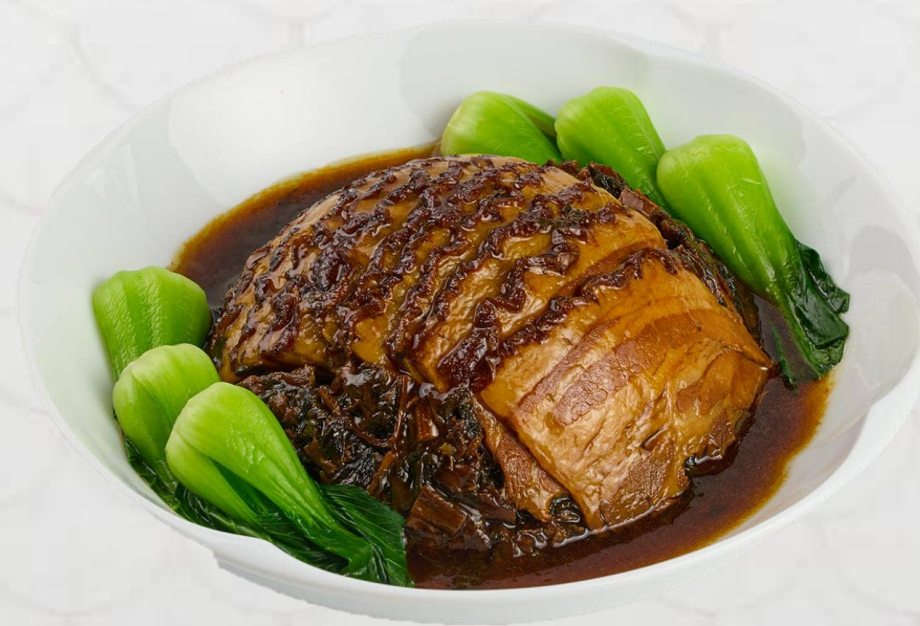
本幫扣肉 Braised Pork Belly in Shanghai Style 48