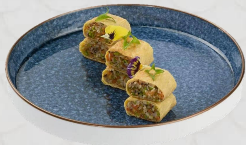
什錦素燒鵝 Vegetarian 'Roast Goose' (Tofu Skin & Zucchini Roll) 15