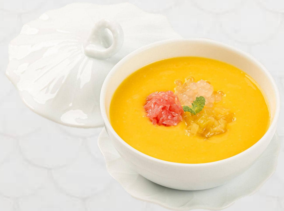
桃園秋色西米露 Peach Blossom Autumn - Mango Sago 13