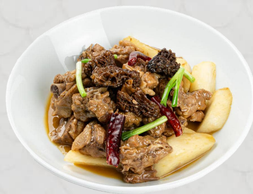
江南家燒鴨 Jiangnan Home-Style Braised Duck 38

價格均以韓幣1,000結尾單位結算，並已包含10%稅費及10%服務費。 Prices are in Korean Won at 1,000 value and include 10% tax and 10% service charge.