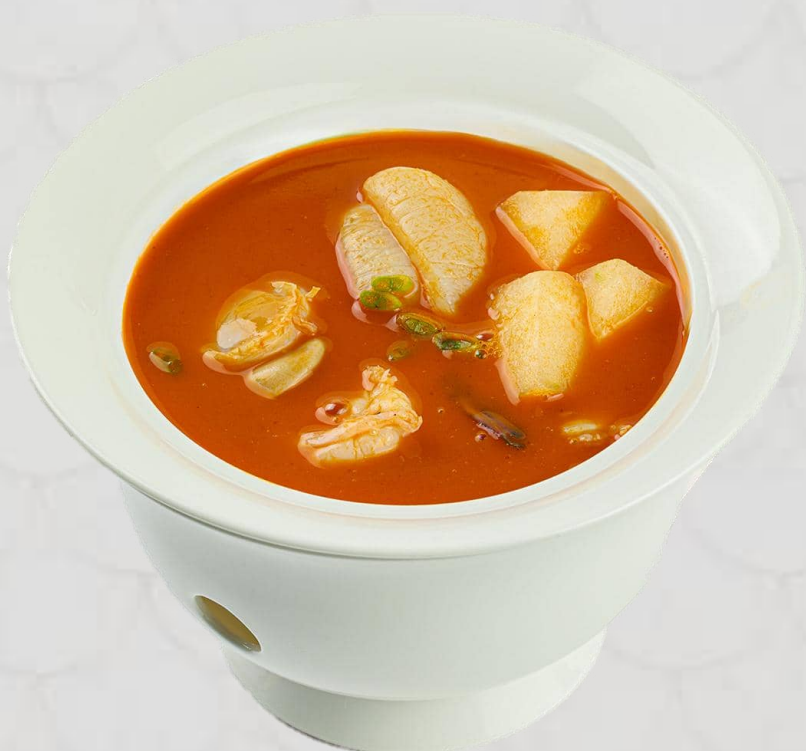
冬蔭功海鮮湯 Seafood Tom Yum Goong 38