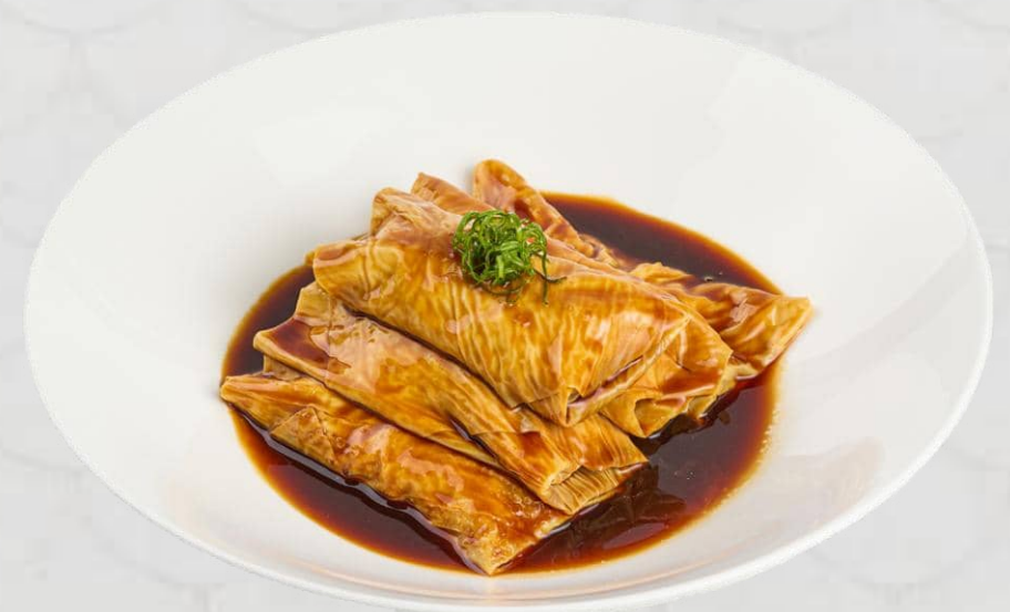
上海黃醬包 Shanghai style Braised Tofu Skin Rolls with Minced Pork 28