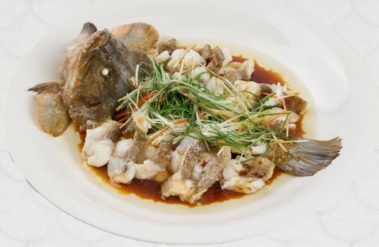
港式清蒸紅斑 Soy Sauce Steamed Red Spotted Grouper 380 / kg