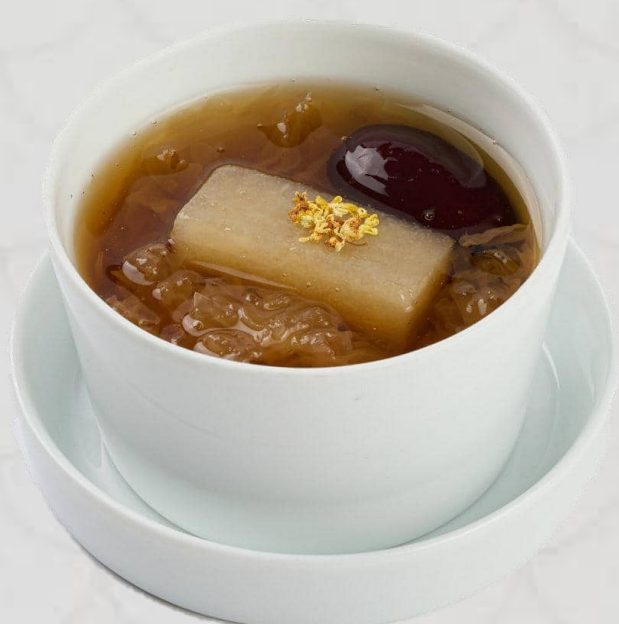
冰糖雪耳炖韩梨 Sweet Pear Soup with Snow Fungus 15