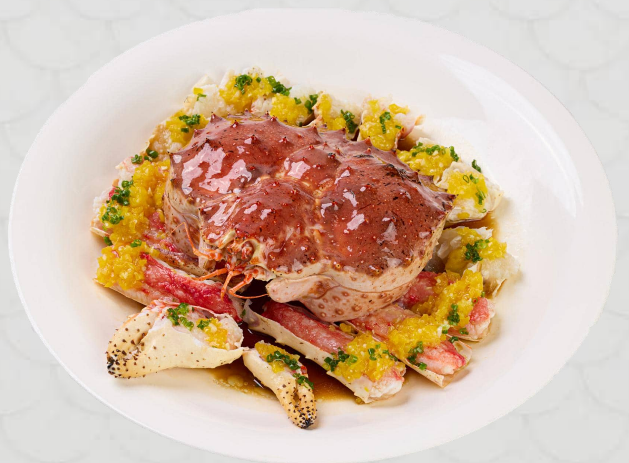
黄椒酱蒸帝王蟹 Steamed King Crab with Yellow Chili Paste 350 / kg