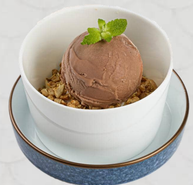
自製冰淇淋 (單球 / 雙球) Homemade Ice Cream (Single / Double) 8 / 12

價格均以韓幣1,000結尾單位結算，並已包含10%稅費及10%服務費。 Prices are in Korean Won at 1,000 value and include 10% tax and 10% service charge.