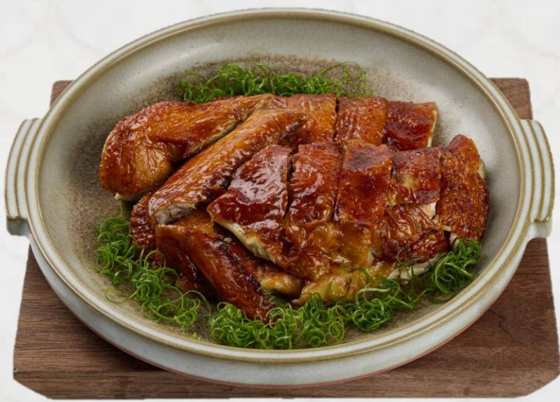
黃金飄香鸡 Clay Pot Free-Range Chicken with Scallions 36