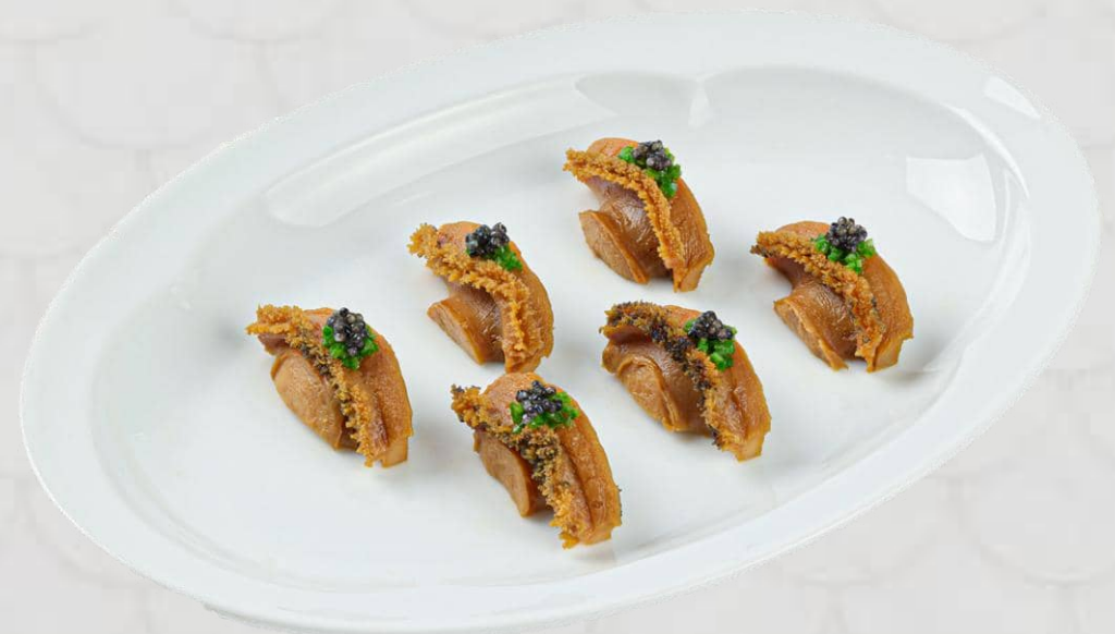
冰鎮鮑魚 Chilled Abalone 26