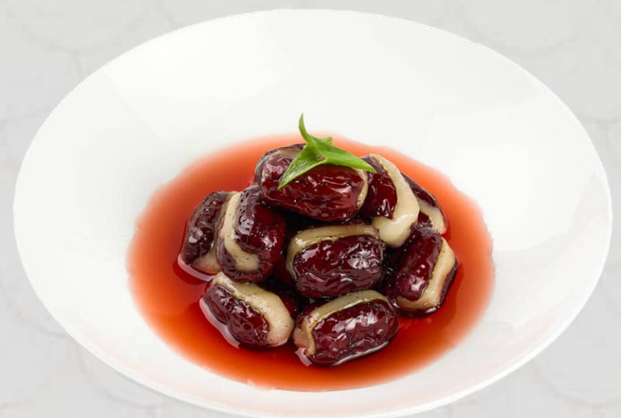
蜜汁心太軟 Glutinous Rice Stuffed Red Dates 20

價格均以韓幣1,000結尾單位結算，並已包含10%稅費及10%服務費。 Prices are in Korean Won at 1,000 value and include 10% tax and 10% service charge.