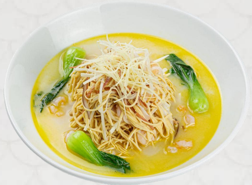
揚州大煮干絲 Shredded Bean Curd in a Superior Broth 25