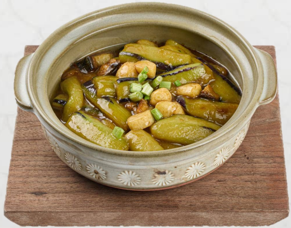
鹹魚蒸茄子煲 Braised Eggplant and Salted Fish in Clay Pot 25