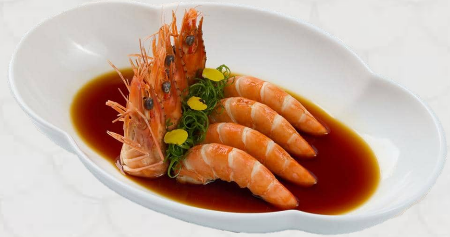
江南熟醉蝦 Jiangnan Style Drunken Shrimp 20