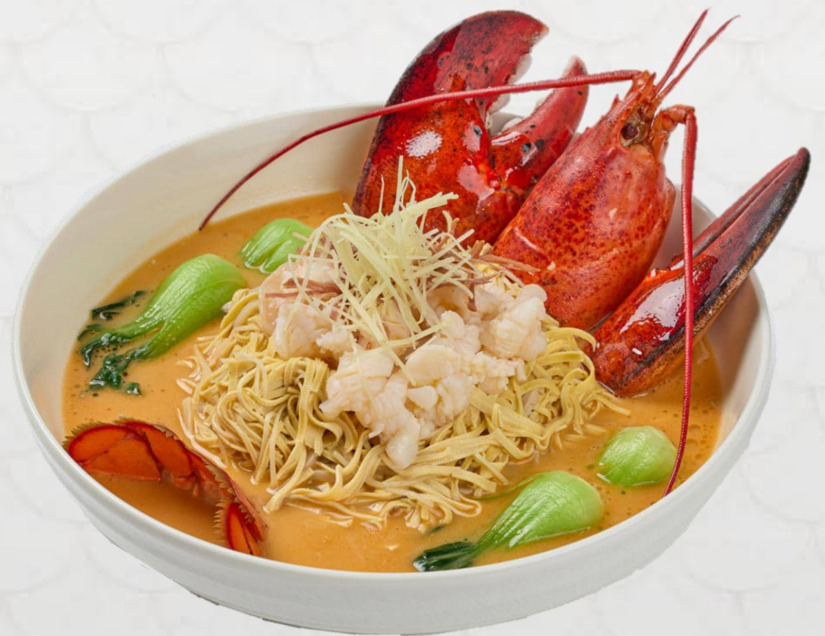
龍蝦湯大煮乾絲 Shredded Bean Curd with Boston Lobster 135