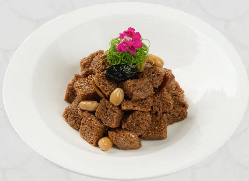
老上海四喜烤麩 Four Delights 'Kao Fu' 15