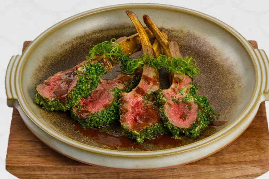
葱香法式羊排 Herb Crusted French Lamb Chops 58