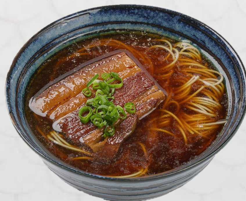
蘇式紅湯奧灶麵 Suzhou Style Ao Zao Noodles in Rich Red Broth 18