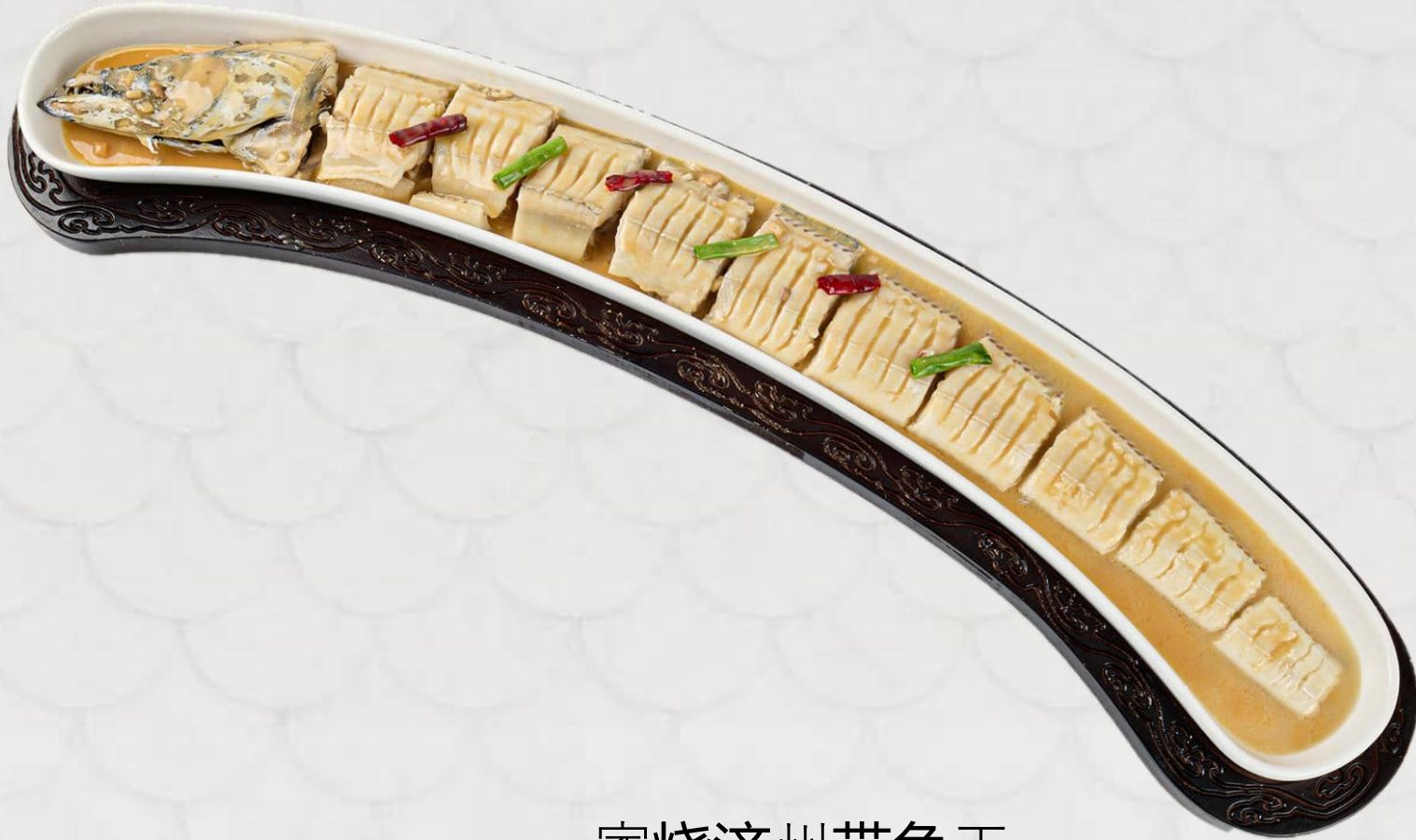
家燒濟州帶魚王 Braised Premium Jeju Hairtail 228