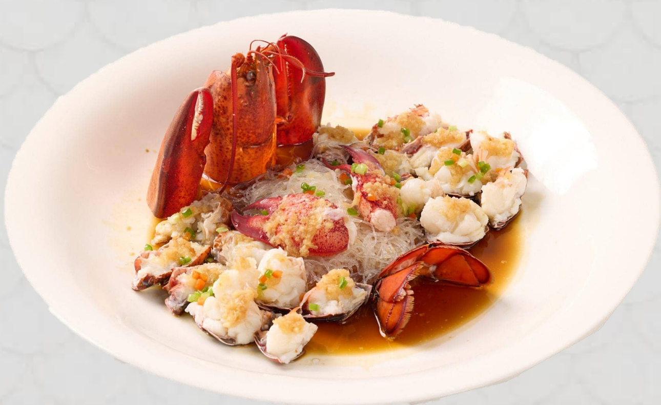
蒜蓉粉絲蒸波士頓龍蝦 Steamed Boston Lobster with Vermicelli and Minced Garlic 135