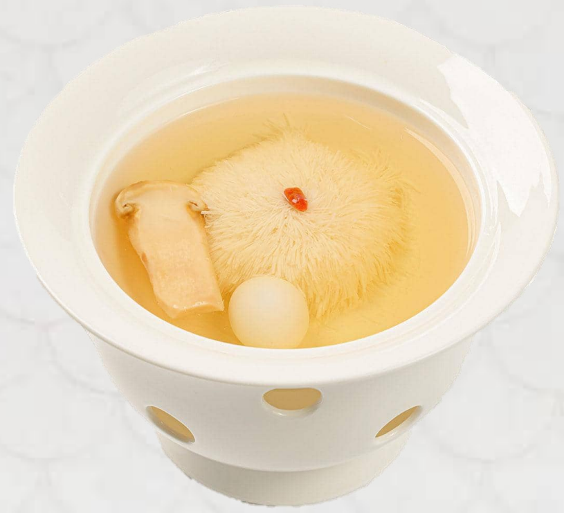
松茸燉文思繡球豆腐 Wensi Tofu Soup with Matsutake 20