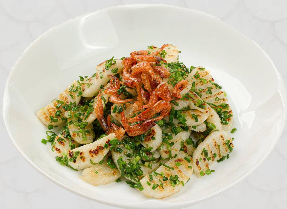
櫻花蝦蔥爆山藥 Stir Fried Yam with Scallions and Sakura Shrimp 18