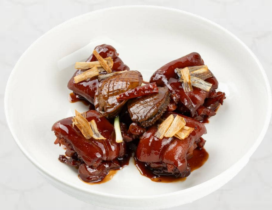
脆蔥豬手炆鮑魚 Braised Pig Knuckle and Abalone with Crispy Fried Scallions 50