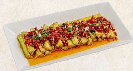
剁椒蒸茄子 Steamed eggplant, chopped chili paste 16

价格均以韩币1,000结尾单位结算，并已包含10%税费及10%服务费。 Prices are in Korean Won at 1,000 value and include 10% tax and 10% service charge