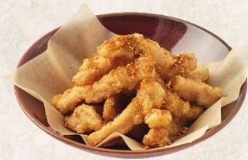
酥炸猪颈肉 Deep fried pork neck with chili pepper 18