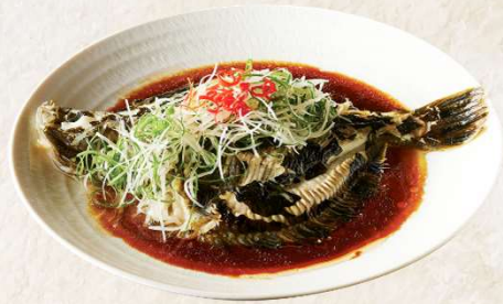
黑石鱼 / 比目鱼