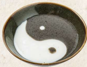
太极芝麻糊 (每位) Yin-yang black sesame soup (per person) 12