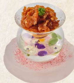
葱油凉拌海蜇 Pickled jelly fish, onion oil 16