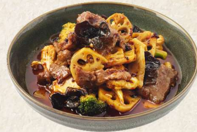
麻辣牛肉香锅 Wok fried assorted vegetable, black fungus, sliced beef, hot chili sauce 35