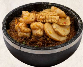
海皇粉丝煲 Braised assorted seafood with vermicelli and black pepper sauce 32