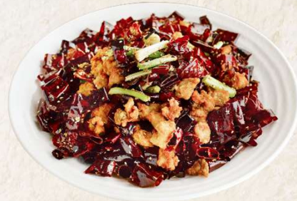
爆炒辣子鸡丁 Deep fried chicken, chili 42