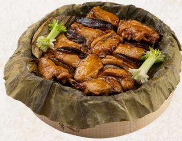
笼仔荷香蒸滑鸡 Steamed chicken with black mushrooms wrapped by lotus leaf 32