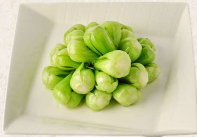
田园绿时蔬 Seasonal vegetables 蒜蓉/蚝油 Wok fried with garlic / Oyster sauce