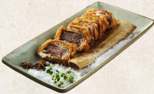
脆皮牛肋骨 Deep fried beef ribs, black pepper sauce 46