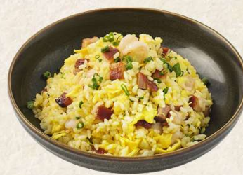
中餐厅炒饭 “China House” fried rice, prawn, barbecued pork 29