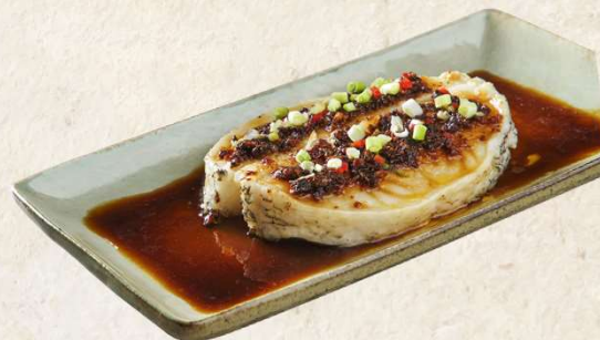
豉汁银鳕鱼 Steamed deep sea codfish, black bean sauce 52

价格均以韩币1,000结尾单位结算，并已包含10%税费及10%服务费。 Prices are in Korean Won at 1,000 value and include 10% tax and 10% service charge