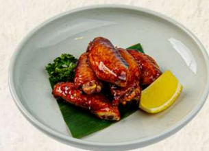
蜜汁烧鸡翅 Barbecue chicken wings 14

价格均以韩币1,000结尾单位结算, 并已包含10%税费及10%服务费。 Prices are in Korean Won at 1,000 value and include 10% tax and 10% service charge