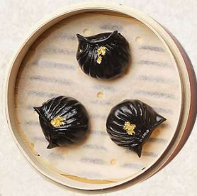
金铂龙虾饺 (三件) Steamed lobster dumpling (3 pieces) 48