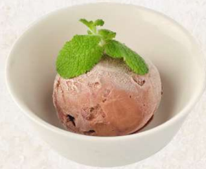
自制冰淇淋 Homemade ice cream 10 / 单球 single 12 / 双球 double