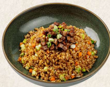
酱油牛肉炒饭 Fried rice with beef, deep fried garlic, soy sauce 18