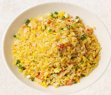
龙虾肉炒饭 Fried rice with lobster meat and vegetables 48