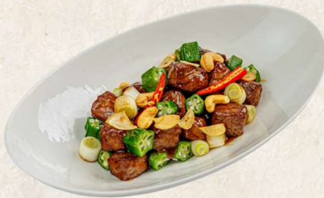
秋葵腰果酱爆牛肉粒 Wok fried diced beef tenderloin with okra, cashew nut 58