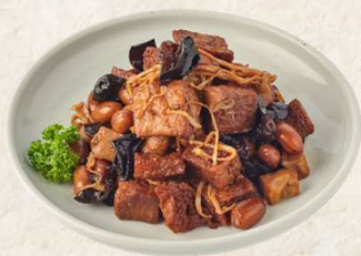
上海四喜烤麸 Shanghainese braised "Kao Fu" 14