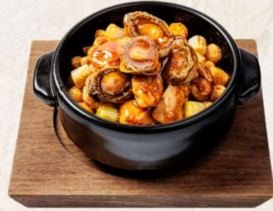
鲍鱼鸡煲 Braised abalone and chicken in a clay pot 42