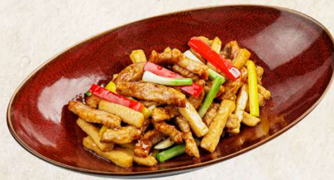
菌菇爆猪颈柳 Stir fried pork neck with mushroom 42

价格均以韩币1,000结尾单位结算, 并已包含10%税费及10%服务费。 Prices are in Korean Won at 1,000 value and include 10% tax and 10% service charge