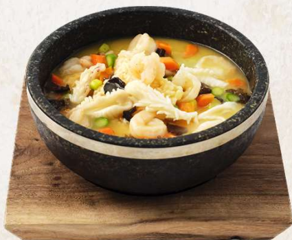
三鲜锅巴 Assorted seafood with deep fried rice crackers 32