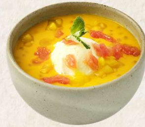
冻杨枝甘露配冰淇淋 Chilled mango cream, sago, pomelo, ice cream 13