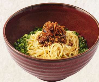
葱油拌面 Dried noodles with spring onion oil, minced pork and mushroom 19