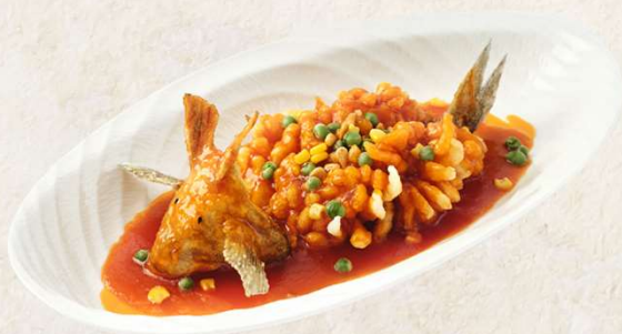
松鼠黑石鱼 Crispy black rock fish, sweet and sour sauce 66