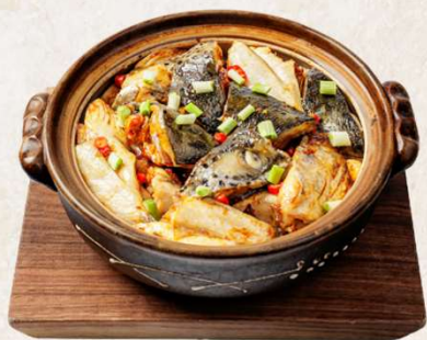
生啫三文鱼头煲 Salmon head with scallion in casserole 58