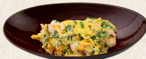
韭菜滑蛋虾球 Wok fried shrimp with leek and egg 28

价格均以韩币1,000结尾单位结算，并已包含10%税费及10%服务费。 Prices are in Korean Won at 1,000 value and include 10% tax and 10% service charge