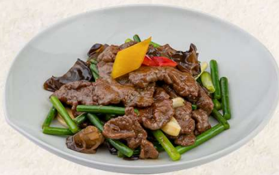
蒜苔云耳炒牛肉 Wok fried sliced beef and black fungus with garlic 26