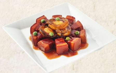
鲍鱼红烧肉 Braised pork belly, abalone, sweet soy sauce 65

价格均以韩币1,000结尾单位结算，并已包含10%税费及10%服务费。 Prices are in Korean Won at 1,000 value and include 10% tax and 10% service charge