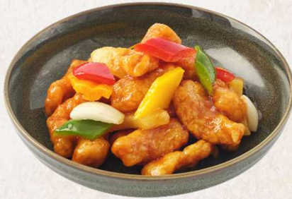
酸甜咕嚕肉 Sautéed sweet and sour pork 38