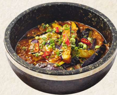
香辣鱼香茄子 Braised eggplant, dried fish, minced pork, bean paste 23