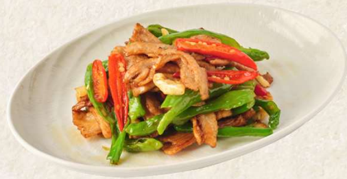
青椒炒猪肉 Stir fried pork belly, green pepper 32