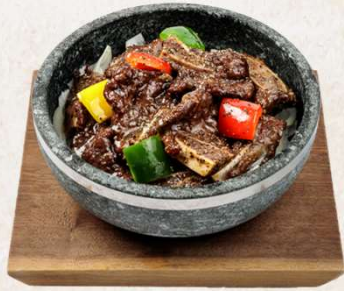
黑椒牛仔骨 Stir fried black pepper short ribs 46