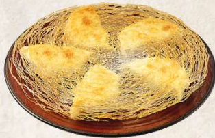
香脆煎锅贴 (5件) Pan fried pork and shrimp dumpling (5 pieces) 18