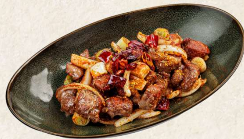
爆炒羊肉(微辣) Stir fried lamb, dried chili 46