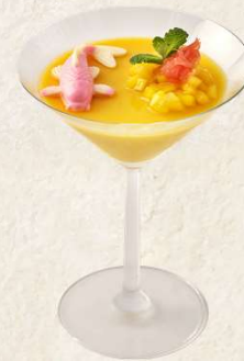
冻芒果布丁 Chilled mango pudding 12