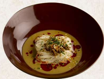
担担面 (每位) “Dan Dan” noodle (per person) 19