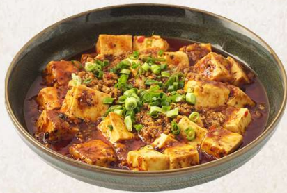
麻婆豆腐 Tofu and minced beef with chili sauce 24