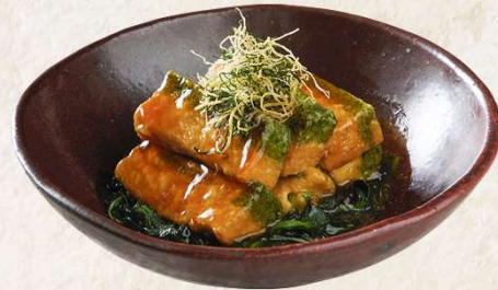
秘制菠菜焖豆腐 Braised spinach tofu, oyster sauce 28