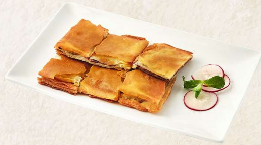
香酥豆沙薄脆 Pan fried red bean cake 16