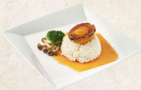
鲜鲍鱼捞饭 Braised Jeju abalone with rice 26

价格均以韩币1,000结尾单位结算，并已包含10%税费及10%服务费。 Prices are in Korean Won at 1,000 value and include 10% tax and 10% service charge