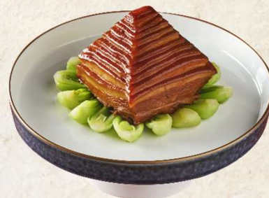
东坡肉 Braised pork belly in bean paste 58

价格均以韩币1,000结尾单位结算，并已包含10%税费及10%服务费。 Prices are in Korean Won at 1,000 value and include 10% tax and 10% service charge