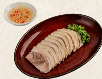
盐水熏蹄 Salt marinated pork knuckle 15