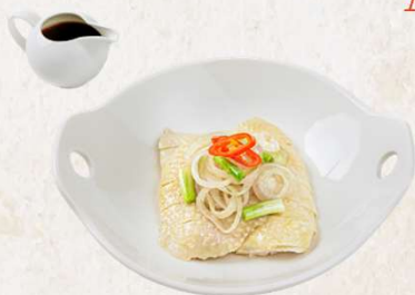
红葱头油淋鸡 Poached chicken, onion, soy sauce 38