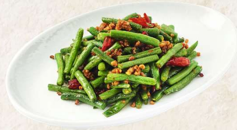
干煸四季豆 Wok fried string beans, minced pork, dry chili