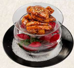
醋汁带鱼 Deep fried hairtail in vinegar sauce 38