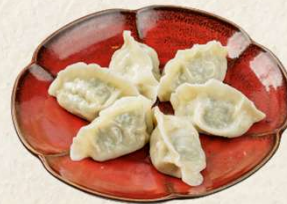
韭菜鲜虾水饺 (6件) Minced prawn, cabbage, leek dumpling (6 piece) 15