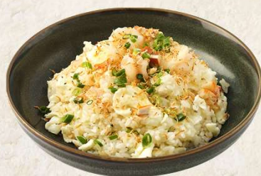
樱花虾蟹肉炒饭 Fried rice with sakura shrimp, crab meat, egg white and vegetables 28

价格均以韩币1,000结尾单位结算，并已包含10%税费及10%服务费。 Prices are in Korean Won at 1,000 value and include 10% tax and 10% service charge