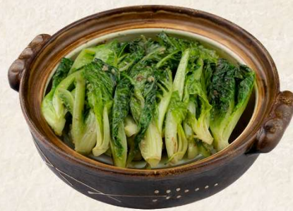
虾酱啫啫唐生菜煲 Sizzling lettuce in a clay pot with preserved shrimp paste