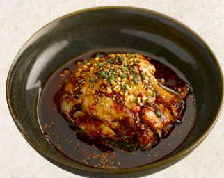
传统口水鸡 Poached chicken, crushed peanut, spicy sauce 19