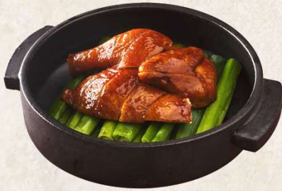
玫瑰露葱油鸡 Braised chicken with chives, scallion oil, soy sauce 42