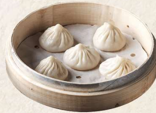
上海小笼包 (5件) Shanghainese steamed pork dumpling (5 pieces) 26