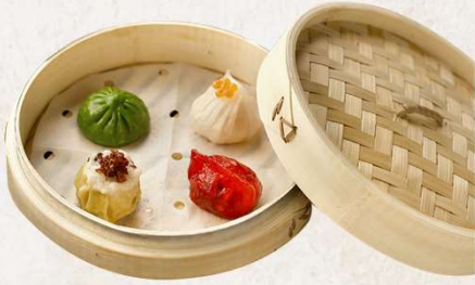
四式美点盘 (4件) X.O. 酱香菇烧卖, 水晶虾饺, 潮州粉果, 上海小笼包

Steamed assorted dumpling (4 pieces) X.O. mushroom, Shrimp, Steamed meat and peanut Shanghainese steamed pork