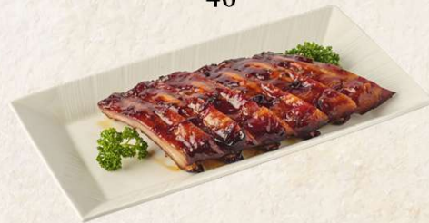
蜜汁烧排骨 Barbecue pork ribs 20