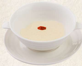
椰汁冰糖官燕100克 (每位) Double boiled sweetened superior bird's nest with almond and coconut cream 100 gm (per person) 160

价格均以韩币1,000结尾单位结算，并已包含10%税费及10%服务费。 Prices are in Korean Won at 1,000 value and include 10% tax and 10% service charge