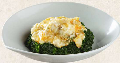
蟹肉烩西兰花 Sautéed broccoli, crab meat 32