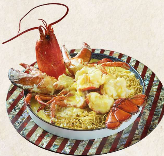
芝士黄油龙虾两面黄 Baked lobster with butter and cheese Served with pan fried egg noodle 128

价格均以韩币1,000结尾单位结算，并已包含10%税费及10%服务费。 Prices are in Korean Won at 1,000 value and include 10% tax and 10% service charge