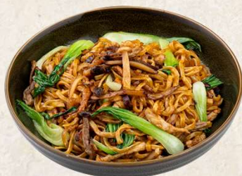
鲍汁肉丝焖伊面 Braised E-fu noodle with pork, oyster sauce 22