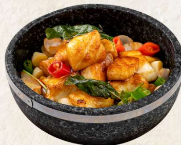
三杯鳕鱼煲 Stewed codfish with ginger and wine in casserole 58