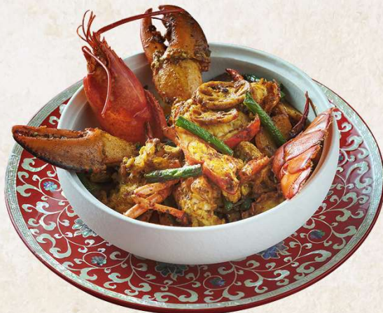
麻辣龙虾香锅 Wok fried lobster with assorted vegetables, hot chili sauce 128