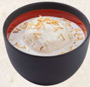
椰汁西米露 配冰淇淋 Chilled coconut cream, sago, ice cream 12