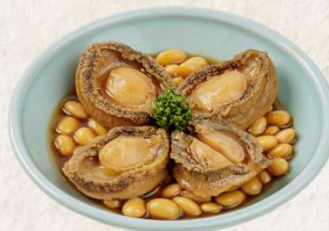
卤水鲍鱼仔 Marinated abalone 25