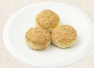
黄桥烧饼(3件) Baked minced pork flaky pastry 12

价格均以韩币1,000结尾单位结算, 并已包含10%税费及10%服务费。 Prices are in Korean Won at 1,000 value and include 10% tax and 10% service charge