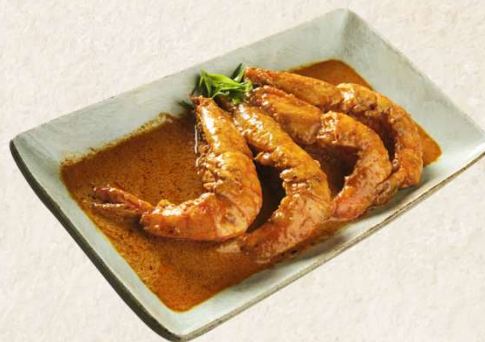
金榜大虾 Braised king prawns, spiced chili sauce 42