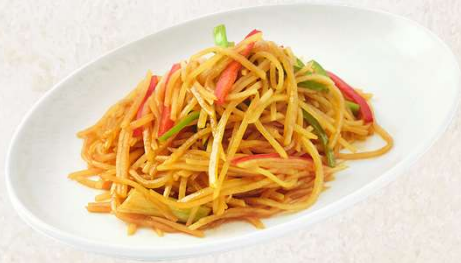
酸辣土豆丝 Stir fried shredded potatoes, hot and sour sauce