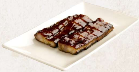
蜜汁叉烧 Barbecue pork "Char Siu" 46