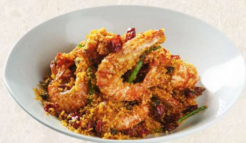
避风塘炒虾 Stir fried shrimp with deep fried garlic, dry chili 40