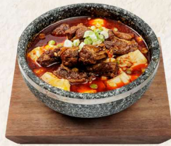
石锅豆花牛肉(微辣) Braised spicy beef and tofu 46