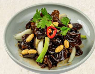
香醋洋葱拌木耳花生 Black fungus, onion and peanut tossed in vinegar 14

价格均以韩币1,000结尾单位结算，并已包含10%税费及10%服务费。 Prices are in Korean Won at 1,000 value and include 10% tax and 10% service charge