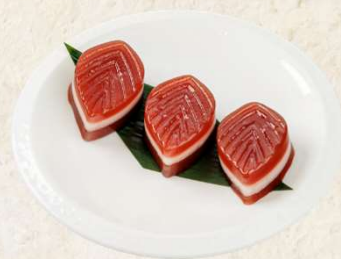
枣皇糕(3件) Jujube cake (3 pieces) 12

价格均以韩币1,000结尾单位结算, 并已包含10%税费及10%服务费。 Prices are in Korean Won at 1,000 value and include 10% tax and 10% service charge