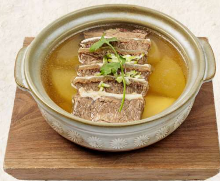
清汤萝卜牛腩煲 Stewed beef brisket with supreme broth 46