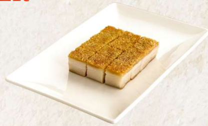
脆皮烧猪肉 Roasted pork belly 46