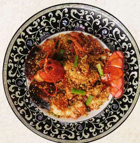
蒜蓉辣椒炒龙虾 Stir fried lobster with garlic, chili 128