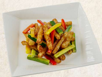
酸甜淮山 Sweet and sour crispy yam