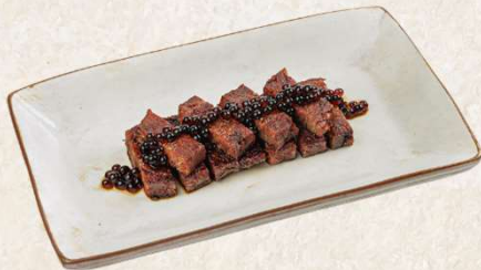
蜜汁烧牛面腩 Barbecue beef cheek 20