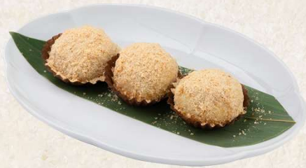
黑芝麻汤圆 Black sesame glutinous rice ball 12