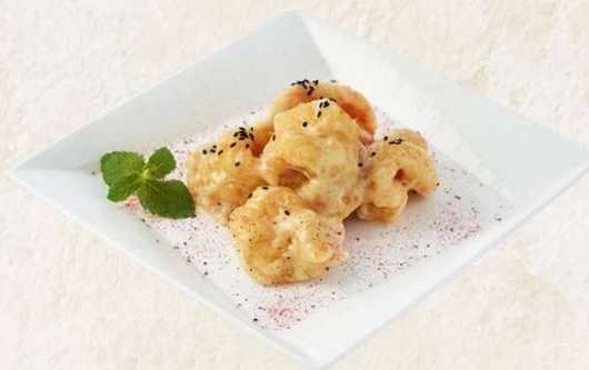
珊瑚汁炸虾球 Deep fried prawns, wasabi mayonnaise 36