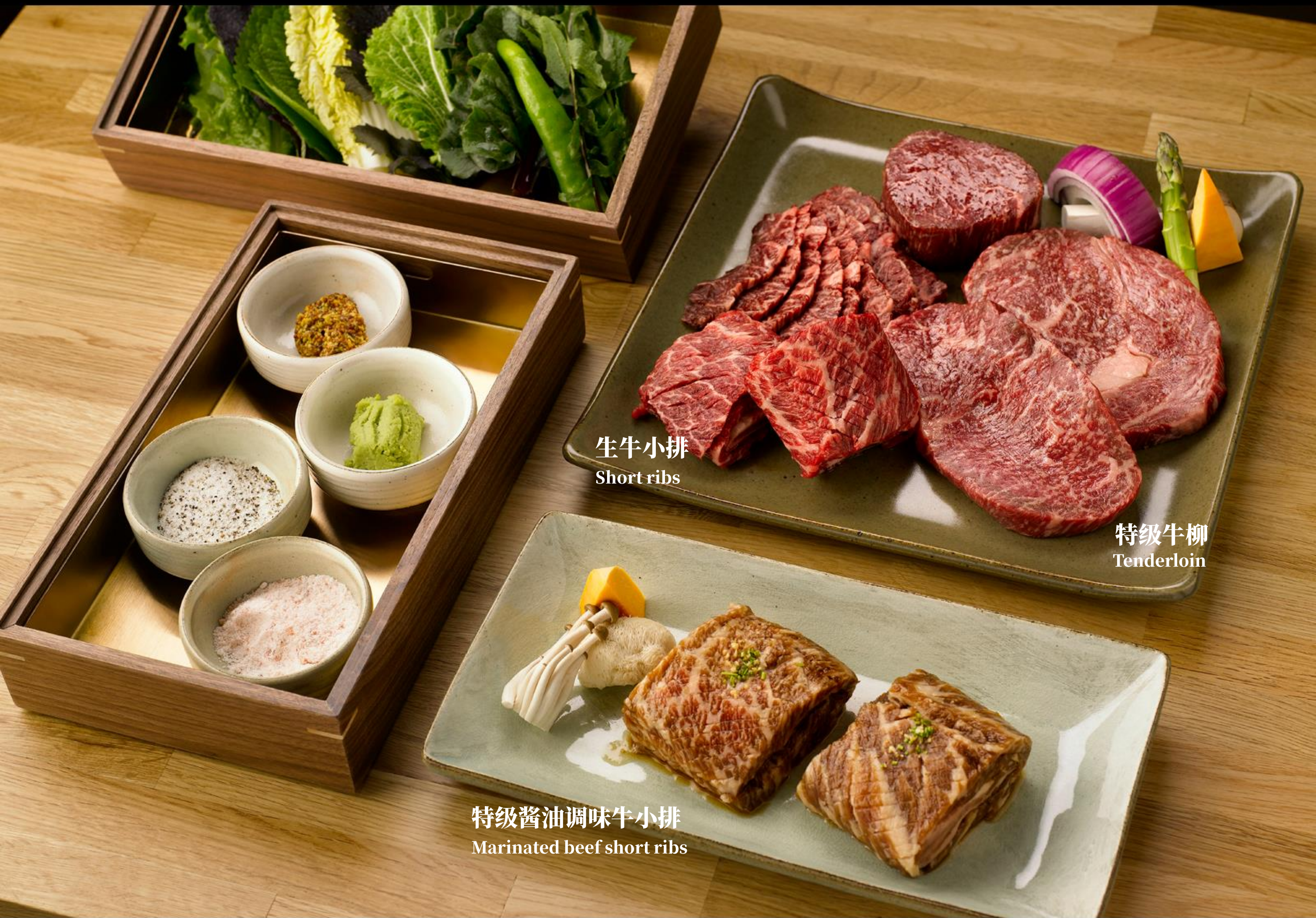
生牛小排 Short ribs