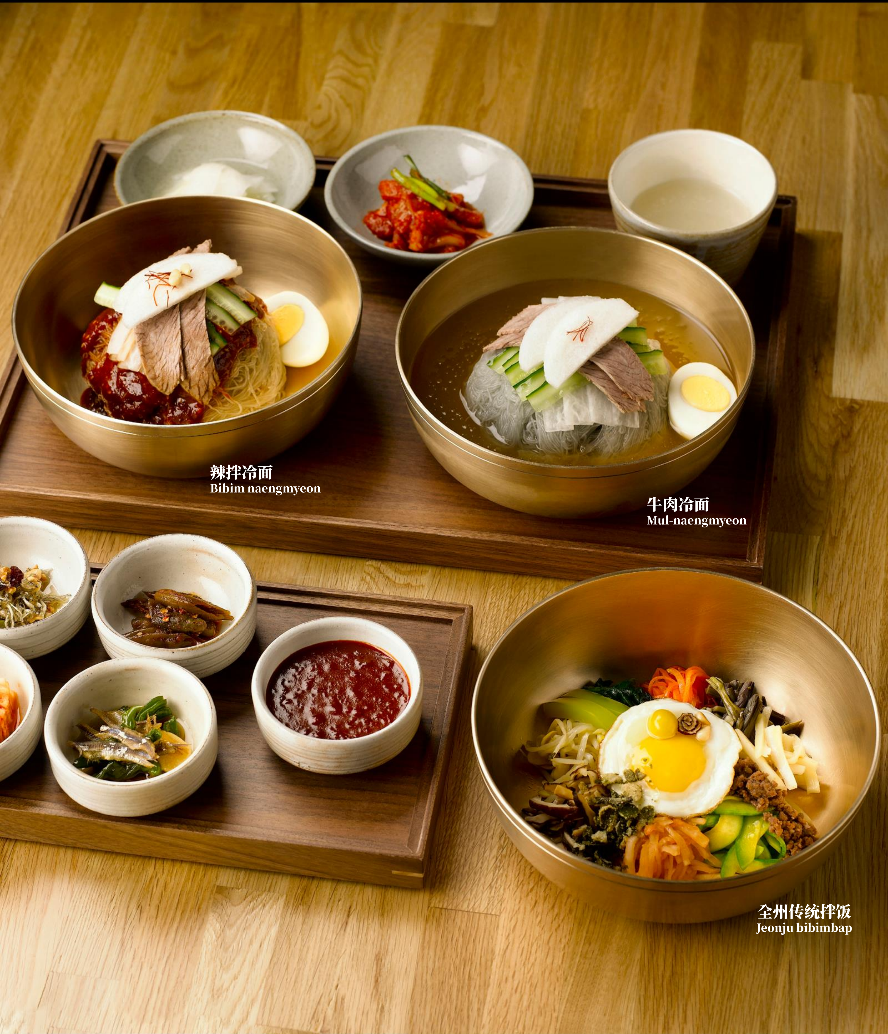
辣拌冷面 Bibim naengmyeon