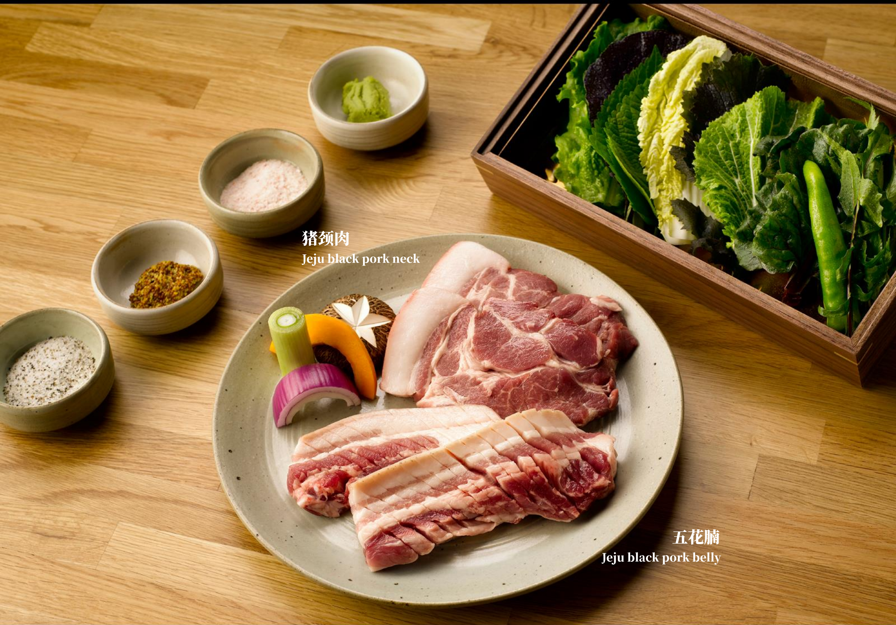
猪颈肉 Jeju black pork neck